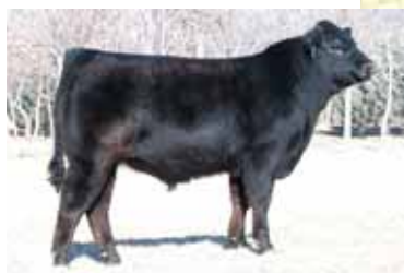
Wulf's Shop Talk