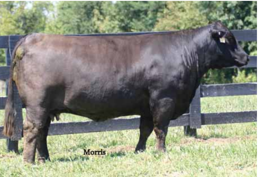
G A R Predestined