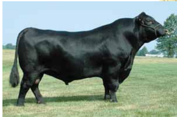
G A R Predestined