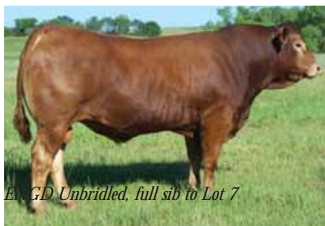
ENGD Unbridled, full sib to Lot 7

"18P" has been the leading fullblood donor at Englewood Farms for the last few years. She has earned her title as one of the very best fullbloods to ever step foot on the Kentucky soil at Englewood Farms. Bred in the Lenape herd in Pennsylvania, this granddaughter of Orion is from a daughter of MH Whipstich that goes back to a daughter of TEXS Ranger Ted back to the TEXS Star Luv cow family. This donor cow has proven her worth at Englewood in production over the last few years. Highlighted in this sale will be her 5 daughters. Her biggest accomplishment to date is raising her son ENGD Unbridled. He is a homozygous polled fullblood son of ENGD Polled Liberty 283R that is now owned in partnership with our friends at Wulf & Sons Limousin, Morris, MN. He posts a .81 for REA epd, scanned a 15.9 for REA and 2.86 for IMF. He is one of the finest homozygous polled fullblood sires in our breed at present. "18P" has earned her rights as a big time homozygous polled fullblood donor. If you love a brood cow with a lot of rib shape, volume and body then here she is. She is massive in any way that you look at her, sound in her structure and very appealing in her profile.