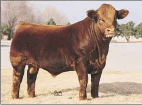
EXLR Dakota 353G