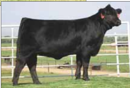
MAGS Shamble, dam of Lot 56.