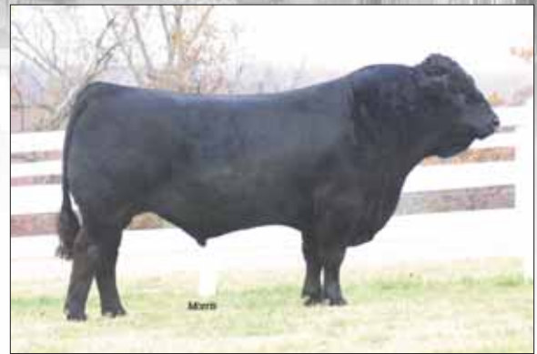
BOHI Top Dollar 7144T, sire of Lots 58 - 61 embryos.