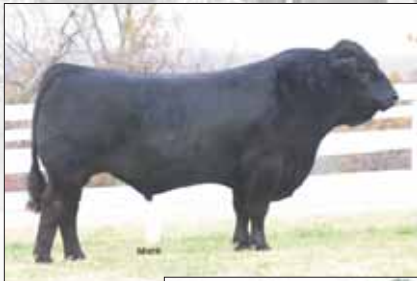
BOHI Top Dollar 7144T, sire of Lot 55.