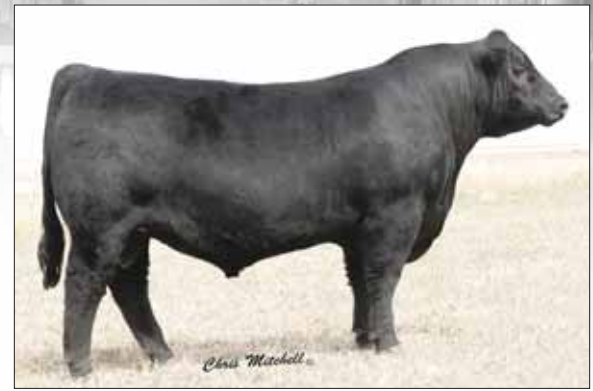
Connealy Confidence 0100, sire to Lot 5.

CED 10 CW - BW -3.5 REA - WW 45 YG - YW 91 MARB - MA 35 $MTI 0 CEM 4 SC - ST - DOC -