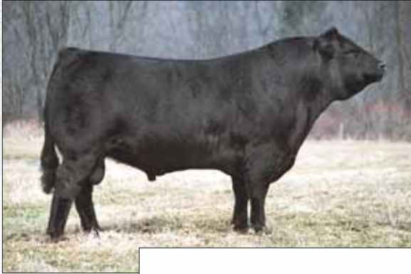
EXLR Excellante 251L