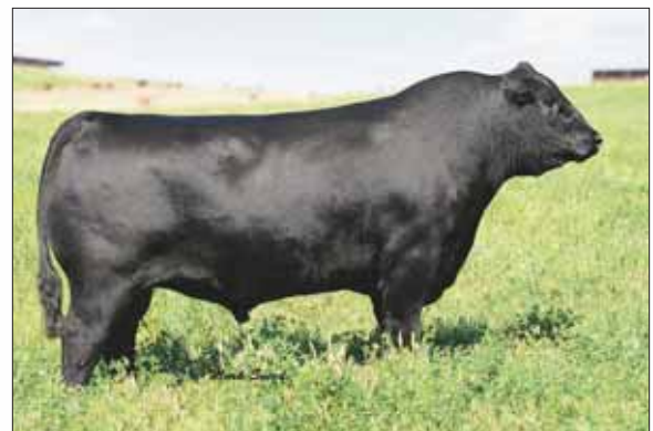
Connealy Consensus 7229, sire of Lot 63 embryos.