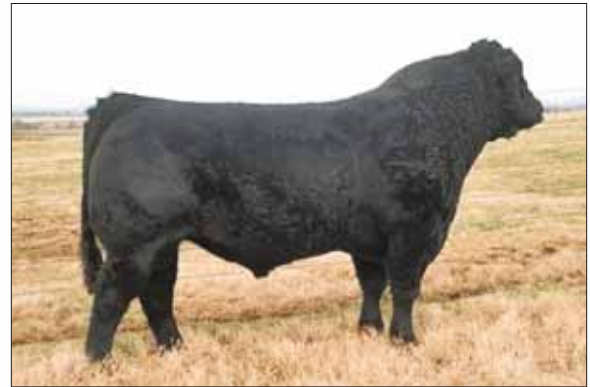
GPFF Blaque Rulon, sire of Lot 62 embryos.