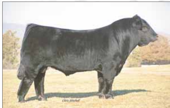
DVFC Cookie Monster 108H