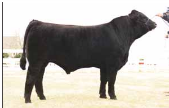
Wulf's Count Down 9251C