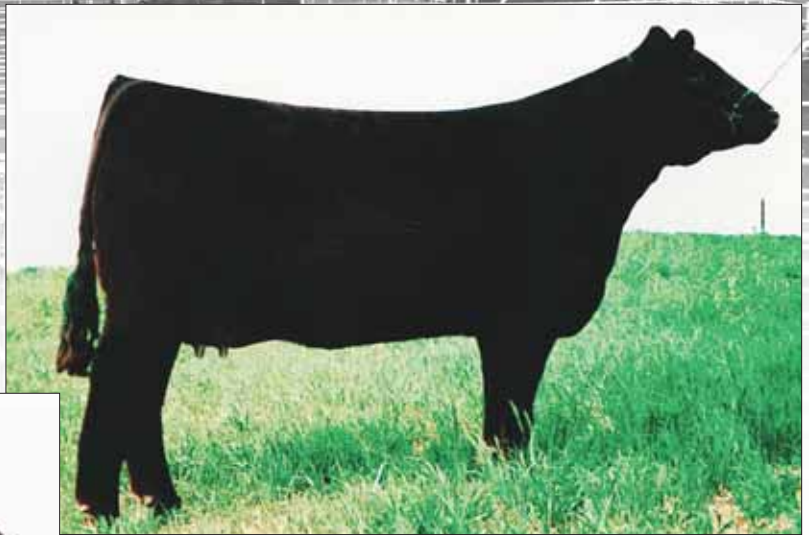
SLVL Angel Cookie