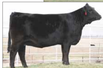
MAGS Rags to Riches, dam of Lot 54 embryos.