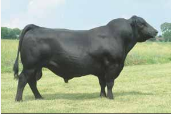
B/R New Day 454, sire of Lot 18.