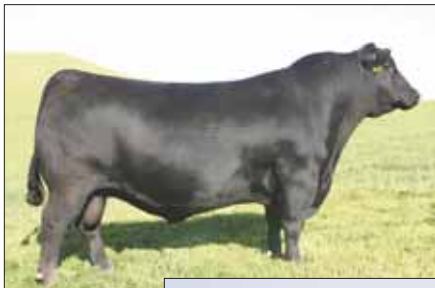
S A V Pioneer 7301, sire of Lot 56 embryos.