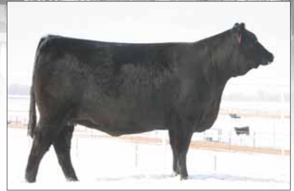
MAGS Sinister, dam of Lot 52 and 53 embryos.

All embryos and semen WILL NOT be at DVFC. It is all stored at Grassroots Genetics.