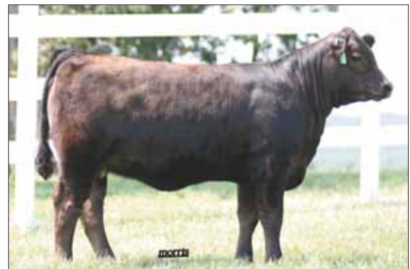
PBRS U Wish 819U, dam of Lot 63 embryos.