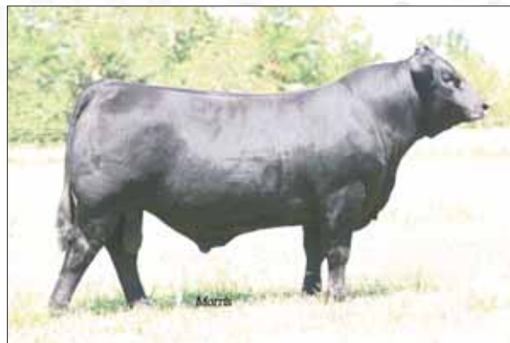
EBFL Ypsilanti 420Y, service sire to Lots 32- 34.

CED 6 CW 60 BW 4.2 REA 0.01 WW 76 YG 0.55 YW 133 MARB 0.40 MA 30 $MTI 63 CEM 7 SC 0.6 ST - DOC 12