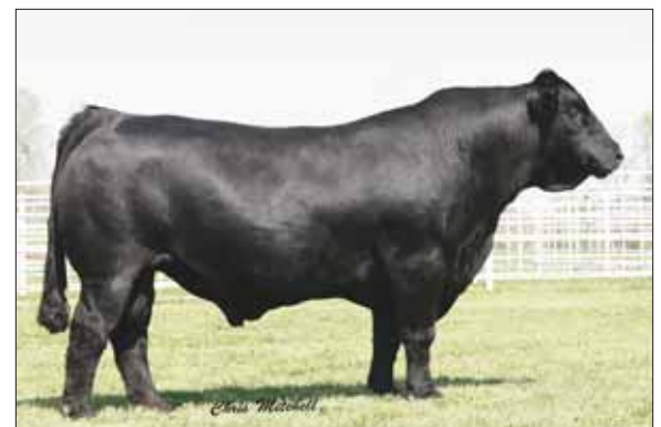
DVFC Blaue Cookie 101R