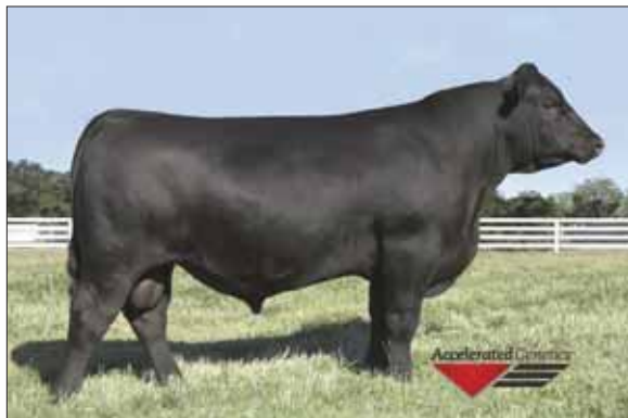
VAR Discovery, service sire to Lot 31.