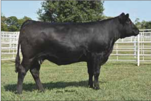
LOT 19 - DVFC Nina 146Y