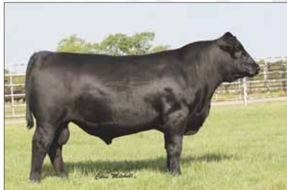
Deer Valley All In, service sire to Lot 17.