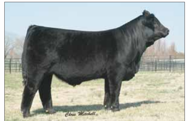
MNWS Frontier 507R