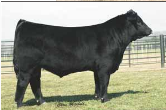
DVFC Sitting Bull