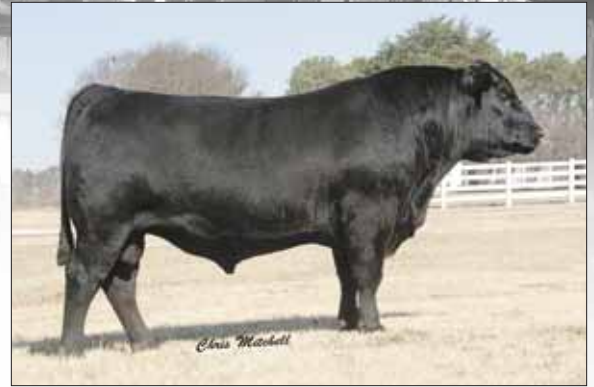
DR J Analyst M250, sire to Lot 68 embryos.