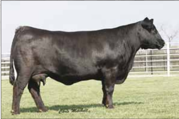
DVFC Nina 145N, dam of Lots 18 - 20.