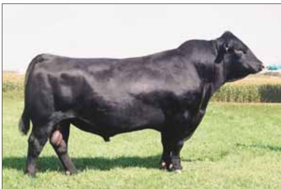
Connealy Impression, sire to Lot 65 embryos.