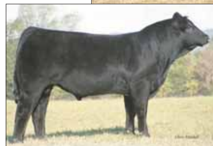
DVFC Arrowhead 1004J