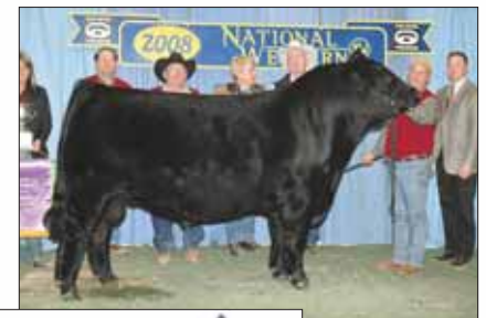
DHVO Deuce 132R, sire of Lot 54 embryos.