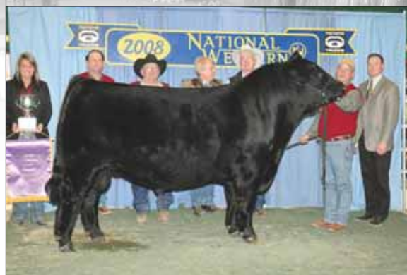
DHVO Deuce 132R, sire of Lot 3B & 3C.