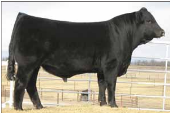
AUTO Dollar General 122R, sire of Lot 57.