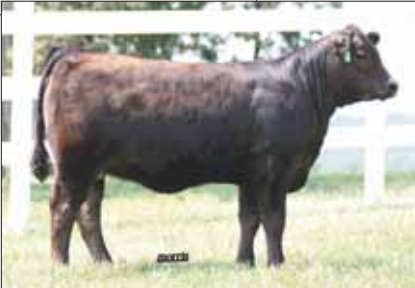
PBRS U Wish 819U, dam of Lot 64.