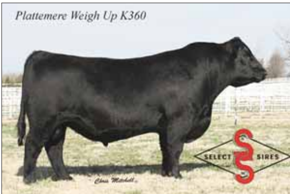
Plattermere Weigh Up K360

One of the most successful and prominent cow families to ever exist in the entire Limousin business is that of EAFM Cookie. She herself was a national champion and along with SLVL Angel Cookie 140D. The Cookie family and the rich heritage behind them is some of the most prolific and prominent that we have to date in the purebred segment of the Limousin business. DVFC Angel 302X is a 50% Lim-Flex daughter of N Bar Emulation EXT. She is a black and polled female that is certain to make you pay attention on sale day. She has earned a 0.2 for birth, 25 for milk and .22 for marbling. Her bull calf will sell split off on sale day. He is a 25% Lim-Flex double polled, double black son of Plattermere Weigh Up K360, a proven and progressive son of AITZ Upward 307R back to a daughter of GAR Retail Product. He offers a -1.1 for birth, 58 for weaning weight, 117 for yearling weight, 33 for milk and .30 for marbling.