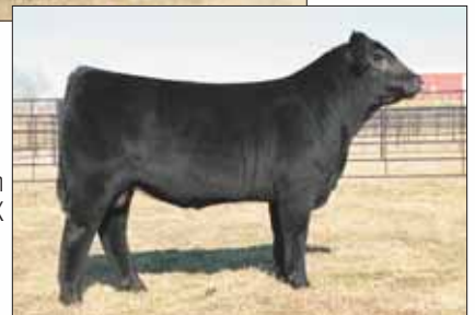
DVFC Warden 233K