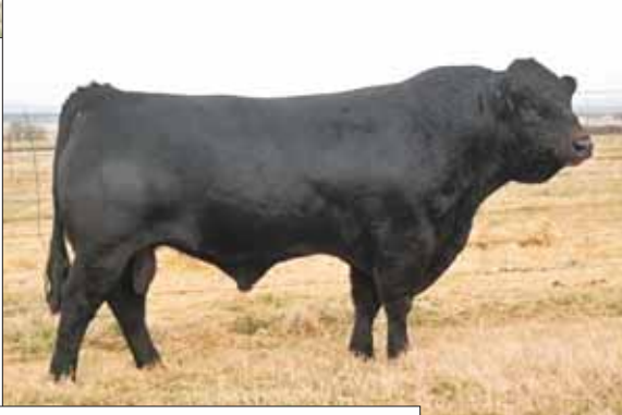
JCL Lodestar 24L