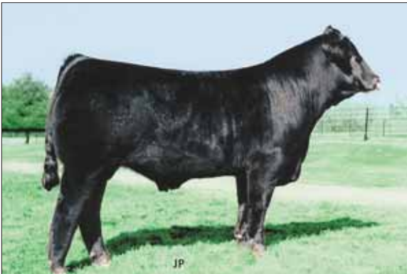
DVFC Genuine 334L