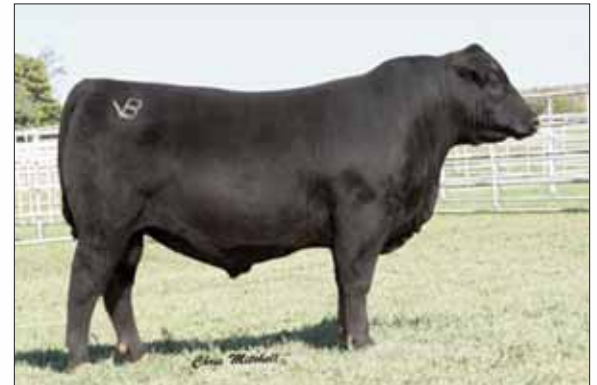
JMB Traction 292, service sire of Lots 11 and 12.

DVFC Spicy 802Z could easily be one of the top lots in the big time dispersal sale. She is a 40.5% Lim-Flex daughter of the elite Angus sire AAR Ten X 7008 SA, the big time son of MYTTY In Focus that just happens to be one of the hottest Angus bulls right now. She is from the top donor EXLR Sugar Spice 090U, the proven daughter of CLLL New Direction 394P.