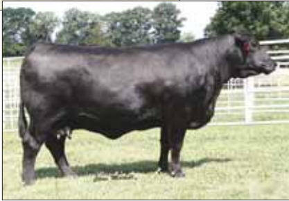
PBRS Up Up and Away 899U, dam of Lot 55.