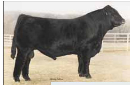
AUTO Black Dakota 129J