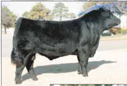
EXLR Total Dominance 8008, sire of Lot 64.