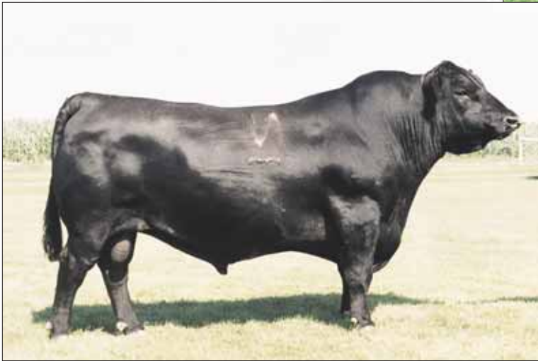
N Bar Emulation EXT, sire to Lot 4.