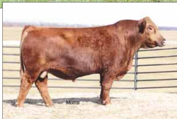
MAGS Choctaw, service sire to Lot 35.