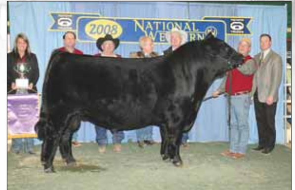
DHVO Deuce 132R