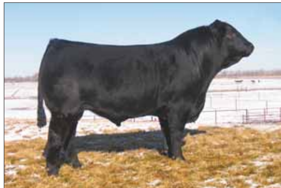
Wulfs Nobel Prize 3861N