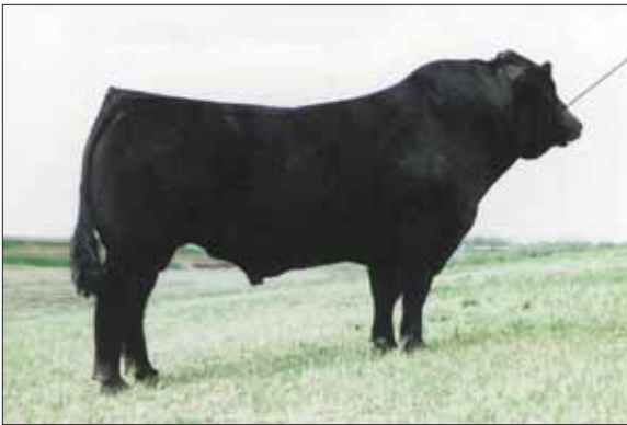
Wulfs Quarterback 4222B