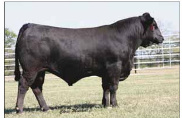
DVFC Blue Chip, sire of Lot 53.