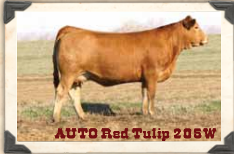
AUTO Red Tulip 205W