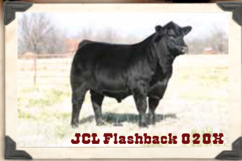
JCL Flashback 020X