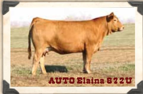
AUTO Elaina 672U