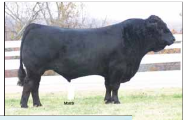
BOHI Top Dollar 7144T, sire of Lot 12 & 13 embryos.