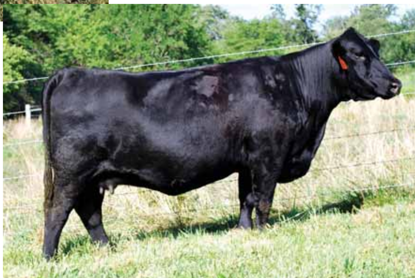
MAGS Speedy Gonzales 9436S, full sib to Lot 28.