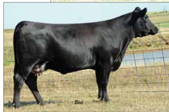
CALO 317U, dam of Lot 12 & 13 embryos.