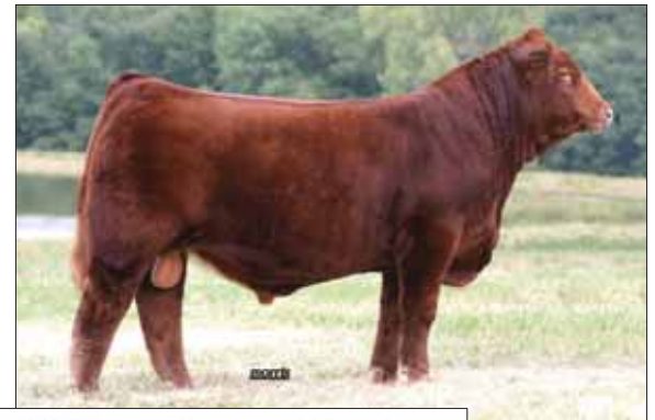
MAGS WL Usual Suspect 538U, sire of Lot 18 embryos.

MAGS SASQUATCH EXLR NEW GENERATION 071M MAGSWL USUAL SUSPECT 538U MAGS FRUITFUL 487M MAGS PHANTOMS PRIZE GPF BLAQUE RULON ALCM KOOL TUNES BADLANDS CUT ABOVE 012 LEACHMAN END CUT 1383G STAR G LILLY P415 BADLANDS CEDAR 624 BJR TILLY 677-777 BJR RAMBLER 5162 BJR TILLY 2258-2101