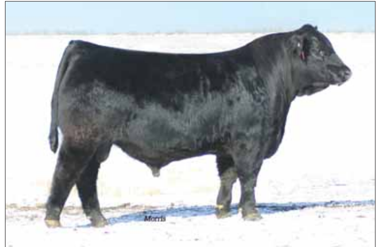
LVLS Yukon 798Y, sire of Lot 17 embryos.

MAGS UNHOOKS BASIN FRANCHISE P142 LVLS YUKON 798Y MAGS MARQUEE LVLS 798R BON VIEW NEW DESIGN 1407 BLACKCAP V935 DHVO TREY 133R GPF BLAQUE RULON MAGS XPRESS POSTAGE AMY JO DHAN 20L MAGS SILHOUETTE BR MIDLAND MAGS LADY ACE