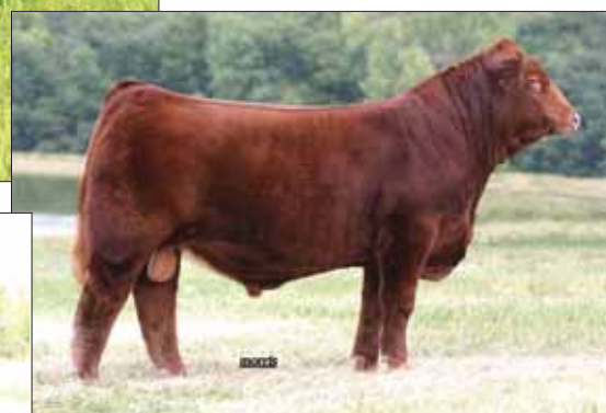
MAGS WL Usual Suspect 538U, sire of Lot 9.