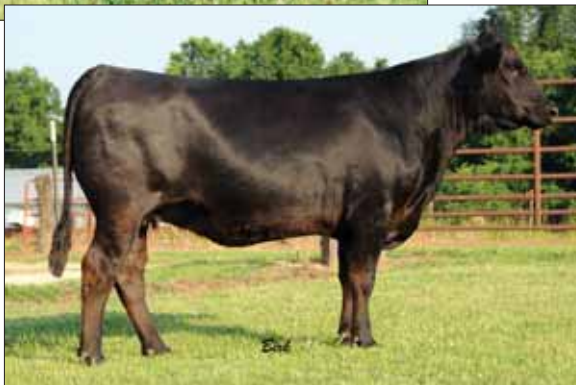
PBRS 187T, dam of Lot 16 embryos.