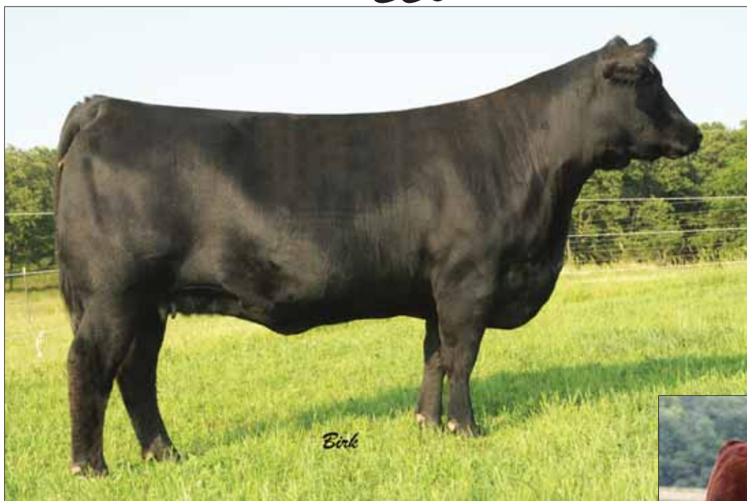
PBRS Up Town Girl; 48U, dam of Lot 8 embryos.