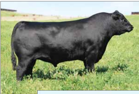
Connealy Consensus 7229, sire of Lot 16 embryos.