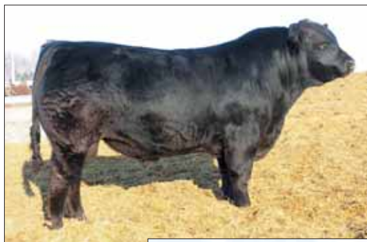
Wulf's Titus 2149T, sire of Lots 39 - 42.