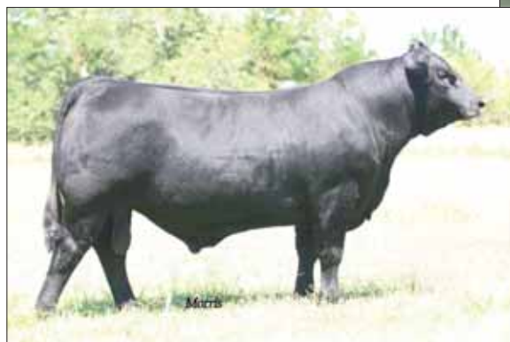
EBFL Ypsilanti 420Y, sire of Lot 8 embryos.