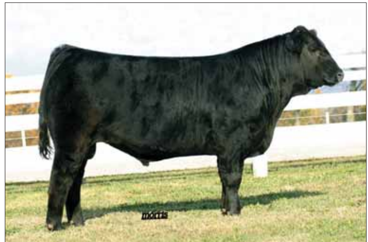
CALO Lone Wolf 1030T, sire to Lot 34 & 35.