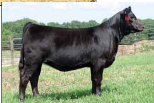
NHCA 316Y, a maternal sister to Lots 39 - 42 and top selling open heifer at $4,500 selling to Massey Limousin, London, KY