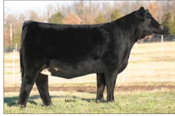
AUTO Pia 245X, dam of Lot 10 & 11 embryos.