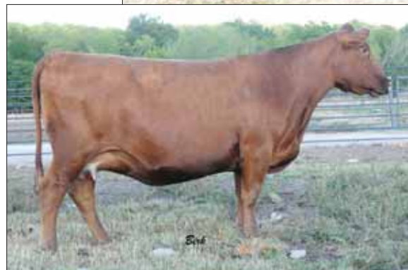
STAR G Lilly P415, dam of Lot 18 embryos.