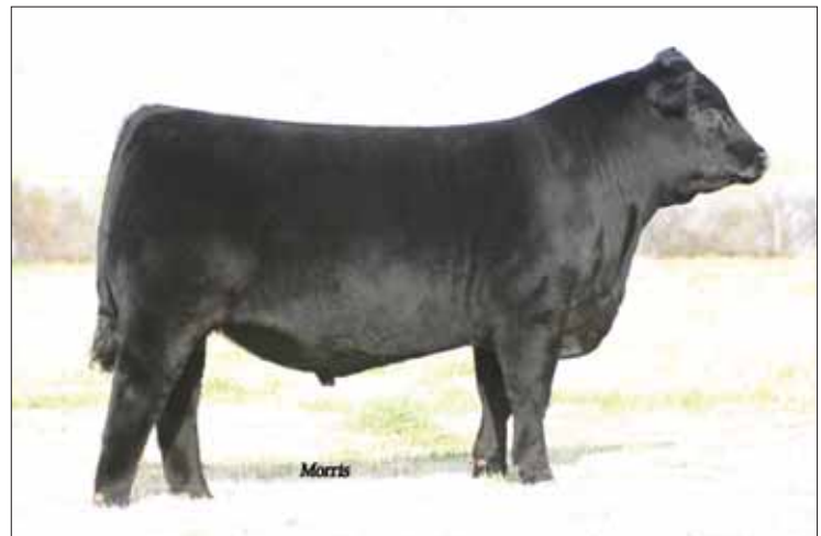
CALO Brickyard 902W, service sire to Lot 34 & 35.