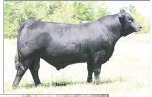
EBFL Ypsilanti 420Y, sire of Lot 10 & 11 embryos.