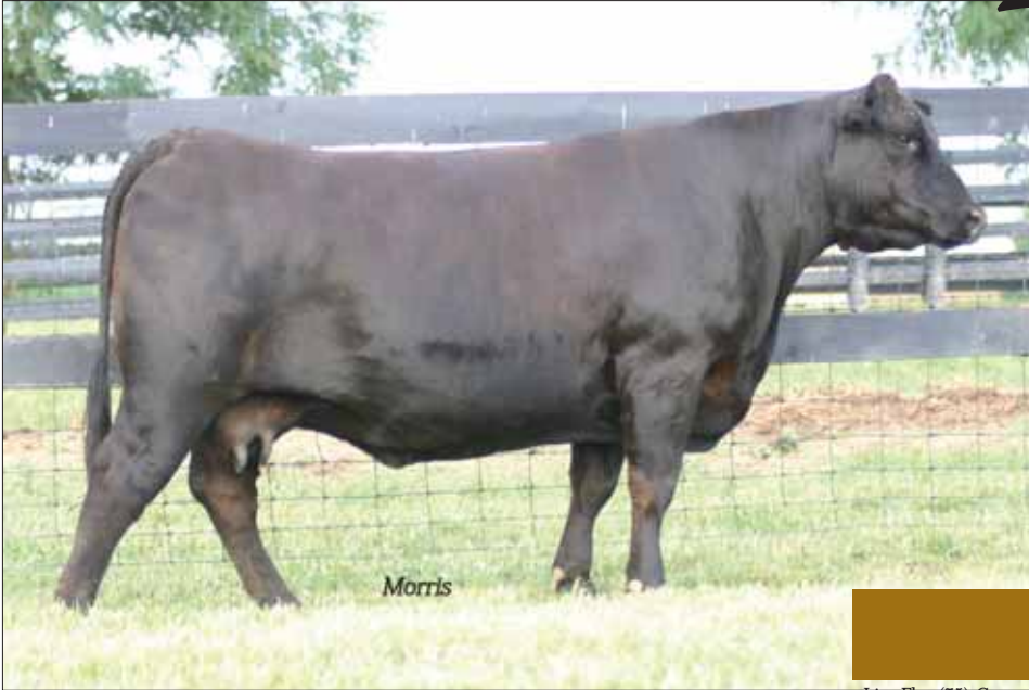
EXLR Luvly 222R, dam of Lot 19.