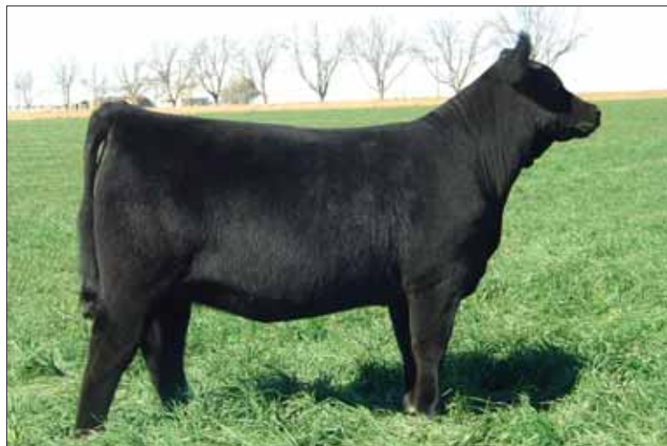
LFL Peaches, paternal sister to Lot 22