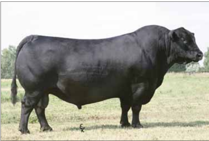
SAV Final Answer 0035, service sire to Lot 46.