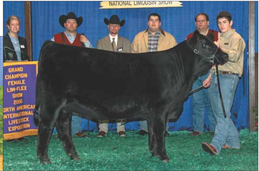
BOHI Red Robin, donor dam of Lot 9 Pick.