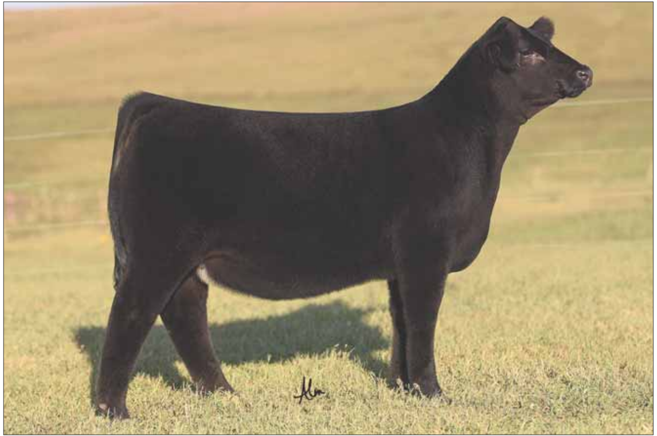
The $201,500 Ratliff Howaboutit 008H selling to Sara Sullivan of Dunlap, Iowa