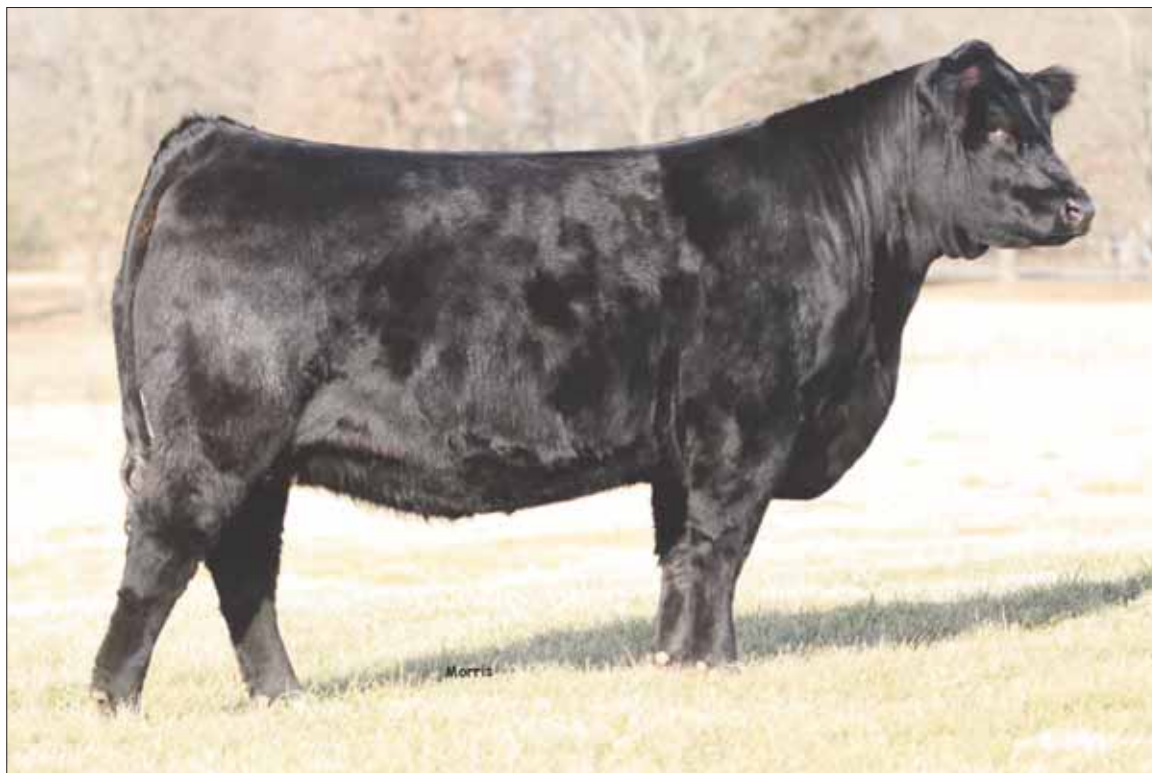
AUTO Solo 419E ET, Lot 37 dam.