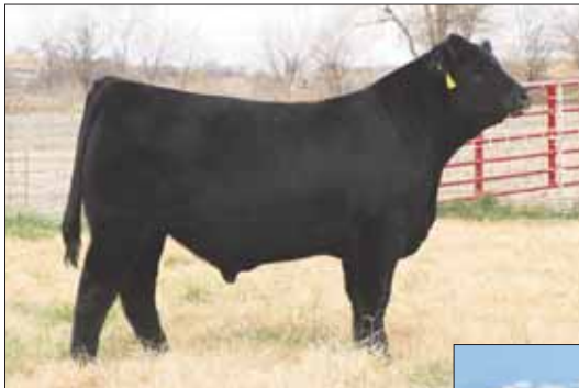
DEBV Gladiator 917G, Lot 42B sire.