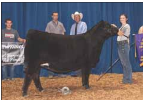
JSZC TSSC Larissa 49G, 2020 National Junior Show Grand Champion Lim-Flex Female

LOT 1A - Retaining the right to one flush at buyer's connivence and seller's expense.