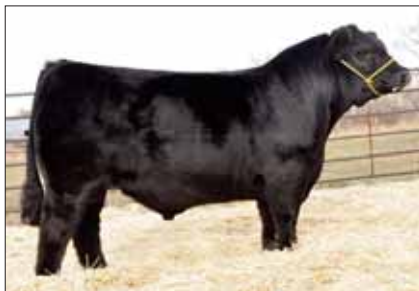
L7 Calvados, sire of Lot 9 Pick.