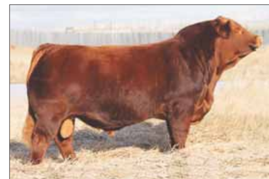
HUNT Credentials 37C ET, Lot 40 sire.

These embryos will have a program on the fast track to a record of success! BCV Farms have consigned three conventional embryos out of the HUNT Credentials x COLE Miss X-Rated 354A mating. HUNT Credentials is the red purebred, homozygous polled son of HUNT Testament 40T. He is a chart-topper for marbling and ranks in the top three percent of the breed for his milk figure. COLE Miss X-Rated 354A is one of the greatest females in the business today. Three of her bull calves have averaged an impressive $23,666 at public auction. Her son, COLE Genesis 86G is Coleman Limousin Ranch's top-selling bull that Tubmill Creek Farms of New Florence, PA purchased for a staggering valuation of $80,000. This female's marbling figure of 0.49 ranks in the elite three percent of the entire breed and her milk figure of 30 ranks in the top four percent. Offspring from these elite individuals will demand the attention of cattlemen nationwide- so buy into the tremendous potential these embryos have! These three conventional embryos will be 87.5% Limousin and homozygous polled.