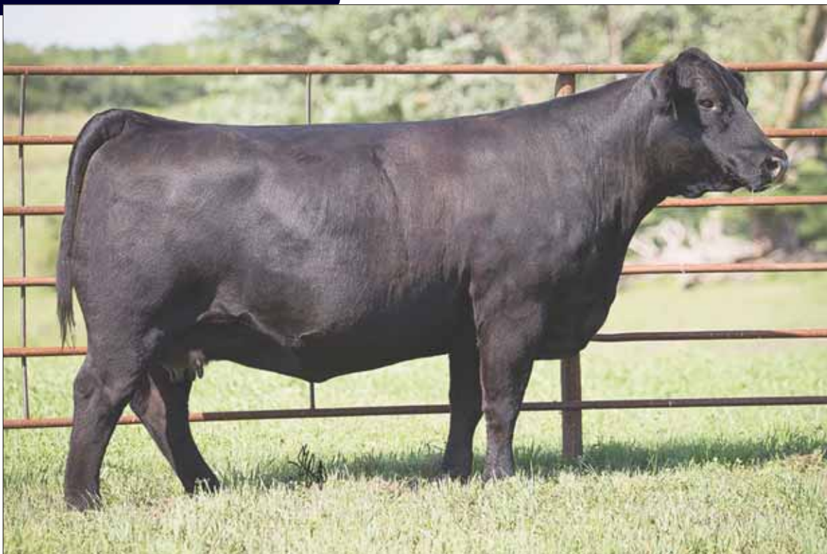
MAGS With Class, Lot 30A & 30B dam.