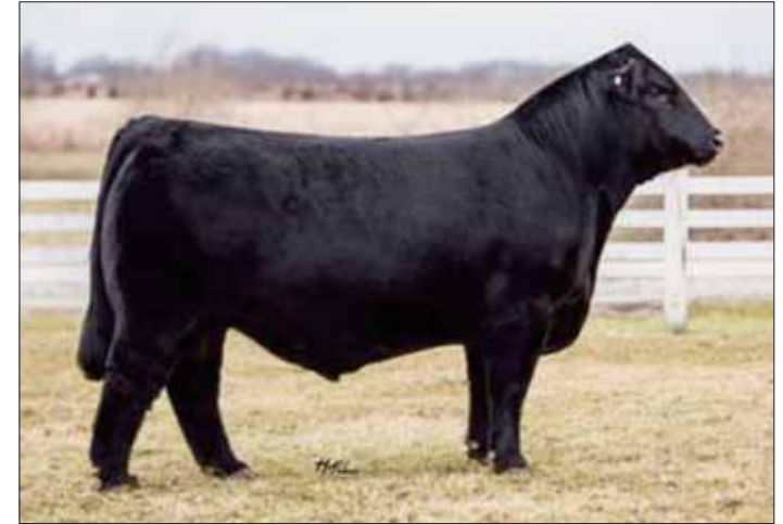
FWLY Can Do, Lot 29A & 29B sire.