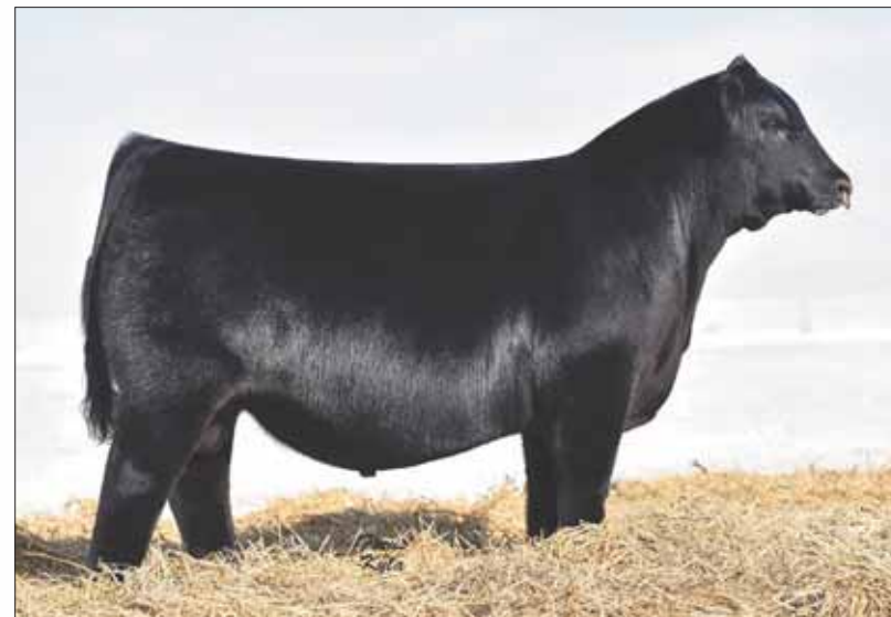
Schilling's R&L Confidential, sire of Lot 20.

The captivating quality is present in this heifer pregnancy consigned by Red Rock Limousin and we are confident you'll have this lot at the top of your list on sale day! This heifer pregnancy is due April 10th, 2021 out of Schilling's R&L Confidential and CELL 5065C ET. Schilling's R&L Confidential is the Angus sire out of the EXAR Classen son, Schilling's R&L Classified. He is out of an impressive BC Lookout female. CELL 5065C ET is the flawless purebred daughter of DHVO Deuce and MAGS Wrigley. She is a donor for the White Valley Ranch breeding program that is the blend of winning genetics on both sides of her pedigree. An opportunity to purchase a heifer pregnancy out of these two individuals is rare- so bid with major confidence and bid often! This heifer pregnancy will be 50% Lim-Flex.