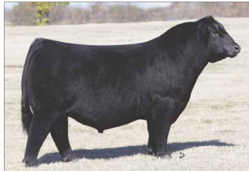
Conley Express 7211, Lot 37 sire.

Now these will be embryos that you won't soon forget! Cross Creek Farm, Circle R Ranch and Win Vue Enterprises have consigned three conventional embryos to the mating of Conley Express 7211 and AUTO Solo 419E. Conley Express 7211 is a son of Sma Watchout 482, a son of Silveiras Watchout 0514. His dam is DPL Sandy 3040, a Silveiras Style 9303 female. Conley Express' first fourteen offspring to sell averaged $29,500 at Express Ranches Big Event Sale. He was a true crowd favorite at the 2018 National Western Stock Show. AUTO Solo is a daughter of the great Riverstone Crown Royal bull and out of AUTO April 202A, the MAGS Manuela daughter out of SAV Brave 8320. We are excited to see what these three conventional embryos can do in your program and beyond! They will be 37.5% Lim-Flex and double homozygous.