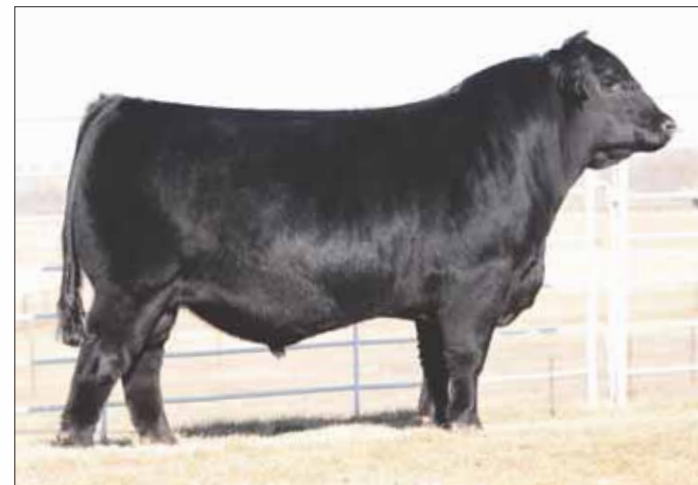
MAGS Firestone 218F, Lot 30A & 30B sire.