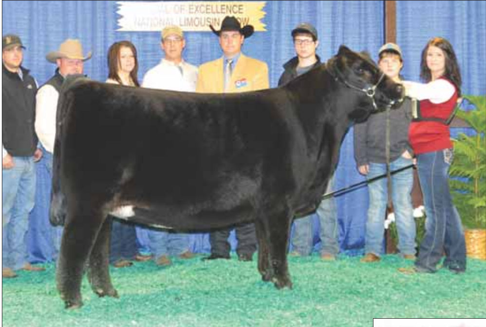
LLJB Absolute Style, donor dam of Lot 9 Pick.