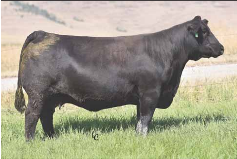
COLE Beauty 276Z, Lot 42A & 43B maternal grandam.