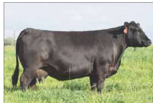
COLE Miss X-rated 354A, Lot 40 dam.