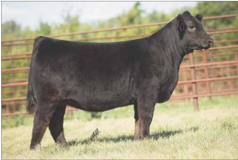
CELL Glamour Girl 9226G, Lot 38A, 38B, 38C dam.

This is such a unique genetic opportunity that will catapult any operation into the future of the CELL Glamour Girl 9226G progeny storybook. She is sired by the ever-popular show heifer maker, Colburn Primo 5153 and out of the national champion female, MAGS Wassail. Primo is the Dameron First Class x Silveiras Saras Dream son that continues to dominate show rings nationwide. MAGS Wassail is the DHVO Deuce daughter that is continuing to influence top individuals lineage today. CELL Glamour Girl 9226G was the high-selling female in the 2019 Linhart Limousin Fall Harvest Production Sale and for great reason.