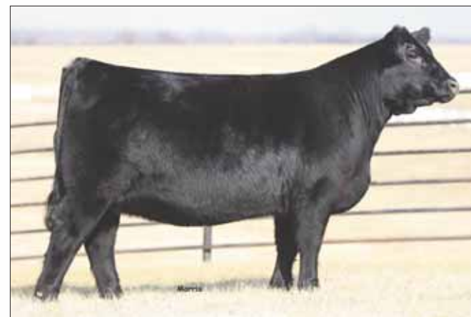
AUTO Chaperall 406C ET, dam of Lot 12.