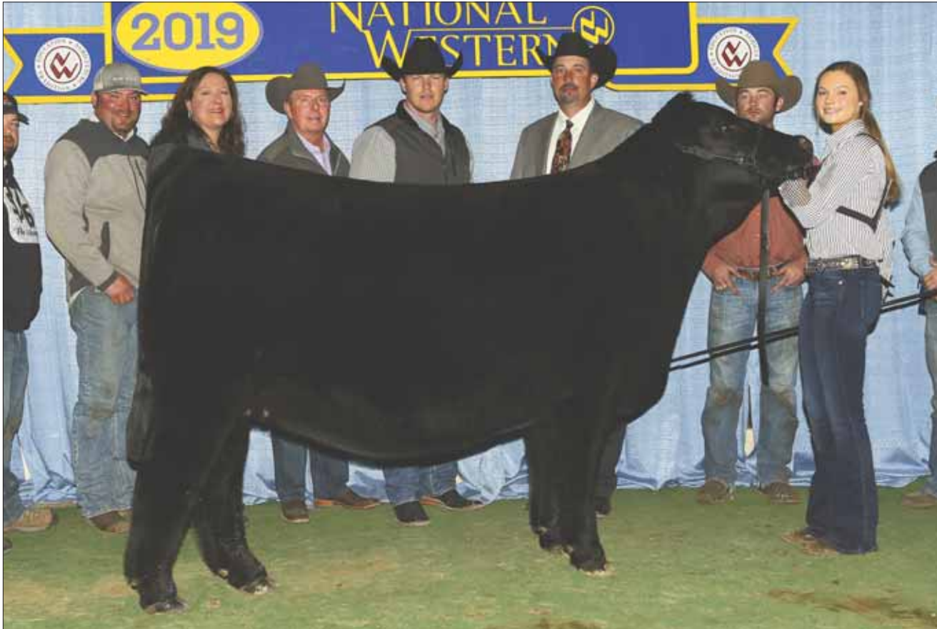
WLR Eden, dam of Lot 8A, 8B and 8C.