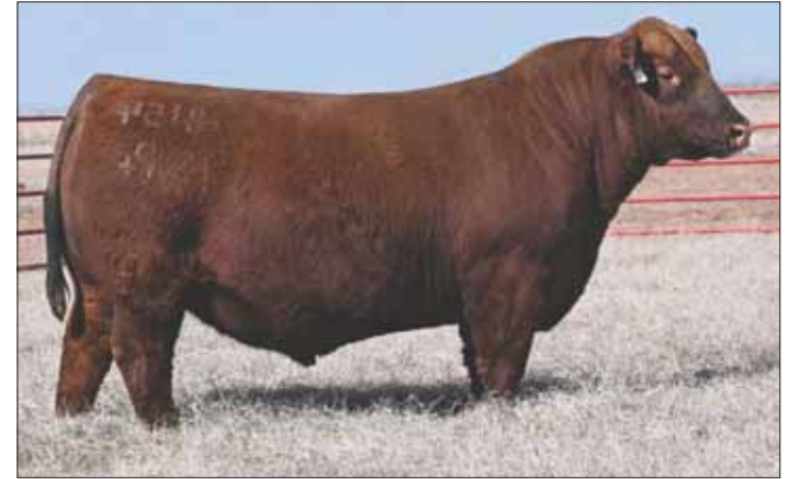
DUFF Red Bear 18154, Lot 31 sire.