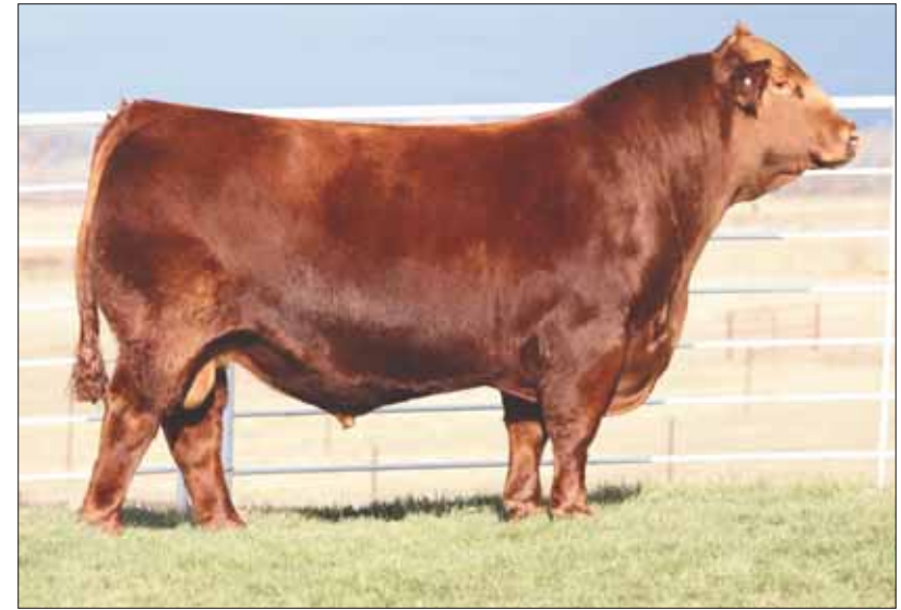
WULFS Emprize 2424E, Lot 34 sire.

You absolutely cannot go wrong with proven, predictable genetics like these. Wulfs Emprize 2424E is the Bieber Deep End B597 son out of the great Wulfs Zuni 2424Z female. Emprize is the 50% Lim-Flex bull that was a major crowd favorite at the A Night On The Town Sale II in 2019 as Lot 1. He is a homozygous polled, red powerhouse of a bull. J6 Tempest B300 is a daughter of WEBR Card Shark 1015 that is known for her prolific pedigree and elite donor look. Her dam is the great SLGN Stony's Tempest 778T Red Angus donor female that is one of J6 Farm's finest donors in their prestigious Red Angus line up. P Bar S Ranch of Sand Springs, OK is offering five embryos that will be 25% Lim-Flex, double polled and red. The value of these future calves will only increase with dramatic momentum.