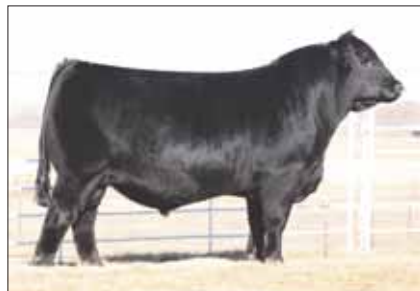
MAGS Firestone, sire of Lot 9 Pick.