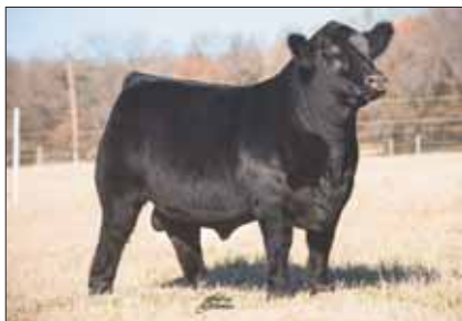
SSTO Best Bet, sire of Lot 9 Pick.