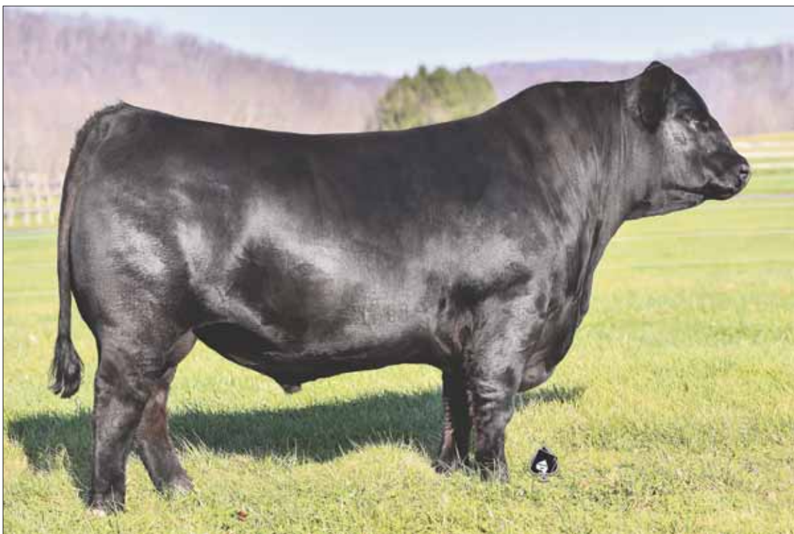
COLE Genesis, full sib to Lot 40.