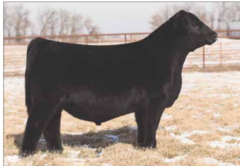
PVF Blacklist 7077, Lot 35 sire.

A combination of one of the hottest Angus sires on the market today, PVF Blacklist and the influence of CFLX Robinette 070E makes this genetic offering a no-brainer to have at the very top of your shortlist on sale day. KLS Farms of Chatham, LA is offering four conventional heifer embryos from this mating that will be 37.5% and double homozygous. PVF Blacklist has always been a crowd favorite since his debut in Denver and he is rapidly making his way to the top of numerous breeds in the industry today. PVF Blacklist is a son of the one and only SAV Brilliance 8077 and is out of one of Prairie View Farms' top Dameron First Class donor females, PVF Blackbird 3070. His grand-dam, ALL PVF Blackbird 645 produced the 2017 National Junior Angus Show Grand Champion Female. CFLX Robinette 070E is a daughter of GPFF Blaque Rulon and out of a breed matriarch, BOHI Red Robin 282R. Her storied pedigree is impacting breeding programs throughout the industry today and will continue to do so for years to come. These genetics speak volumes of the potential that comes from blending two phenomenal individuals and creating future heifer calves that will soon be taking the world by storm.