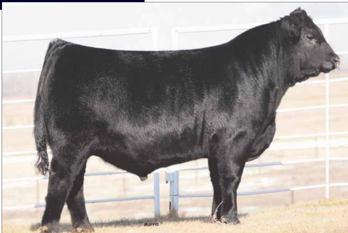
MAGS Federal Reserve, son of Lot 14.