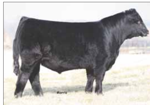
AUTO Lucky Strike 118B, Lot 22 sire.