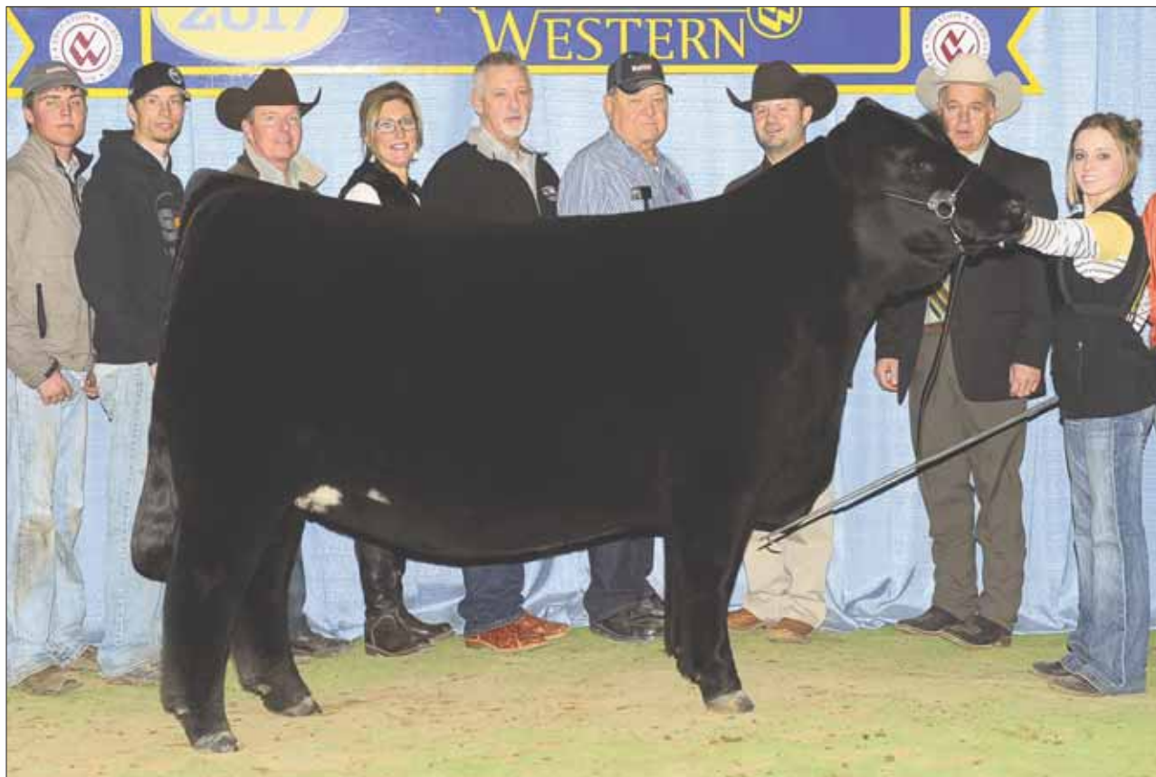
Riverstone Charmed 50C, a full sib to Lot 2 heifer pregnancy

Selling full possession and 50% embryo interest; 50% purchase price due at sale time and 50% due once the pregnancy is confirmed bred 60 days.