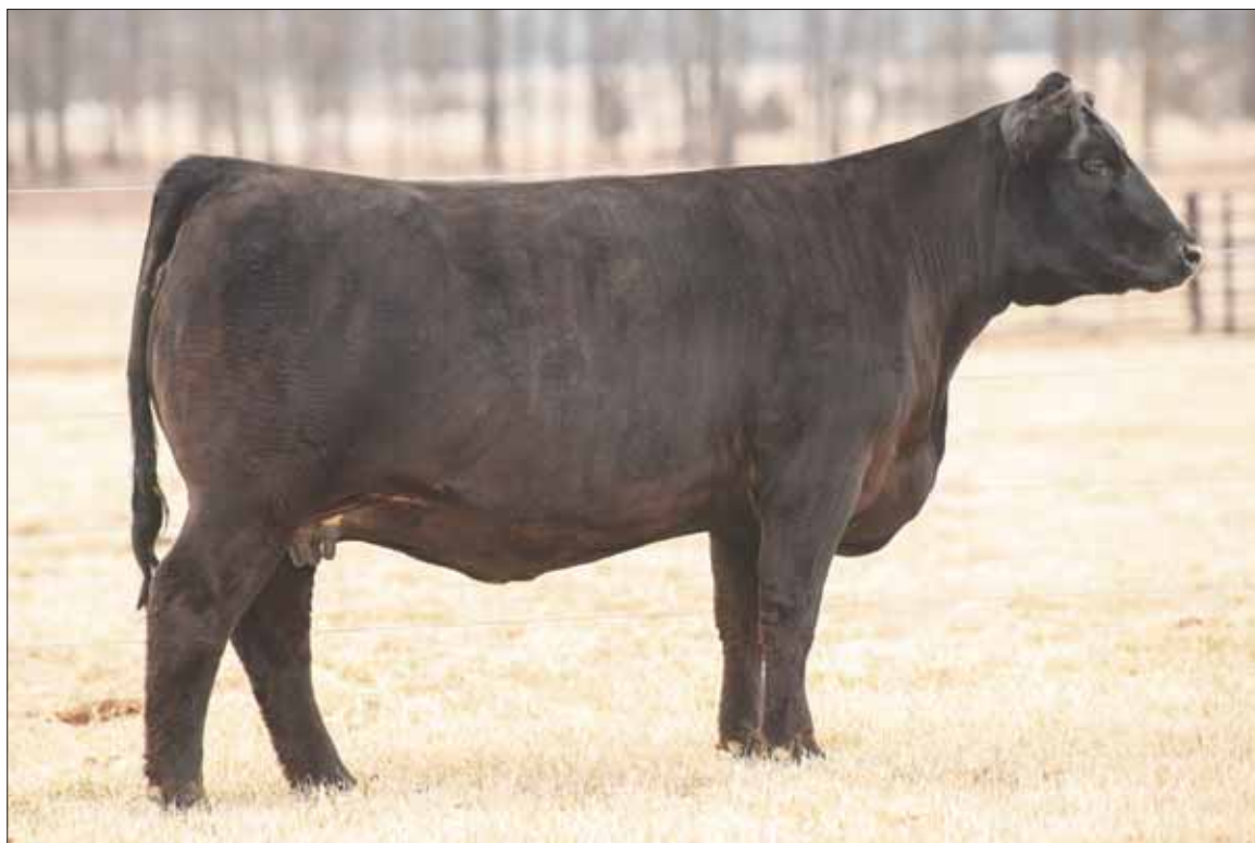
AUTO Ebony 202E, Lot 41B sire.