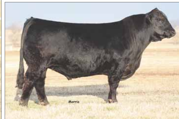
MAGS Zodiac, Lot 15 sire.

A.I. 04.10.2020 to MAGS Federal Reserve; P.E. 4.22-7.27.20 to AHCC Digging Deep 903D. Safe. Due Approximately 2.11.2021.