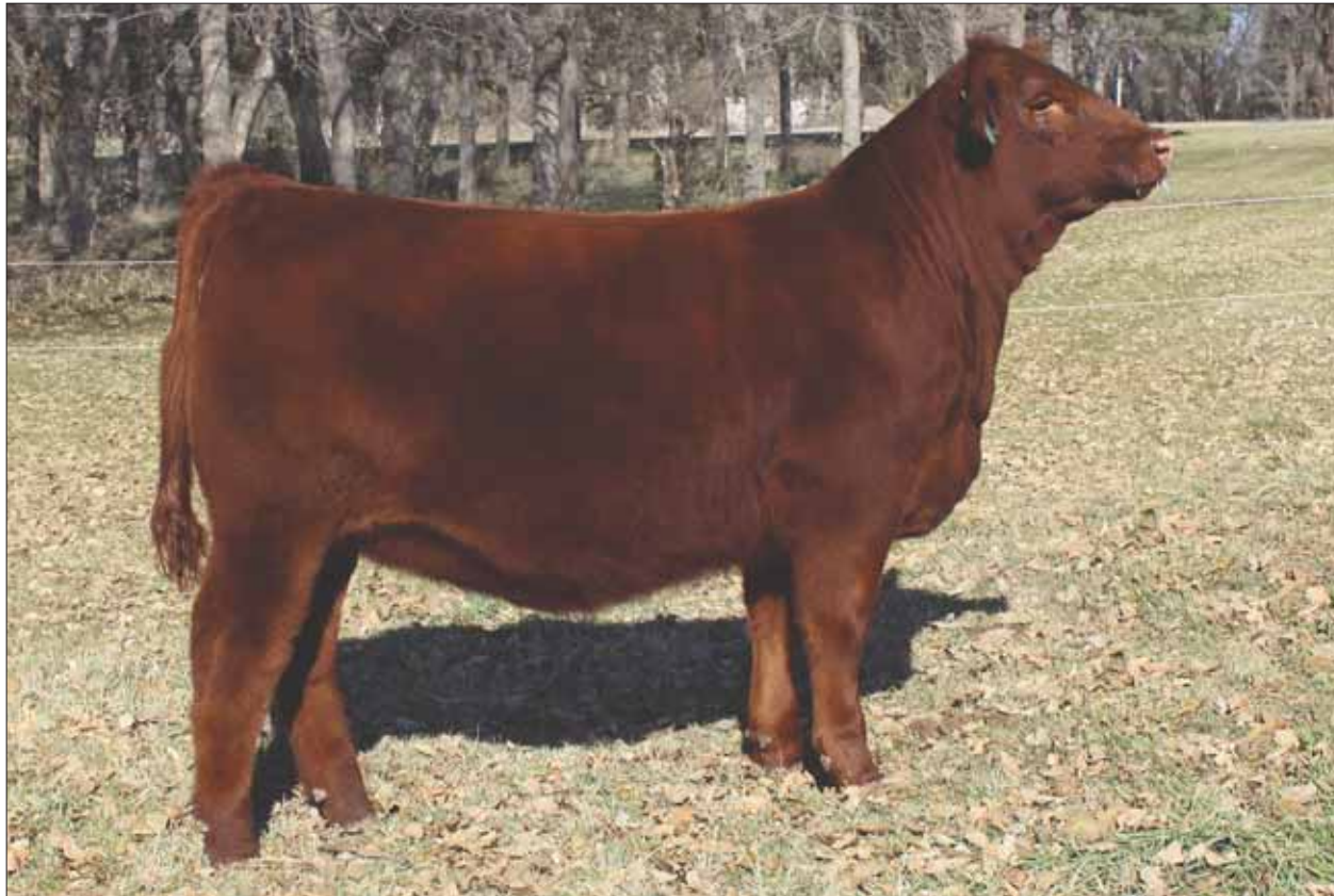
Lot 13 ~ WULFS Hard Cider 0028H