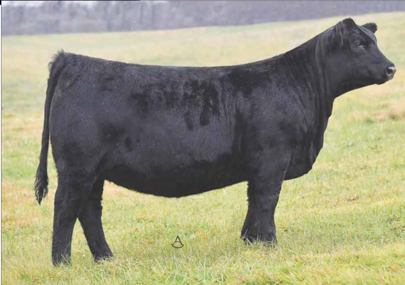
TMCK Foxtrot 569F ET, Lot 32A, 32B, 32C & 32D dam.