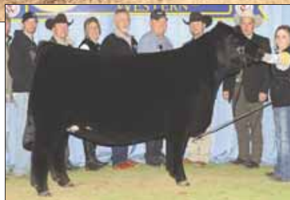
Rivestone Charmed, maternal granddam to Lot 7.