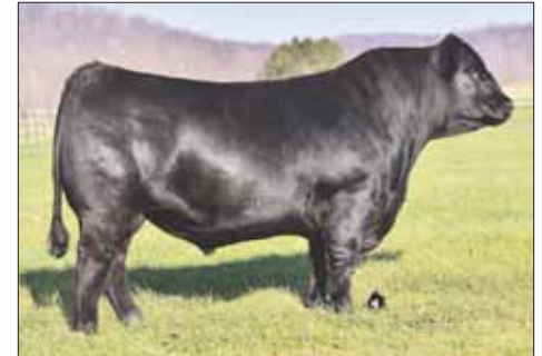
COLE Genesis 86G, Lot 32B sire.