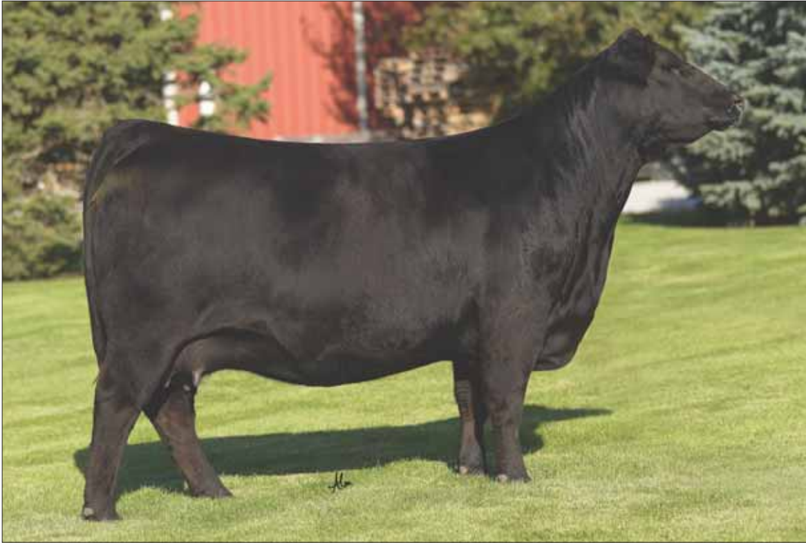
AUTO Dana 265D, dam of Lot 19.