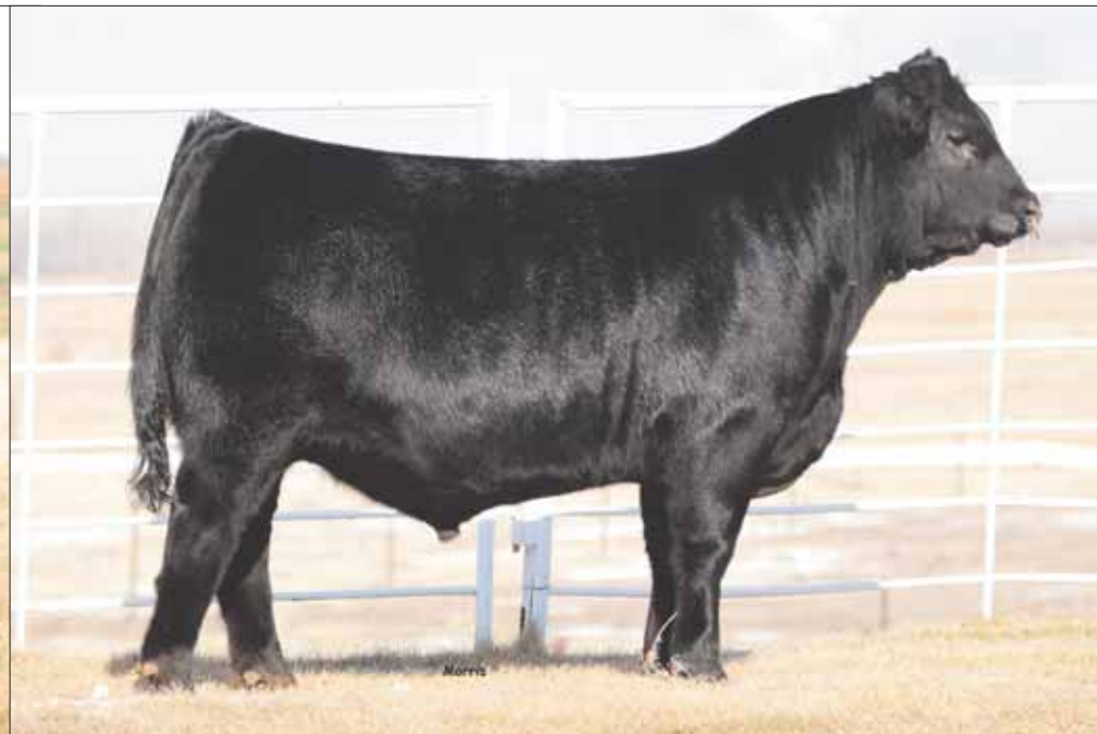
MAGS Federal Reserve, Lot 7 sire.