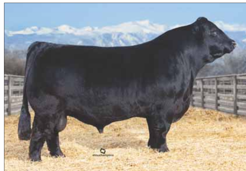
ELCX Kings Landing 599D, Lot 41A sire.

This is another exciting mating to the great ELCX Kings Landing 599D ET and AUTO Ebony 202E ET. Kings Landing is the double homozygous bull that won the 2018 North American International Livestock Exposition. He is sired by MAGS Xyloid, the ever-powerful DHVO Deuce 132R son. Kings Landing is out of the infamous WLR Prada female. She is a daughter of MAGSWL Usual Suspect 538U and AUTO Rebeca 292S. AUTO Ebony 202E ET is a daughter of MAGS Ali and out of the breed matriarch, MAGS Manuela. She topped the 2019 Great American Pie Sale. Now you have the exciting opportunity to purchase three conventional embryos out of these prolific individuals. These three conventional embryos will be 74.5% Lim-Flex.