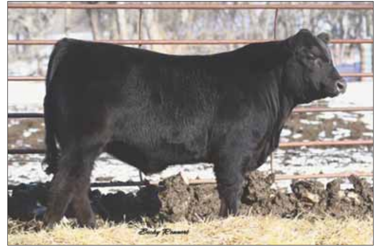
HUNT Gambler 140G, sire of Lot 19.