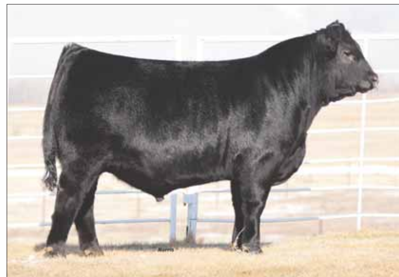
MAGS Federal Reserve, Lot 33 sire.

Without a doubt, these embryos will be the talk of town for years! When Tubmill Creek Farms told us of their intention with this embryo lot- we could barely contain the excitement. These three conventional embryos will be from the highly anticipated mating of MAGS Federal Reserve 1014F and the great MAGS Bethany 9245B female. MAGS Federal Reserve was the high-selling lot in the 2019 Magness Land & Cattle Western Slope Bull Sale. He is a double homozygous son of the great MAGS Cable bull. MAGS Bethany 9245B is quite the impressive daughter of EXAR Upshot 0562B. Her dam is the great AUTO Carminda 656S donor, a JCL Lodestar female. She is a number giant- her weaning weight and yearling weight figures both rank in the top 10% of the breed and her marbling figure ranks in the top 25%. Genetics that are this valuable are difficult to part with, but even more difficult to acquire! Don't pass up this special opportunity made possible by Tubmill Creek Farms. These three conventional embryos will be 50% Lim-Flex and double homozygous.