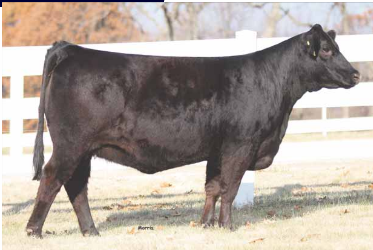
CFLX Robinette 070E, Lot 28A & 28B donor.

Folks, this is a genetic opportunity that you'll want to pay special attention to. FWLY Can Do is the 2018 American Royal Champion Limousin Bull that came from the great program at Fawley Farms. He is a son of RLBH Air Force One and out of the powerful CLLL Crystal 334W female. The dam of these embryos needs little introduction- you'll see her influence in numerous pedigrees and breeding programs across the country. CFLX Robinette 070E is a daughter of the famed BOHI Red Robin 282R female and out of GPFF Blaque Rulon. The influence of FWLY Can Do and CFLX Robinette 070E is remarkable and will have endless potential. These four embryos will be 71.5% Lim-Flex, homozygous black and double polled. A blending of this caliber is hard to come by and isn't offered to the public very often.