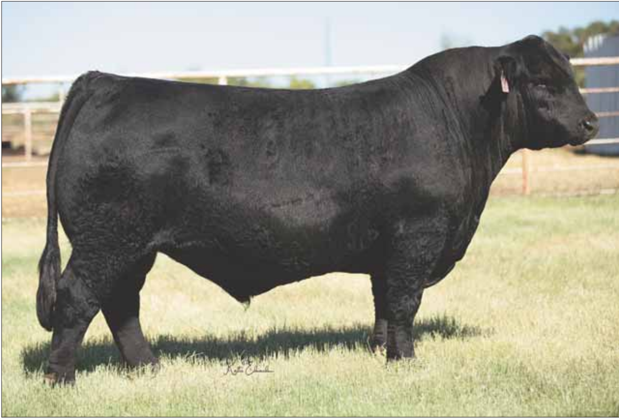
Lot 11 ~ DL Friday Nite Lites 258F