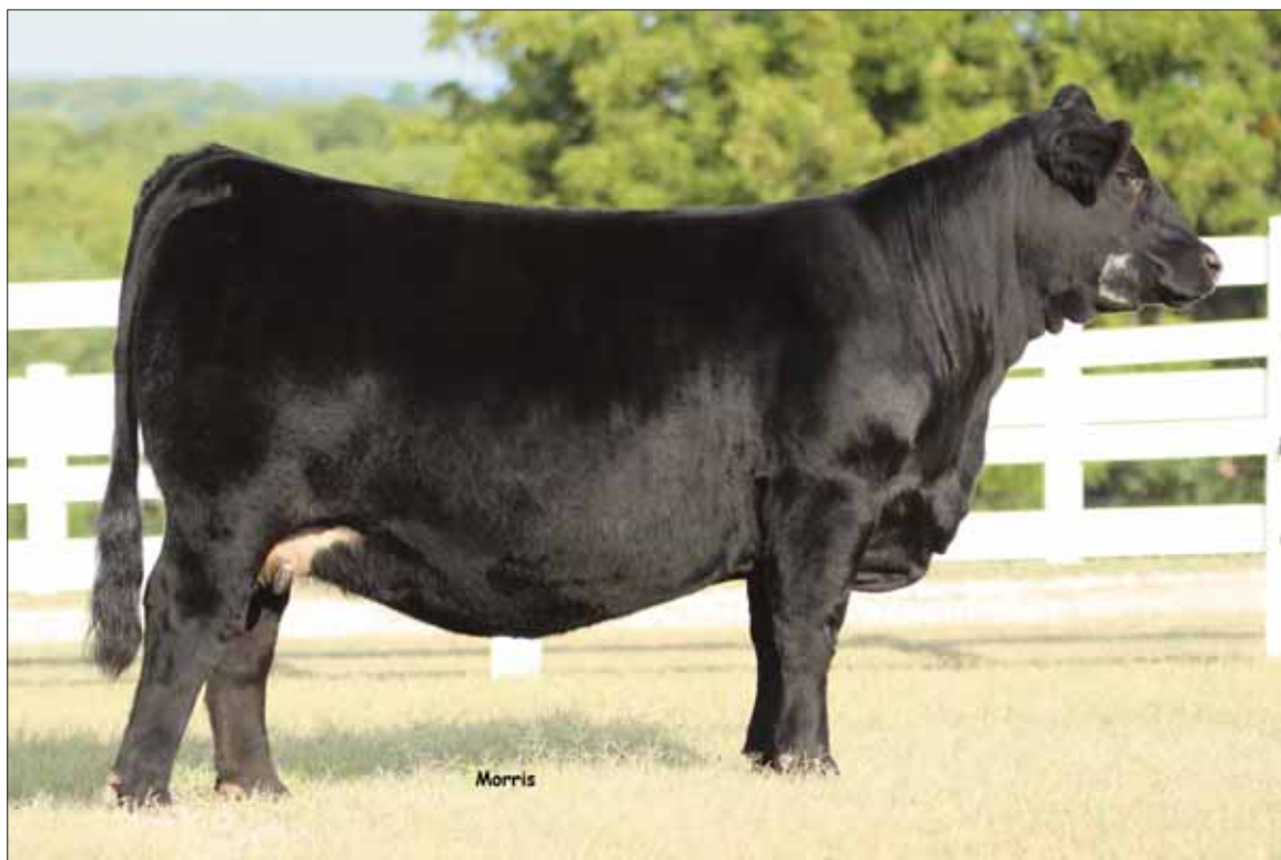
AUTO Callie 403D ET, Lot 39 dam.