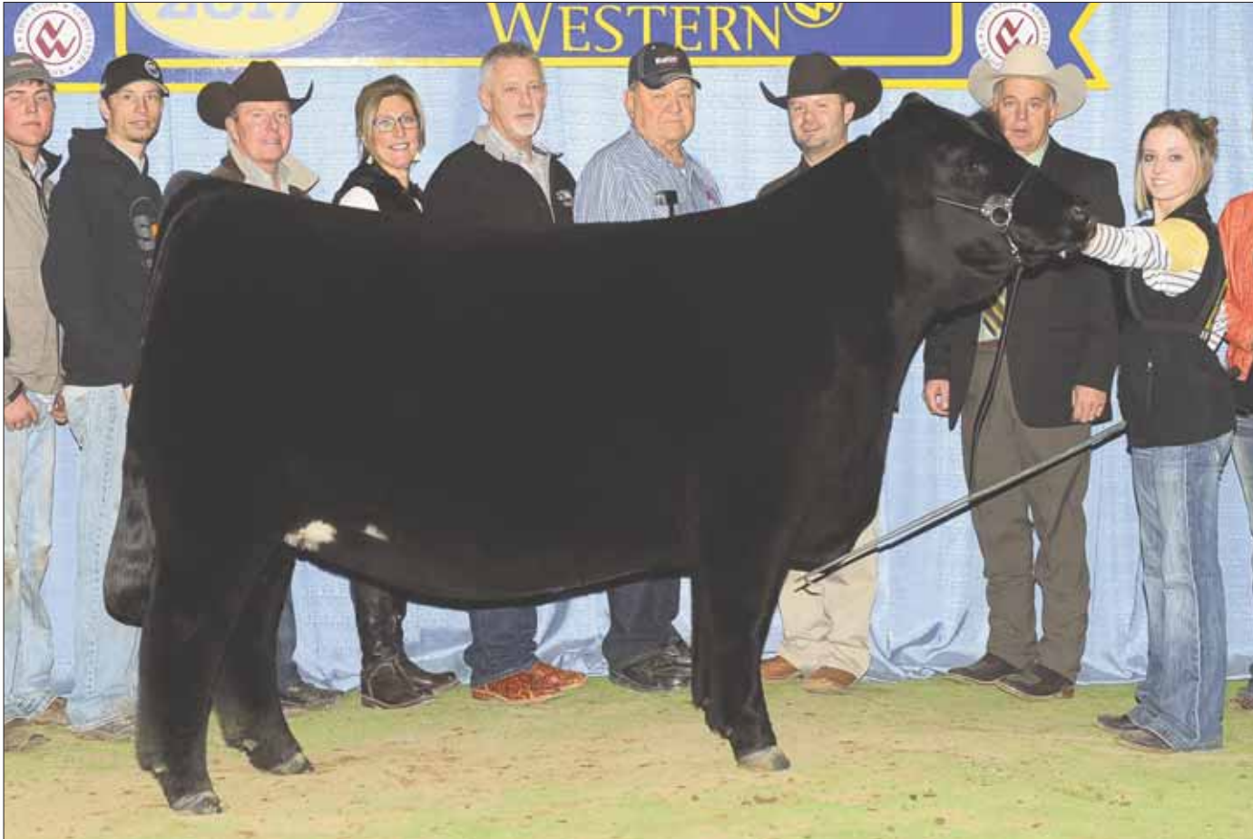
Riverstone Charmed 50C Full sib to Lot 2 pregnancy