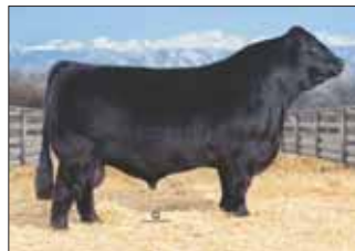
ELCX Kings Landing 599E, Lot 38C sire.