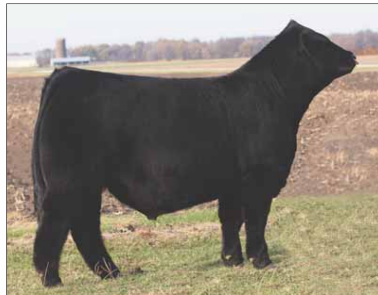
SSTO Guns N Roses 9408G, Lot 39 sire.

This is a mating sure to be a rapid return on investment! Route 66 Cattle Company has generously consigned three conventional embryos to SSTO Guns n Roses and AUTO Callie 403D. SSTO Guns n Roses is the TASF Crown Royal 960C ET son out of the iconic Riverstone Charmed female. He is a purebred bull that creates offspring with a world of future and of course with the monumental influence of his dam, Riverstone Charmed 50C. AUTO Callie 403D ET is an impressive daughter of AUTO Power Plus and AUTO Rebeca 292S. Folks- this pedigree is lined with the most influential genetics in the Limousin breed and now is a prime time to be a part of writing history! These three conventional embryos will be 81% Limousin and homozygous black.