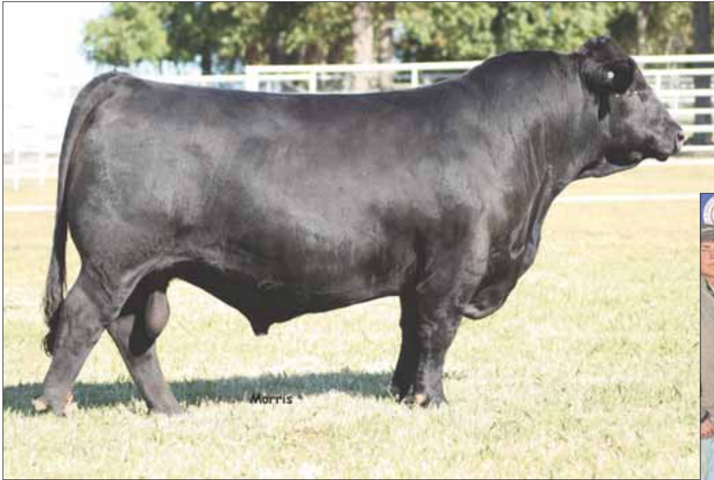
PBRS Bunk House 48B, Lot 5 sire.