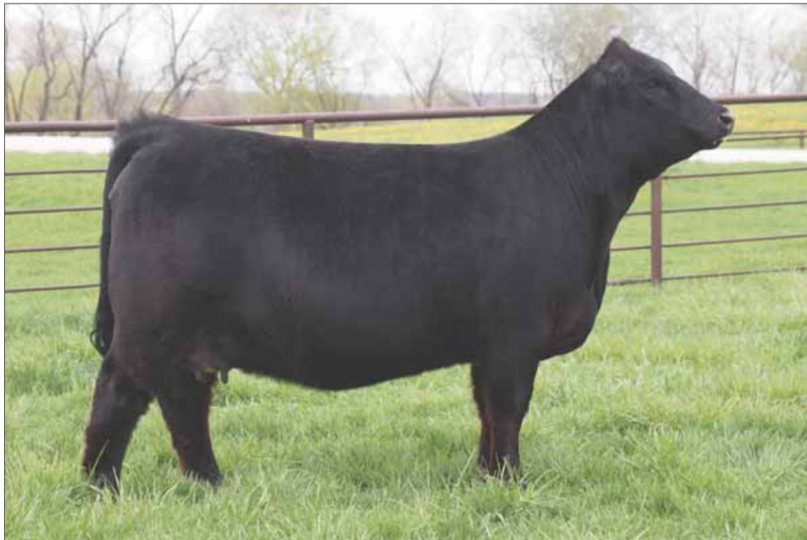
CELL 5065C, dam of Lot 20.