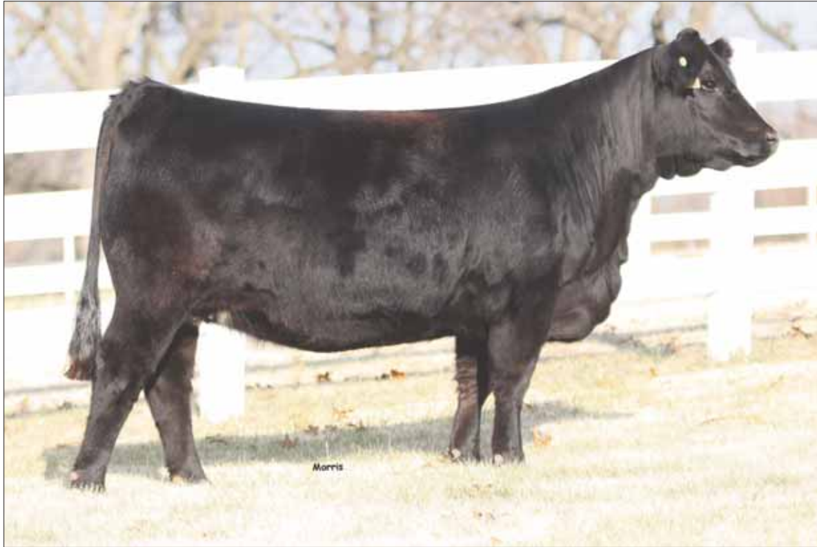
CFLX Bacardi 079E ET, Lot 29A & 29B donor.