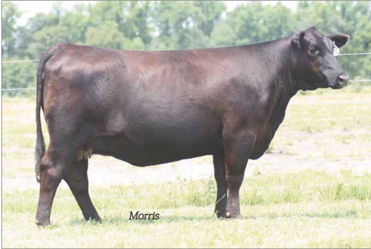
EBFL San Jose 170X, dam of Lot 27.