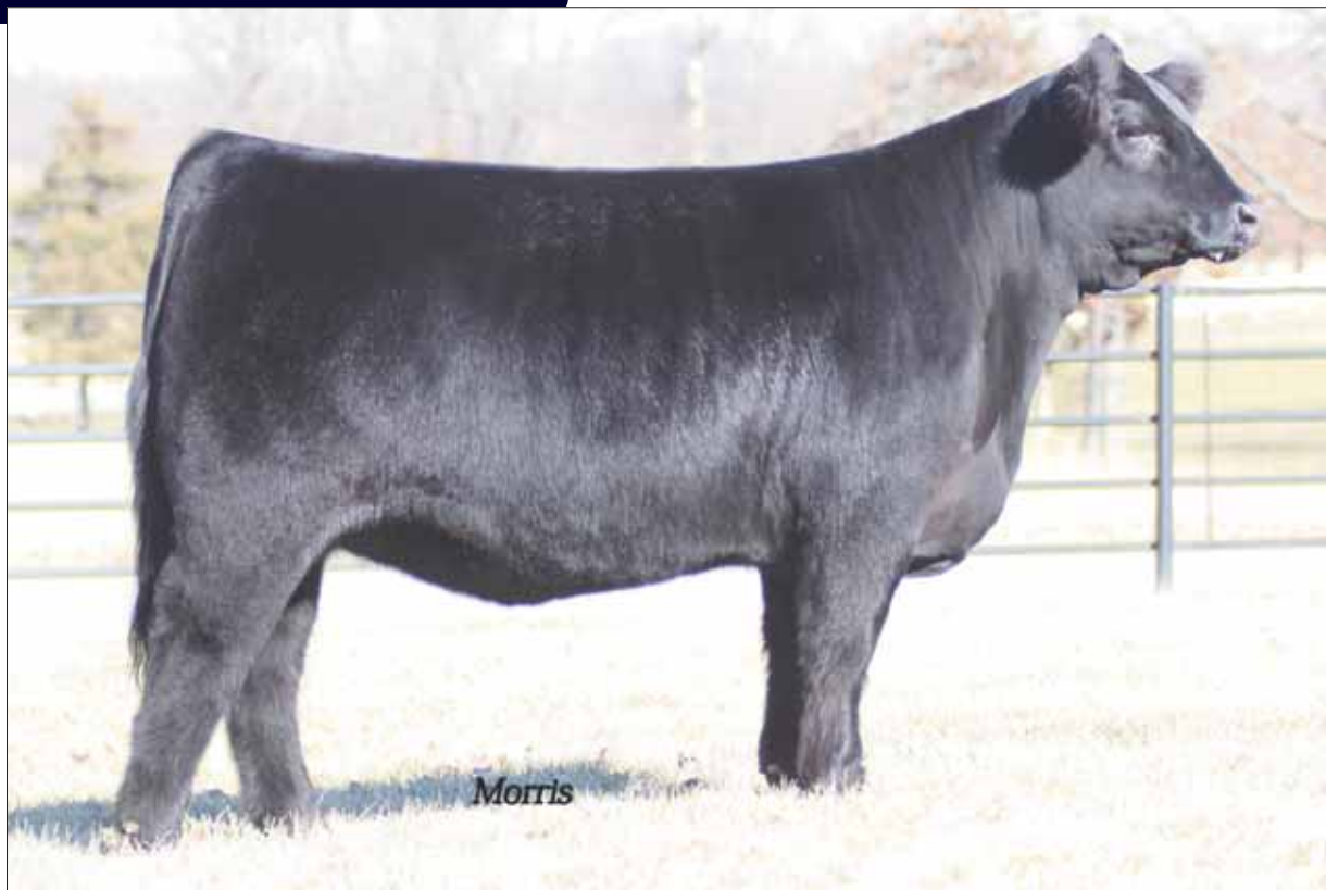
AUTO Poem 273Y, dam of Lot 26.

When Edwards Land & Cattle Co. told us their plan to consign these embryos to this sale offering- we almost didn't believe them! These four conventional embryos will be from the highly prolific mating of TASF Crown Royal 960C and AUTO Poem 273Y. TASF Crown Royal 960C is the DHVO Deuce son that is one of the most popular Limousin bulls in the breed. His dam is TASF Whiskey Lullaby 357W, a leading donor in the Thomas & Son Farms lineup. She is a daughter of EXLR Nasdaq 380R. AUTO Poem 273Y is the incredibly powerful donor of Edwards Land & Cattle Co. She is a daughter of SAV Bismarck 5682 and from the great MAGS Phantoms Prize donor. AUTO Poem 273Y is the dam of the 2016 All American Limousin Futurity Supreme Champion Bull, ELCX Bulletproof and ELCX Cabin Fever 273C, the 2017 All American Limousin Futurity Grand Champion Bull. The four embryos in this consignment will be 75% Lim-Flex, homozygous polled and double black. Once again, we are thrilled to have these embryos consigned by Edwards Land & Cattle Co. of Beulaville, NC.