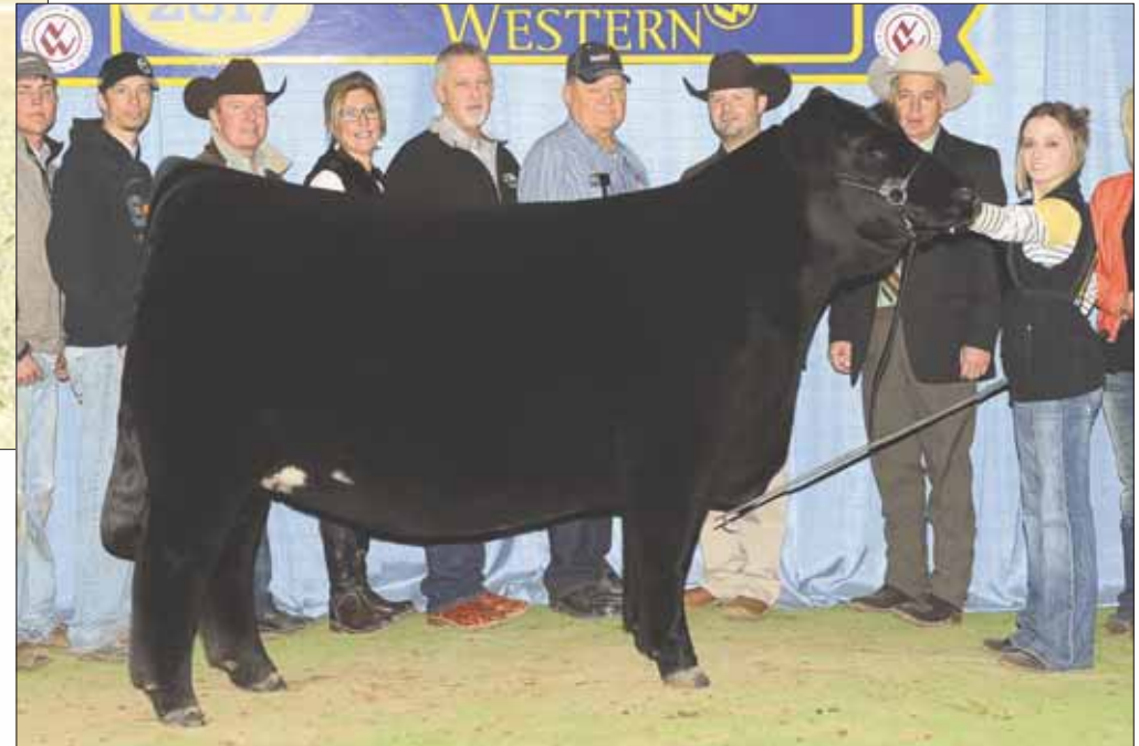
Riverstone Charmed 50C, dam