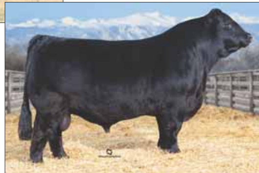
ELCX Kings Landing 599D, Lot 42A sire.