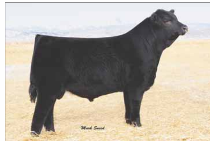
AHCC West Wind, full sib to dam of Lot 14.

LOT 14A - MAGS Havana Boy - 09.26.2020, 50% Lim-Flex; Homo Polled/ Double Black, son of PBRS Encore 7195E.