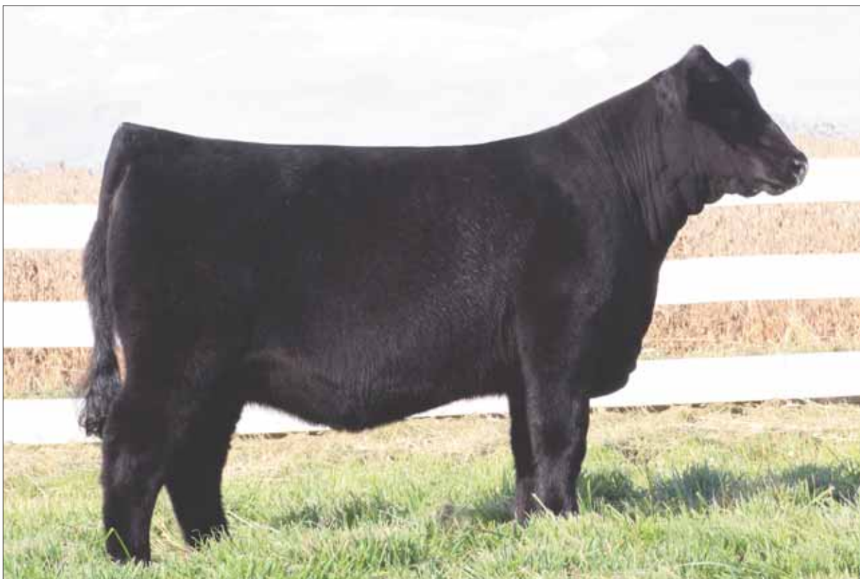
Lot 12 ~ ATAK Honey ET

Selling full possession and 50% embryo interest.