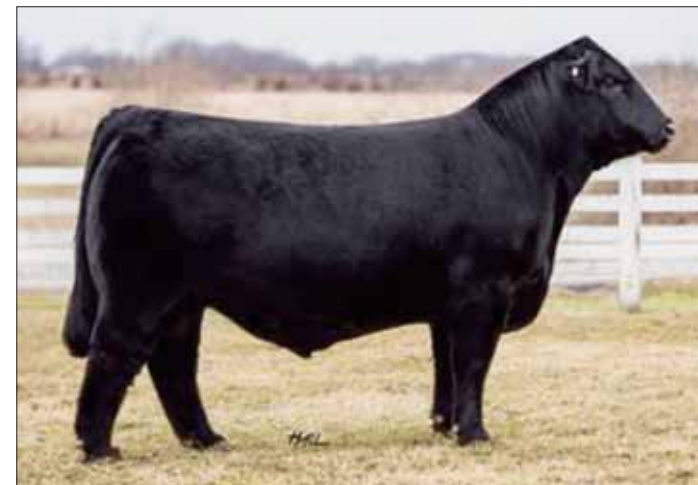
FWLY Can Do, Lot 28A & 28B sire.

Folks, this is a genetic opportunity that you'll want to pay special attention to. FWLY Can Do is the 2018 American Royal Champion Limousin Bull that came from the great program at Fawley Farms. He is a son of RLBH Air Force One and out of the powerful CLLL Crystal 334W female. The dam of these embryos needs little introduction- you'll see her influence in numerous pedigrees and breeding programs across the country. CFLX Robinette 070E is a daughter of the famed BOHI Red Robin 282R female and out of GPFF Blaque Rulon. The influence of FWLY Can Do and CFLX Robinette 070E is remarkable and will have endless potential. These four embryos will be 71.5% Lim-Flex, homozygous black and double polled. A blending of this caliber is hard to come by and isn't offered to the public very often.