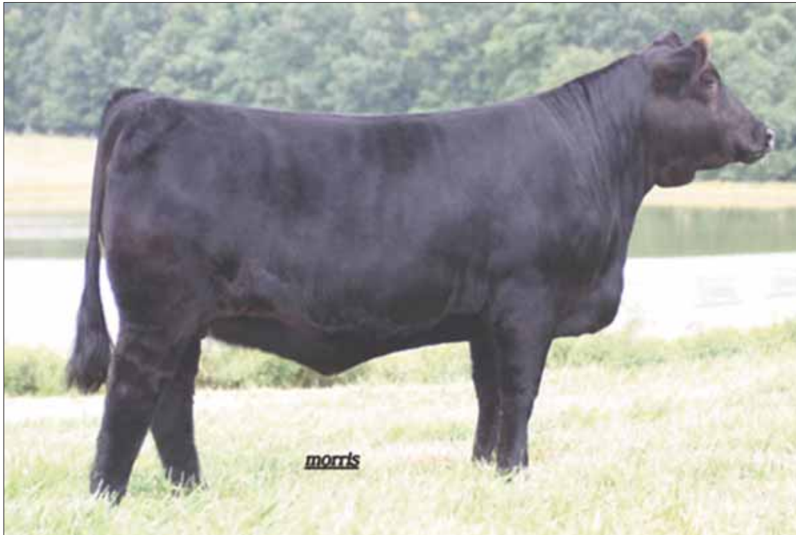
WLR Ugly Betty 432U, a full sib to the granddam of Lot 36.