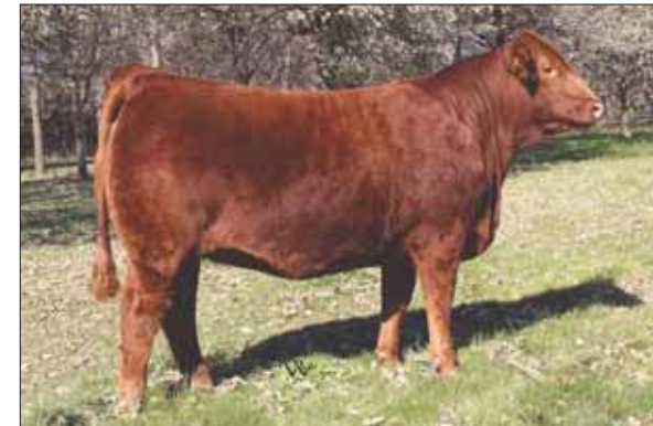
WULFS Enchilada 7368E, Lot 13 dam and top selling bred heifer in 2018 A Night on the Town Sale.