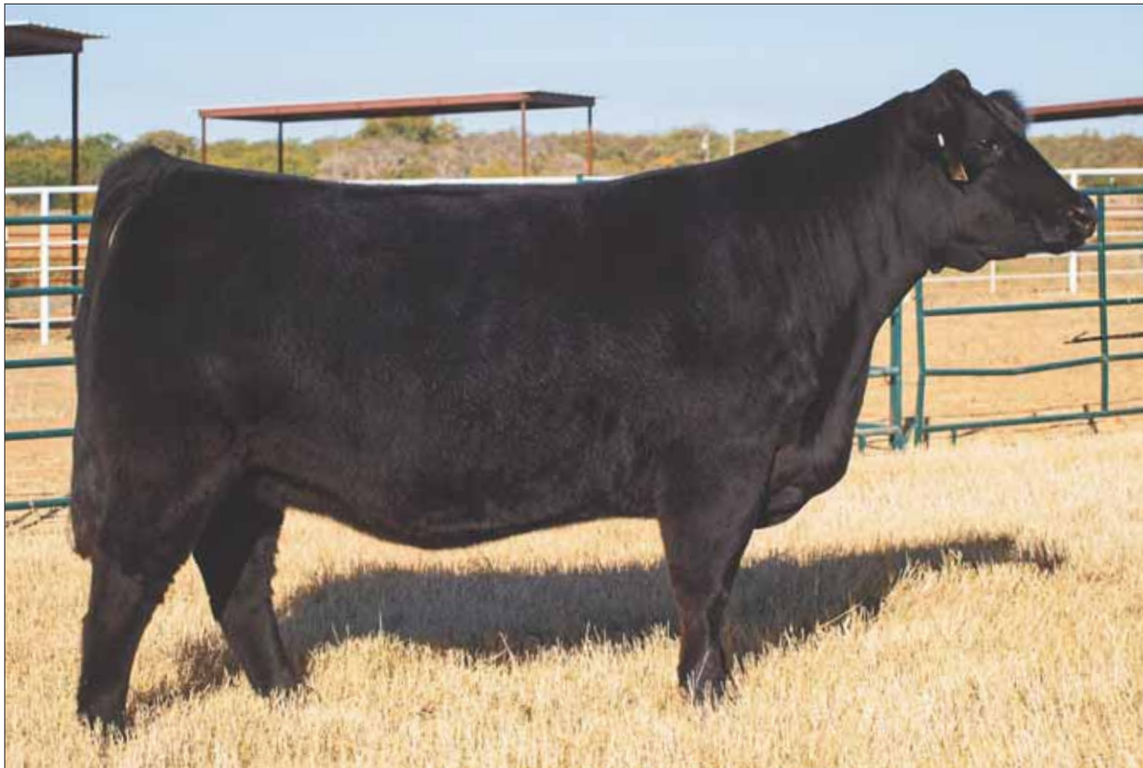
SSTO Maximilian 734E