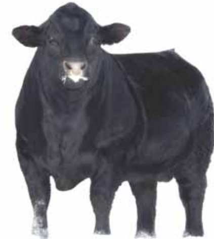
TMCK Durham Wheat, sire of Lot 27.

These four conventional embryos represent the finest mating ever created at Edwards Land & Cattle Co. of Beulaville, NC. TMCK Durham Wheat has a phenomenal history in his storybook already, but we'll refresh your memory because it's so valuable! TMCK Durham Wheat is the sire behind the great Riverstone Charmed "Ratliff Heifer" and Riverstone Crown Royal. He is a son of DHVO Deuce and out of the MAGS Strawberry Pie female. TMCK Durham Wheat is known as the 'show heifer maker' and has quickly become one of the most sought after sires in the industry today. He has made his mark in the Limousin breed and far beyond. The donor female in this mating is EBFL San Jose 170X. She is an SAV Pioneer 7301 daughter out of a GAR Predestined female, TMCK San Jose 170U. She is the huge-numbered female that we believe will produce excellent offspring desired by any cattleman. These four embryos will be 62.5% Lim-Flex, homozygous black and double polled.