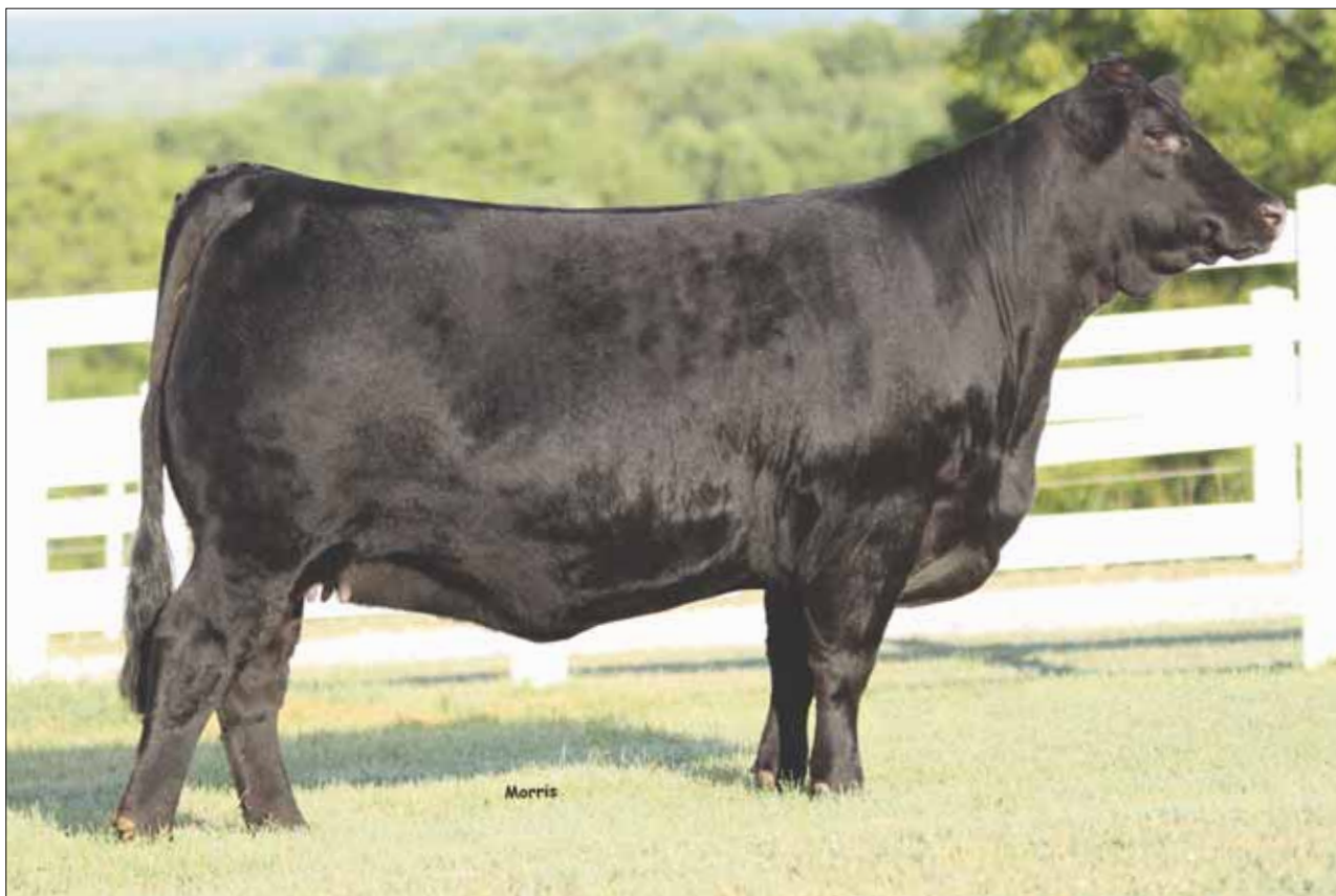
MINO Fiona ET, Lot 25 donor.