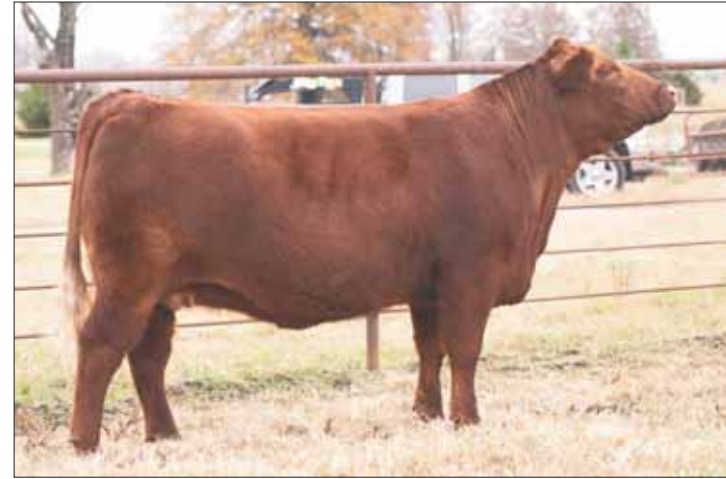
Lot 17 ~ CMCN Delightful Breeze 610D

LOT 17A - The heifer calf at side of CMCN Delightful Breeze 610D is truly an exciting young female. HMCH Grace is a daughter of the powerful TASF Crown Royal 960C ET bull. He is the impressive DHVO Deuce son out of a great female, TASF Whiskey Lullaby 357W. Crown Royal was the 2017 National Western Stock Show Grand Champion bull raised by Thomas & Son Farms. Most notably, Crown Royal sired the 2018 North American International Livestock Exposition Grand Champion Open Limousin female shown by Kinnick Paulsen. HMCH Grace has such an impressive set of numbers. Her weaning weight figure of 76 ranks in the top 10% of the breed and her yearling weight figure of 109 ranks in the top 15% of the breed. She is homozygous polled and black. We're certain this young heifer calf will be a crowd favorite on sale day- you better have your bid in early and stay on her!