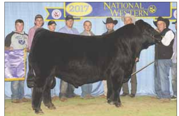
TASF Crown Royal 960C ET, sire of Lot 8C.