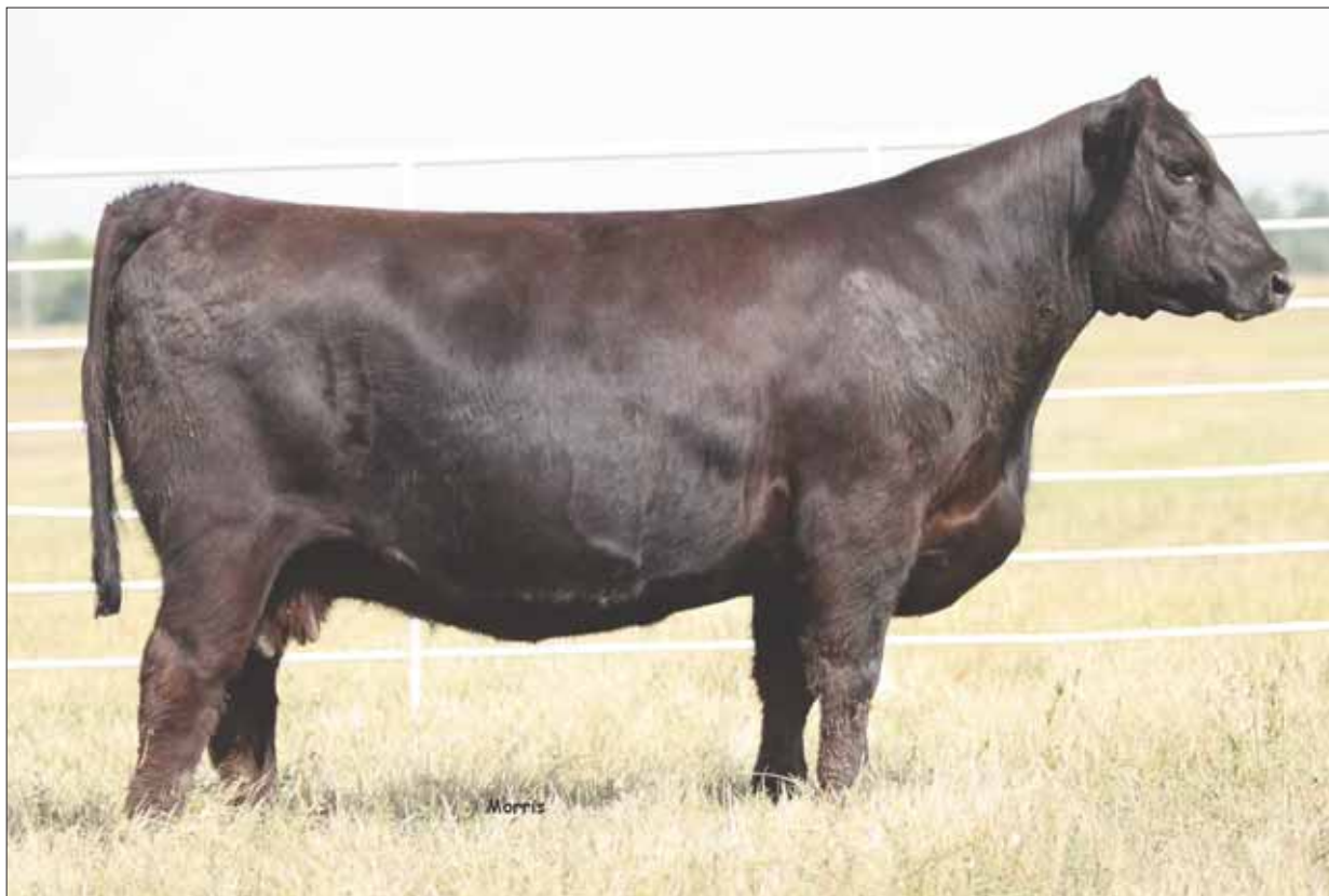
Lot 15 ~ MAGS Checkered Veil