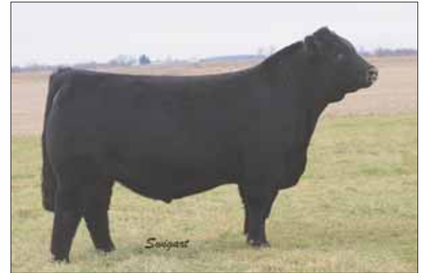
RLBH Air Force One, sire of Lot 8A.