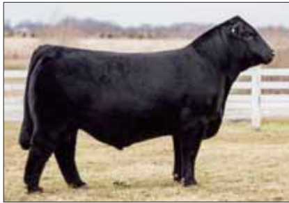
FWLY Can Do, Lot 6A & 6B sire.