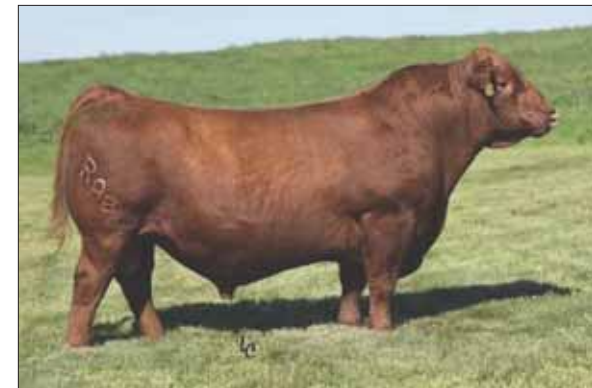
Bieber Hard Drive Y120, Lot 31 sire.

Retaining the right to one flush at buyer's connivence and seller's expense.