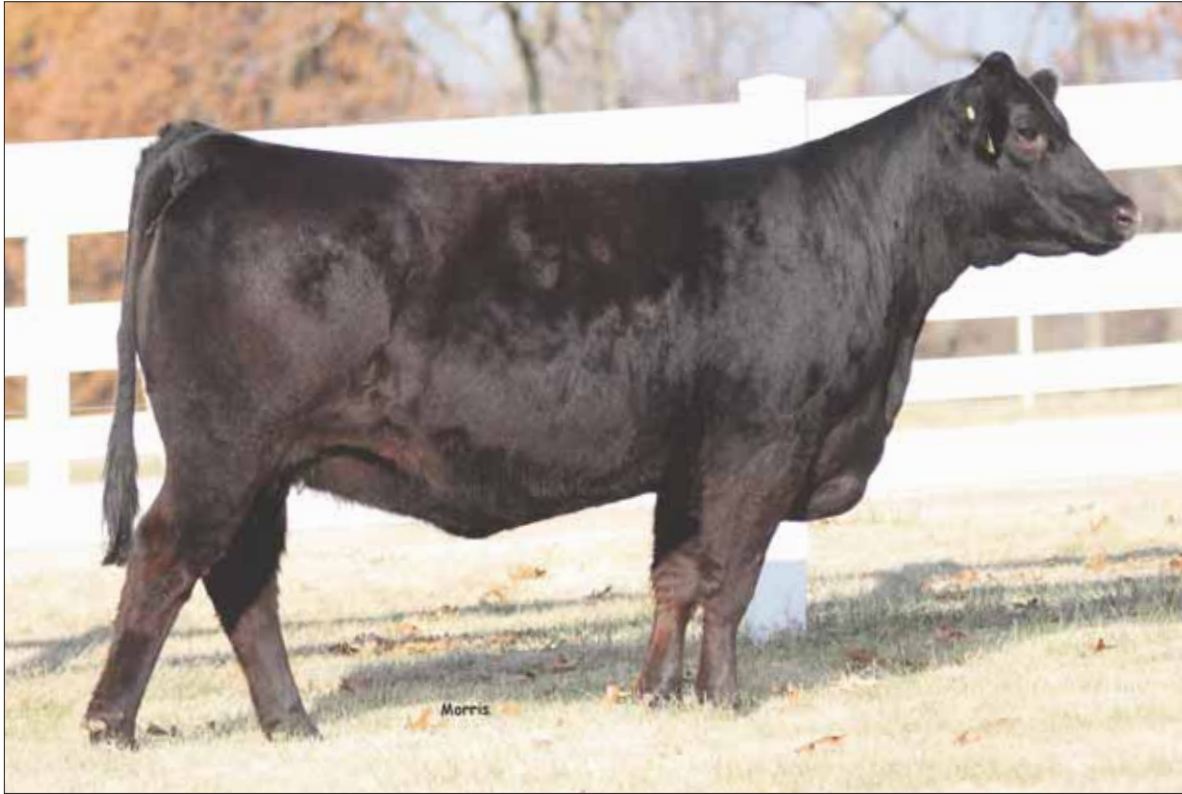
CFLX Robinette 070E ET, Lot 31 dam.