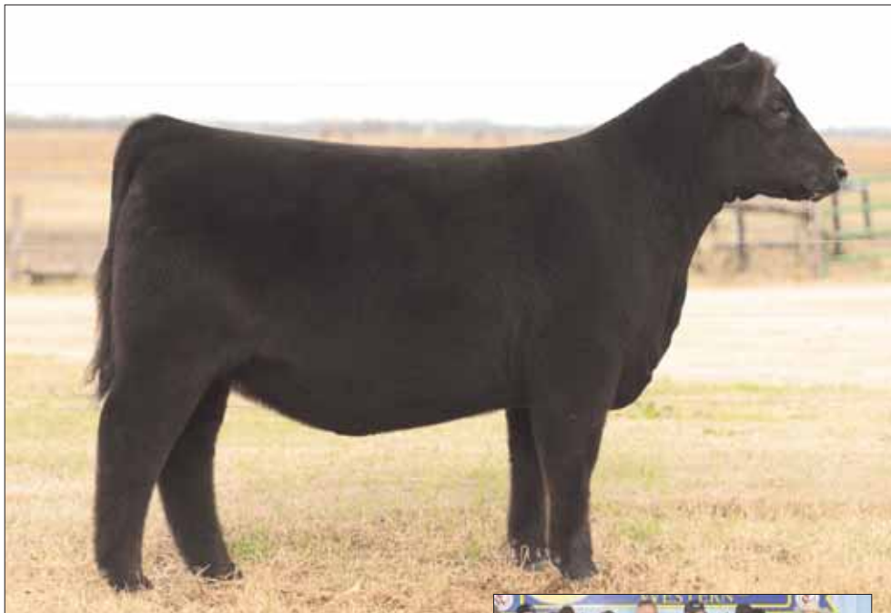
WFL Giggles, Lot 7 dam.