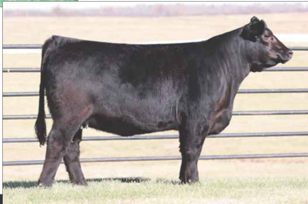
AUTO Ajay, donor dam of Lot 9 Pick.