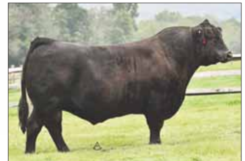
CJSL Creed 5042C, Lot 32D sire.