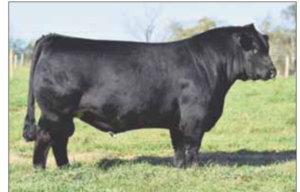
CJSL Dauntless, Lot 1B sire.