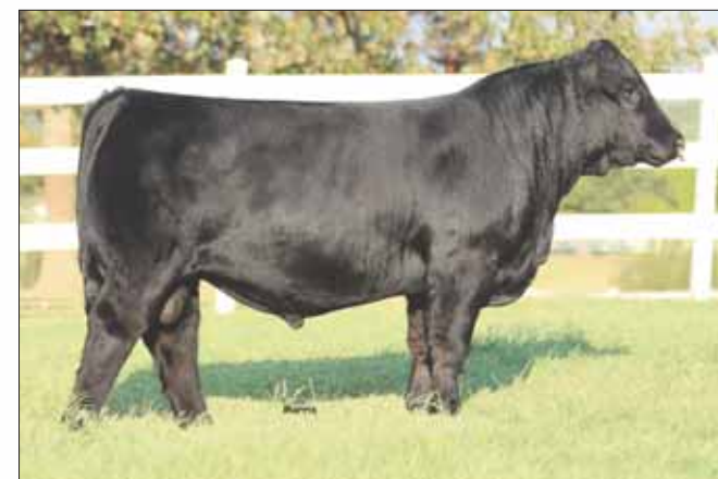
RLBH Days of Thunder ET, Lot 16 sire.