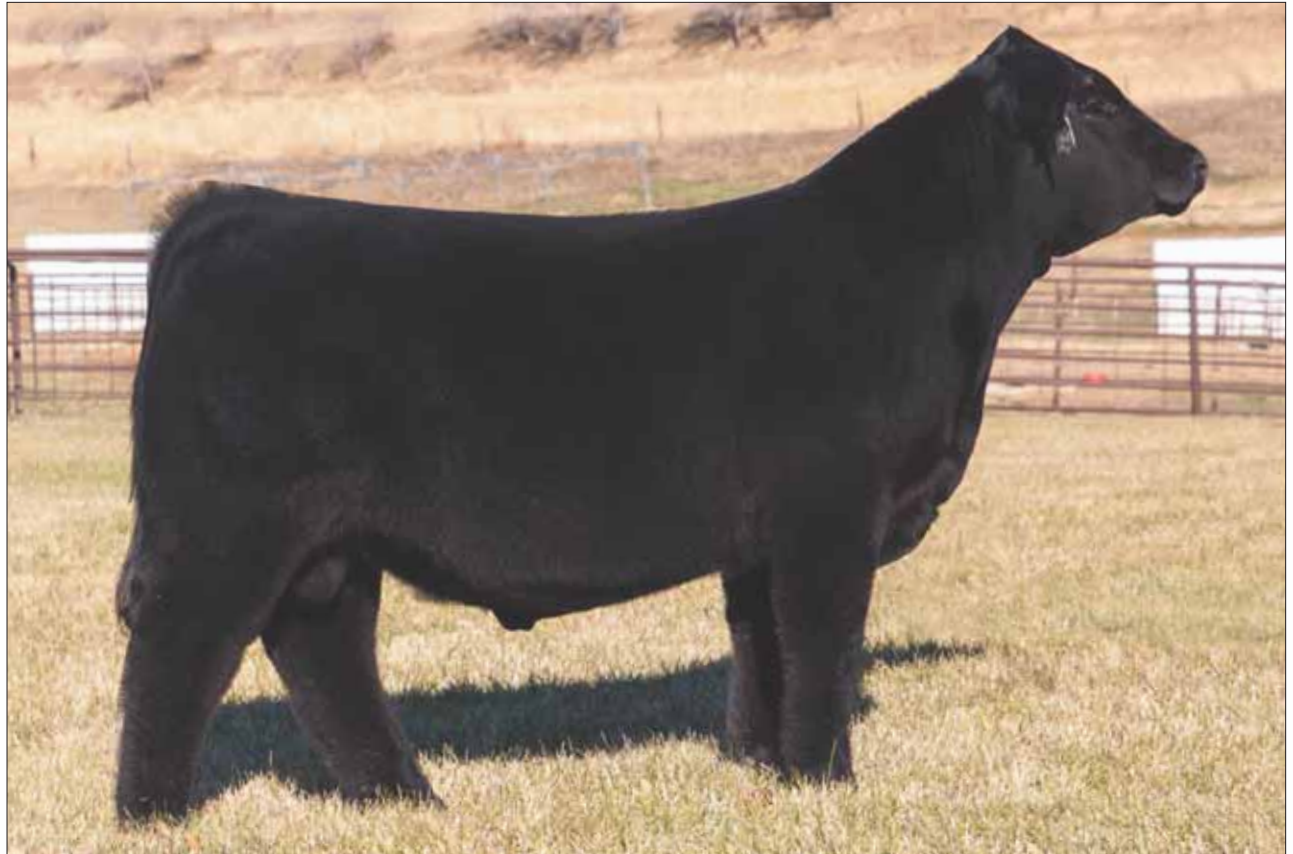
LOT 4 ~ KLS SULL Charmer