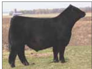
SSTO Guns N Roses, Lot 38A sire.

ELCX Kings Landing 599D ET is another individual with a stunning presence in the Limousin breed. He was the 2018 North American International Livestock Exposition Grand Champion Bull exhibited by Edwards Land & Cattle, White Valley and Wies Limousin Ranch. He is a double homozygous son of MAGS Xyloid and out of the one and only WLR Prada donor female. This mating will be a great opportunity to find out what this blend of elite genetics will do for you! This sexed heifer embryo will be 65.5% Lim-Flex and homozygous polled.