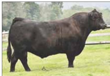
CJSJ Creed, sire of Lot 9 Pick.