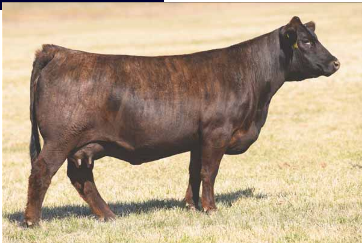
AUTO Remi 674D, Lot 22 donor.