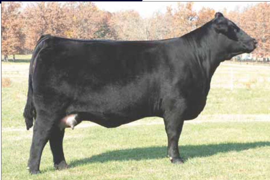
AUTO Rebeca 292S, dam