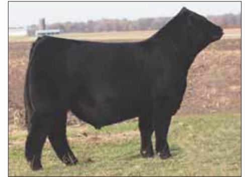
SSTO Guns N Roses 9408G, Lot 32A sire.