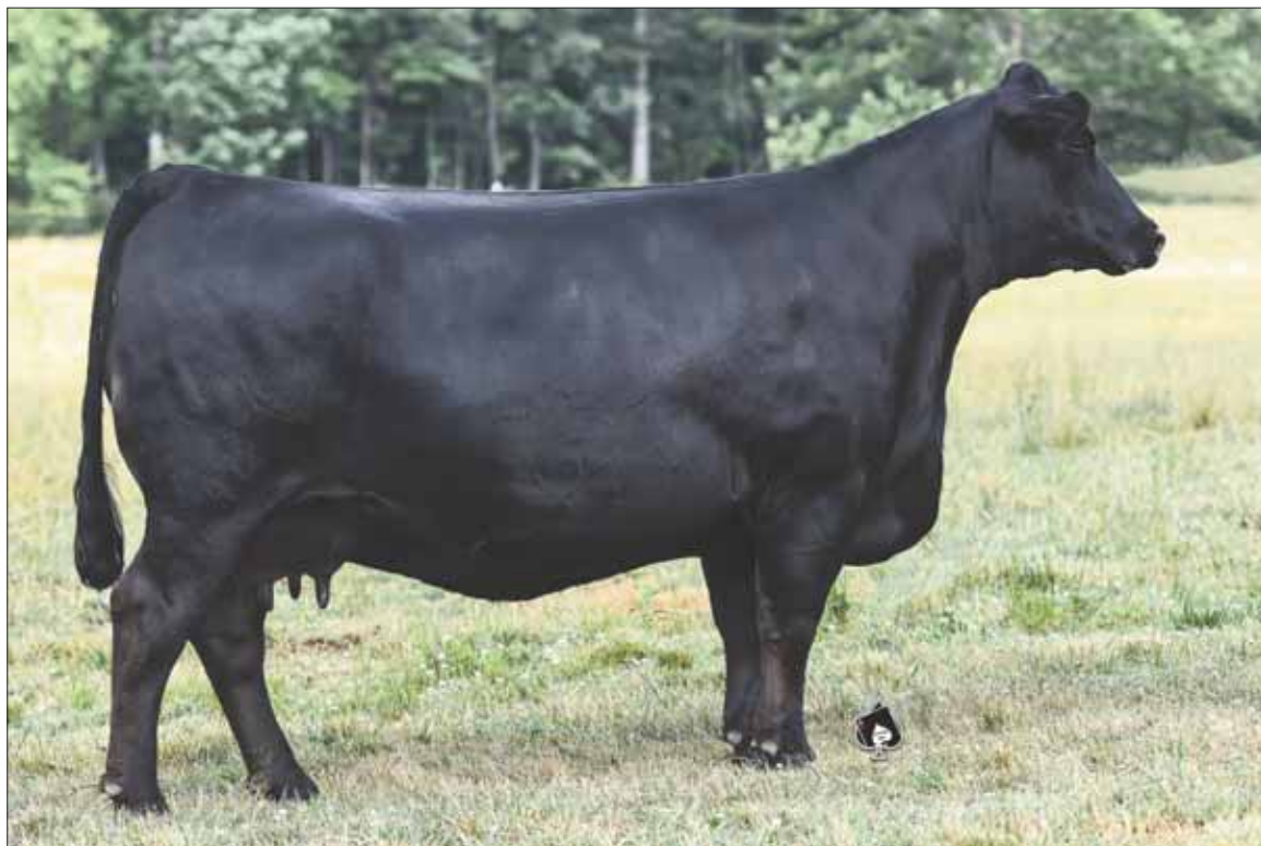
MAGS Bethany, Lot 33 dam.