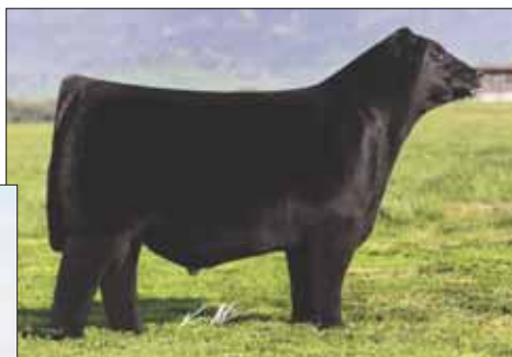
Colburn Primo 5153, sire of Lot 18A.