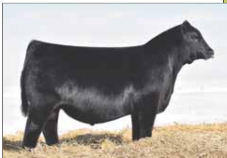
Schilling's R&L Confidential, sire of Lot 18B.