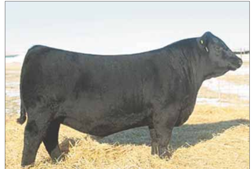
S A V America 8018, Lot 36 sire.