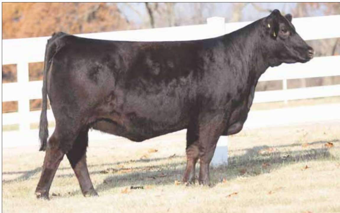
CFLX Robinette 070E, Lot 35 dam.