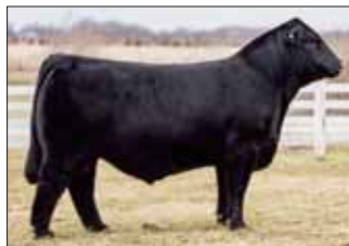
FWLY Can Do, Lot 38B sire.