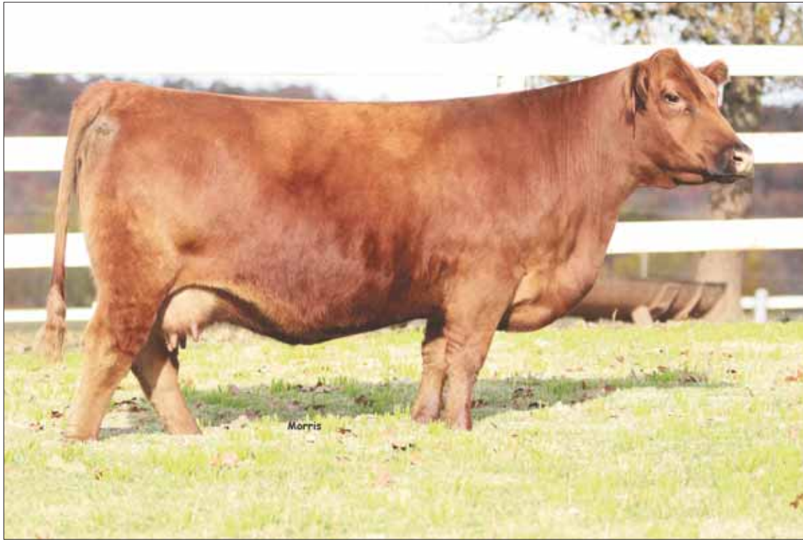
J6 Tempest B300, Lot 34 dam.