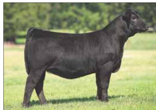
AUTO Hetti 207H, daughter of Lot 22 donor.