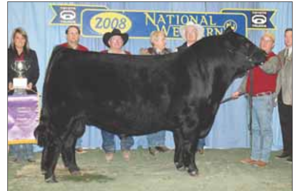
DHVO Deuce 132R, sire of Lot 8B.