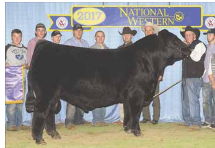
TASF Crown Royal 960C, sire of Lot 26.

When Edwards Land & Cattle Co. told us their plan to consign these embryos to this sale offering- we almost didn't believe them! These four conventional embryos will be from the highly prolific mating of TASF Crown Royal 960C and AUTO Poem 273Y. TASF Crown Royal 960C is the DHVO Deuce son that is one of the most popular Limousin bulls in the breed. His dam is TASF Whiskey Lullaby 357W, a leading donor in the Thomas & Son Farms lineup. She is a daughter of EXLR Nasdaq 380R. AUTO Poem 273Y is the incredibly powerful donor of Edwards Land & Cattle Co. She is a daughter of SAV Bismarck 5682 and from the great MAGS Phantoms Prize donor. AUTO Poem 273Y is the dam of the 2016 All American Limousin Futurity Supreme Champion Bull, ELCX Bulletproof and ELCX Cabin Fever 273C, the 2017 All American Limousin Futurity Grand Champion Bull. The four embryos in this consignment will be 75% Lim-Flex, homozygous polled and double black. Once again, we are thrilled to have these embryos consigned by Edwards Land & Cattle Co. of Beulaville, NC.