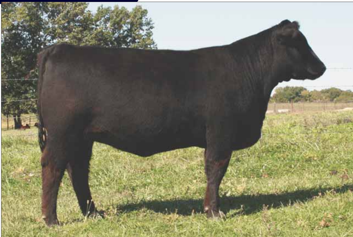
Lot 16 ~ JBFI Grace 503G