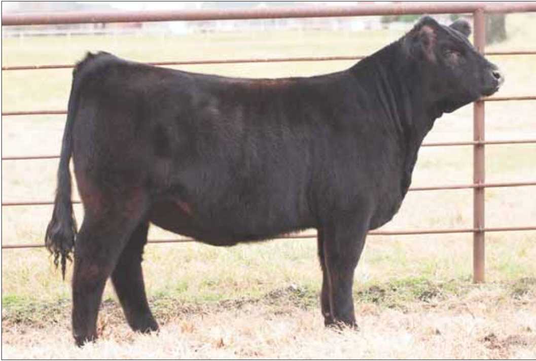
Lot 17A ~ HMCH Grace