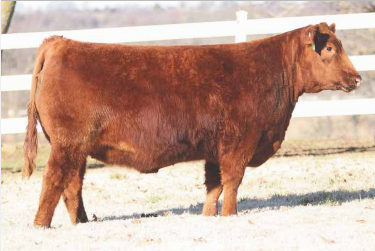
PBRS 7193E, Lot 21 donor.