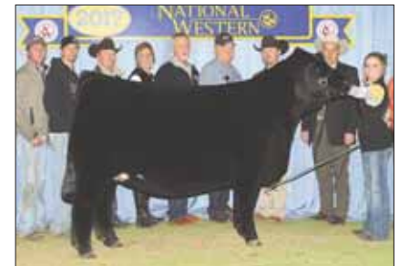
Riverstone Charmed 50C