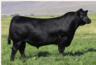
J Trademark 1037 Sire of Embryos

“7100” is a Pathfinder Female. “7100” has production records of 4/97 for BR, 4/110 NR, and 3/109 YR. “7100” has one of the best sets of ET calves here this spring, she’s making here mark here! “7100” is the dam of our herd bull “Logo 947”, that Little Goose Ranch in WY bought spring possession from us in our 2020 bull sale. First calves this spring out of “947” look incredibly good. “7100” has been extremely productive here for us, we are excited to be partners with Shady Brook in TN on this tremendous young female. “7100” has another herd bull in the making on her right now, she is extremely long, tons of power, excellent udder. I feel she is one of the really good young females on the ranch here. Trademark was selected as the $165,000 top selling bull of the Cattleman’s Cut Bull Sale. He is a low-birth weight calving ease bull, with double digit calving ease direct, with an outcross pedigree for our program. “Trademark” has caught the attention of cattleman from all across the country. He has tremendous performance, added muscle shape,