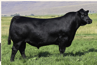
J Trademark 1037 Sire of Embryos

173 was the $130,000 selling foundation heifer we donated to the American Junior Angus Association. 173 was the top $M female we had in our herd when we sold her. 173 calved and has a beautiful udder, extremely wedge shaped, long bodied, with a big hip. She is a flush sister to the record selling female here, Chloe 9275. We feel 173 has a very bright future ahead of her. This mating to Trademark will be extremely good. Trademark was selected as the $165,000 top selling bull of the Cattleman's Cut Bull Sale. He is a low-birth weight calving ease bull, with double digit calving ease direct, with an outcross pedigree for our program. "Trademark" has caught the attention of cattleman from all across the country. He has tremendous performance, added muscle shape, with unique combination of phenotype, and an incredible number package. We are excited to own Trademark's dam. She was the record selling $210,000 ½ interest female