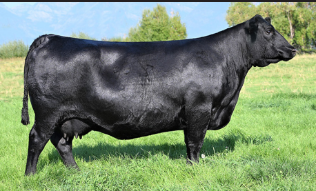
Lawsons Chloe C815 Dam of Embryos

Lawsons Chloe C815 x PM Executive Decision 5'17