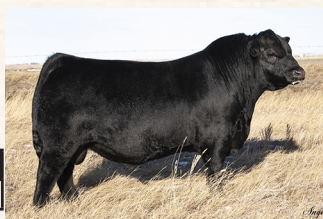
PM Executive Decision 5'17 Sire of Embryos

C815 needs no introduction here, she has produced more high valued cattle here in the past few years than any cow we have owned. Here is your opportunity to acquire genetics from one of the hottest cows in the breed. Coleman Chloe 9275, a maternal sister, is the $375,000 one-half interest, for a $750,000 valuation, and the record selling female in the history of our program. "9275" is the dam of the Record Selling Flush in our 2022 Your Maternal Source Female Sale for $80,000. Coleman Chloe 034, another maternal sister, was the $150,000 one-half interest, for a $300,000 valuation top selling bred heifer of our 2021 "Your Maternal Source Female Sale". Coleman Triumph 9145, a maternal brother to these embryos, was the $225,000 one-half interest, top-selling lot of the 2020 Your Maternal Source Sale for a $450,000 valuation. There's an extensive list of maternal siblings to these embryos that have sold very well here. The sire of these embryos is PM Executive Decision. Executive Decision is a Canadian bull that we have used here quite a bit.