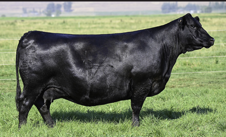
Coleman Donna 7232 Dam of Embryos