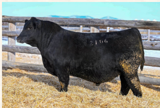
Coleman Below Zero 2106 Sire of Embryos

Donna 504 has been a visitor favorite since she was a calf here. 504 has done a tremendous job here with her calves, and her progeny have been some of the favorites in our bull and female sales. Ratio's on her BR 4/89, NR 4/110, YR 3/110. 504's sons topped our 2021 bull sale, many going to registered breeders all across the US. Take advantage here. Coleman Below Zero 2106 was the $150,000 top-selling bull of the 2023 Coleman Angus bull sale and selected by Janssen Angus of Iowa, Marshall Fenner Farms of Missouri, Pinewood Farms of Tennessee and GENEX BEEF AI stud. A sure shot heifer bull with exceptional phenotype, exceptional depth of body, and represents great breed character in a well-balanced number package. Coleman Donna 0153, his dam, is a great three-year-old with a beautiful udder and look. She has a progeny