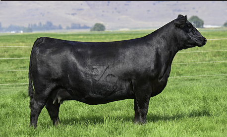
Coleman Donna 4203 Dam of Embryos

Coleman Donna 9220 x Coleman Glacier 041