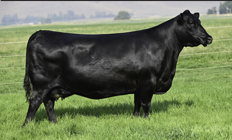
Coleman Eriskay 291 Dam of Embryos

Coleman Eriskay 291 x Leachman Right Time