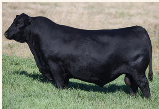
S A V Renovation 6822 Sire of Embryos

“5207” is a Pathfinder female, with a calving interval of 352 days on her first 4 calves, BR 4/95, NR 4/109, and YR 3/108. She has bred back first straw AI for the 3rd year in a row. “5207” is extremely angular, deep sided, perfect udder, and a big, long level hip. We’re overly excited for her future here. “5207” consistently has one of our best calves each year, her son by Coleman Resource 710 was one of our high selling bulls in our 2021 Bull sale. “5207” just weaned a big stout bull by Coleman Rock 7200. The sire of these embryos is Renovation. “Renovation” is an impressive individual with abundance of muscle, body shape, depth of rib in a modest frame size. His daughters are easy fleshing, deep ribbed, with beautiful udders. We feel “Renovation” is one of the best and most proven Renown sons out there. Extremely good mating here for sure. These are IVF embryos (Trans Ova), we are selling three embryos in this mating and guaranteeing one pregnancy. Buyer has the option to take six embryos out of this mating and we will guarantee 2 pregnancies. These embryos are exportable to Canada.