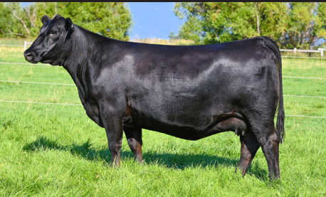
Coleman Donna 046 Flush Sister to Dam of Embryos