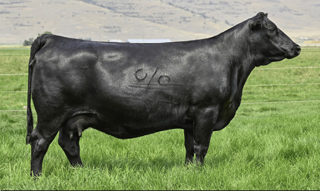
Coleman Chloe 975 Dam of Embryos

Coleman Chloe 975 x Coleman Below Zero 2106