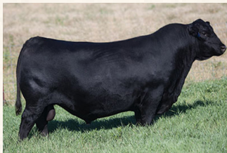
S A V Renovation 6822 Sire of Embryos

4086 sold for $210,000 for ½ interest and was the top-selling female in our recent “Your Maternal Source Sale”. 4086 is the Dam of J Trademark 1037, a featured herd sire at Coleman Angus and Conley Cattle programs. Trademark has been one of the most sought-after young herd bulls this spring, with semen selling to many of the leading registered herds across the US. 4086 has a progeny record of 6 head/103 weaning, and a calving interval of 347 on 6 head. When you combine Calving Ease, Growth, Marbling, and $ Values, she is the #1 cow in AHIR her age or older. “4086” did this the old-fashioned way, in the pasture and through her progeny. The sire of these embryos is Renovation. “Renovation” is an impressive individual with abundance of muscle, body shape, depth of rib in a modest frame size. His daughters are easy fleshing, deep ribbed,