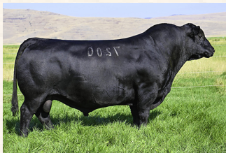
Coleman Rock 7200 Sire of Embryos

“7100” is a Pathfinder Female. “7100” has production records of 4/97 for BR, 4/110 NR, and 3/109 YR. “7100” has one of the best sets of ET calves here this spring, she’s making here mark here! “7100” is the dam of our herd bull “Logo 947”, that Little Goose Ranch in WY bought spring possession from us in our 2020 bull sale. First calves this spring out of “947” look incredibly good. “7100” has been extremely productive here for us, we are excited to be partners with Shady Brook in TN on this tremendous young female. “7100” has another herd bull in the making on her right now, she is extremely long, tons of power, excellent udder. I feel she is one of the really good young females on the ranch here. Rock was the $240,000 record selling bull in our 2022 female sale to Ingram Angus and Sandford Cattle. Demand for Rock is at an all-time high across the World right now. The cattleman’s kind is a perfect way describe the early indicators on Coleman Rock 7200. Rock would currently be one of the heaviest used sires here at Coleman Angus. He sires