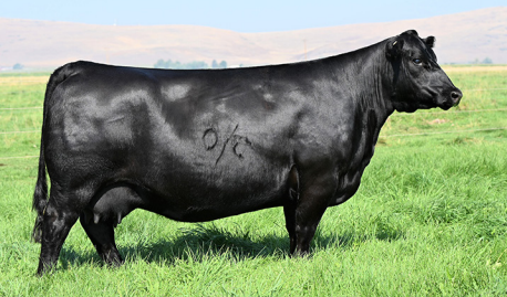
Coleman Donna 5247 Dam of Embryos