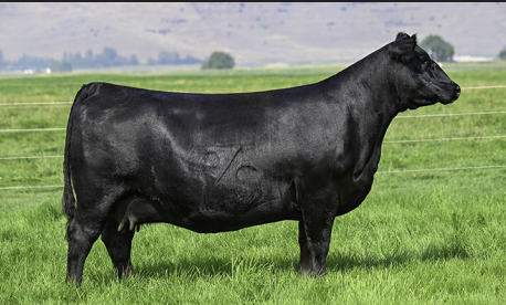
Coleman Donna 4203 Dam of Embryos

Coleman Donna 9220 x Coleman Below Zero 2106