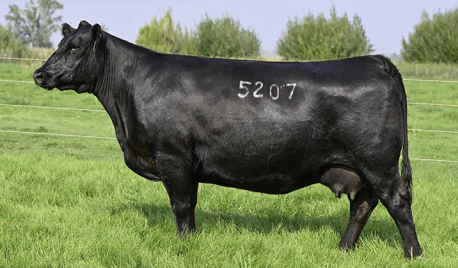
Coleman Donna 5207 Dam of Embryos

Coleman Donna 5207 x Coleman Below Zero 2106