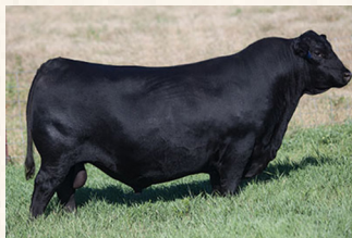
S A V Renovation 6822 Sire of Embryos

“6206” is a very Maternal Pathfinder female that we have pulled out of production and started flushing. “6206” has an impeccable record here, calving interval of 364 on her first 5 calves, BR 5/96 NR 5/110 and YR 4/108. 6206 has always bred 1st straw AI every year of her life. Her son was one of our feature bulls in our 2022 Bull Sale and was one of the sale toppers. “6206” has proved herself the old-fashioned way, in the pasture. Her heifer calf by Triumph has been a visitor favorite here this summer. The sire of these embryos is “Renovation” is an impressive individual with abundance of muscle, body shape, depth of rib in a modest frame size. His daughters are easy fleshing, deep ribbed, with beautiful udders. We feel “Renovation” is one of the best and most proven Renown sons out there. Extremely good mating here for sure. These are IVF embryos