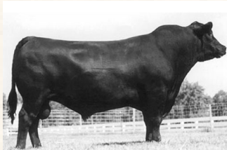
Leachman Right Time Sire of Embryos

“291” has been a particularly good female here. “291” is the dam of “Navigator 614” a proven bull that is leaving an extremely good set of daughters here, and whose sons have been topping our sales. “Navigator” throws as much true muscle as any bull we have ever used here. “Navigator” sons were very well received in our 2019 bull sale. We sold out of semen on Navigator last spring but have some more now available. “291” has 6 calves with a calving interval of 367, BR 8/88 NR 8/105 and YR 7/101. “291” has a perfect udder, long sided, deep ribbed, and complete. Not very often you have a female that is extreme low BW like “291” and then throws this much performance. This mating will be special. Right Time is known as one of the best female-making sires in the history of the breed. I really feel like this mating could be very special. There’s no guesswork