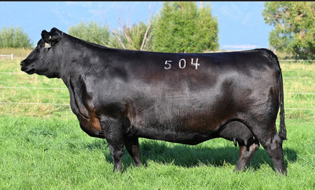
Coleman Donna 504 Dam of Embryos