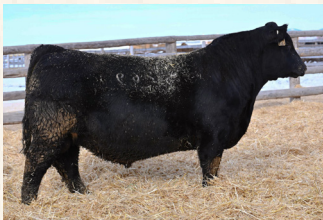
Coleman Patron 269 Sire of Embryos

"7232" has production records of BR 3/96, NR 3/107, and YR 2/106. She has a tremendous herd bull on her now from our summer calving group. "7232" is throwing a tremendous amount of performance in her progeny, she has the power to change one! "7232" is extremely long, big hiped, with a beautiful udder. This Resource X Donna 714 cross has been one of the best we have ever made here. "7232" has the potential to make a big time "Herd Bull". Trademark was selected as the $165,000 top selling bull of the Cattleman's Cut Bull Sale. He is a low-birth weight calving ease bull, with double digit calving ease direct, with an outcross pedigree for our program. "Trademark" has caught the attention of cattlemen from all across the country. He has tremendous performance, added muscle shape, with unique combination of phenotype, and an incredible number package. We are excited to own Trademark's dam. She was the record