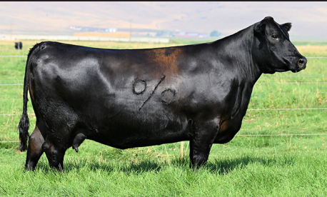
Coleman Everelda Entense 4327 Dam of Embryos

Coleman Everelda Entense 4327 x N Bar Emulation EXT