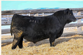
Coleman Below Zero 2106 Sire of Embryos

NR 2/106, and YR 1/109. "975" has a Glacier heifer calf at her side now, and she is exceptional, visitors here this summer have loved her. "975" is a flush sister to Triumph, she was our high selling female in our 2019 female sale to Jocko Valley in MT. We feel she has as much potential as any female we have had the opportunity to work with here. Big time mating here! Coleman Below Zero 2106 was the $150,000 top-selling bull of the 2023 Coleman Angus bull sale and selected by Janssen Angus of Iowa, Marshall Fenner Farms of Missouri, Pinewood Farms of Tennessee and GENEX BEEF AI stud. A sure shot heifer bull with exceptional phenotype, exceptional depth of body, and represents great breed character in a well-balanced number package. Coleman Donna 0153, his