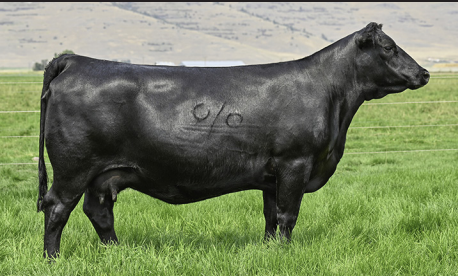
Coleman Chloe 975 Dam of Embryos