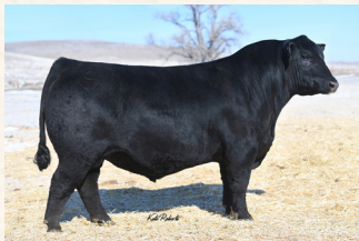
Sitz Resilient 10208 Sire of Embryos

4086 sold for $210,000 for ½ interest and was the top-selling female in our recent “Your Maternal Source Sale”. 4086 is the Dam of J Trademark 1037, a featured herd sire at Coleman Angus and Conley Cattle programs. Trademark has been one of the most sought-after young herd bulls this spring, with semen selling to many of the leading registered herds across the US. 4086 has a progeny record of 6 head/103 weaning, and a calving interval of 347 on 6 head. When you combine Calving Ease, Growth, Marbling, and $ Values, she is the #1 cow in AHIR her age or older. “4086” did this the old-fashioned way, in the pasture and through her progeny. These embryos will be full sibs to the $165,000 record-selling J Trademark bull. First reports on Trademark calves this spring are impressive, been getting lots of great feedback from customers. Take advantage here. The sire of these embryos is Sitz Resilient, who himself was the $165,000 record-setting bull of the Fall 2019 Sitz Bull Sale. As his dam’s first calf, Resilient had a weaning ratio of 121 and an adjusted