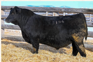
Coleman Below Zero 2106 Sire of Embryos