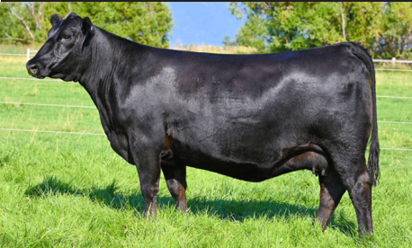
Coleman Donna 046 Flush Sister to Dam of Embryos