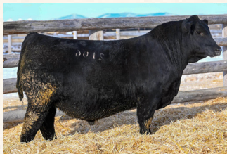
Coleman Below Zero 2106 Sire of Embryos

“6206” is a very Maternal Pathfinder female that we have pulled out of production and started flushing. “6206” has an impeccable record here, calving interval of 364 on her first 5 calves, BR 5/96 NR 5/110 and YR 4/108. 6206 has always bred 1st straw AI every year of her life. Her son was one of our feature bulls in our 2022 Bull Sale and was one of the sale toppers. “6206” has proved herself the old-fashioned way, in the pasture. Her heifer calf by Triumph has been a visitor favorite here this summer. Coleman Below Zero 2106 was the $150,000 top-selling bull of the 2023 Coleman Angus bull sale and selected by Janssen Angus of Iowa, Marshall Fenner Farms of Missouri, Pinewood Farms of Tennessee and GENEX BEEF AI stud. A sure shot heifer bull with exceptional phenotype, exceptional depth of body, and represents great breed character in a well-