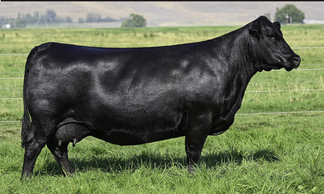
Coleman Donna 6206 Dam of Embryos

Coleman Donna 6206 x S A V Renovation 6822