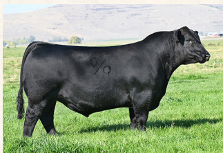
Coleman Glacier 041 Sire of Embryos

//0204" is a pathfinder female that has proven herself in the pasture. "0204" had a calving interval of 357 on her first 8 calves before we pulled her out of production to flush her. "0204" has a BR of 9/100, NR 9/109 and YR 9/107. Exceptionally good cow here, excellent udder, disposition, feet, really can't pick on her. "0204" never misses. "0204" is currently 13 years old, has a great calf at her side again, pretty special female here. "Glacier" has been a standout since he was born. Glacier's first calves are on the ground, they are very impressive as babies. Glacier has the best feet I've ever seen on a bull before, extremely sound, and athletic, with a great herd bull look and presence. He's the bull the industry has been looking for. Glacier's flush sisters are calving this spring, and look impressive, perfect udders, great feet, stout, with a great look. We believe it all starts with the mother cow; Glaciers Pathfinder dam is the fourth consecutive generation to make it the donor