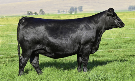
Coleman Chloe 173 Dam of Embryos