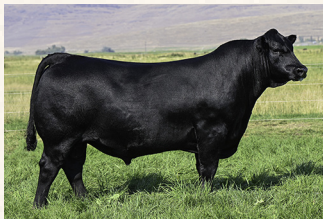
J Trademark 1037 Sire of Embryos

"7232" has production records of BR 3/96, NR 3/107, and YR 2/106. She has a tremendous herd bull on her now from our summer calving group. "7232" is throwing a tremendous amount of performance in her progeny, she has the power to change one! "7232" is extremely long, big hiped, with a beautiful udder. This Resource X Donna 714 cross has been one of the best we have ever made here. "7232" has the potential to make a big time "Herd Bull". Trademark was selected as the $165,000 top selling bull of the Cattleman's Cut Bull Sale. He is a low-birth weight calving ease bull, with double digit calving ease direct, with an outcross pedigree for our program. "Trademark" has caught the attention of cattleman from all across the country. He has tremendous performance, added muscle shape, with unique combination of phenotype, and an incredible number package. We are excited to own Trademark's dam. She was the record