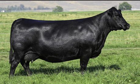
Coleman Donna 6206 Dam of Embryos

Coleman Donna 6206 x Coleman Below Zero 2106