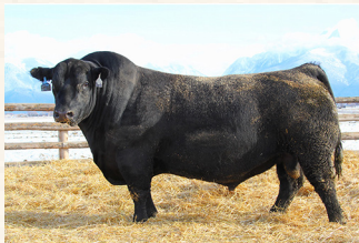
Coleman Charlo 0256 Sire of Embryos