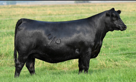
Coleman Donna 928 Dam of Embryos

Coleman Donna 928 x S A V Renovation 6822