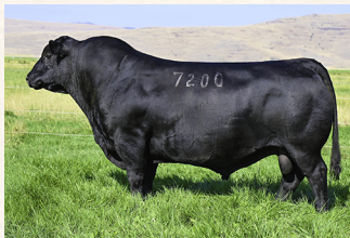
Coleman Rock 7200 Sire of Embryos

“5207” is a Pathfinder female, with a calving interval of 352 days on her first 4 calves, BR 4/95, NR 4/109, and YR 3/108. She has bred back first straw AI for the 3rd year in a row. “5207” is extremely angular, deep sided, perfect udder, and a big, long level hip. We’re overly excited for her future here. “5207” consistently has one of our best calves each year, her son by Coleman Resource 710 was one of our high selling bulls in our 2021 Bull sale. “5207” just weaned a big stout bull by Coleman Rock 7200. These embryos will be full sibs to the bull she just weaned, who is a standout. Rock was the $240,000 record selling bull in our 2022 female sale to Ingram Angus and Sandford Cattle. Demand for Rock is at an all-time high across the World right now. The cattleman’s kind is a perfect way describe the early indicators on Coleman Rock 7200. Rock would currently be one of the heaviest used sires here at Coleman Angus. He sires cattle with extra three-dimensional