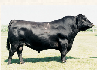
N Bar Emulation EXT Sire of Embryos

Donna 5247 is a Model Angus Cow, and Pathfinder dam is as good as it gets and as consistent of a producer that has ever been produced in our program. 5247 has tremendous three-dimensional shape, volume, muscle, and mass. Combine this with a progeny production record of BR 4/94, NR 4/111, and YR 3/113, with a calving interval under 360 days. 5247's dam was also a Pathfinder, then back to Donna 386, and Donna J311 who started was the Matriarch that started the Donna cow family here. 5247, has had numerous top selling females and sons. In our recent Bull Sale in February, 5247 had 5 different sons that sold into leading Registered operations across the country. 5247 has also had progeny top numerous other sales across the country. "Ext" needs no introduction, he's a bull that we have reached back to use on a few females here.