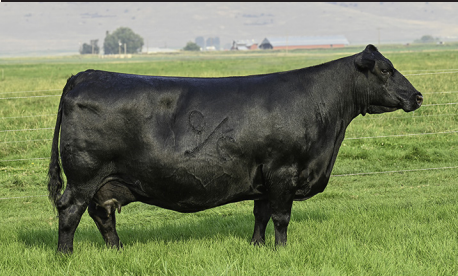
Coleman Miss Wix 0204 Dam of Embryos

Coleman Miss Wix 0204 x Coleman Glacier 041