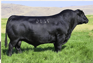
Coleman Rock 7200 Sire of Embryos

173 was the $130,000 selling foundation heifer we donated to the American Junior Angus Association. 173 was the top $M female we had in our herd when we sold her. 173 calved and has a beautiful udder, extremely wedge shaped, long bodied, with a big hip. She is a flush sister to the record selling female here, Chloe 9275. We feel 173 has a very bright future ahead of her. Big time mating here! Rock was the $240,000 record selling bull in our 2022 female sale to Ingram Angus and Sandford Cattle. Demand for Rock is at an all-time high across the World right now. The cattleman's kind is a perfect way describe the early indicators on Coleman Rock 7200. Rock would currently be one of the heaviest used sires here at Coleman Angus. He sires cattle with extra three-dimensional shape with added performance in the right size package. His offspring have