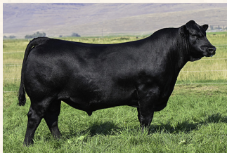
J Trademark 1037 Sire of Embryos

“7181” is a Pathfinder female here, with a calving interval of 3/360, BR 3/98, NR 3/ 107, and YR 1/ 106. “7181” has been a visitor favorite since she was a calf here, extremely deep bodied, big hip, with a beautiful udder. “7181” is the kind of females that made “Charlo” famous. 7181 has been extremely productive here, her second calf was one of the featured “Summer” heifers last falls in our female sale and brought $24,000. Her third calf was a $21,000 feature in our recent female sale, and a visitor favorite all summer. We don’t sell many embryos out of this female, so pay attention here. Trademark was selected as the $165,000 top selling bull of the Cattleman’s Cut Bull Sale. He is a low-birth weight calving ease bull, with double digit calving ease direct, with an outcross pedigree for our program. “Trademark” has caught the attention of cattleman from all across the country. He has tremendous performance, added muscle shape, with