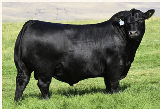
Hummel South America Sire of Embryos