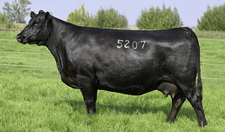
Coleman Donna 5207 Dam of Embryos

Coleman Donna 5207 x S A V Renovation 6822