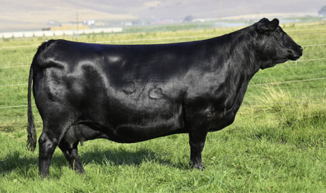
Coleman Donna 7221 Dam of Embryos

Coleman Donna 7221 x Hummel South America