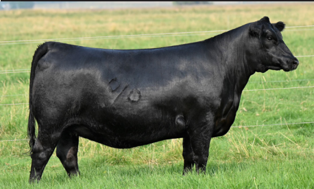
Coleman Donna 928 Dam of Embryos