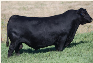
S A V Renovation 6822 Sire of Embryos

//928" has production records of Br 2/95, NR 2/110. "928" was our high selling bred heifer in our 2020 female sale. Her Dam, "787" is a cow we refer to as the "Sleeping Giant" here, she has become very dominant, and a visitor favorite here. We are excited to be able to get "928" back here in the program, and immediately she entered into our Donor program. "928" was a visitor favorite all summer back in 2020, and we're fortunate to be able to add her back to our program. When she calves, she will take an exceptional picture. Big time mating here! The sire of these embryos is Renovation. "Renovation" is an impressive individual with abundance of muscle, body shape, depth of rib in a modest frame size. His daughters are easy fleshing, deep ribbed, with beautiful udders. We feel "Renovation" is one of the best and most proven Renown sons out there.