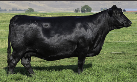
Mill Brae Iden Georgia 4086 Dam of Embryos

Mill Brae Iden Georgia 4086 x Sitz Resilient 10208