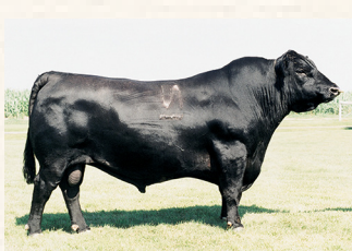
N Bar Emulation EXT Sire of Embryos

//4327" is a Pathfinder female, with a calving interval of 366 days on her first 6 calves, BR 6/97, NR 6/116, and YR 5/115. "4327" has a much power as any female we've ever had the opportunity to work with here. She is the Dam of Coleman Alamo, who was the $40,000 feature bull in our 2022 bull sale. Alamo has seen worldwide demand for his semen. "4327's" pedigree is as maternal as you can make one. Her daughter was one of our feature's last fall in our female sale, selling for $22,000 to Hideaway Cattle in MT. She can make great females and bulls, excellent mating here for sure. Very rarely have we sold embryos out of this female. "Ext" needs no introduction, he's a bull that we have reached back to use on a few females here. These females out of this mating will be "Foundation Females" to build any herd around. Extremely good mating here for sure. These are IVF embryos (Trans Ova), we are selling three embryos in this mating and guaranteeing one pregnancy. These embryos are exportable to Canada. These embryos have been sexed for females, 90-95% accurate.