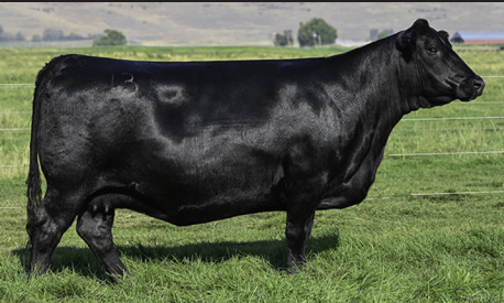
Mill Brae Iden Georgia 4086 Dam of Embryos

Mill Brae Iden Georgia 4086 x S A V Renovation 6822