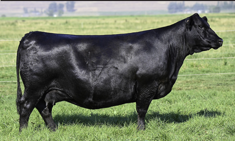
Coleman Donna 7232 Dam of Embryos