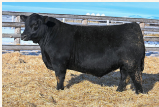
Coleman Arrowhead 235 Sire of Embryos

C oleman Everelda Entense 2406 - This Pathfinder donor female is a direct daughter of Coleman Juneau 044 and back to the foundation Everelda Entense in our program, BT Everelda Entense 613L. Everelda Entense 2406 is a flat-out producer, as she records a progeny production record of BR 9/94, WR 9/109, YR 7/105, and IMF 2/110, with a calving interval of 9/365. Ingram Everelda Entense 7621, a daughter, sold one-half interest for $40,000 for a $80,000 valuation in the 2021 fall production sale at Ingram Angus. Through that same event she produced the top selling bull at $37,000 one-half interest for a $74,000 valuation, Ingram Intensity 0300. The sire of these embryos is Coleman Arrowhead 235. These embryos are the first to ever sell out of Arrowhead. Coleman Arrowhead 235 was the third top-selling bull of the 2023 Coleman Angus bull sale at $125,000 to Voss Angus of Dexter, Iowa. Arrowhead is as impressive of Charlo son ever to be born at the ranch and is loaded with three-dimensional shape, tons of muscle, added depth of body, in a beautifully designed, bigger scaled package. Coleman Chloe 9275, his dam, was the record selling