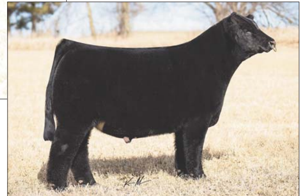
SIRE: Ratliff Jump Start 340J ET