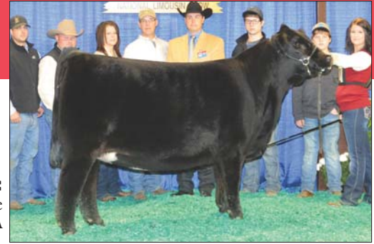
DAM: LLJB Absolute Style 3056A