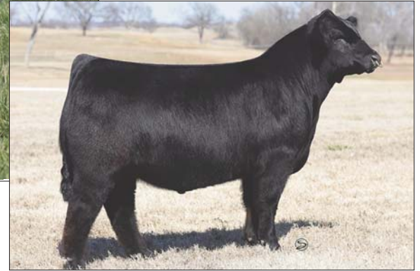
SIRE: ATNF Higher Revenue JCLC 013H