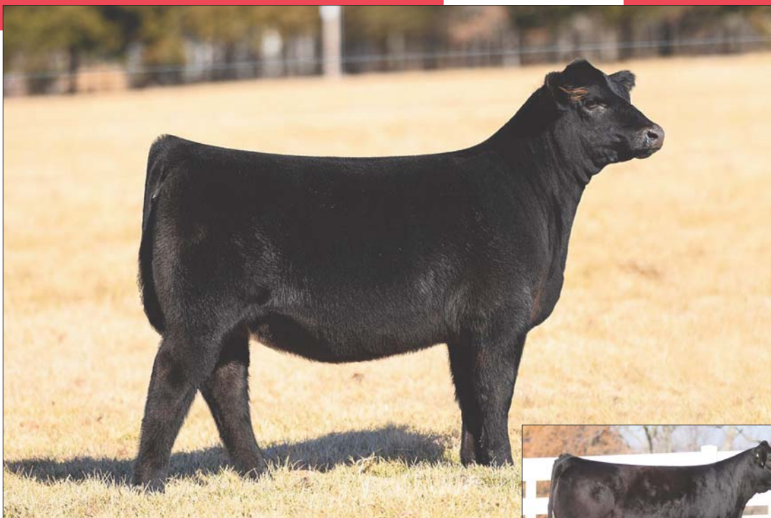
FULL SIB TO EMBRYOS: AUTO Josie 221J