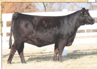
DAM: CFLX Robinette 070E