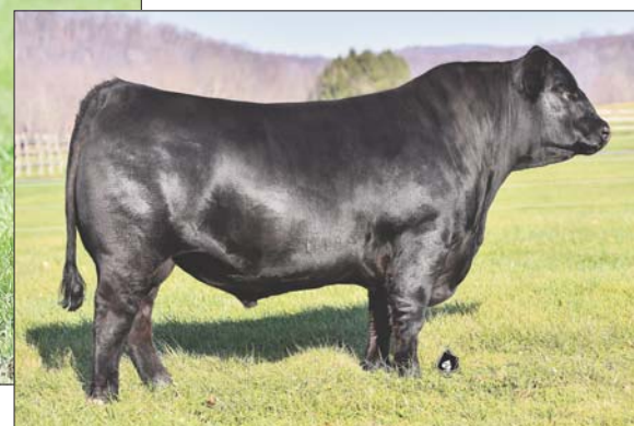
SIRE: COLE Genesis 86G