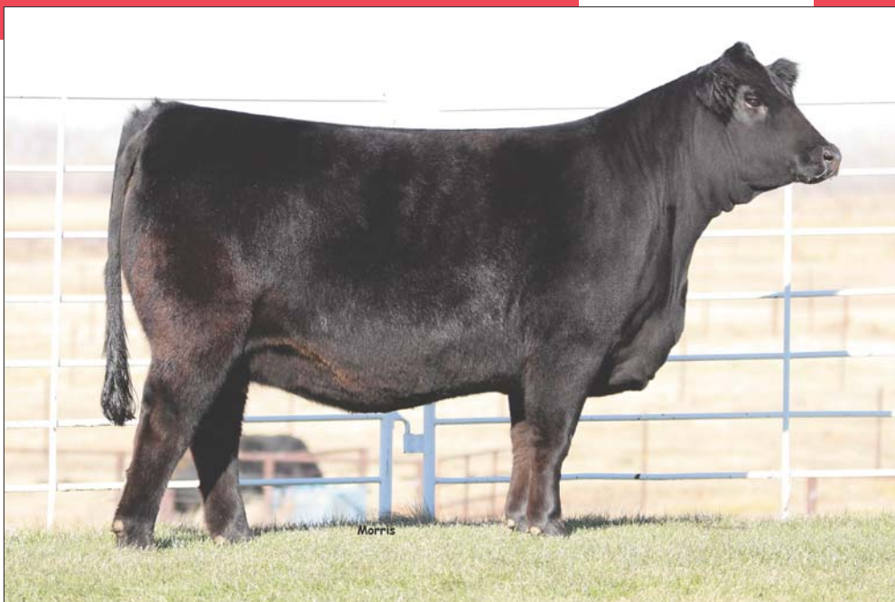
DAM: MAGS External Flame 580E