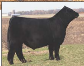
SIRE OF 32B: SSTO Guns N Roses 9408G