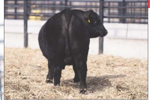
LOT 31: VOSS Pave the Way 1149