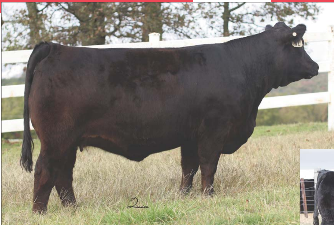
DAM: PBRS Grey 9284G ET