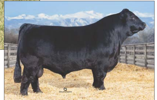
FULL SIBS IN BLOOD: ELCX Kings Landing

- IVF Embryos - FULL SIB IN BLOOD TO ELCX KINGS LANDING