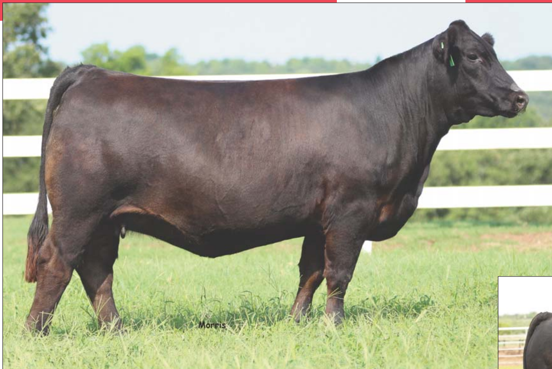
DAM: Dark Sunshine