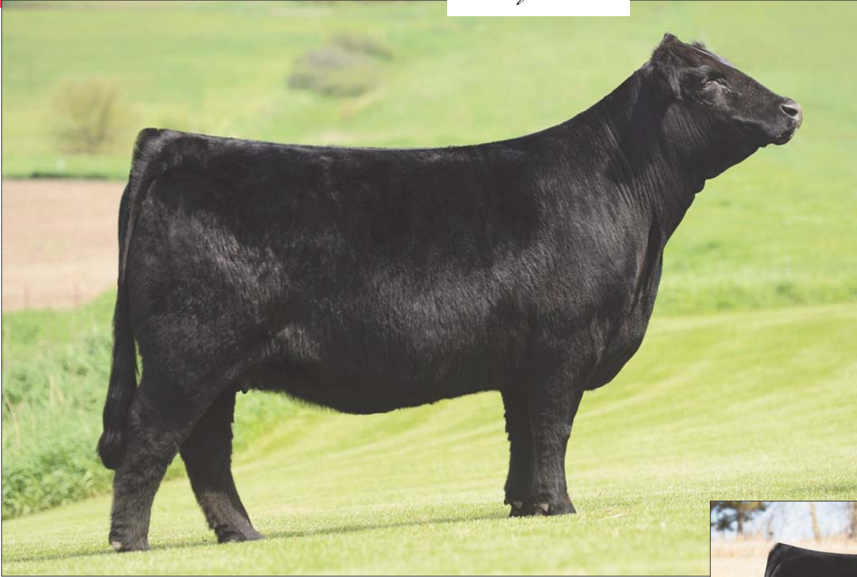
FUL SIB TO DAM: WLR Prada