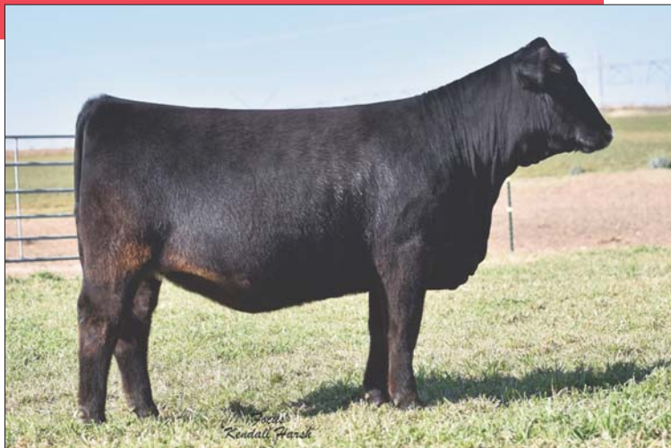
DAM: LFL Eleanor 7103E ET