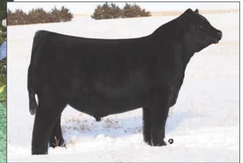
SIRE: Schilling Halas ET