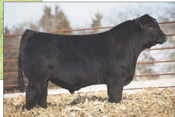
SIRE: CELL History Maker 0256H ET