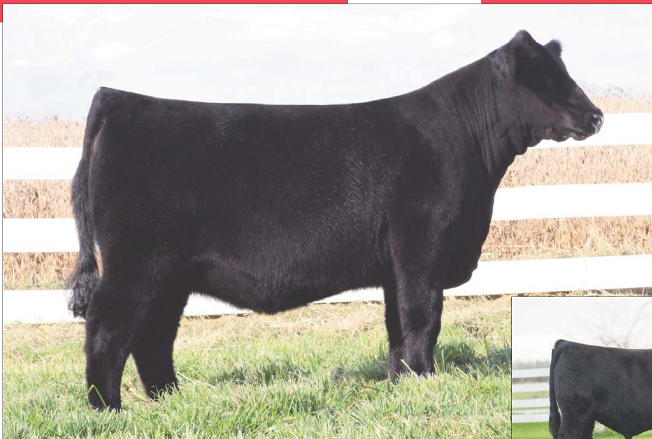
DAM: ATAK Honey ET