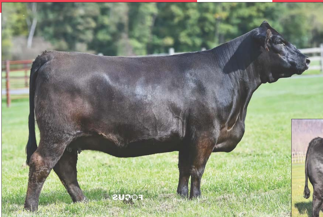
DAM: TMCK Gazpacho 743G