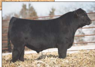
SIRE OF 32C: CELL History Maker 0256H