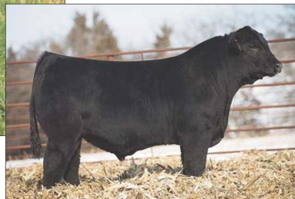
SIRE: CELL History Maker 0256H ET