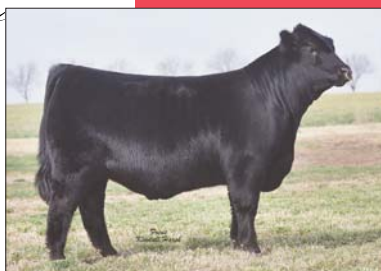
SIRE OF 33B: LFL Deluxe Edition 6029D