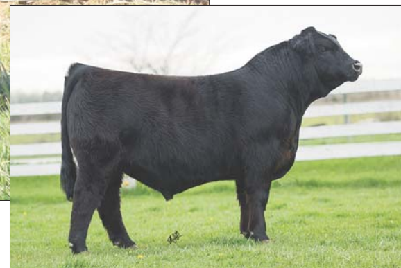
SIRE: FWLY LHC Capital ET