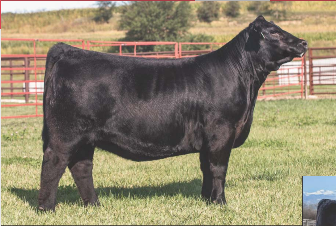
DAM: KLS SULL Gucci 205G ET