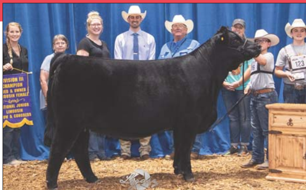
DAM: LFL Fiesta 8126F