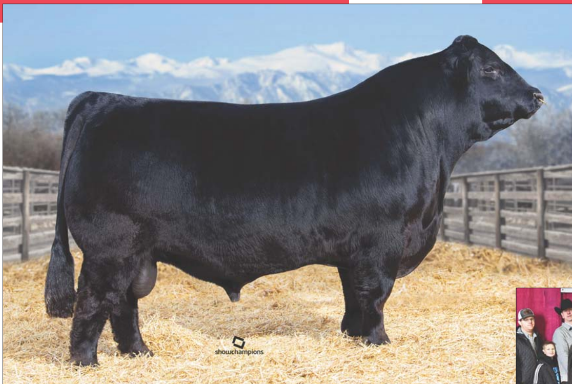
SIRE: ELCX Kings Landing 599D ET