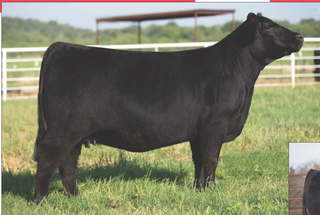
DAM: WVRL Fun & Games 410F ET