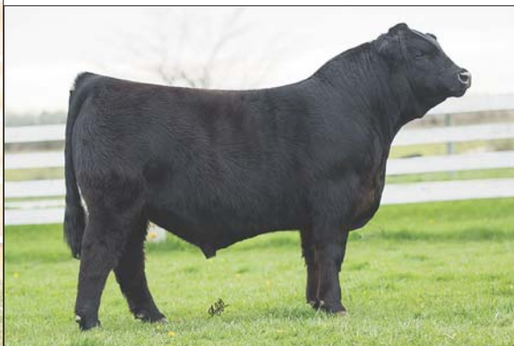
SIRE OF LOT 17A: FWLY LHC Capital ET