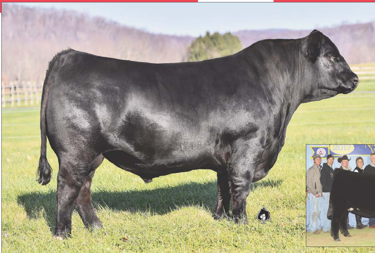
SIRE: COLE Genesis 86G