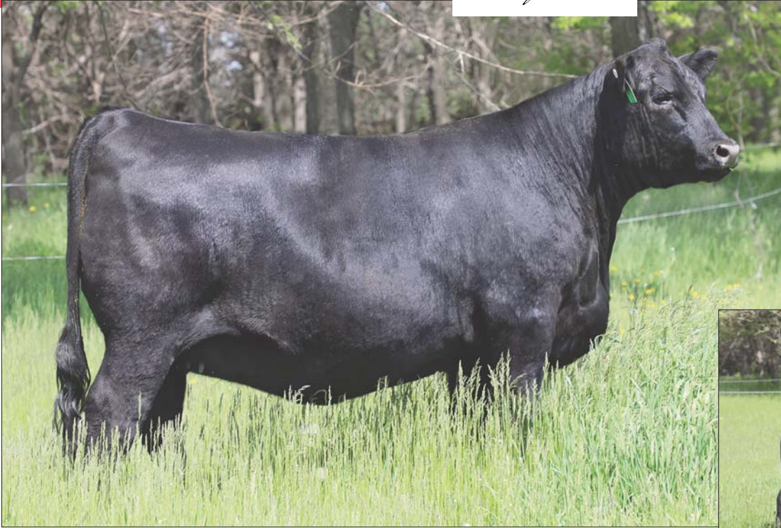
LOT 1: WULFS Jacey Rae 1168J