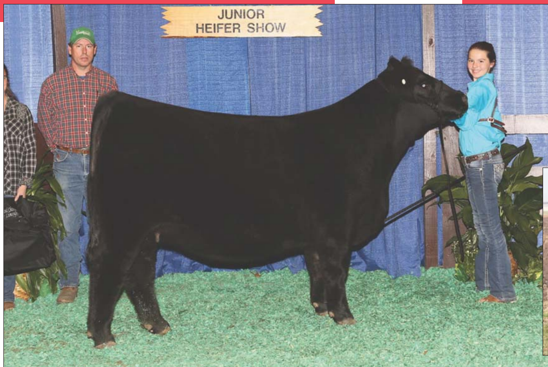
DAM: MKJM Evergreen 703E