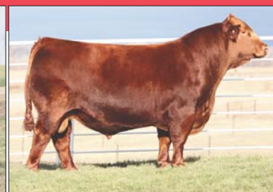
SIRE OF 32C: Wulfs Emprize 2424E