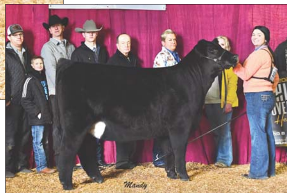
FULL SIB TO EMBRYOS: PA Cattleman's Spring Spectacular Supreme Champion Female, Ring A and Central PA Showdown, Supreme Champion Female