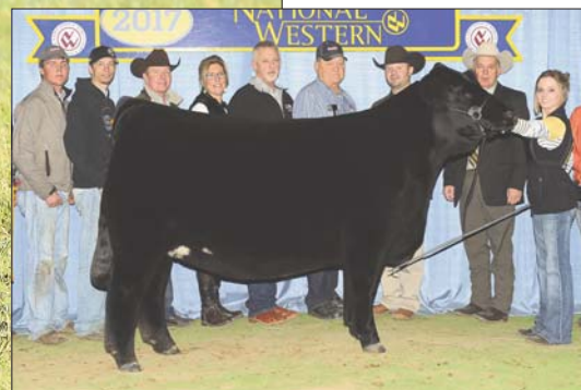
FULL SIB TO DAM: Riverstone Charmed