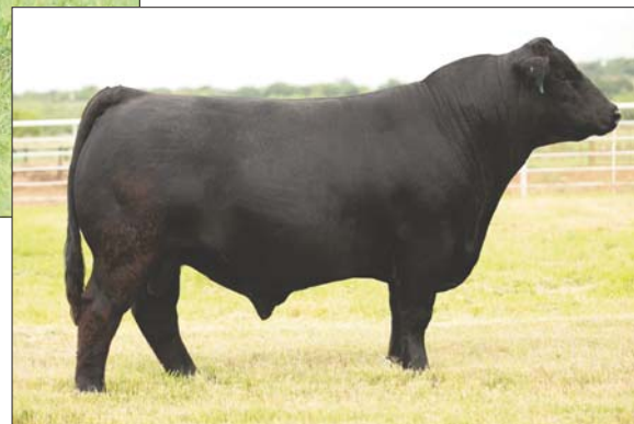
SIRE: SSTO Fortitude 8914F