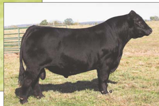
SIRE: TASF Crown Royal