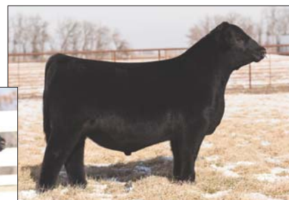
SIRE: PVF Blacklist 7077