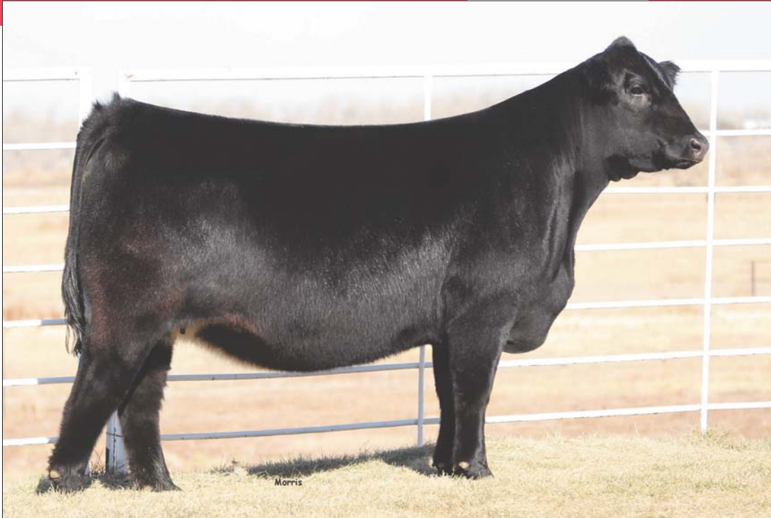
DAM: MAGS Heiress 1607H ET