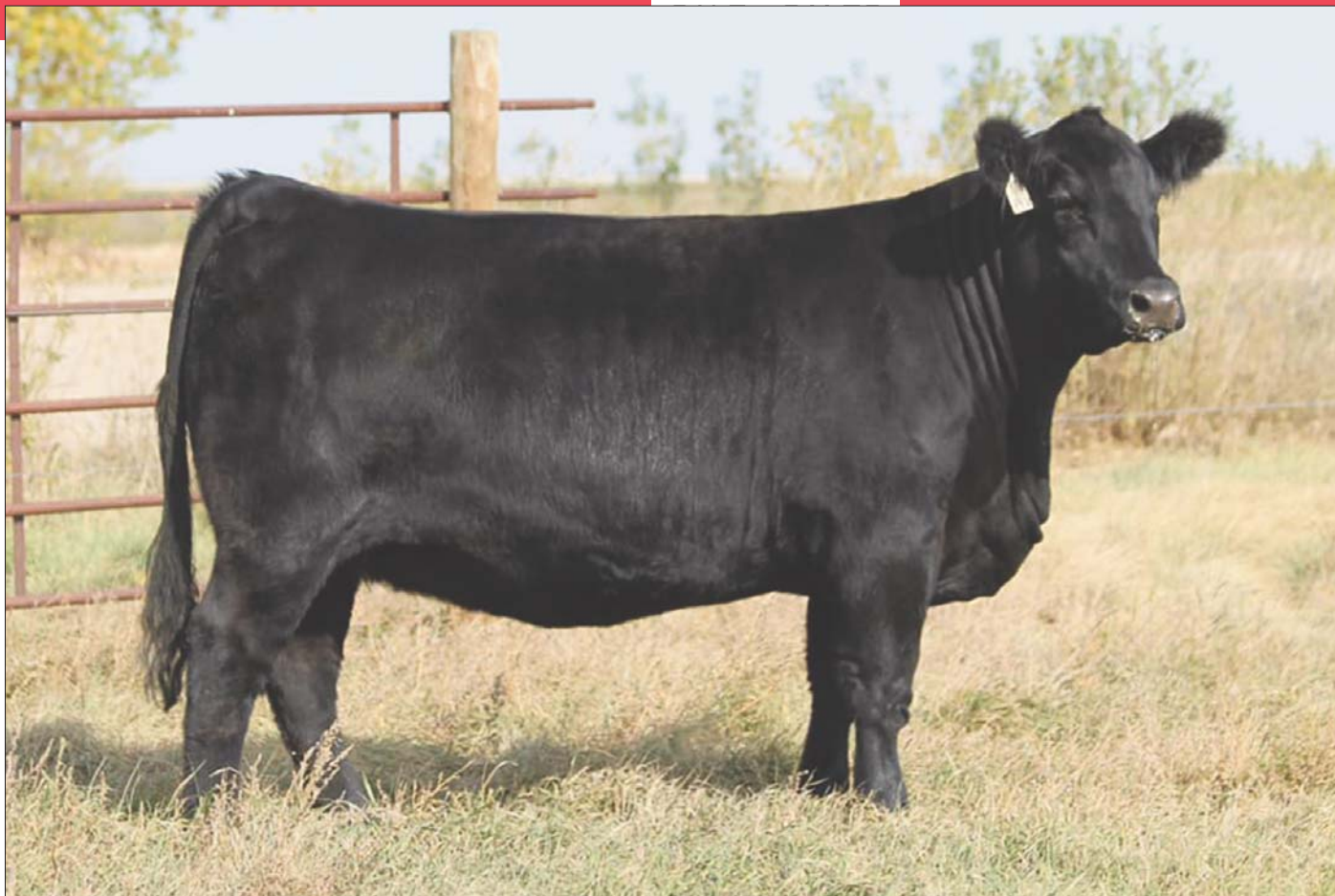
DONOR: B-Bar Georgina 17H