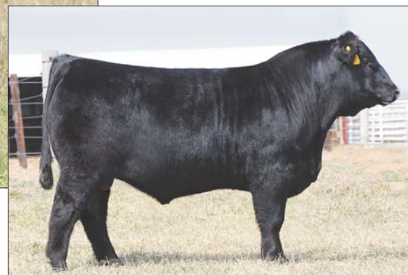
SIRE: CELL Envision 7023E