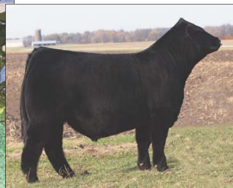
SIRE: SSTO Guns N Roses 9408G ET