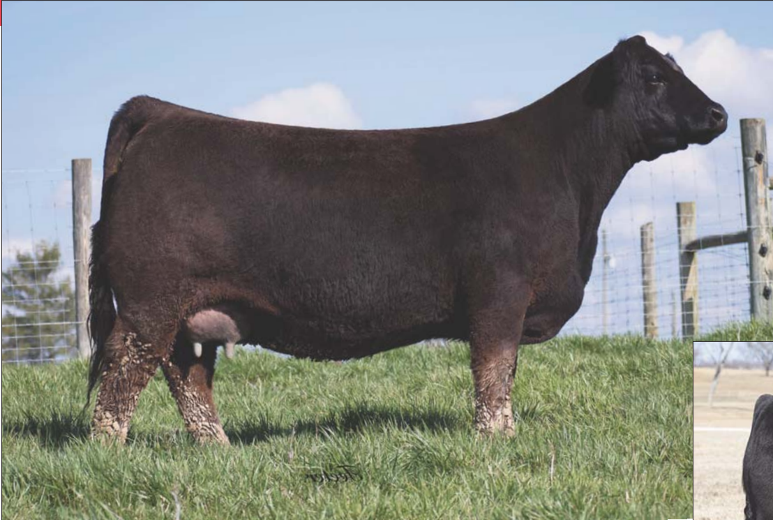
DAM: AUTO Fly Girl 252F