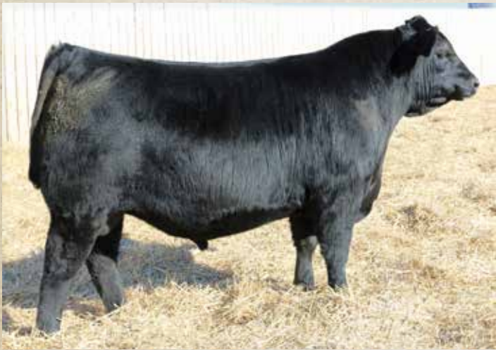
MUSGRAVE HEADWAY • Sire of Lot 5