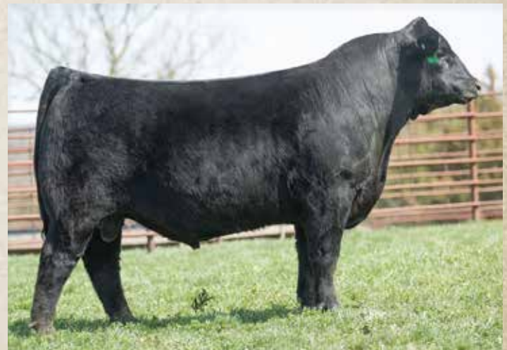
PBRB ROADHOUSE 7298E ET · Sire of Lots 3A & 3B

We had high hopes for PRBS Roadhouse 7298E when we acquired him and we have not been disappointed. CELL Homerun 0108H is typical of his progeny in that they include eye appeal, soft structure and all the utility you could ask for. From an EPD perspective, he ranks highly for weaning, milk, total maternal, mainstream terminal index and has the added bonus of being out of a top producing AHCC Cowboy Kind daughter.