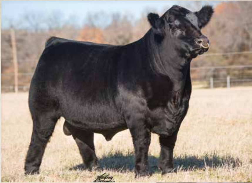
SSTO BEST BET 456B ET