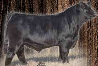
SSTO Best Bet