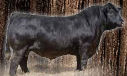
CJSL Data Bank