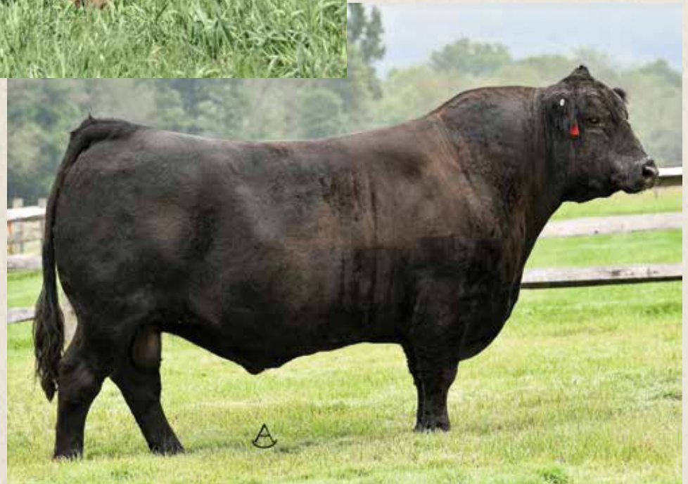
CJSL CREED 5042C Sire of Lot 61