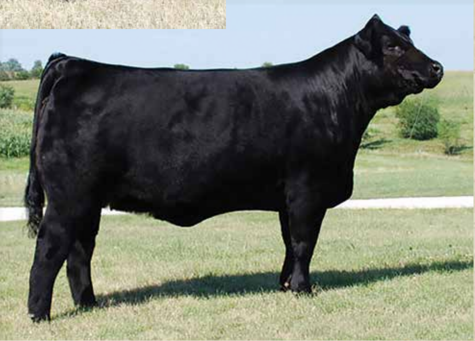
AUTO TOOTSIE POP 2272T Dam of Lot 59