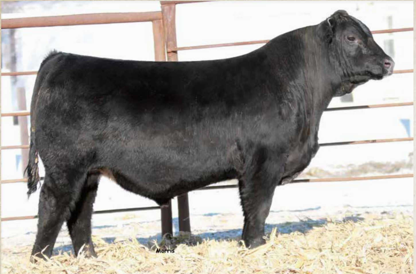
LVLS FULL DUTY 2201F • Sire of Lot 7