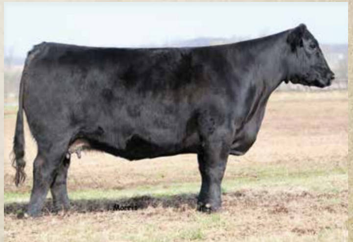
MAGS UR SALINA · Dam of Lot 1