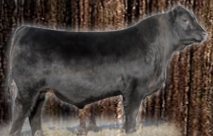
LVLS Full Duty