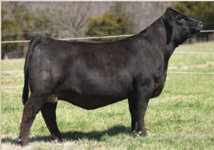
CELL MISS RESPONDER 6078D · Dam of Lots 2A & 2B