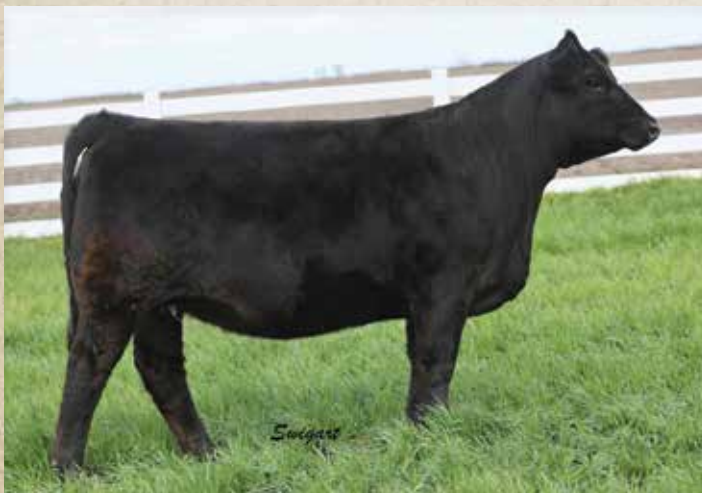
ATAK EMPHATIC • Dam of Lot 5