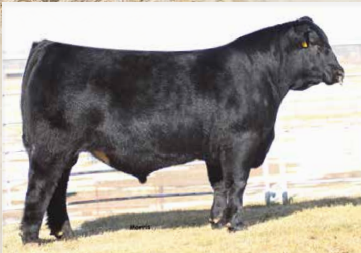
MAGS ALI · Sire of Lot 1

CELL High Roller 0239H is the result of a very successful flush designed to create high quality, predictable pedigreed cattle that are huge numbered and we feel we've achieved that goal in this herd sire prospect. Pedigree-wise, the top side features MAGS Ali, the widely popular and now deceased AI sire that's known for injecting performance to the next generation. On the bottom side is none other than our legendary donor, MAGS UR Salina, admired for the phenotypic prowess she injects into the next generation as evidence by her nearly 70 registered calves on file. When analyzing this tremendous herd-sire prospect, he is hard to criticize as he comes to you in an extremely complete package. His phenotypic superiority is bolstered by his very useful number set including top 15% or better percentile rankings for weaning weight, yearling weight, total maternal and scrotal circumference. Great herd bulls possess a rare combination of both convenience traits as well as the intangibles necessary to elevate them above their contemporaries. Study the many positive attributes he brings to the table and realize herd bulls of this caliber are not every day occurrences.