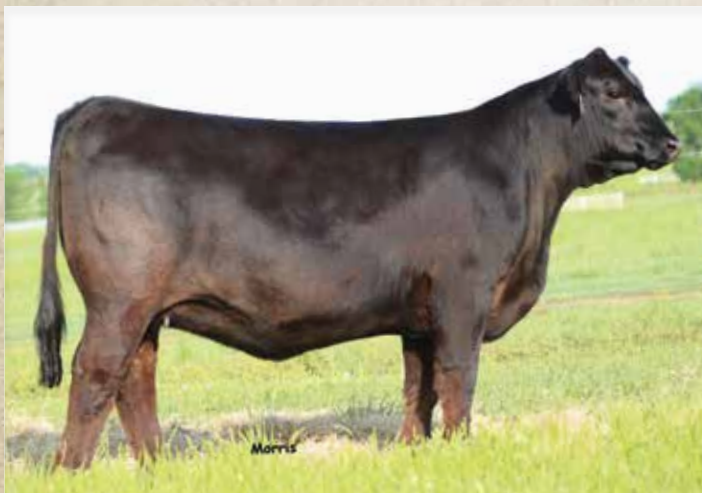
MAGS AMERICAN BEAUTY • Maternal grandam of Lot 3A