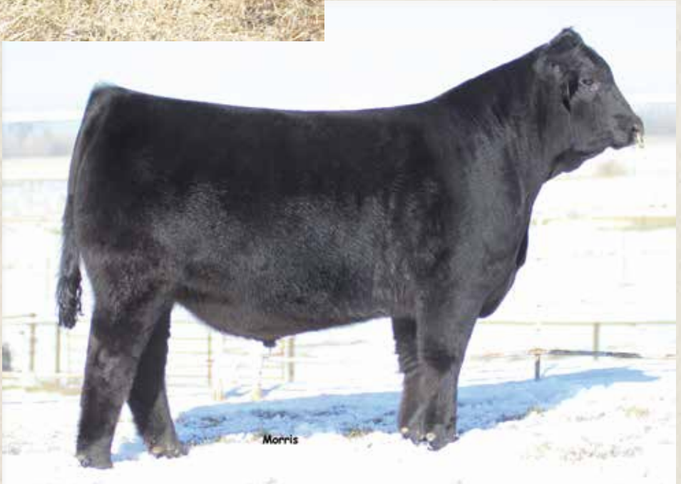
MAGS AVIATOR Paternal grandsire of Lot 57