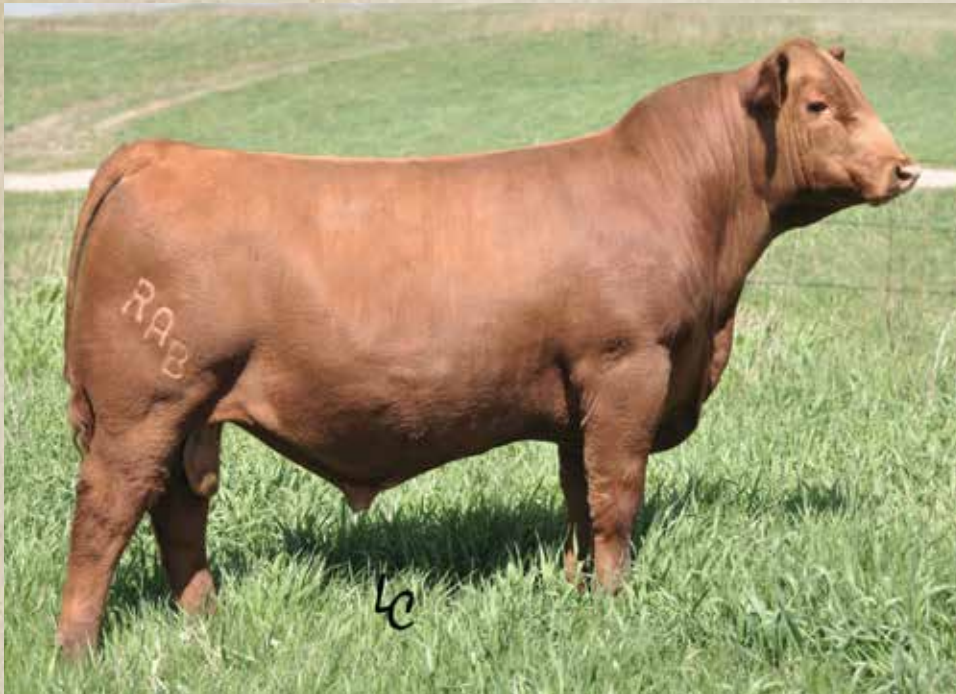
BIEBER HARD DRIVE Y120 Sire of Lots 59 & 60