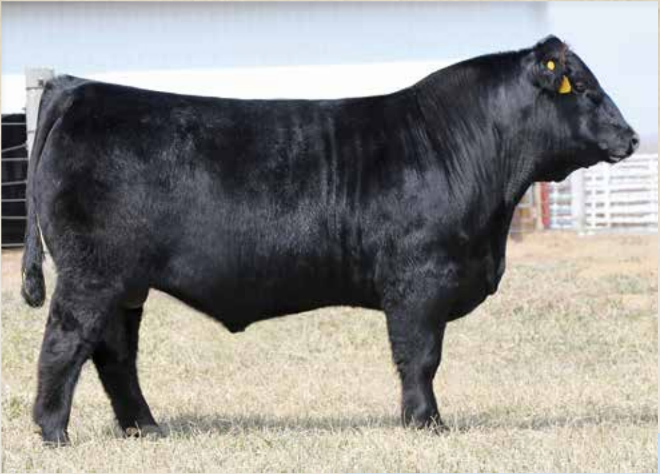
CELL ENVISION 7023E Sire of Lot 58