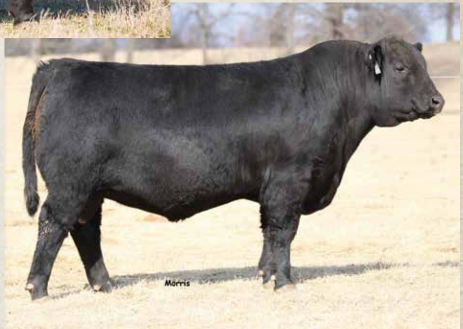
TNGC DEVOTION 643D