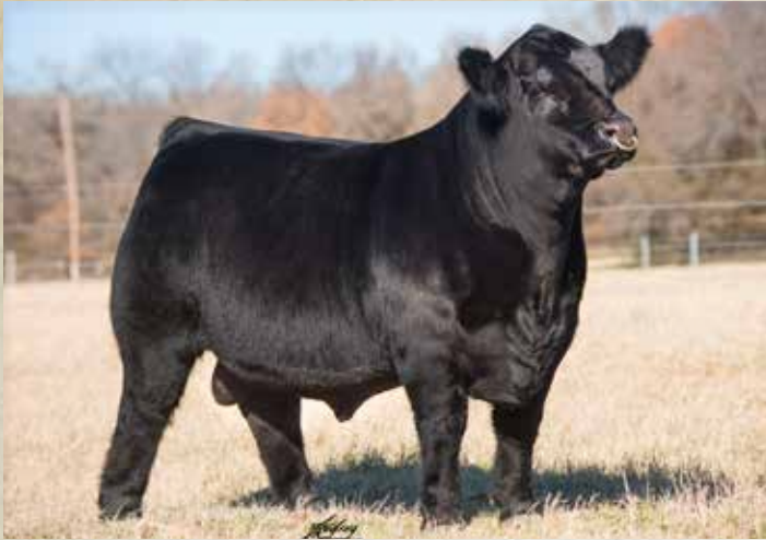
SSTS BEST BET 456B ET - Sire of Lot 70