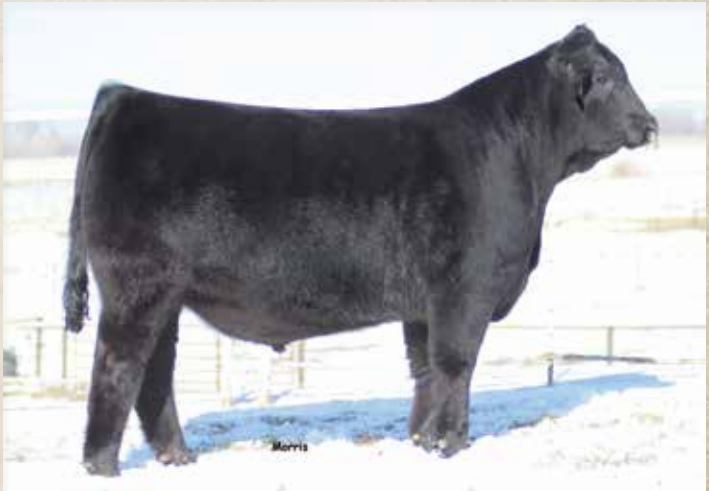
MAGS AVIATOR · Sire of Lot 6

What we have here is one bred about as royally as you can breed one. MAGS Aviator has written numerous chapters of Lim-Flex breed history, while the family tree of his dam, PBRS Zink 62Z, continues to bear fruit. This double homozygous individual also brings a host of numerical advantages to the table ranking in the top 15% or better for WW, YW, TM, CW and $MTI.