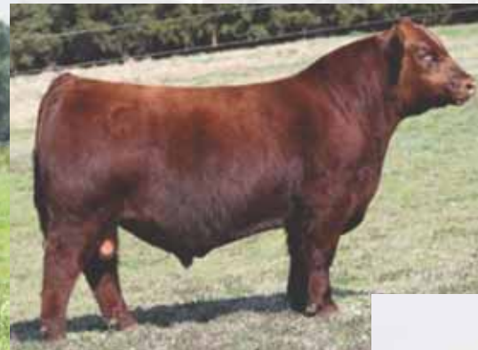
EGL GCC Red Eagle E7194, sire of Lot 8A & 8B embryos.