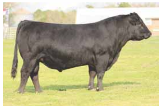
ELCX Caesar 311C, sire of Lots 65 - 70.

Here is a bull the is right from the ground up. ELCX Good Knight 811G is a purebred son of ELCX Caesar 331C. ELCX Caesar 331C is sired by RLBH Air Force One and out of the PBRs Alice 331A donor female. This bull's dam is ENGD BP Miss 8115U, a daughter of LESF Asphalt 9N. We admire this bull's added rib shape, volume, level hip and overall style. This bull brings so many positive attributes to the table and you'll want to plan to use him extensively in your program because he's destined for extreme success. He is homozygous black and double polled.