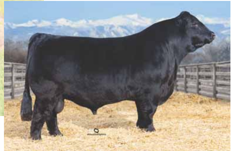
ELCX Kings Landing 599 D ET, sire of Lot 10A embryos.

60.5% Lim-Flex | Homo Black | Homo Polled | Selling 1 package of 3 embryos