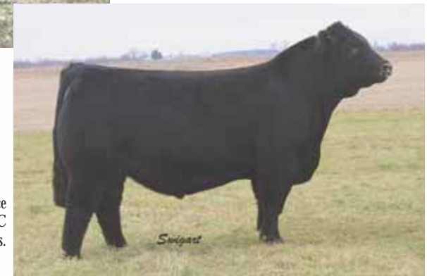
RLBH Air Force One, sire of Lot 8C embryos.

25% Lim-Flex | Red | DP | Selling 2 packages of 3 Grade 1, Conventional embryos.