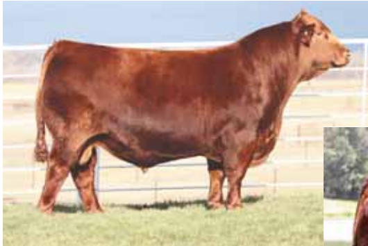
WULFS Emprize 242E, sire of Lot 9A embryos.