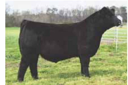
ELCX Gone Fishin 929G

Lim-Flex (34) Bull HP / HB ELCX 170Z LFM 2014858 10.05.12