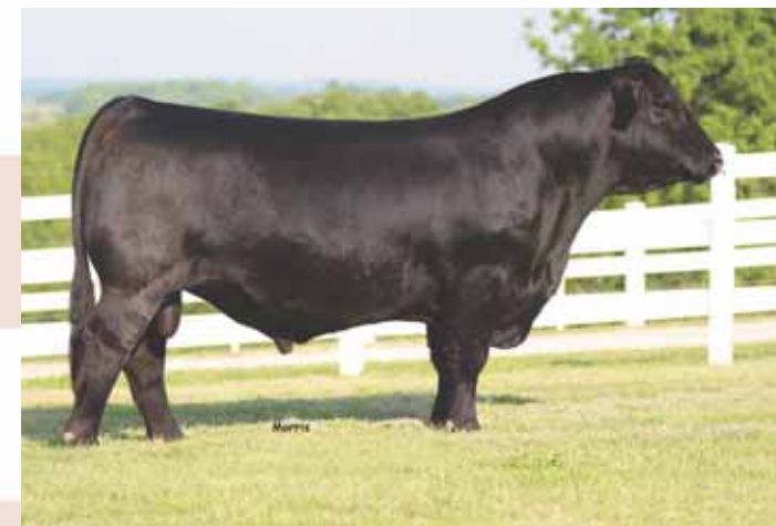
ELCX Bullet Proof 438B ET, sire of Lot 30.

You would be hard pressed to find a female that looks this stout and feminine that you can rest assured is calving ease minded. ELCX Fran 340F is a 50% Lim-Flex female sired by ELCX Bullet Proof 438B, the son of EBFL Ypsilanti 420Y and AUTO Poem 273Y. Her dam is PBRS Amy 340A, a daughter of MAGS Yip. On paper, this female ranks in the 15th percentile for birthweight. Many that view this female remark how stout made, yet stylish she is from every angle. This gal can get the job done and make your operation shine brighter than ever before. She is homozygous polled and homozygous black.