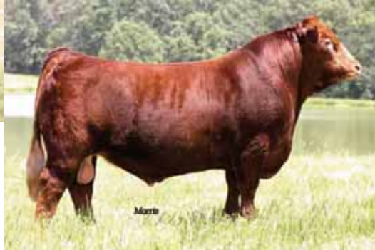
MAGS WL Usual Suspect 538U, sire of Lot 9B embryos.