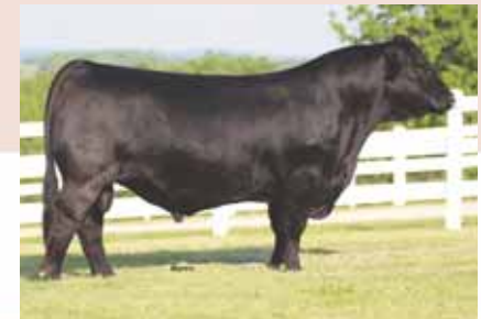
ELCX Bullet Proof 438B