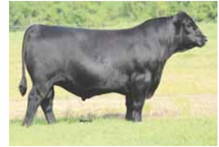
ELCX Benchwarmer 363B

Lim-Flex (56) Bull Polled / HB ELCX 331C LFM 2082808 03.12.15