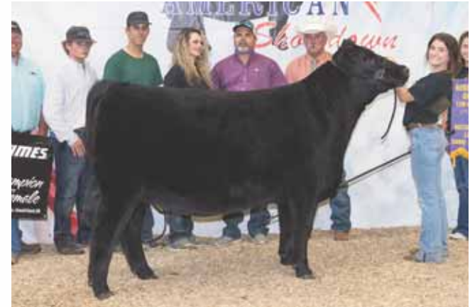
ELCX Hollywood 410H, daughter of Lot 1.

Lim-Flex (37) Cow HP / HB CJLM 410D LFF 2136006 09.16.16