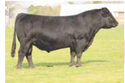
ELCX Caesar 331C

Lim-Flex (50) Bull HP / Red ELCX 769E LFM 2140148 12.20.17