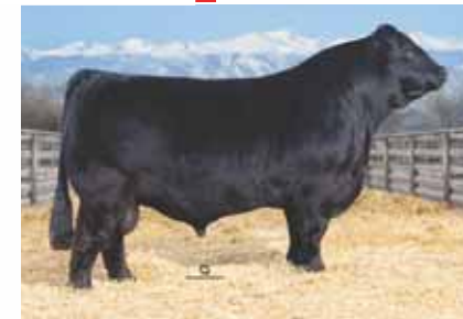
ELCX Kings Landing 599D

Limousin (95) Bull HP / HB CSM 32E CPM 4088530 01.13.17