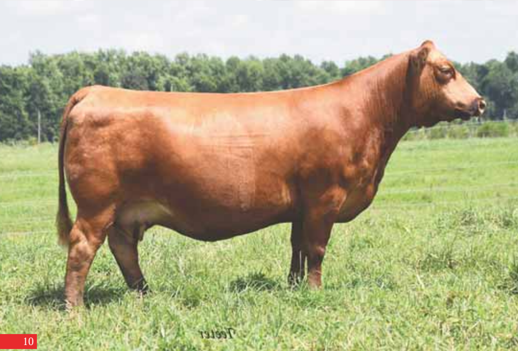
SBLX Zane, dam of Lots 8A, B & C