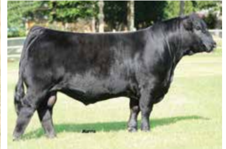
AUTO LUCKY STRIKE 118B | SIRE OF LOTS 97 & 99

Such a promising and exciting heifer calf right here, folks! AUTO Grace 267G is all that her name says and then some—a truly grand pedigree and she looks like a lady. This 54% Lim-Flex female is a daughter of AUTO Lucky Strike 118B. Her dam is AUTO Danielle 205D ET from the great AUTO Rebeca 292S female and EXAR Blue Chip 1877B. She gets it done in person and with a superior pedigree, but she also gets it done on paper—her weaning weight ranks in the top 20% of the breed and her yearling weight in the top 25%. We are so confident in this little gal and her bright future. She is homozygous black.