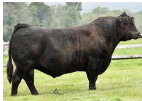
CJS� CREED 5042C