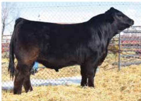
COLE CADILLAC 05C