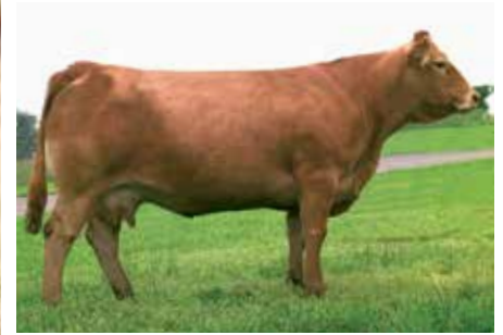
STBR DEMETRIA 669D MATERNAL GRANDAM OF LOT 38

AUTO Emery 674E is a Fullblood that'll stop you completely in your tracks. She is a maternal powerhouse and ranks in the top 10% of the breed for milk. This is your chance to have a part of this incredibly cow family in your herd. AUTO Emery 674E is an AUTO Cliff Hanger 194D daughter out of the AUTO Cierra 269C female. She's a head-turner of a female and one that is so true in her kind.