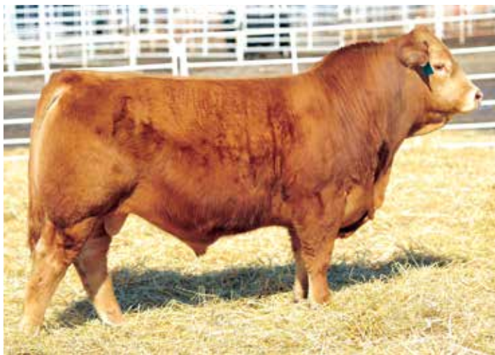
WZRK ATLAS 8012A | SIRE OF LOT 13