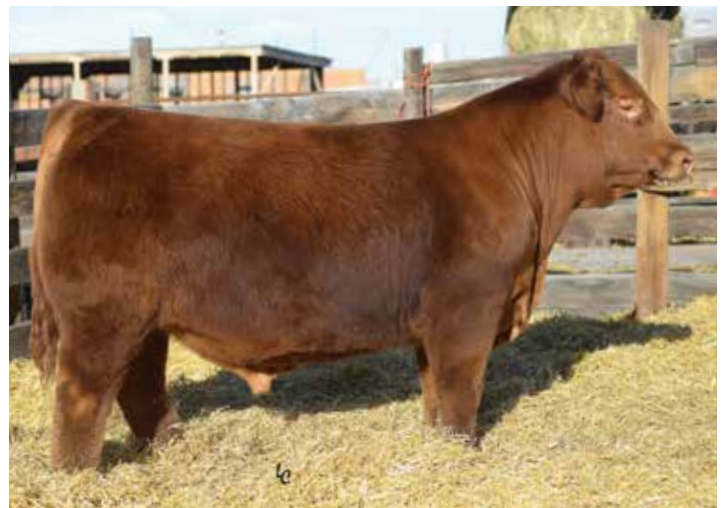
AHCC COWBOY KIND C595 | SIRE OF LOT 12

This high-performing bull records an impressive 28 figure for milk that ranks in the very top four percent of the breed and his yearling weight is in the top 10% and weaning weight in the top 15%. Folks, make no mistake if you have a set of cattle that you want to make bolder in their rib shape, thicker in their design and bigger numbered, we think he'll do just that. AUTO 143F is a 50% Lim-Flex bull that is homozygous polled and red. A son of AHCC Cowboy Kind C595 ET.