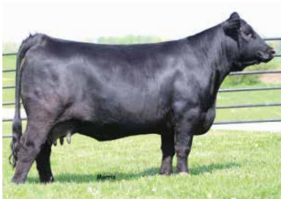
AUTO APRIL 202A | DAM OF LOT 27