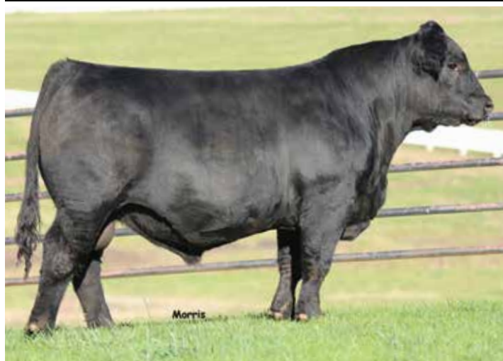
AUTO POWER PLUS 133B | SERVICE SIRE OF LOT 40

This is such a unique pedigreed heifer that is difficult to put a hole in. AUTO Ertha 693E is an AUTO Gunn Point 192Y daughter that offers so much pedigree depth it's impossible to go wrong with a descendant of the Carrouseles Peaches female. AUTO Sydney 436B ET is an AUTO King James 162Z daughter and is out of the prolific Carrouseles Peaches female. AUTO Ertha 693E is an enchantingly designed female that will be a sound, profitable investment in your operation.