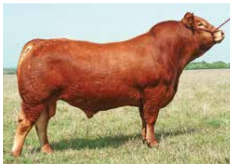
COJR HIGH TIDE 236M