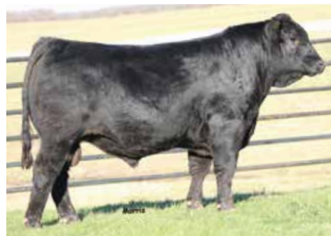
AUTO LODE UP 137B ET