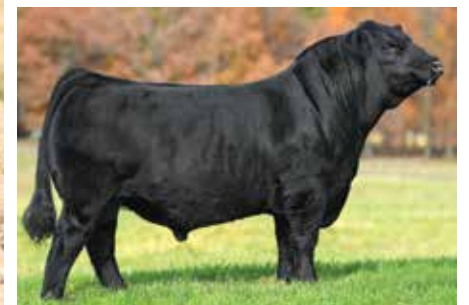
AUTO KING DAVID 120E | SIRE OF LOTS 84—88

AUTO Yukon 121G ET has premium features, trusted genetics and a wickedly impressive phenotype, just as his full-sib, AUTO Encore 119G ET. This bull has such smooth lines that are designed so intricately into quite the powerhouse of a bull, you'll fully understand why he's been a crowd favorite since he came into this world! Just look at how handsome and smooth he is in his front one-third, his powerful stride and impressive structure design. He's got a stellar presence and look about him—we simply can't wait to see what he can do when he goes into service.