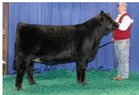
MAGS WASSAIL | DAM OF LOTS 82 & 83