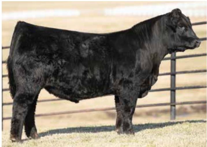
AUTO BLAQUE BLAZER 100F | SERVICE SIRE OF LOT 52

AUTO Fleece 819F is a female that has limitless potential—she is attractive patterned, smooth in her lines and flexible in her movement. A purebred that is going to be a maternal powerhouse of a female when she is in production—her milk EPD is a 28 that ranks in the elite top three percent of the breed. She is a daughter of AUTO Gunn Point 192Y, the son of LH Rodemaster 338R and from the female Ava Jo DHVO 721R, the dam of the highly popular DHVO Deuce. Quality runs deep in this one's pedigree and phenotype—she's one to have circled in your catalog for sale day.