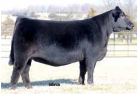
AUTO BLISS 265Y | DAM OF LOT 1

This is a remarkable young herd-sire prospect who has tremendous muscle expression, a big square hip, huge bone and a massive top. AUTO 132F is a MAGS Cable son and from the LH U Haul daughter, AUTO Bliss 265Y, the $30,000 donor for Lawrence Family, Diamond Hill, Hall Cattle and Coyote Hills. You'll want to retain almost every calf out of this guy because they'll be keepers to build a powerful herd around. This bull offers such breeding versatility being a 57% Lim-Flex and from such exceptional cow families. His phenotypic design will impress even the most critical eye. 4x4 posts a 0.38 figure for marbling that ranks him in the elite 5%.