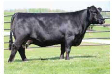
PBRS DUTCHES 790X | DAM OF LOT 94

This gal has what it takes to rise to the top of the most astute cattleman's program in a hurry. AUTO Gift 288G is another fancy daughter of MAGS Aviator and out of the AUTO Donella 210D ET female. Donella is the EXAR Blue Chip 1877B daughter from the AUTO Gemini 248T donor female. AUTO Gift 288G is a 54% Lim-Flex female that is homozygous black and homozygous polled.