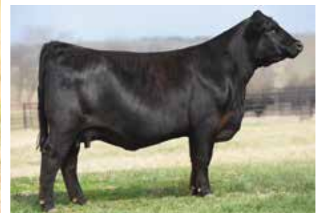
AUTO DANIELLE 205D | DAM OF LOTS 97 & 98

This female will truly brighten anyone's program with her prominent look and poise, especially when she's on the move. AUTO Glory Girl 274G is out of AUTO Lucky Strike 118B and AUTO Danielle 205D ET. She is a 54% Lim-Flex fall heifer calf that ranks in the top 20% of the breed for her weaning weight and the top 25% for her yearling weight. She is homozygous polled and double black.