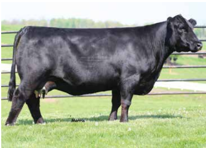
PBRS DUTCHESS 790X | DAM OF LOT 23