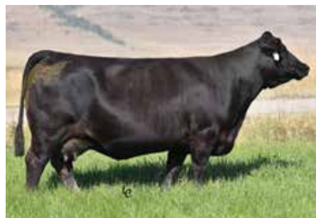
COLE MISS TRAVELER 029X | DAM OF LOT 6

If you're looking for a double homozygous herd sire that carries a combination of maternal power and well above average growth, this is the one to circle in your catalog sale day. AUTO 138F is a son of AUTO Cruze 132X and out of a Coleman Traveler 797 daughter, COLE Miss Traveler 029X. He has an impressive milk figure of 28 that is in the top four percent and a weaning weight figure that ranks in the top 15% of the breed. He is homozygous black and homozygous polled.