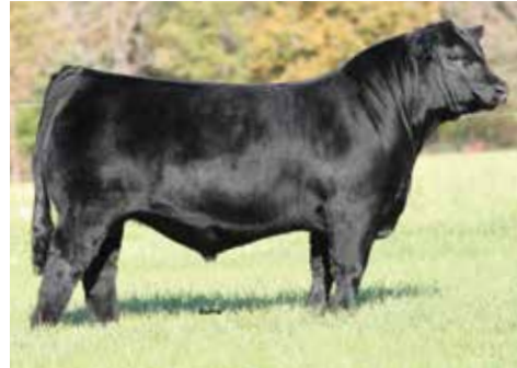
AUTO DENALI 746F