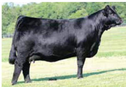
AUTO LUCKIE TOO 423Y | DAM OF LOT 100