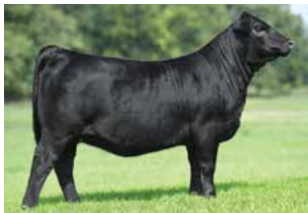
AUTO EXCITEMENT 405E | DAM OF LOT 99