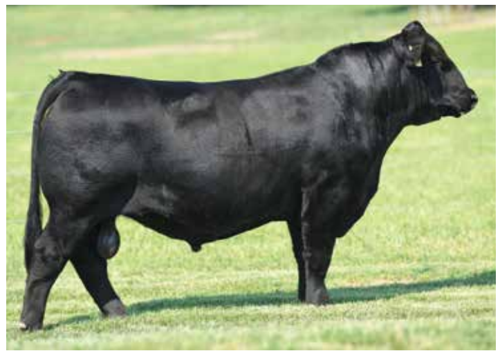
HBRL DELUXE PACKAGE 6114D | SIRE OF LOT 9

This young herd-sire prospect has the look—a strong top, capacious center body and a structural design that will keep him sound in production for years. He has all the power you could want in a bull his age and it makes him an even more impressive individual to take note of for sale day. AUTO 750F is a 71% Lim-Flex son of HBRL Deluxe Package 6114D. He is homozygous black and homozygous polled. This is an individual to take note of sale day.