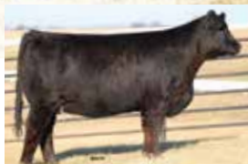
AUTO CARMELA 207C | DAM OF LOT 46

Now this is a powerfully made brood cow prospect that is bred with longevity and will produce big time. AUTO Febe 251F is a 64% Lim-Flex daughter of AUTO Lucky Guy 140D ET, a son of AUTO Lucky Strike 118B. This female is out of one of the finest Manuela daughters, AUTO Carmela 207C, who is sired by the Red Angus bull, PZC TMAS Red Zone 2795. Talk about a royally stacked pedigree! We love this female's feminine look and how she carries herself with poise and grace, just as her dam has done for so many years in production.