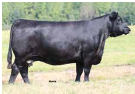
SBLX UNKNOWN 104U | DAM OF LOT 96