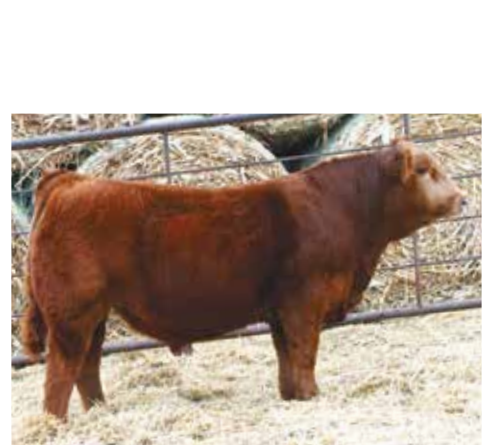
WASY BAKERS MAN 629B