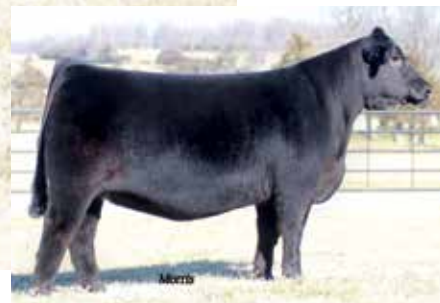
AUTO BLISS 265Y | DAM OF LOTS 63, 64 & 65