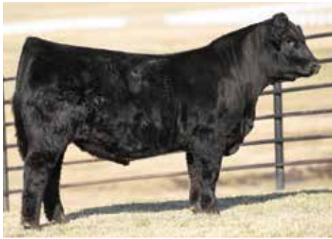
AUTO BLAQUE BLAZER 100F ET