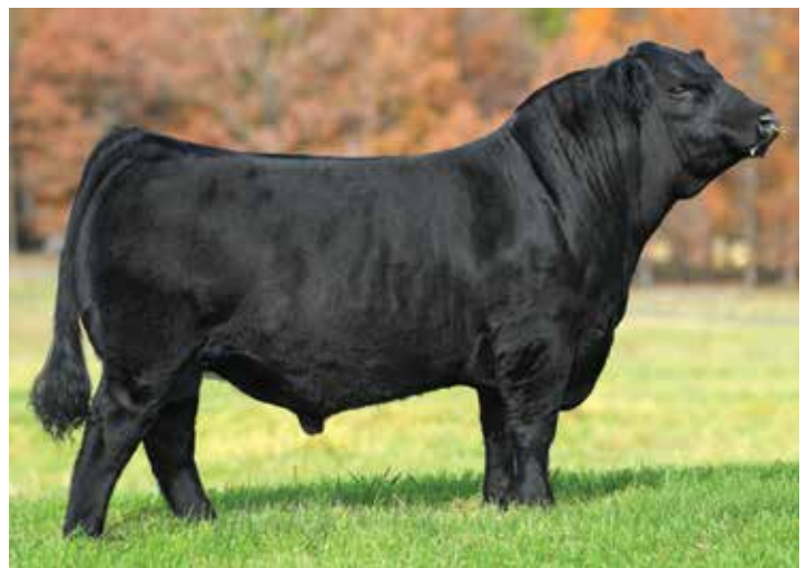
AUTO KING DAVID 150B | SERVICE SIRE OF LOT 58

Take a good, long, hard look at this exceptionally designed female that's got it goin' on. She is living proof that these genetics can get it done in so many areas. This female is bold in her forerib and level in her lines. This is a female that can catapult your herd to a completely new level.