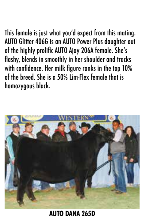
AUTO DANA 265D MATERNAL SISTER TO LOTS 89 & 90

We wish you luck in deciding which full sib to have lead on your trailer! AUTO Giada 403G is a 50% Lim-Flex daughter of AUTO Power Plus 133B ET and out of the great AUTO Ajay 206A donor. She represents proven and premier bloodlines with such a phenomenal look. She ranks in the top 10% for her milk EPD. She is homozygous black.