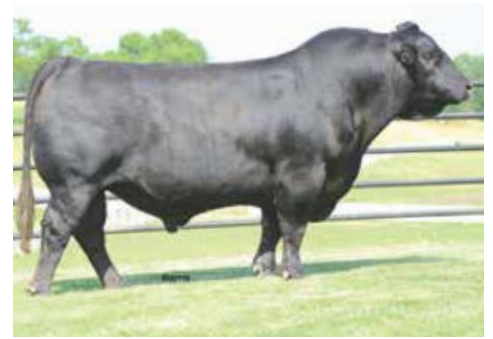
AUTO GUNN POINT 192Y