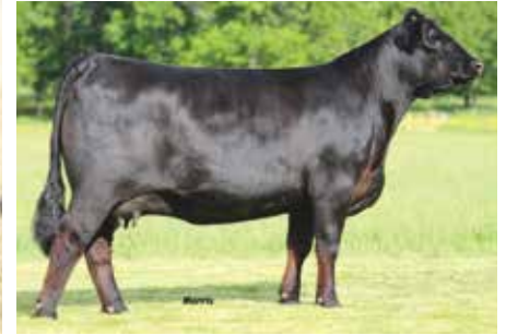
AUTO MABELLINE 267Z | DAM OF LOT 30

Due 4/3/2020 to AUTO Lode Up 137B (HP/HB) A big-bodied female who is full of powerful rib shape and superb depth of body. She's expressively muscled and truly impressive on the move. Super bold in her features, this one reads with such potential to be a surefire producer in any herd.