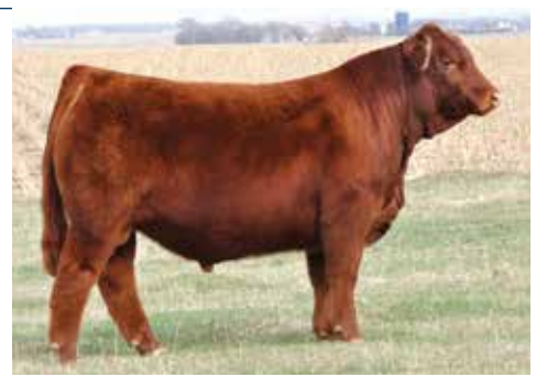
LFLC BANK ACCOUNT 701B