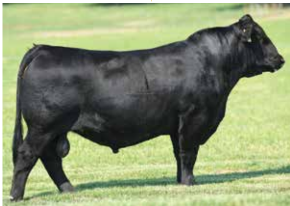
HBRL DELUXE PACKAGE 6114D | SERVICE SIRE OF LOT 27