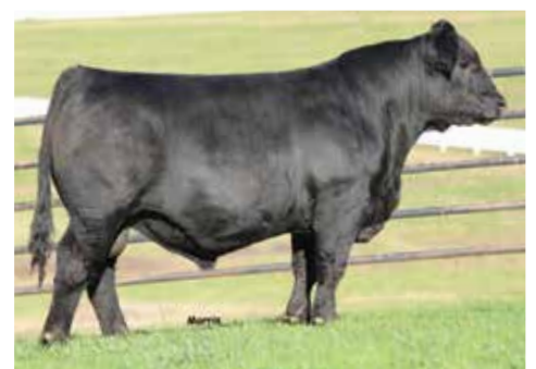
AUTO POWER PLUS 133B ET