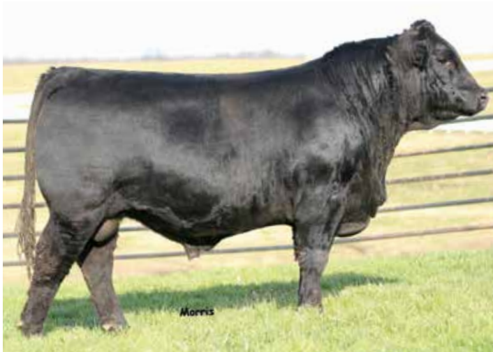
AUTO POWER LINE 135B ET | SIRE OF LOT 24