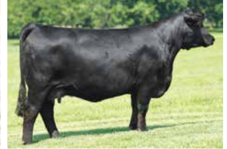
AUTO DONELLA 210D | DAM OF LOT 93