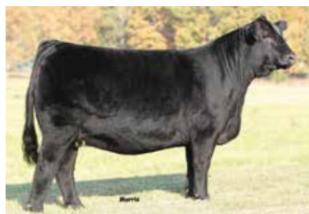
AUTO USUALLY YOUR 290A FULL SISTER TO LOT 92