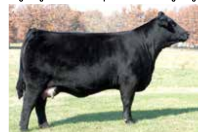
AUTO REBECA 292S | DAM OF LOTS 55 & 56

Due 4/29/2020 to AUTO Blaque Blazer 100F (HP/HB) It's all here, folks! Here is your opportunity to purchase a female right from the foundation of our breeding program. AUTO Fate 242F is as long as a freight train, correct in her lines and she's great on her feet and legs. We love her front end design and the way her neck comes out of the top of her shoulder—pure beauty if you ask us. She is a daughter of AUTO Lucky Guy 140D, a son of AUTO Lucky Strike 118B. To make things even more elite—she's a daughter of AUTO Rebeca 292S. What else is there to say about her dam other than her progeny continue to excel in all levels of the marketplace and in production. AUTO Fate 242F ranks in the top 20% of the breed for her yearling weight and in the top 25% for weaning weight.