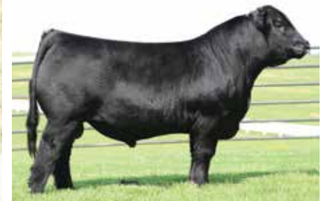
AUTO LUCKY GUY | SIRE OF LOT 4

Is a flawless structured, level made herd-sire prospect that carries a tremendous amount of rib shape on your horizon? Then AUTO Fortunate 747F is the bull for you. On paper, he offers well-above breed average growth ranking in the top 20% or better for both weaning weight and yearling weight. He is a son of AUTO Lucky Guy 140D and out of AUTO Lizzy 299B ET. Lizzy is a Carrouseles Peaches daughter out of EXAR Classen 1422B. This bull is 64% Lim-Flex and is homozygous black and homozygous polled.