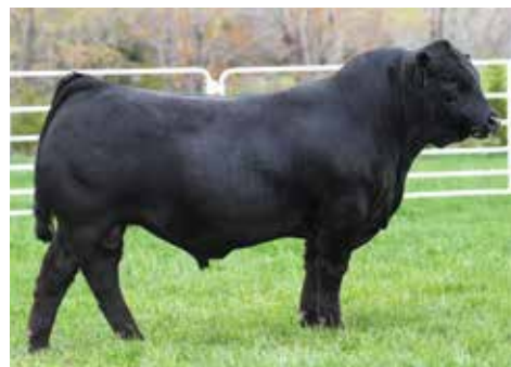
COLE FORTUNE 12F