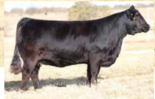
SBLX XTRA SPECIAL | DAM OF LOTS 32 & 33