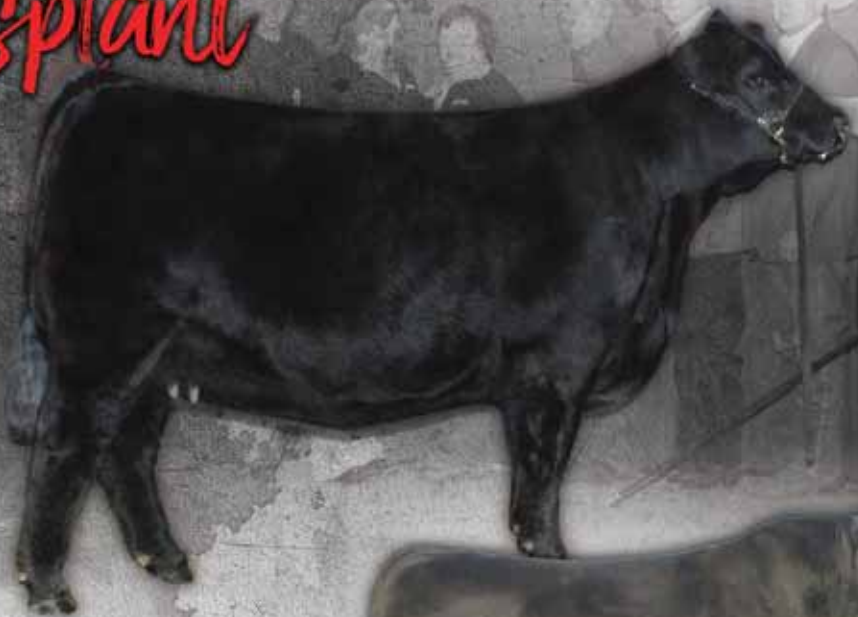
ELCX Twilight 114X