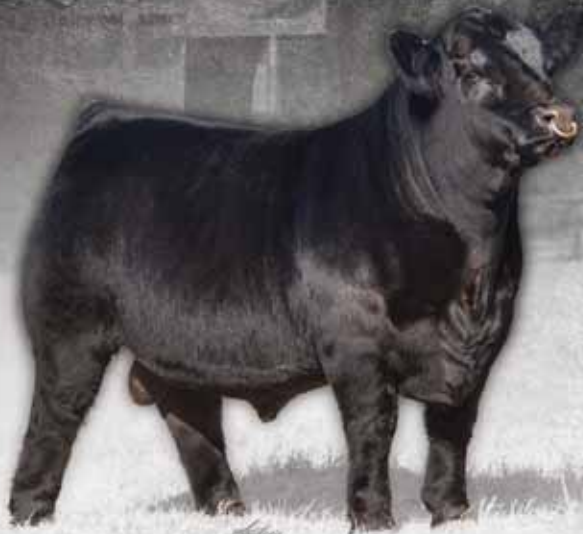
SSTO Best Bet