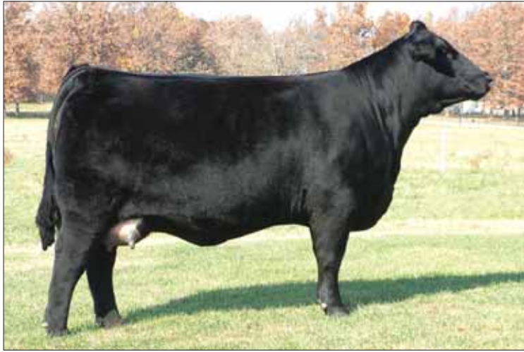
AUTO Rebeca 292S, dam of Lot 15.