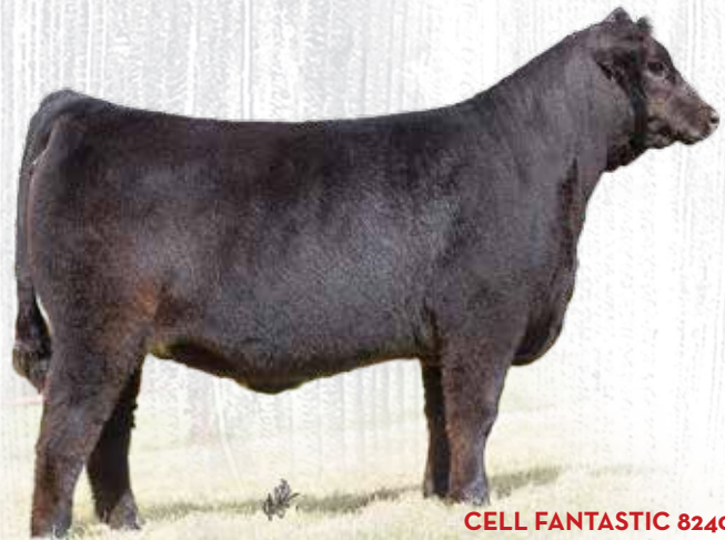
CELL FANTASTIC 8240F Sold to Armstrong Family, MN