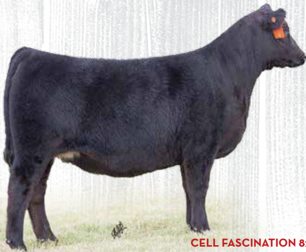
CELL FASCINATION 8231F Sold to Sullivan Family, IA