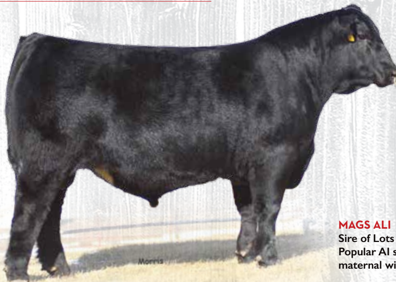
MAGS ALI Sire of Lots 46 & 47 Popular AI sire known for calving-ease and maternal with growth and performance.

Talk about predictability, CELL 7345E is a full brother to Lot 46, and is an impressive herd-sire prospect in his own right. The genetic heritage of this homozygous black, homozygous polled herd sire is unmatched in the industry, giving him the necessary predictability to sire females that will make awesome replacements and sons that will be easy to sell. Study the way this bull is put together in concert with his impressive EPD set and imagine the many ways he can make a positive contribution to your program.