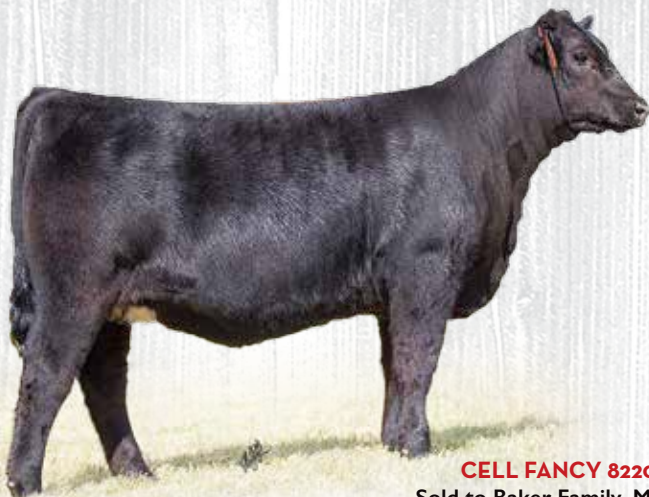
CELL FANCY 8220F Sold to Baker Family, MO

4 Flushmate Sister's Generated A Staggering $145,000!