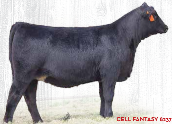
CELL FANTASY 8237F Sold to Gerkin Family, OK