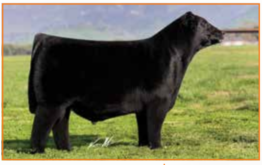
COLBURNS PRIMO 5153 | Sire of Lot 8