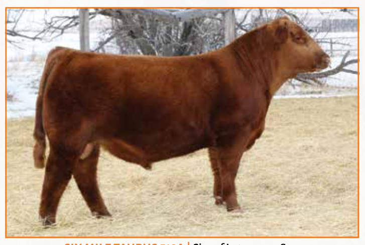
SIX MILE TAURUS 519A | Sire of Lots 49, 50 & 51