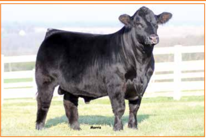
ELCX TURNING POINT 641Z Sire of Lot 7

What an exciting opportunity here! A guaranteed heifer pregnancy from one of the hottest Angus bulls siring show cattle, Colburn Primo 5153, out of SLKF Sister Act. Many will remember Sister Act from the 2014 Tulsa State Fair where she was named Third Best Supreme Heifer over all breeds. This purebred donor has extraordinary power in her makeup and lineage. Crossed with Colburn Primo should create an out-of-the-world, first-class heifer.