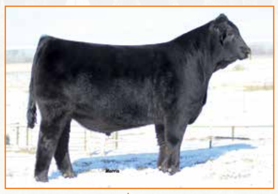
MAGS AVIATOR | Sire of Lots 33, 34 & 35

Safe bred 200 days to RLBH Days Of Thunder (LFM 2120057)