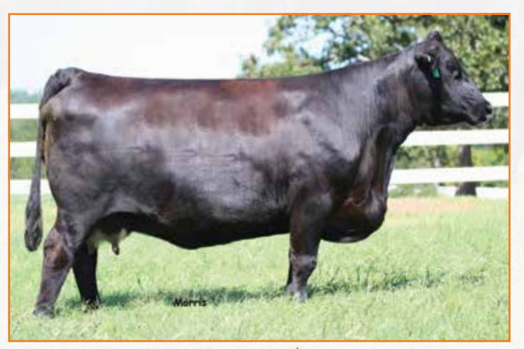
PBRS WINNING WAYS 29W | Dam of Lot 46 & 47

We have two full sisters here in Lots 46 and 47. Their sire, LVLS Cartel 1024, is one of our hard-working herd sires out EF Zen out of an LVLS Top Criteria daughter. Their dam is a perennial favorite here, PBRS Winning Ways is one of those donors you just love, a tank of a cow. She transmits that same mass and balance to her progeny. The only difference is the way they sold bred; one to Days Of Thunder and the other to the late PBRS Bunk House. Make the easy choice and take both home sale day.