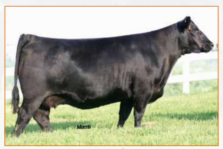
BUF EPPIONIA 7307 | Dam of Lot 12

MAGS Zenovia 3942A is a big-league female sired by the once All-American Futurity supreme champion bull, MAGS Xyloid. Her dam is a daughter of AUTO Dollar General who sires cattle the way breeders demand them out of an Angus dam. Zenovia is an eye-appealing female who is level from her hooks to pins, has a nice udder in lactation and clean fronted. She offers a sound set of numbers as well. The only choice you have to make is to which sire you'll breed her too.