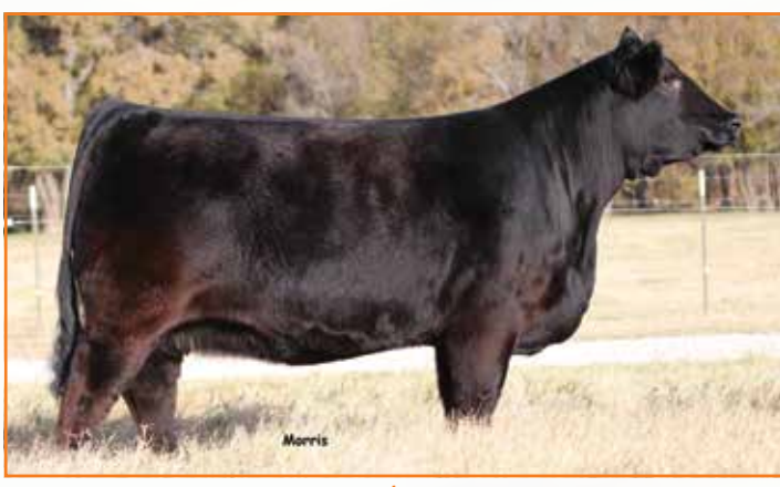
SBLX ZNOTE | Dam of Lot 27

Safe bred 150 days to RLBH Days Of Thunder (LFM 2120057)