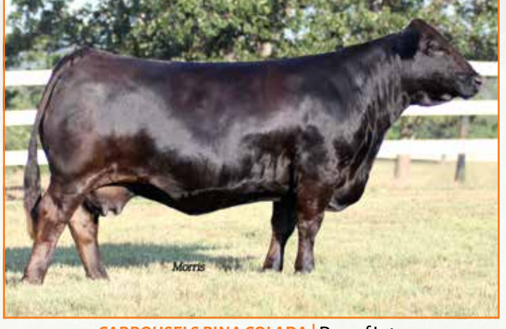
CARROUSELS PINA COLADA | Dam of Lot 1 SUNDAY, OCTOBER 27, 2019 Proof of Progress PBARS RANCH 3

BT CROSSOVER 758N MAGS STRAWBERRY DHVO DEUCE 132R MAGS UNREST