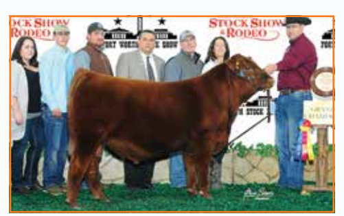
J6 MR QUICKDRAW D328 | Sire of Lot 19