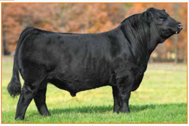
AUTOKING DAVID 120E | Service Sire to Lots 44 & 45