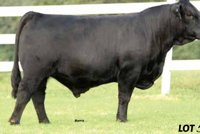
AUTO DIRECT DRIVE 107D | Sire of Lots 55, 56 & 57

We are starting the Limousin bull section with a trio of AUTO Direct Drive paternal brothers, Lots 55, 56 and 57. As you can see by the pictures, AUTO Direct Drive stamps his progeny with consistency—a lot of rib shape and rear-quarter. They are all freemoving, strong-topped and soggy middled. They have the right pieces and parts and will work in any scenario.