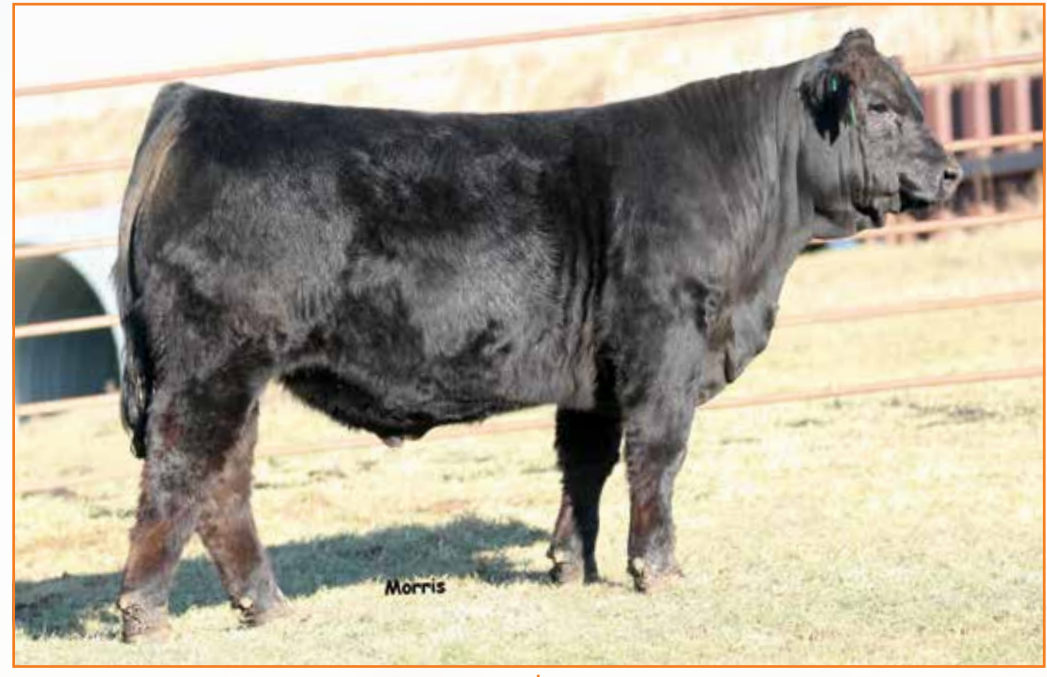
LVLS CARTEL 1023C | Sire of Lots 60—63

We are wrapping up the sale with these four sons of LVLS Cartel 1023C, our standout herd sire by EF Zen out of an outstanding LVLS Top Criteria daughter. The Cartel cattle born at the ranch display tremendous amounts of growth and performance as they mature, giving us confidence each of these sons will go on to become outstanding herd sires in their own right. Take note, each of the dams listed on this page have the good fortune of having DHVO Deuce in their pedigrees, giving us even more confidence in the producing ability of these outstanding herd-sire prospects.