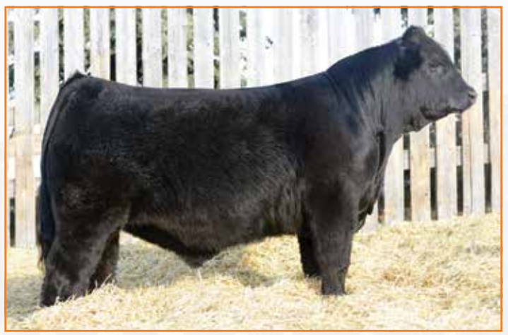
RIVERSTONE CROWN ROYAL | Sire of Lots 25—29

Riverstone Crown Royal semen packages available for $750 each for 10 units. Contact any member of the sales team.