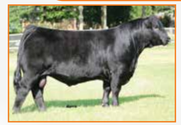
AUTO LUCKY STRIKE 118B