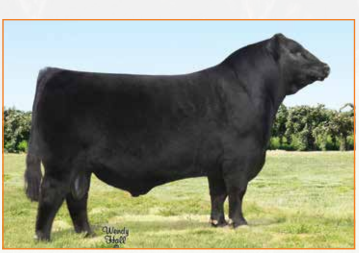
SILVEIRAS STYLE 9303 | Sire of Lot 9

Limitless future possibilities. This calf is sired by Silveiras Style out of MAGS Xray, a daughter of the past national champions DHVO Deuce from MAGS Ramada. The lineage behind Ramada is like no other. This is a strong mating that will add a tremendous amount of value and promotion to your program. Sells with her registered Lim-Flex recip, PBRS 5149C.