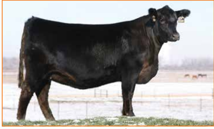
MAGS UNIVERSAL TIME | Dam of Lot 26

Safe bred 125 days to RLBH Days Of Thunder (LFM 2120057)