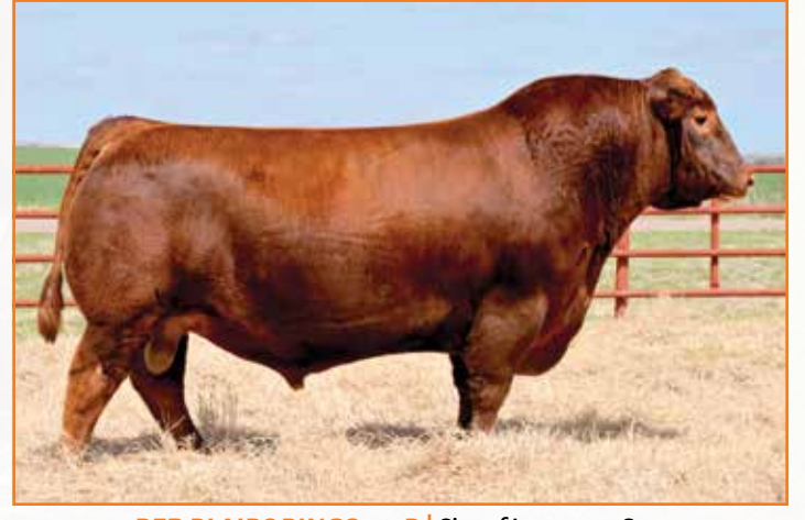
RED BLAIRS BINGO 581B | Sire of Lots 13, 14 & 15

Starting off the Red Angus bred heifer section is this daughter of Red Blairs Bingo 581B one of the most celebrated breeding sires in North America. His progeny have been in high demand due to their consistency and phenotype. PBRS Blair represents him well. Her dam, 5L VISTA 2806-3088, comes from 5L of Montana. PBRS Blair is clean in her lines and moves out freely. The calf she is carrying is from our own Red Angus herd sire PBRS Nexus 794, a son of Silveiras Mission Nexus out of a productive 16 Farms cow. PBRS Blair ranks in the top 17% for CEM, 20% for CED and top 25% for Milk. She is a paternal sister to Lots 14 and 15.