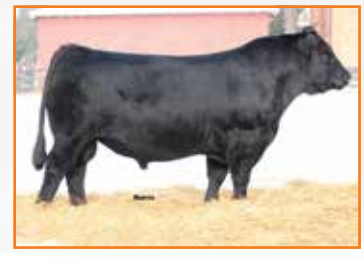
SBLX FIRST CLASS