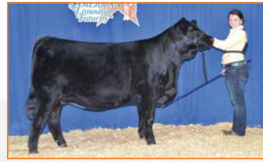
SLKF SISTER ACT 1322 Dam of Lot 8