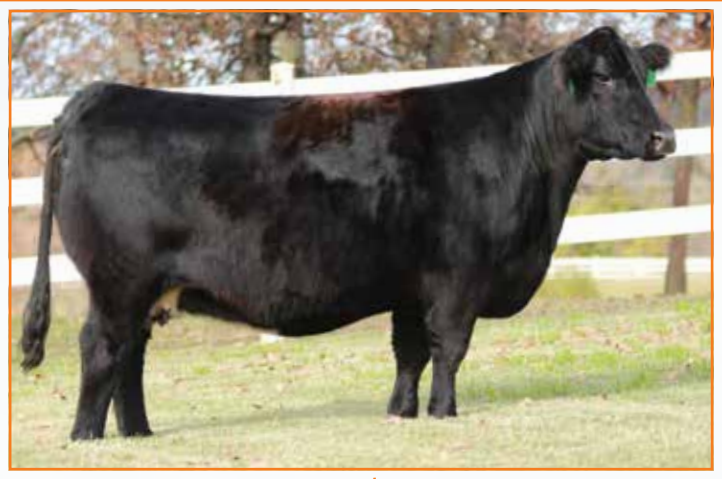
EF ZYNGA 356Z Dam of Lot 10