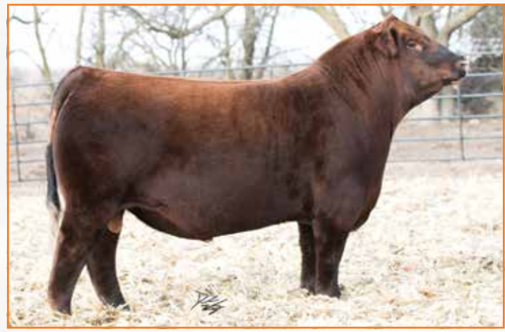
RED WILDMAN CIMARRON 605D | Sire of Lot 24

LOT 24A: PBRS 9230, 66-lb. bull calf, born 9.15.19. Sells with commercial recipient LOT 24B: PBRS 9229, 61-lb. heifer calf, born 9.14.19. Sells with commercial recipient