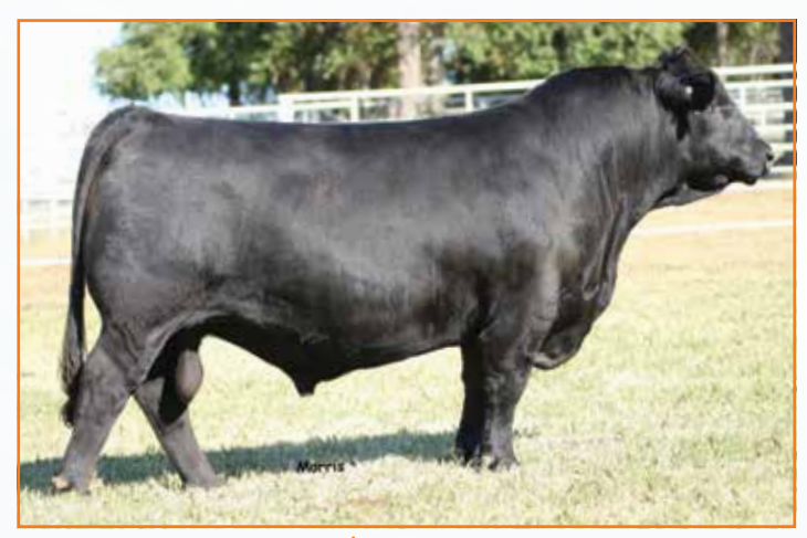
PBRS BUNK HOUSE 48B | Sire of Lot 45 & Service Sire to Lot 47

Study the pedigree and the numbers and we think you'll agree, she has it all. Being out of MAGS Eagle, a growth and carcass trait leader, and out of a MAGS Y So Tangled daughter gives you the confidence to bid until you own her. She ranks in the top 25% for eight economical traits.