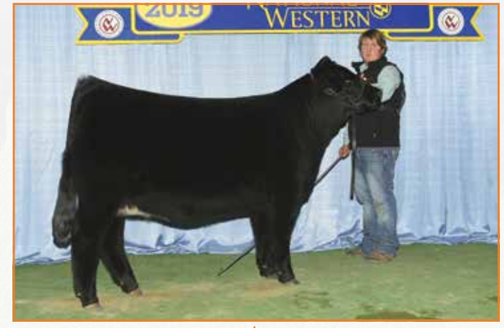
PBRS EBONY 7272E | Full sib to Lots 31 & 32 Owned by Drew Wright

Safe bred 200 days to RLBH Days Of Thunder (LFM 2120057)