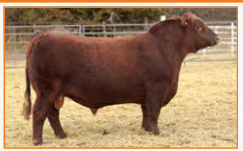
16 MR. STATE OF SHOCK D639 | Sire of Lot 18 & Service Sire to Lot 19