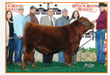
J6 MR QUICKDRAW D328