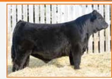
RIVERSTONE CROWN ROYAL