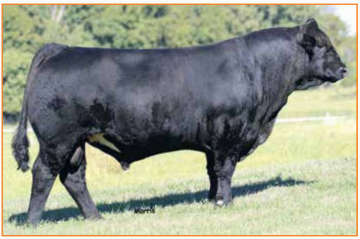
AUTO CRUZE 132X | Sire of Lots 30, 31 & 32

Here is a trio of AUTO Cruze 132X daughters—Lots 30, 31 and 32. Cruze is a bull raised in the Pinegar herd that has been a tremendous producer of champions and productive cattle. The dam of Lot 30, PBRS Dutches 790X, is one of those can't-miss donors. Check out the growth and milk this one offers. The Dam of Lots 31 and 32, EF Windsong, was a many-time champion for Rachel Booth and has proven to be a prominent purebred donor at P Bar S. We think you'll really like the females when you see them sale day. The guesswork is done, it's all bred into them.