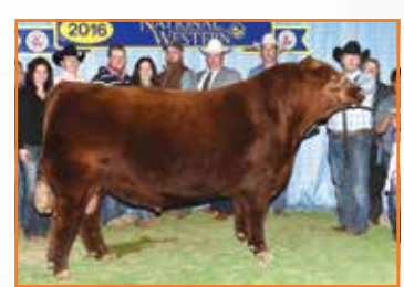
SIX MILE TAURUS 519A