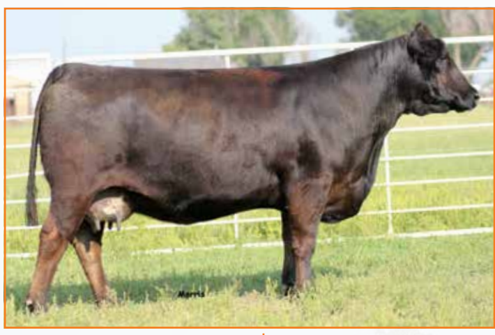
MAGS ZENOVIA | Dam of Lot 11

You get to mate her the way you want! Yes, you read that right. It doesn't get much better than that. EF Zynga 356Z is a daughter of TC Total 410 from MAGS Pretty Christine (she goes back to the original EXLR Daktoa sire). When you study her picture, you see a soggy, broody female that will make functional cattle. You won't go wrong with this investment, no matter the sire.