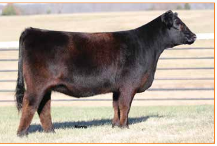
AUTO RHONDA 225C Dam of Lot 38

We have four AUTO Direct Drive 107D daughter here, Lots 36, 37, 38 and 39. Direct Drive is from the famed AUTO Rebeca 292S donor who has produced breed leaders and this son represents her well with his moderate frame and massive amount of muscle expression. Two of these bred heifers are from MAGS Colleen, a tremendous MAGS Xyloid daughter who is doing a great job. One is from AUTO Rhonda, a daughter of the legendary Manuela donor who is following in those famous footsteps. The other is by EF Up To The Challenge who traces back to the famous 231) female. These bred females are all in line numerically. Lots 36, 37 and 38 sell carrying a calf to our late herd sire PBRS Bunk House, who sired a national champion heifer.