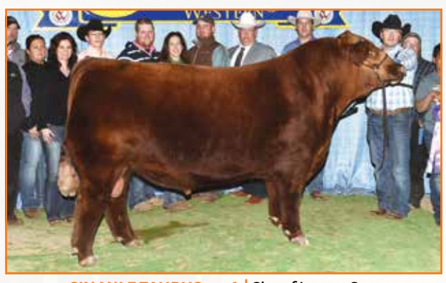
SIX MILE TAURUS 519A | Sire of Lots 16 & 17

We have a set of full sisters in Lot 16 and 17. Sired by the extremely popular Six Mile Taurus, a two-time National Western Stock Show champion who is siring cattle that work in the show ring as well as in the pasture. To say his progeny have been popular would be an understatement. They have been in high demand across the country. Their dam is from the Carrousel Red Angus program, known to be a solid producer. PBRS Reagan and PRBS Kaydee both rank in the top 2% for Milk. Both are carrying a calf by our Red Angus herd sire, J6 Nexus 131F. Don't struggle over which one to buy, take both home, you'll be glad you did.