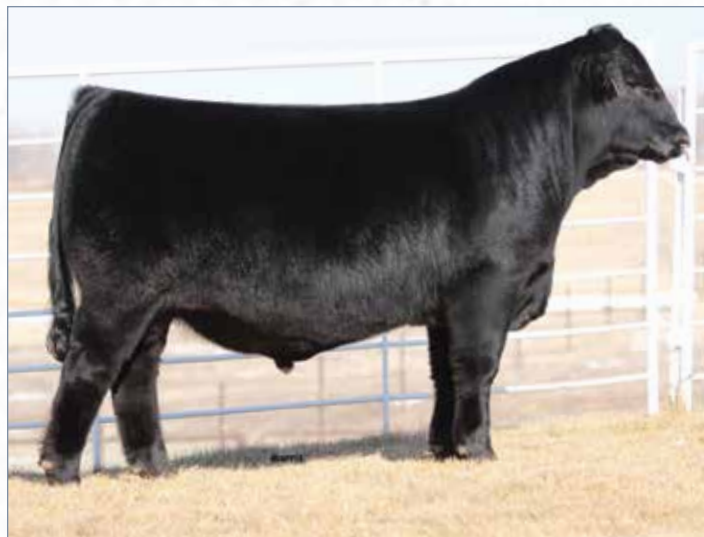
MAGS FIRESTONE 218F • Sire of Lot 3A