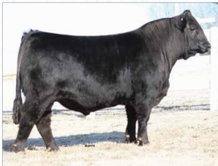
TNGC EMPIRE 736E • Sire of Lot 5C