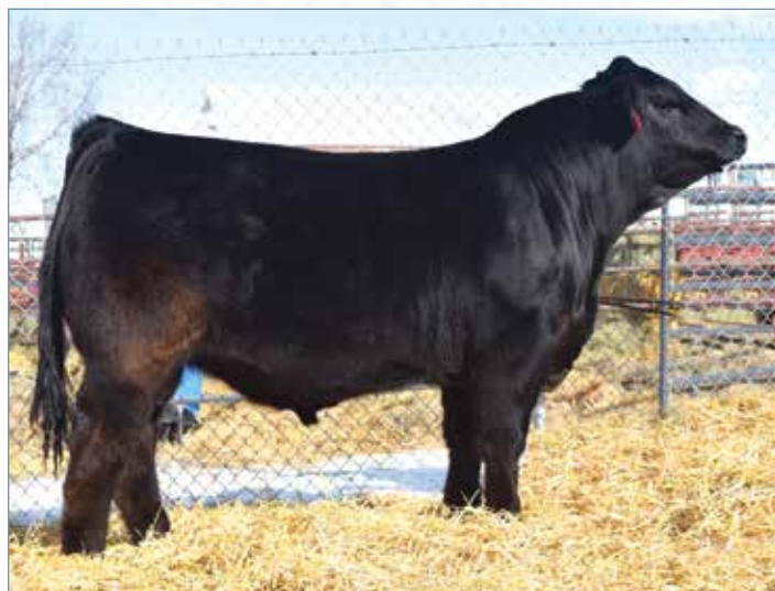
COLE CADILLAC 05C • Sire of Lot 2D