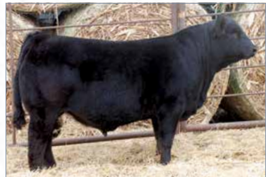
SYES BEST BUY 316B • Sire of Lot 6B