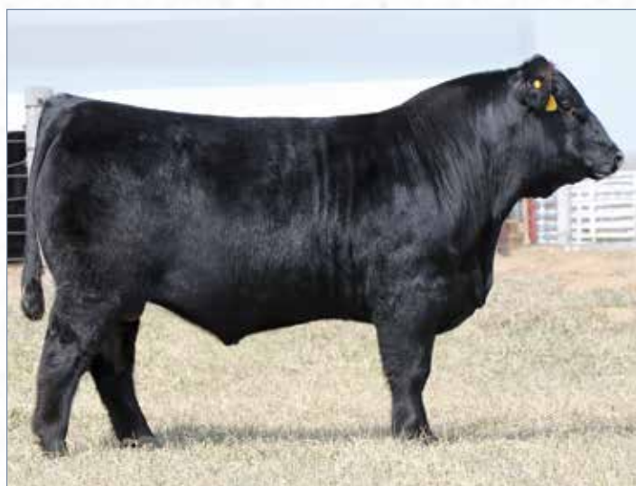
CELL ENVISION 9176 • Sire of Lots 2B & 2C