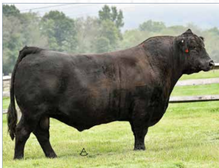
CJSL CREED 5042C • Sire of Lot 3B