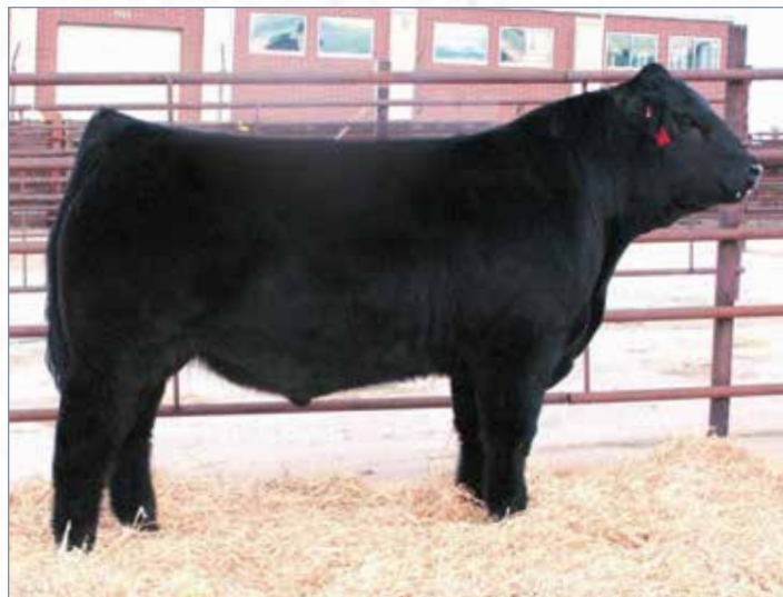
COLE ARCHITECT 08A • Sire of Lot 2A