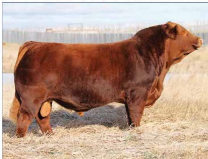
HUNT CREDENTIALS 37C • Sire of Lot 4C