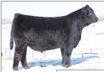
SIRE // MAGS Aviator