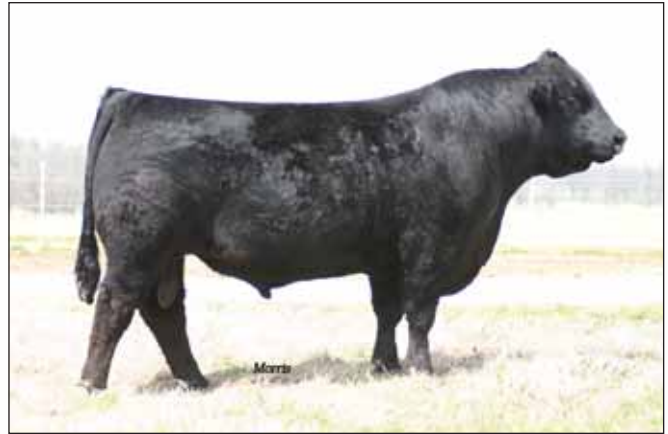
SIRE // BOHI Top Dollar 7144T

Consigned by Freebird Farms and Edwards Land & Cattle Co., Beulaville, NC