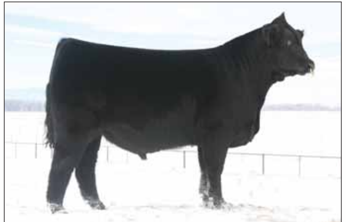
SIRE // MAGS Xyloid

Consigned by Win Vue Farm, Bulls Gap, TN