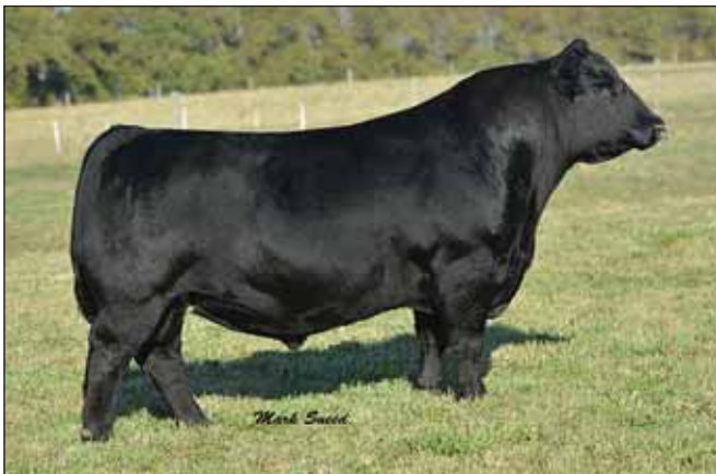
SIRE // PVF Insight 0129

Consigned by Win Vue Farm, Bulls Gap, TN