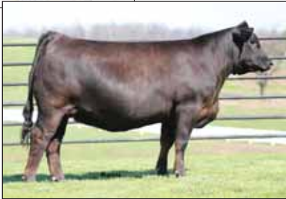
DAM // AUTO Paris 406B