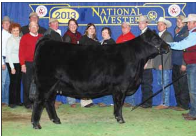
Maternal sib // ELCX Twilight