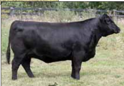
DAM // SBLX Zero Percent