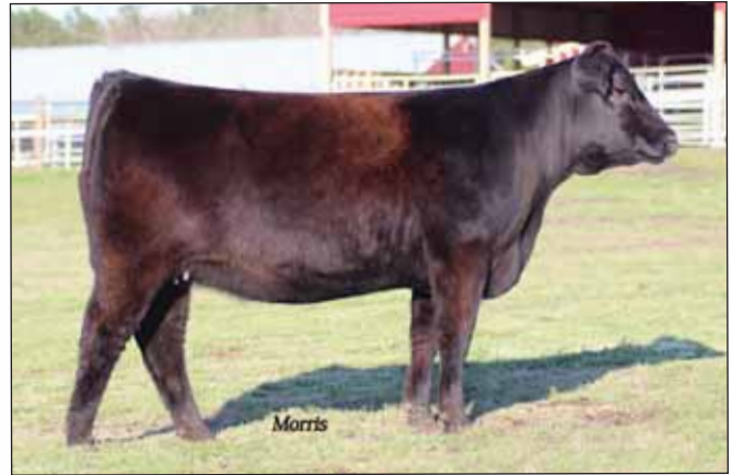
DAM // ELCX Edith Erica 128Y

Consigned by Edwards Land & Cattle Company, Beulaville, NC