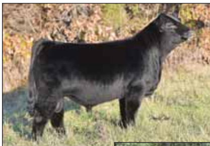
SIRE // ELCX Kings Landing 599D ET