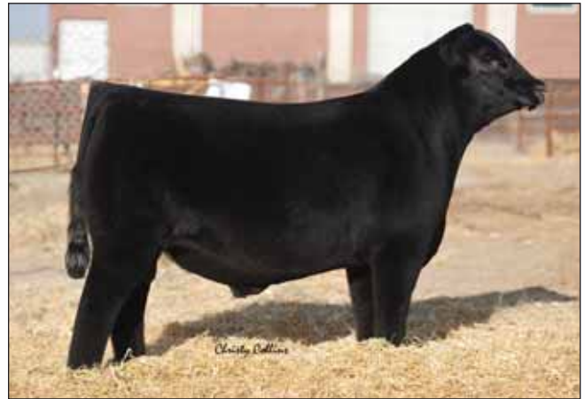
SIRE // Silveiras Style 9303

Consigned by White Valley Ranch, Adair, OK