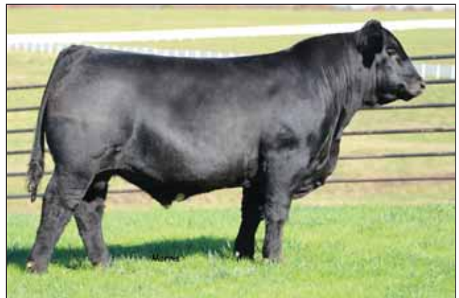
SIRE // AUTO Silverado 543B

Consigned by Win Vue Farm, Bulls Gap, TN and Cross Creek Farm