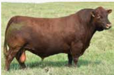
BIEBER ROLLIN DEEP Y118