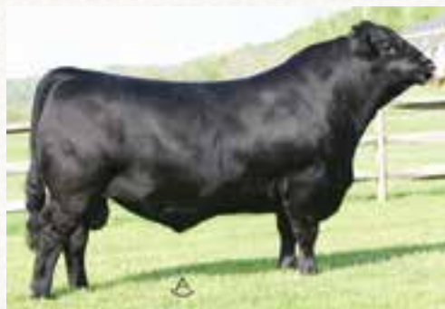
TMCK CASH FLOW 247C Sire of Lot 16

What better way to push the genetic envelope than to combine the tried-and-true genetics from the Poll Unique cow family with the exciting young AI sire Cash Flow. When Cash Flow made the trip to Denver with the prestigious Tubmill Creek program, cattlemen took notice of his impeccable design combined with his ground pounding performance. On the maternal side, few can claim the longevity and production prowess of the Poll Unique cow family. These embryos promise to provide the optimal levels of both raw performance and maternal power progressive seedstock producers strive to replicate.