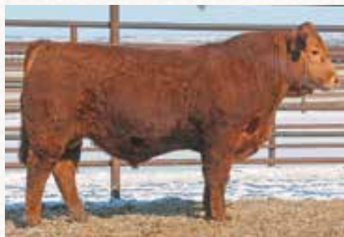
WULFS DEFEND K909D Sire of Lot 23

WULFS XTRACTOR X233X WULFS DEFEND K909D ET WULFS WORTH IT ALL 9108W RED RMJ REDMAN 1T RED LAZY MC PRIDE 43X LAZY MC PRIDE 97S WULFS TITUS 2149T WULFS MYRENE 2332M WZRK PRIMESTAR 861P WULFS MISSIVE 2258M 5L NORSEMAN KING 2291 CROWFOOT KURUBA 4033P CRCC BOOM 118N BIEVER'S PRIDE 1G