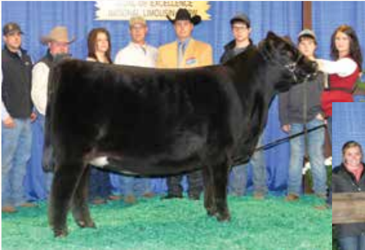
LLJB ABSOLUTE STYLE 3056A

The pick of approximately 70 elite bred heifers is coming from the heart of our robust fall calving program which, is one of the largest in the business today. The list of breed impacting females that we've been fortunate to raise over the years continues to rapidly grow like, LLJB Absolute Style 3056A and CJSL 6096D, and we have full confidence that a matron worthy of that moniker exists in this very group. Found specifically in the 2016 fall-born bred heifer pen are females that are high quality, numerically impressive and genetically diverse. This combination all but secures your chance of finding numerous prospect donor females to sort through.