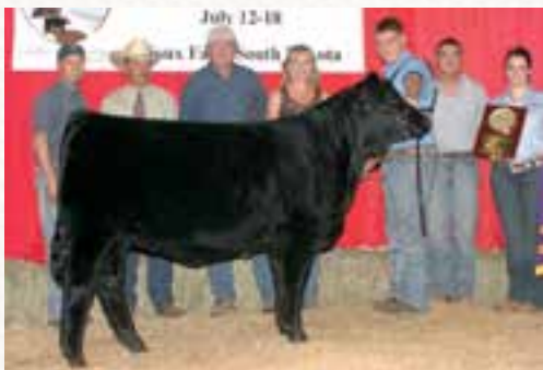
SSCL TARA 04T Dam of Lot 26