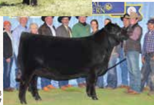
LH BELLE 015B Dam of Lot 17