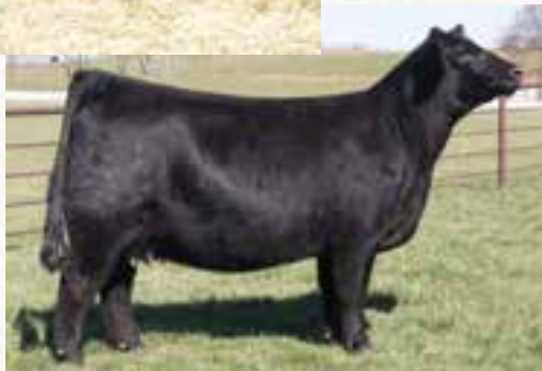
AUTO CASPER C Dam of Lot 19