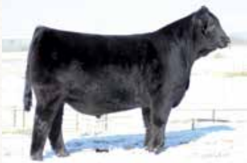
MAGS AVIATOR Sire of Lot 18