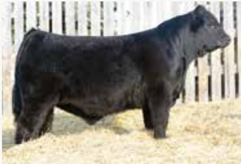
RIVERSTONE CROWN ROYAL Sire of Lot 19