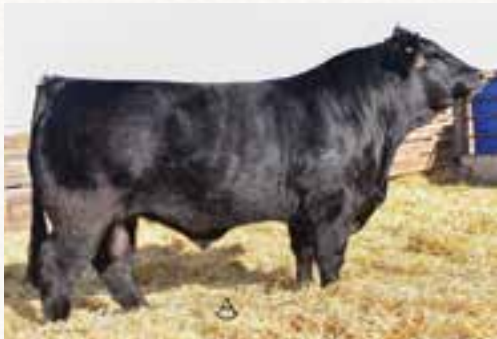
WULFS CONVERSION 3970C Sire of Lot 25