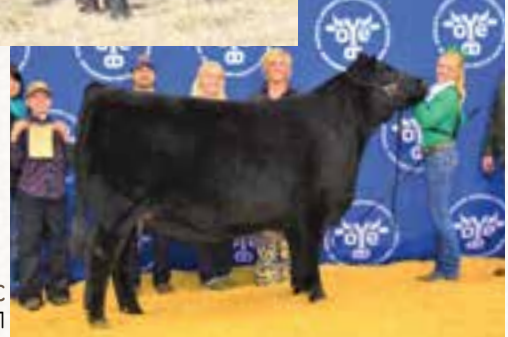
DHIL LUVLY 5023C Dam of Lot 21

A heifer sexed package of embryos that combine quality genetics from proven lineage. DHIL Luvly 5023C was the grand champion Lim-Flex cow-calf pair at the 2017 National Junior Limousin Show, and her maternal sister was the grand champion in the junior show at the 2014 NAILE. The embryos are sired by Colt, a maternal brother to LH Belle 015B who took the breed by storm in the fall of 2015 and spring of 2016—winning Louisville and Denver both junior and open shows, Fort Worth and supreme over all breeds at the OYE in Oklahoma City. Progeny from this mating, when compared to active Lim-Flex dams, would rank in the top 2% WW, 5% YW, 15% CW and 20% REA. Guaranteed at least one pregnancy if implanted by a certified technician.