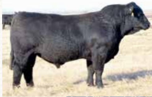
DHIL COLT 5793C Sire of Lot 21

PVF INSIGHT 0129 DHIL COLT 5793C PBRS TOUCH ME GENTLY 7989T LH XPRESS FREIGHT 136X DHIL LUVLY 5023C EXLR LUVLY 024X S A V BRILLIANCE 8077 PVF MISSIE 790 DHVO DEUCE 132R CARROUSELS PINA COLADA LH RODEMASTER 338R KRVN NACHES 151N EXAR TITLELIST T011 EXLR LUVLY 7127N