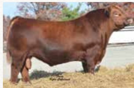
SILVEIRAS MISSION NEXUS 1378