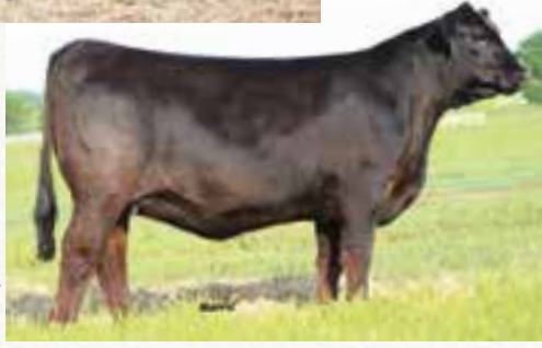
MAGS AMERICAN BEAUTY Dam of Lot 24