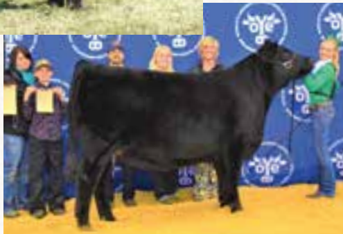
DHIL LUVLY 5023C Dam of Lot 20