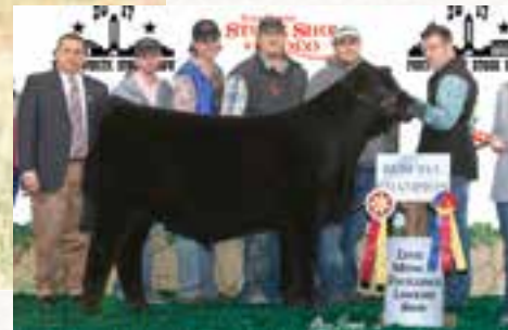
JCL DRIVER • Son of Lot 4