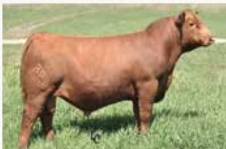
BIEBER HARD DRIVE Y120