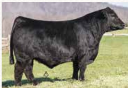
CJSJ CREED 5042C Sire of Lot 17

A unique opportunity to share in some high-quality, predictable genetics from some of the breeds finest. LH Belle 015B took the breed by storm in the fall of 2015 into the spring of 2016—being selected grand champion in the junior and open shows at the NAILE, grand champion junior Lim-Flex and open show at the 2016 NWSS, grand champion at the FWSS, and finally supreme champion heifer at the OYE in Oklahoma City. Mated to CJSJ Creed 5042C, the Aviator son who topped the 2016 Linhart sale going to Tubmill Creek Farms is a can't-miss combination. Guaranteed at least one pregnancy if implanted by a certified technician.