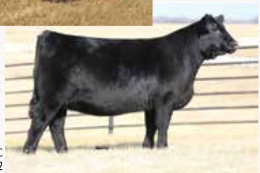
AUTO CHAPERALL 406C Dam of Lot 22

Showtime! Sexed heifer embryos of this caliber and quality are rarely offered to the buying public, but the 2018 National Sale is your opportunity to invest in some of our breed's very finest. Study the unique combination of the widely popular TASF Believe A.I. sire and the visually stunning donor, AUTO Chaparral, which was a highlight and standout at the 2017 annual Pinegar Limousin sale. Simply stated, the rare combination of phenotypic quality, number package, predictability and unique pedigree twist make this genetic lot one to invest in sale day. Guaranteed one pregnancy if implanted by a certified technician.