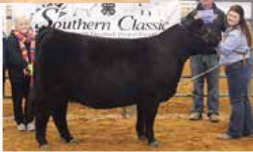
LSLX CARLA 68C Full Sib to Lot 26