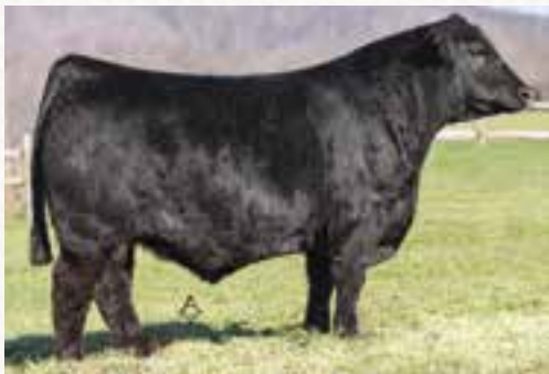
CJSI CREED 5042C Sire of Lot 20