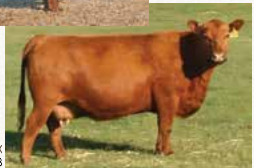
RED LAZY MC PRIDE 43X Dam of Lot 23

Pride 43X is a stunning daughter of Red RMJ Redman 1T and an exemplary donor female at Bullis Creek. She was purchased from the AI Land & Cattle Dispersal as one of the high sellers at $12,500, and her six daughters that sold averaged nearly $7,000. 43X is a wide-topped, easy-keeping female with a perfect udder attachment. She has earned a 106.5 MPPA over her lifetime. Her genetics have been offered in many of the leading Red Angus sales across the U.S. and now with this unique mating to one of the Limousin breed's up-and-coming young sires. Wulfs Defend K909D, the high-selling lot at last year's Wulf Cattle Opportunity sale. He is sired by Xtractor and his dam is a full sister to Wulfs Xclusive 2458X who is sired by Primestar. High performance with calving-ease, a +10 CED and -0.2 BW EPD. Defend has 12 out of 14 traits in the top 30% or higher. He is an eye-appealing, homozygous polled, red herd sire with a super gentle disposition. Offering 3 grade #1 embryos with the guarantee of one pregnancy if implanted by a certified technician.