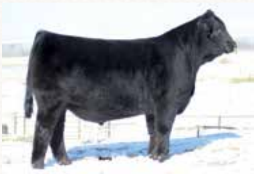
MAGS AVIATOR • Full sib to Lot 6