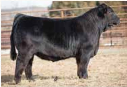
CJSJL DATA BANK 6124D Sire of Lot 24