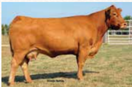
WULFS SOLOIST 6284S Dam of Lots 2J & 2K