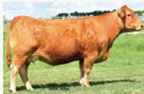
JYF 530X Dam of Lots 2B, 2C, 2D, 2F, 2H, 2I, 2L, 2M & 2N