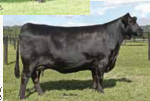
ENGD UNIQUE 1501Y Dam of Lot 16