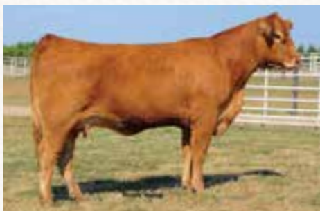
WULFS YOUR CHOICE 1419Y Dam of Lots 2A, 2E & 2G