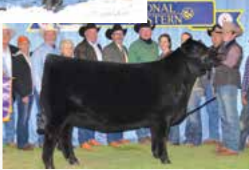
LH BELLE 015B Dam of Lot 18