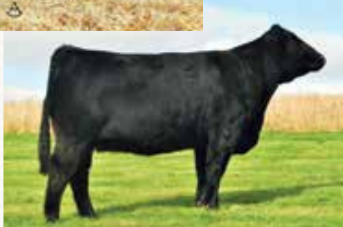
DHIL TMG 5795C Dam of Lot 25