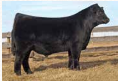
TASF BELIEVE 854B Sire of Lot 22

DHVO DEUCE 132R TASF BELIEVE 854B CHERRY KNOLL ELSA 8014 S A V BRAND NAME 9115 AUTO CHAPERALL 406C ET AUTO REBECA 2925 GPFF BLAQUE RULON MHY HO DHAN 20L H S A F BANDO 1961 ELSA OF CONANGA 868 1112 S A V BISMARCK 5682 S A V BLACKCAP MAY 5530 LESF ASPHALT 9N EXLR REBECA 1019P