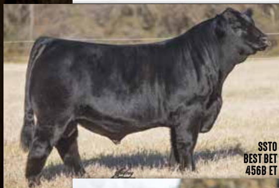
SSTO BEST BET 456B ET