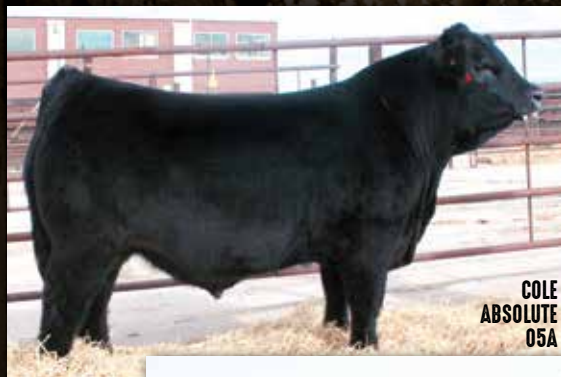
COLE ABSOLUTE 05A