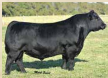
PVF INSIGHT 0129