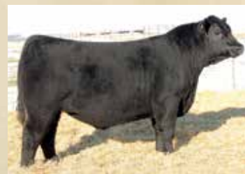
S A V HESSTON 2217