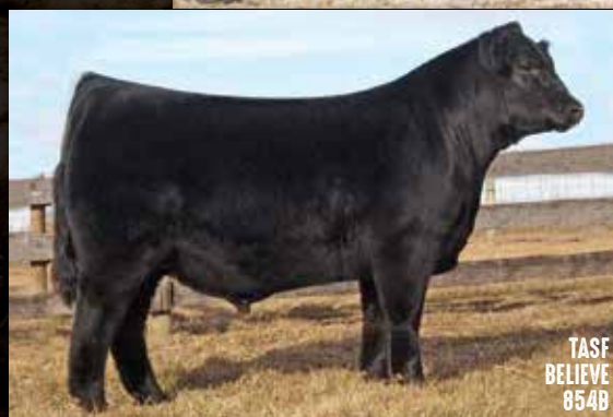
TASF BELIEVE 854B