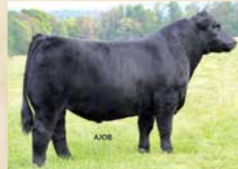
TMCK ARCHITECT 031A