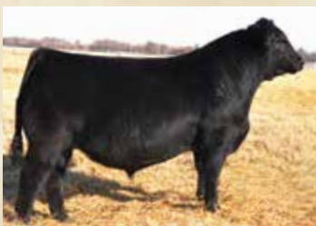
EXAR DENVER 2002B