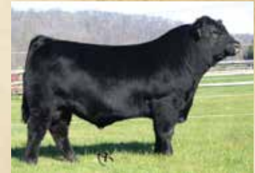
TMCK CAMDEN YARDS 195C