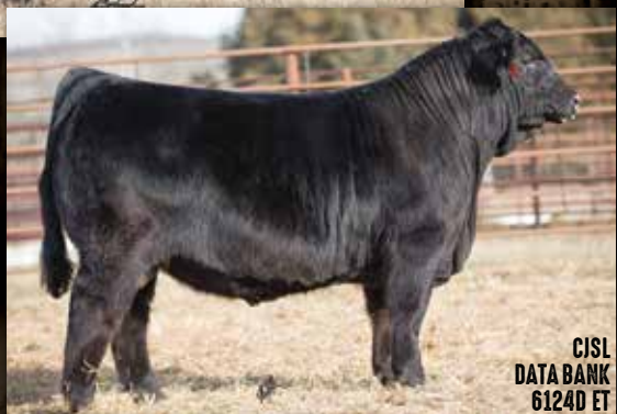
CJSI DATA BANK 6124D ET