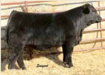
AHCC BARN BURNER B907