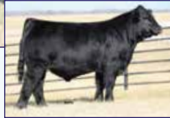
AUTO DIRECT DRIVE 107D / Sire of Lot 11