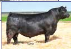
HA COWBOY UP 5405 / Sire of Lot 7