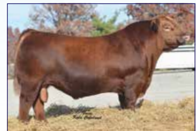
SILVEIRAS MISSION NEXUS / Sire of Lot 20