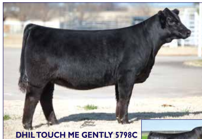
DHIL TOUCH ME GENTLY 5798C