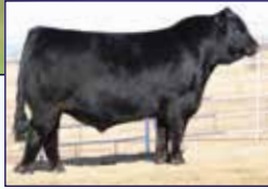
MAGS CABLE / Sire of Lot 17