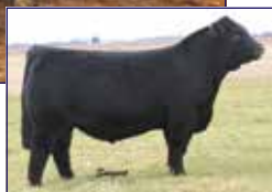
RLBH AIR FORCE ONE / Sire of Lots 23A & 23B