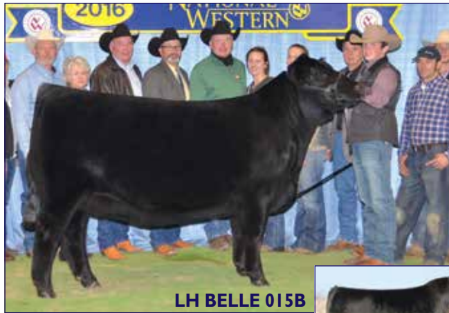
LH BELLE 015B

This is a can't-miss mating by MAGS Cable, the lead bull in the 2017 NWSS grand champion carload and now serving herd-sire duties for Magness Land & Cattle and Graven Land & Cattle.