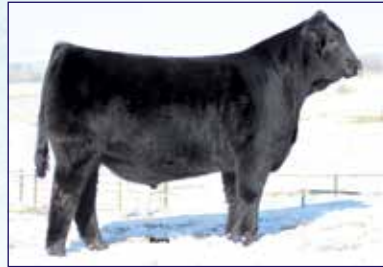
MAGS AVIATOR Son of Lot 1