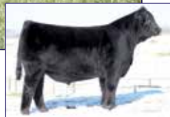
MAGS AVIATOR / Sire of Lot 13