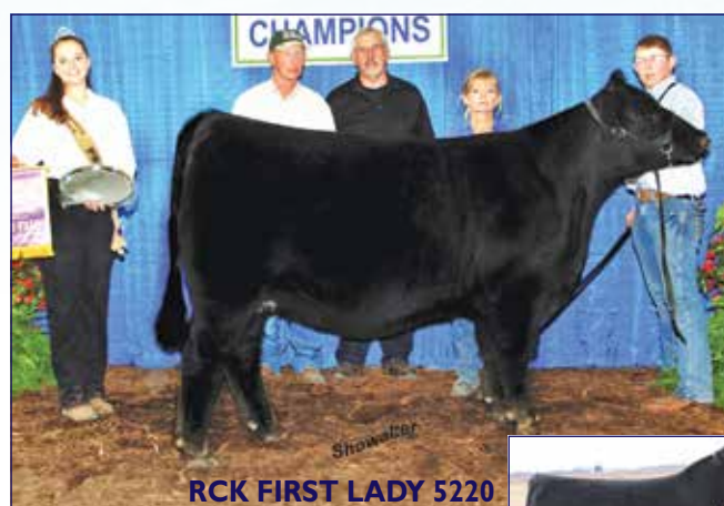
RCK FIRST LADY 5220

MAGS Aviator was the top-selling bull of the 2014 Magness sale. He flawlessly combines style and growth in a Homo/Homo package. When it comes to a perfect skeletal outline and structural integrity, Aviator is going to be the go to bull for several years to come for many producers nationwide. SBLX Zity Nights was recent highlight of the Milam dispersal, she is a direct daughter of MAGS Manuela, the leading Sugar Bush donor. She posted a tremendous set of scan numbers with a 14.99 for REA and a 4.11 for IMF.