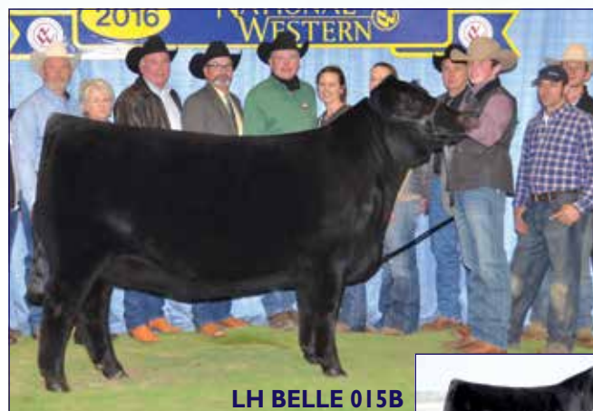
LH BELLE 015B

The Architect calves in the 2017 NWSS Coleman pen and carload were highly popular. Not only did breeders like their EPDs and soundness, they appreciated their rib shape, performance and muscling. Four of the top-selling bulls in Coleman's 2017 sale were Architect sons. This mating of Architect x Belle has been drafted with greatness in mind.