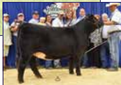
ELCX CANDY 330C / Daughter of Lot 19 Dam