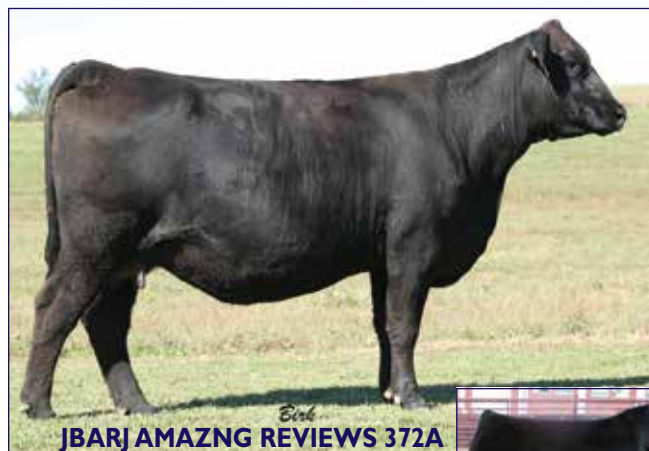
Dam of Lot 15

We guarantee a minimum of 1 pregnancy if a certified embryologist is utilized. These elite embryos are by one of the breed's most popular PUREBRED and big-numbered A.I. sires, COLE Architect! If you're looking for a genetic opportunity that promises to produce homozygous polled, functionally sound bulls and tremendous cow prospects, here's your mating! This mating features service by Architect, a sire who's known for producing high growth, thick cattle that have truly clicked with the commercial industry. The donor female, JBarJ Amazing Reviews 372A, is one of the most phenotypically complete donors to walk the pastures of J Bar J Ranch. She's moderate, big-bodied and boasts a perfectly constructed udder. Don't overlook this buying opportunity sale day.