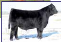
MAGS AVIATOR / Sire of Lot 6