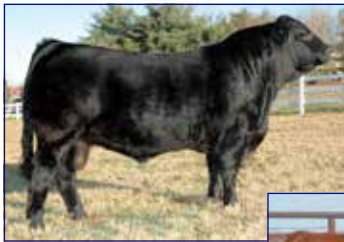
WULFS XCLUSIVE 2458X Full sib to Lot 2