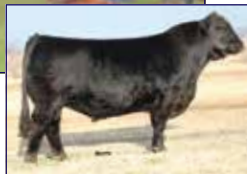
MAGS ZODIAC / Sire of Lot 18