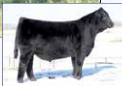
MAGS AVIATOR / Sire of Lot 22