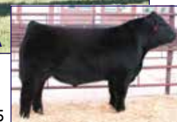
COLE ARCHITECT 08A / Sire of Lot 15