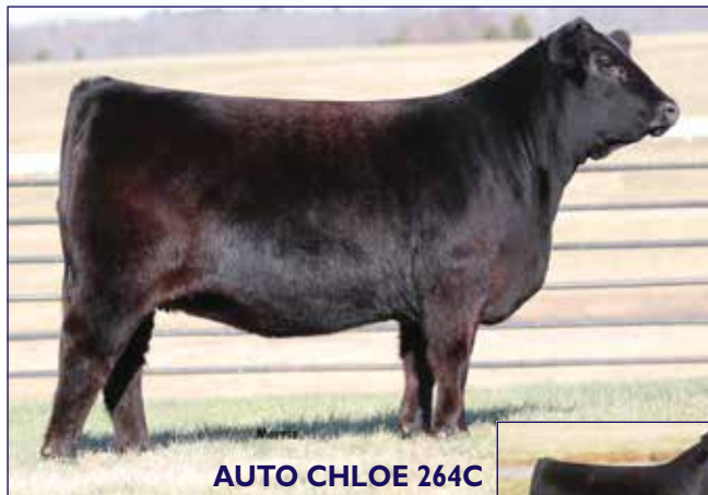
AUTO CHLOE 264C

White Valley Ranch has assembled one of the top cowherds in the nation the past few years; donor, AUTO Chloe 264C is no exception. Her dam, PBRs Piña Marie 811U, is the leading Pinegar and Edwards Land & Cattle Co. donor. She is the big-league donor and daughter of Basin Franchise from the once national champion female Carrouseles Piña Colada. AUTO Direct Drive was a logical choice to flush 264C to, as he is one of the finest purebred bulls ever created in the Pinegar program. He is Homo/Homo, has a balanced EPD profile and his top-of-the-industry phenotype will complement 264C perfectly to produce spectacular progeny.