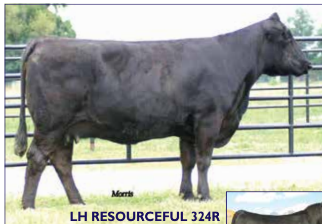
LH RESOURCEFUL 324R