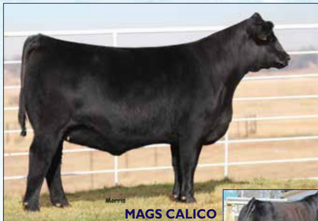
Dam of Lot 14

We guarantee a minimum of 1 pregnancy if a certified embryologist is utilized. This genetic consignment epitomizes the crossroads of where phenotypic quality, huge numbers and genetic diversity meet. This designer mating offers you the opportunity to invest in some of the breed's freshest homozygous polled genetics. The featured sire is none other than the heavy-muscled, $70,000, purebred A.I. sire who set the breed a blaze topping the Wulf's Opportunity Sale of 2016, Wulfs Compliant! The donor, MAGS Calico, is the 2017 top-selling bred heifer at the Magness Mile High Elite sale where she commanded attention and was admired for her flawless structure, makeup, body depth and high performance. This mating speaks for itself and represents the progressive direction of both the Graven and Glendenning programs. Bid with confidence.