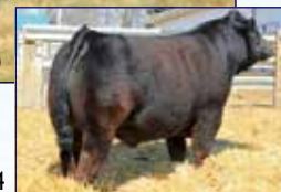
WULFS COMPLIANT K687C / Sire of Lot 14