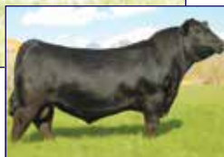
COLEMAN REGIS 904 / Sire of Lot 24