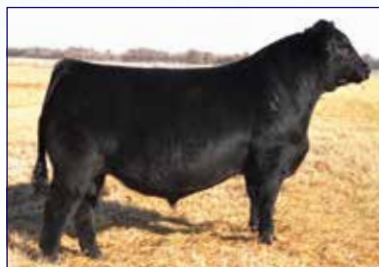
EXAR DENVER 2002B / Sire of Lots 20 & 21