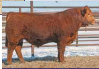
WULFS DEFEND K909D Son of Lot 2