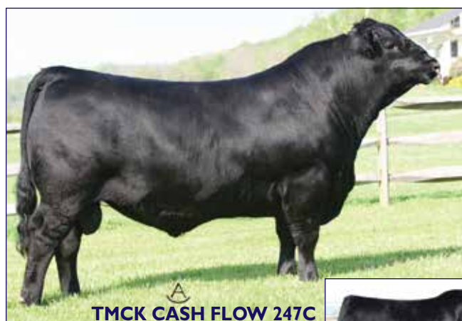
Son of Lot 16 Dam

We guarantee a minimum of 1 pregnancy if a certified embryologist is utilized. What an opportunity to get in on the ground floor of some truly elite genetics. The imagination runs wild when you project the boundless possibilities of the future offspring of these two breed standouts. TMCK Jade 935Y, dam of the highly popular A.I. sire TMCK Cash Flow, possess a combination of structural integrity, body depth and fleshing ability even the most discriminating cattlemen would appreciate. The paternal side of this mating, MAGS Cable, is the huge numbered, $48,000 syndicated A.I. sire who anchored both the 2016 and 2017 Champion Carload at the National Western Stock Show. This double homozygous mating simply out paces the field. Study the projected EPDs as you appraise the unmatched genetic value on offer.