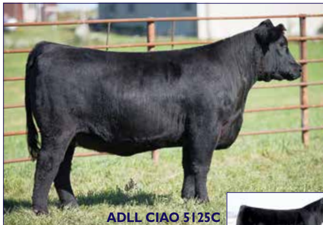
ADLL CIAO 5125C

JCL Driver hit the show circuit in Fort Worth with great anticipation and even better results. His first time out he was the reserve bull as a calf and the talk of the barn. JCL Driver is the top 2% and top 5% for WW and YW, as well as the top 15% for $MI. His style and eye appeal are desired by the most critical evaluators in the industry. With semen packages purchased by many progressive breeders in the breed, White Valley Ranch is pushing the envelope forward with this unique, modern mating. AUTO Chloe 264C goes back to the top genetics in the breed of all time and will go down in history as a great one as time goes on.