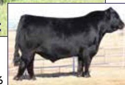
MAGS CABLE / Sire of Lot 16