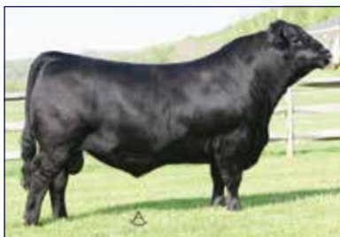
TMCK CASH FLOW 247C / Sire of Lot 20