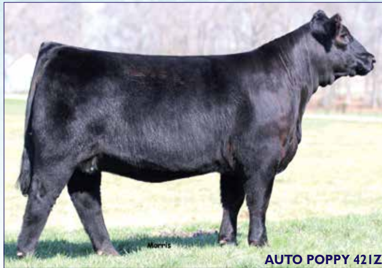
AUTO POPPY 421Z Dam of Lots 20 & 21