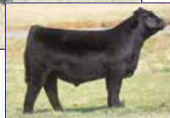
JCL DRIVER 617D / Sire of Lot 12