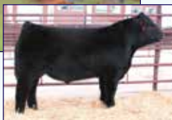
COLE ARCHITECT 08A / Sire of Lot 5