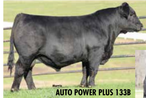
AUTO POWER PLUS 133B