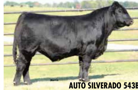
AUTO SILVERADO 543B