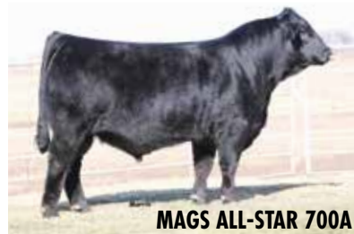
MAGS ALL-STAR 700A