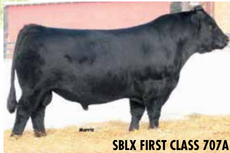
SBLX FIRST CLASS 707A