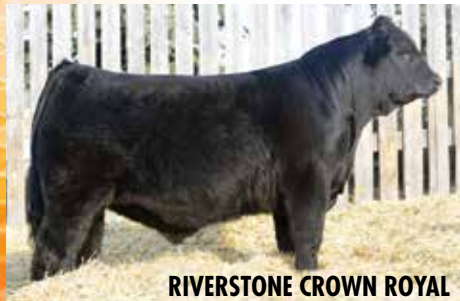
RIVERSTONE CROWN ROYAL