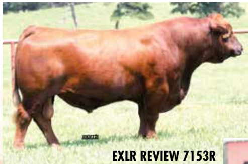
EXLR REVIEW 7153R