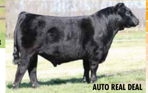
AUTO REAL DEAL