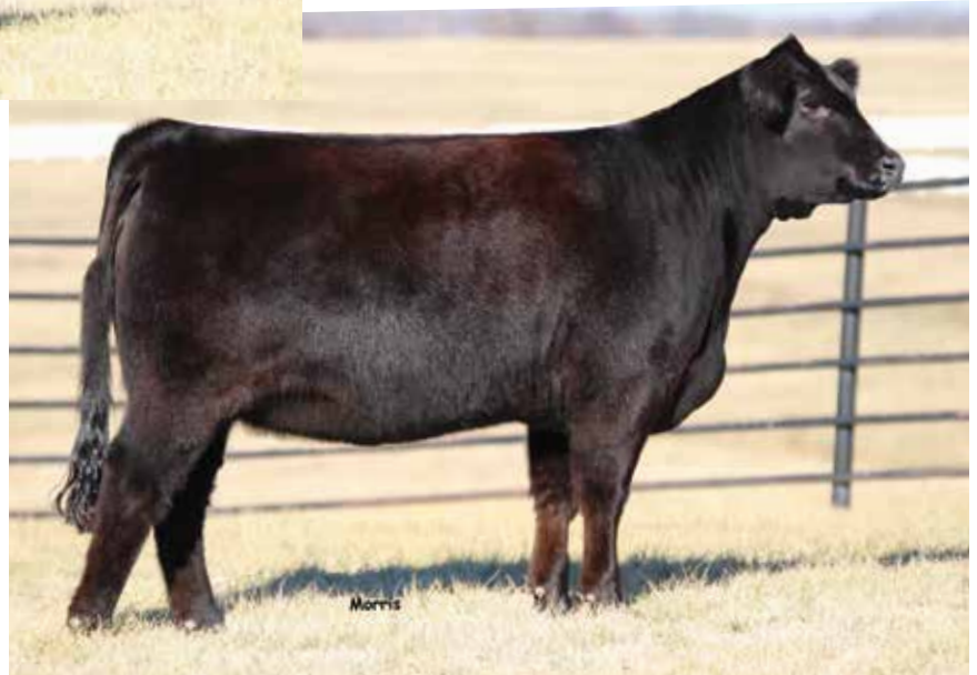
LOT 61 | AUTO CAMBER 451C