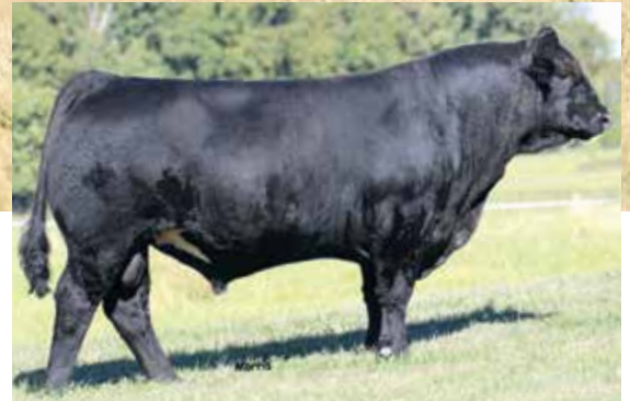
AUTO CRUZE 132X | Sire of Lots 18 & 19