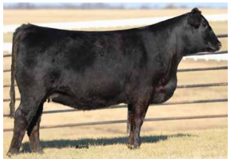
LOT 52 | AUTO COTTER 615C

Due 4.2.17 to AUTO Power Plus 133B (HB/HP) From the same cow family as Carrousel Peaches and Carrousel Piña Colada, AUTO Coraline has pretty substantial shoes to fill, however we are confident she can do it! Thus far, she hasn't let us down in terms of phenotype and disposition; we have faith in her inherited mothering ability and proven pedigree. You see, not only does she go back maternally to ELMW Ginnie, she also goes back to EXLR Luvly 821M on her sire's side.