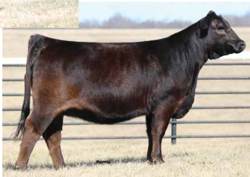
LOT 39 | AUTO CARLOTTA 253C