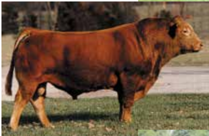
AUTO CLIFF HANGER 194D