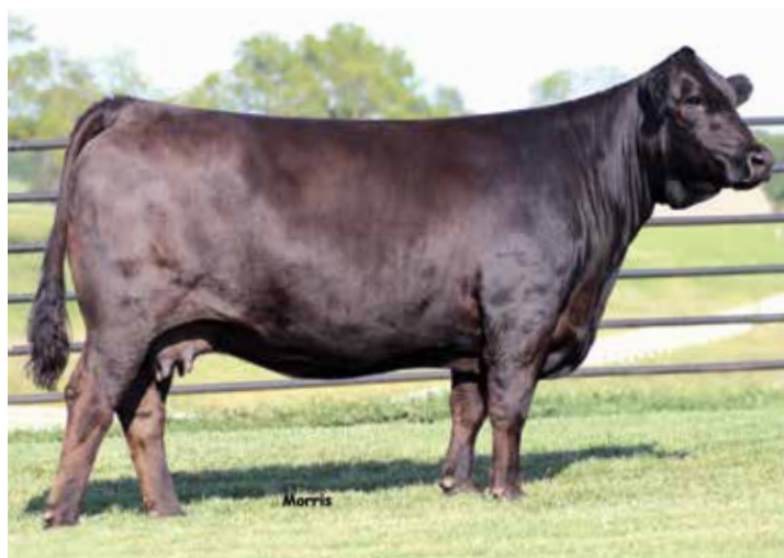
MAGS MANUELA | Dam of Lot 32

Here is a sale feature and one of the finest MAGS Manuela daughters to ever sell at auction. She is sired by the Red Angus sire PZC TMAS Red Zone 2795, a son of Red Northline Fat Tony from the Whitestone Lana V150 donor. This black, polled 50% Lim-Flex female ranks in the top 2% for MB with a .65 and SMTI with a 73. She also has a breed-leading IMF scan number of 6.33 and still posts an REA scan data of 12.61 This female is as good as you can ever want one made. She is