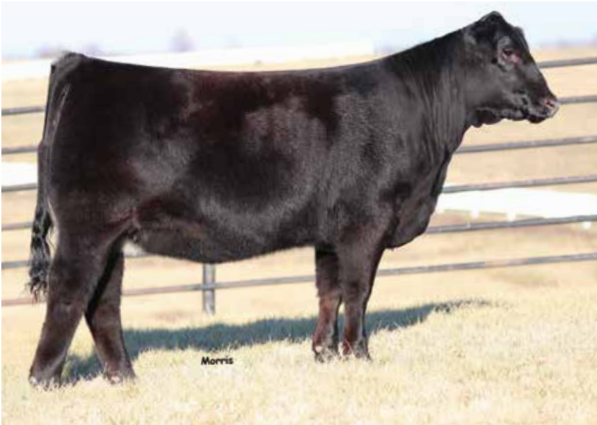
LOT 62 | AUTO CAMBRIDGE 298C