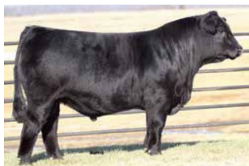
AUTO KING JAMES 162Z | Sire of Lot 48

Quite simply summarized, here is a daughter of the great high percentage sire, AUTO Cruze 132X who posts a 0 for BW, 103 for YW and in the top 20% for MB and SMTI. AUTO Cynthia 619C is a homozygous polled, homozygous black 75% Lim-Flex female who ratioed a 104 for REA and 101 for IMF at scanning time.