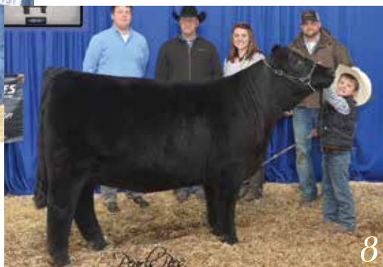
8 AUTO ADORIE 439A Owned by: Gage Baker 2015 MO Field Day Grand Champion Lim-Flex