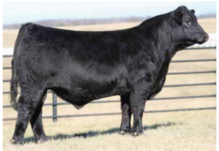
LOT 14 | AUTO ROADSTER 104D

Wow! What a gorgeous profile, unique design and excellent structure found within this young herd-sire prospect who just happens to represent a very predictable and proven pedigree. He is sired by the ever-popular Lim-Flex sire TMCK Hydraulic, a big-numbered son of SAV Pioneer and from the elite Riverside Valley Farm donor, SBLX Maria 662Y. She is a daughter of SAV Providence from the famed and now deceased MAGS Manuela. This bull has it all—he ranks in the top 2% for CW with a 50, top 3% for YW with a 126, WW with an 80, and top 10% for SMTI with a 66.