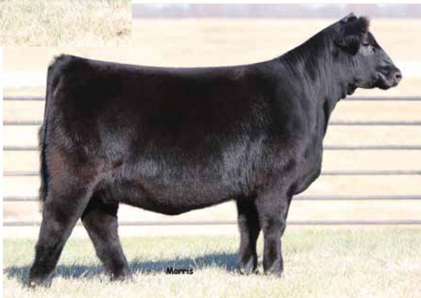
LOT 76 | AUTO DENI 212D