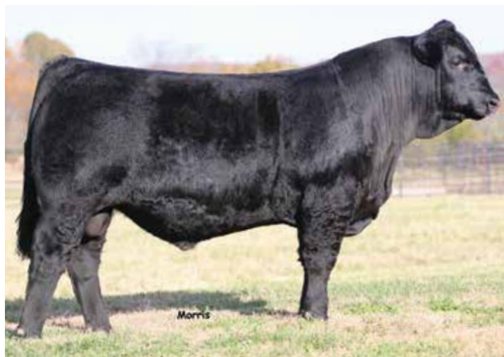
LOT 11 | AUTO HIGH COTTON 143C