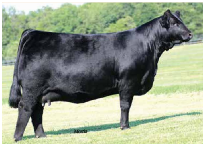
AUTO LUCKIE TOO 423Y | Dam of Lot 5

Muscle and extreme power is what you get when you consider this purebred Limousin bull, AUTO Sharp Shooter 176C. He is one the farm's favorites and rightfully so. He just happens to be sired by the leading purebred bull AUTO Cruze 132Z. Cruze is not on the open market and his semen is highly sought after by some of the breed's most discriminating cattlemen. AUTO Sharp Shooter 176C is a full brother to the top-selling bulls in last year's Pinegar sale. They were AUTO Real Deal 150B and AUTO Sure Deal 149B