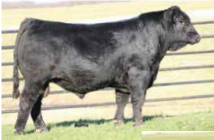
AUTO LODE UP 137B ET