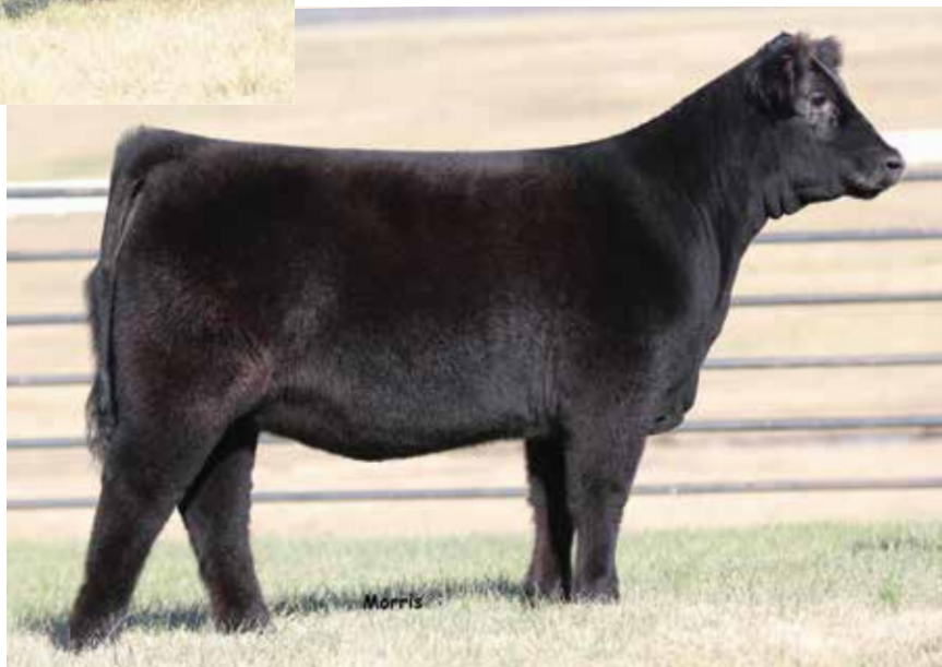
LOT 74 | AUTO DIXON 257D