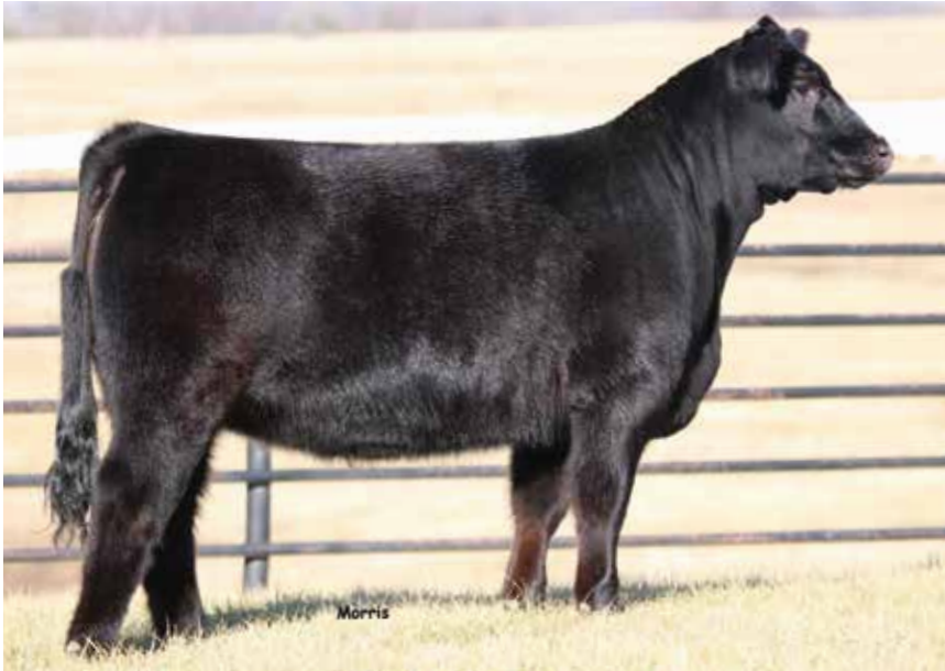
LOT 60 | AUTO CHAY 483C