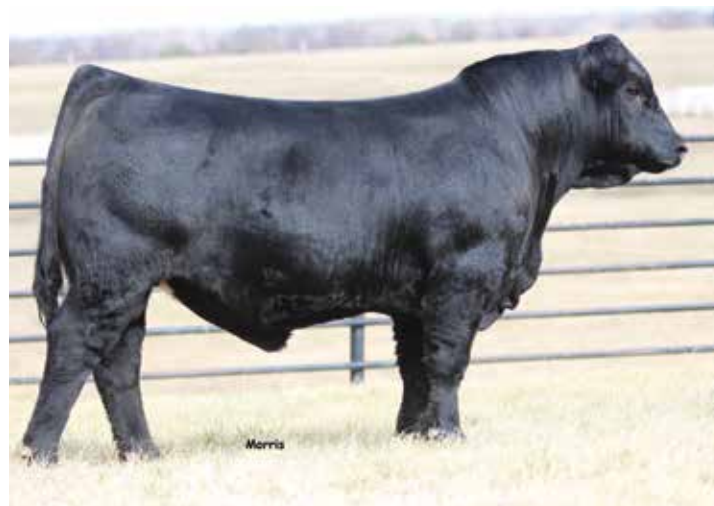
LOT 12 | AUTO VIEWPOINT 152C

It is a known fact there is something magical in our business when you mate a proven Angus bull with a well-made purebred Limousin female. The blending of two of the finest has created a wonderful herd sire in AUTO Viewpoint 152C. This son of SAV Brilliance 8077 is from the purebred donor sired by DHVO Deuce and from the famed MAGS Manuela. 152C is stout in his structure, heavy in his bone and extremely big footed. This bull sure has the look of promise and one we feel will make a positive impact in anyone's herd. He ranks in the top 10% for SC with a 1.30, REA with a .82, CED with a 13, SMTI with a 64. Also ranks in top 15% for MB with a .35. He scanned a 16.05 for REA and has a 66-lb. birth with an 822-lb. weaning.