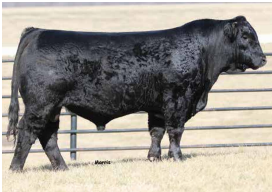
LOT 16 | AUTO DEFENDER 133C