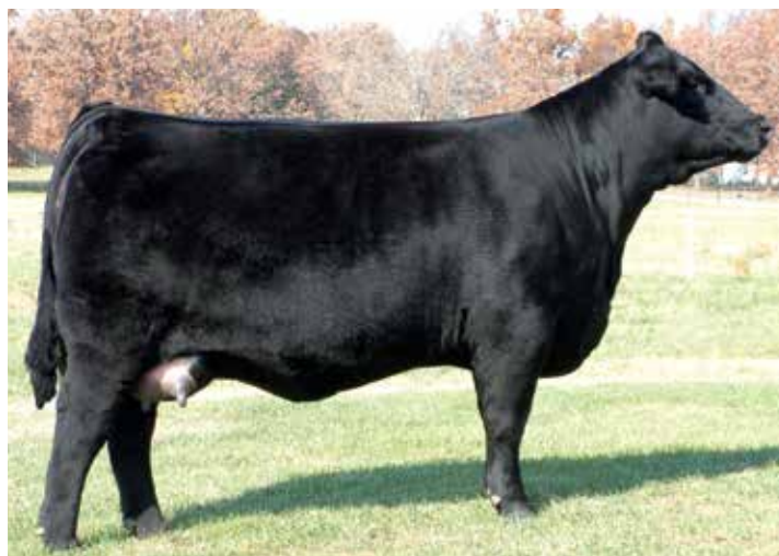
AUTO REBECA 292S | Dam of Lot 68

This 37% Lim-Flex heifer is more than homozygous polled and homozygous black. She is bred to be a future donor for any progressive program. She is a daughter of EXAR Blue Chip 1877B, the ever-popular and proven son of Dameron First Class. Her dam is the famed and proven Pinegar donor, AUTO Rebeca 292S. This young heifer is near perfect in her design and coupled with her predictable pedigree makes for a sure investment for any program.