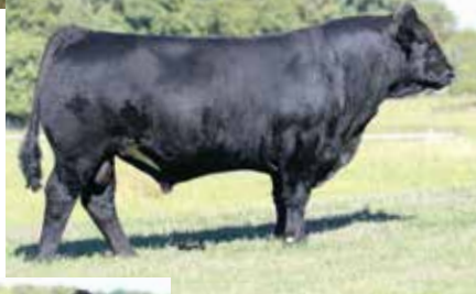
AUTO CRUZE 132X