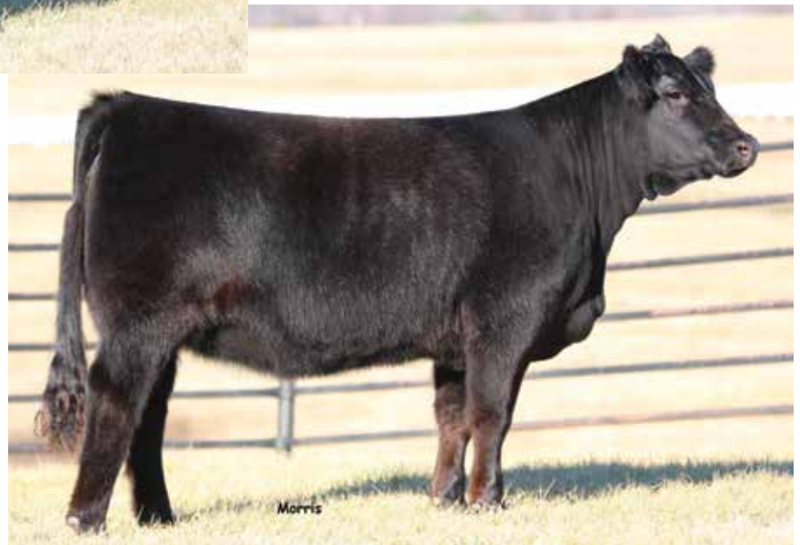
LOT 67 | AUTO CHELLY 653C