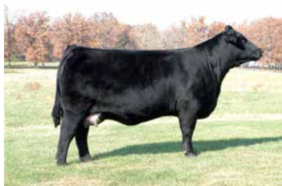
AUTO REBECA 292S | Dam of Lots 16 & 17