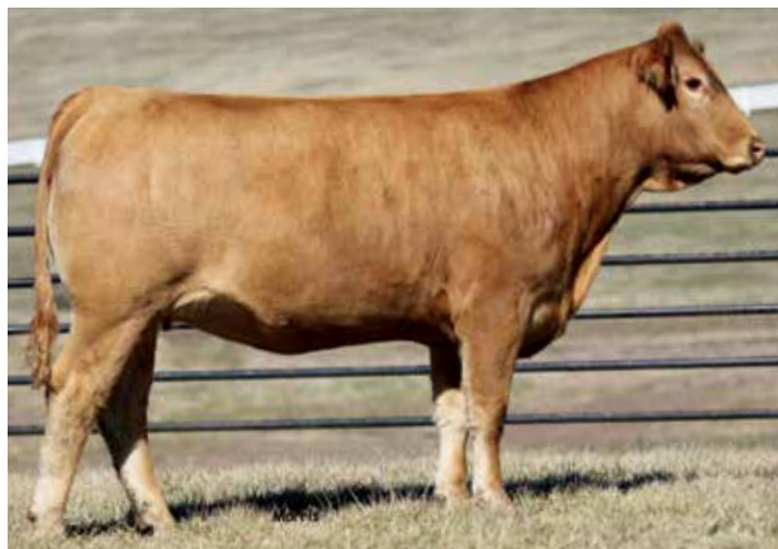
LOT 53 | AUTO CORALIE 265C