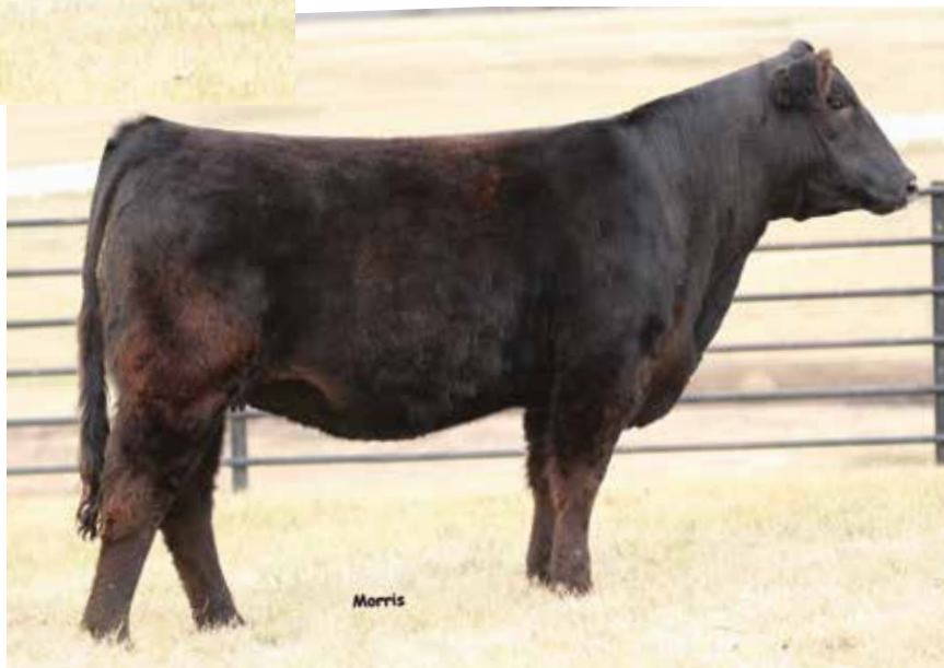
LOT 42 | AUTO CHLOE 276C