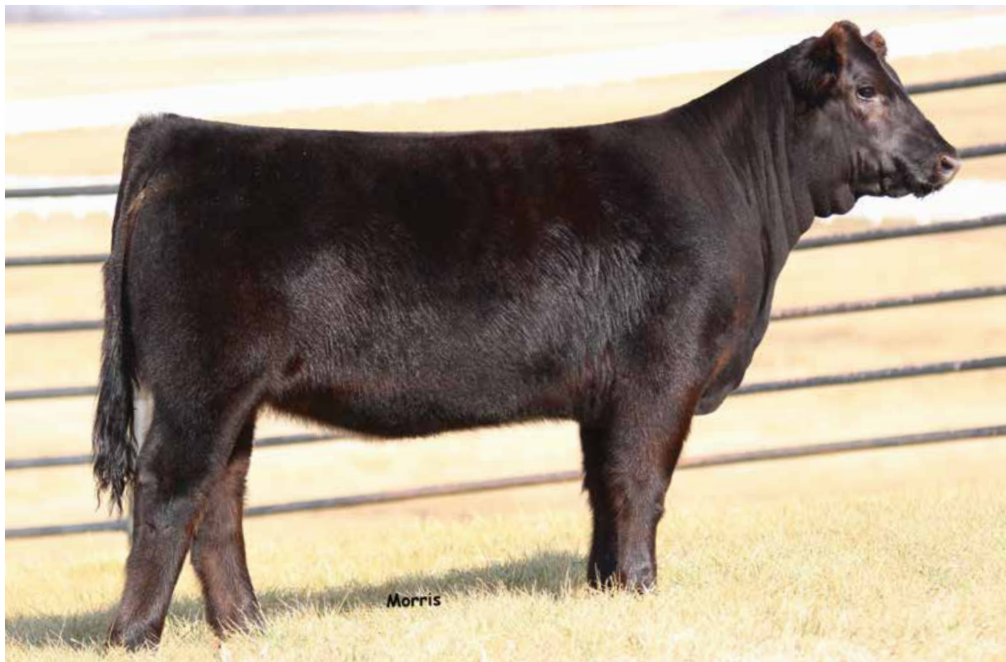
LOT 70 | AUTO DAKIN 255D