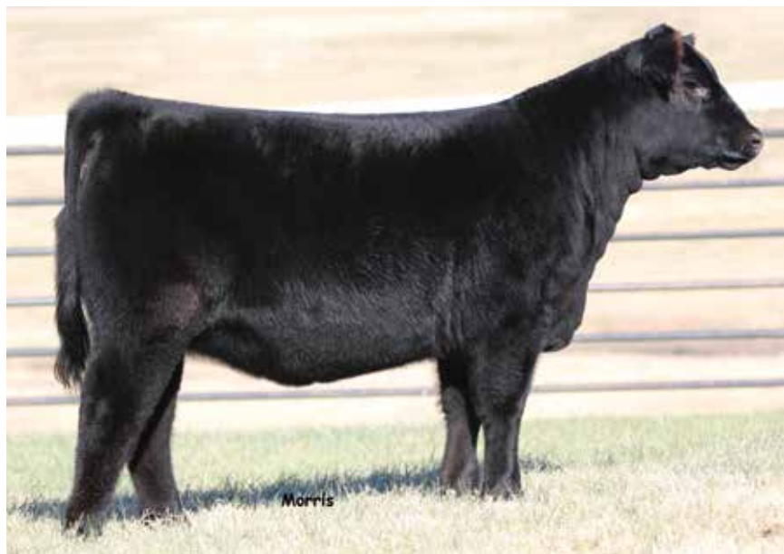
LOT 75 | AUTO DALLY 238D