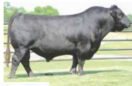
AUTO GUNN POINT 192Y