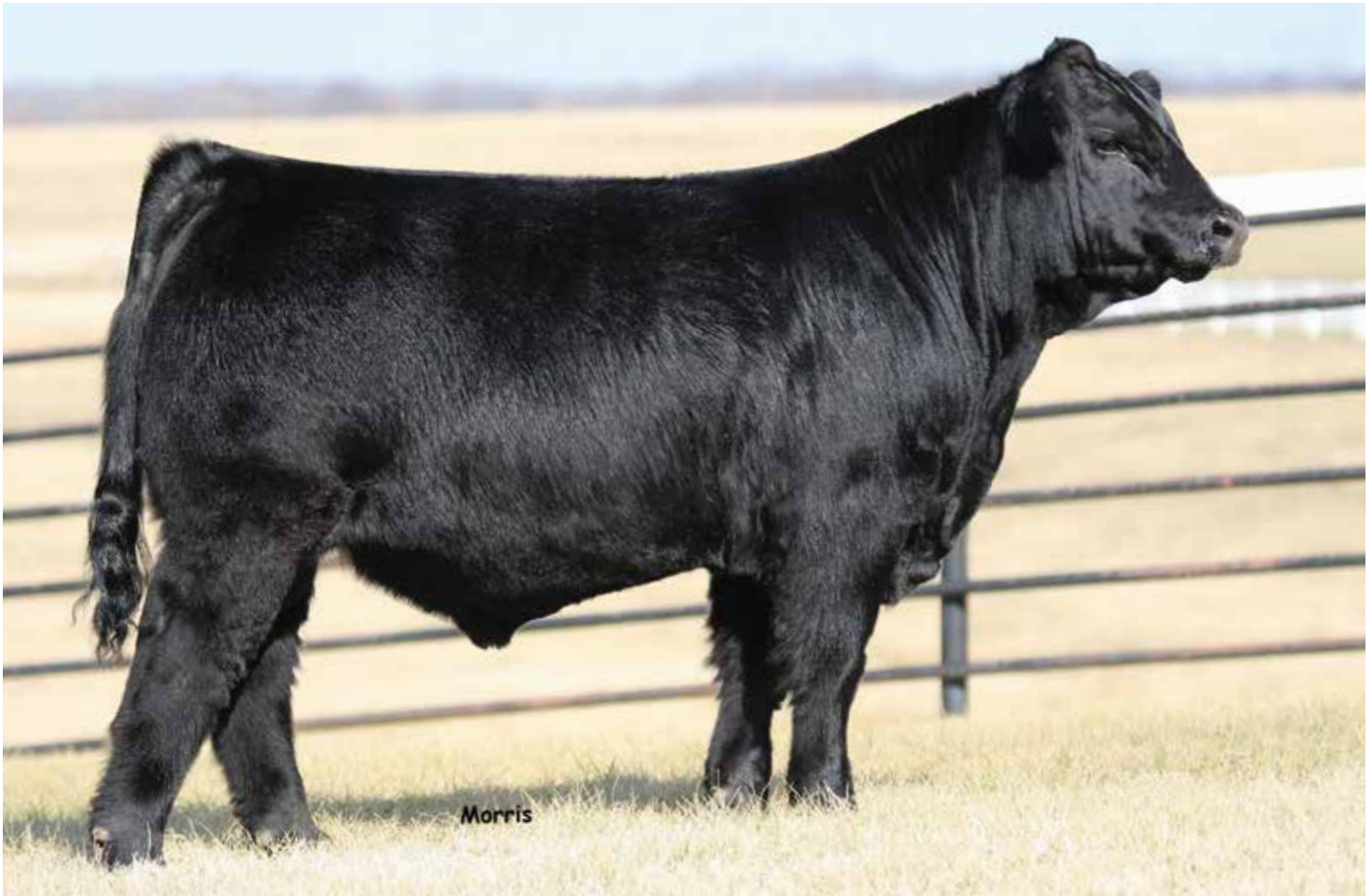
LOT 2 | AUTO DIRECT DRIVE 107D