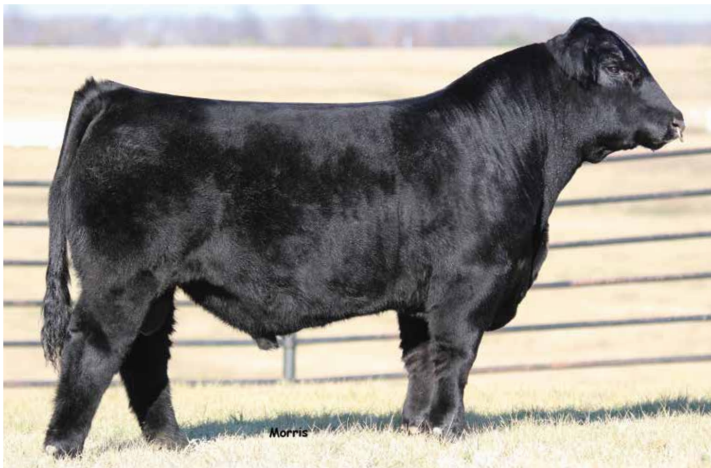
LOT 3 | AUTO CASH & CARRY 101D ET