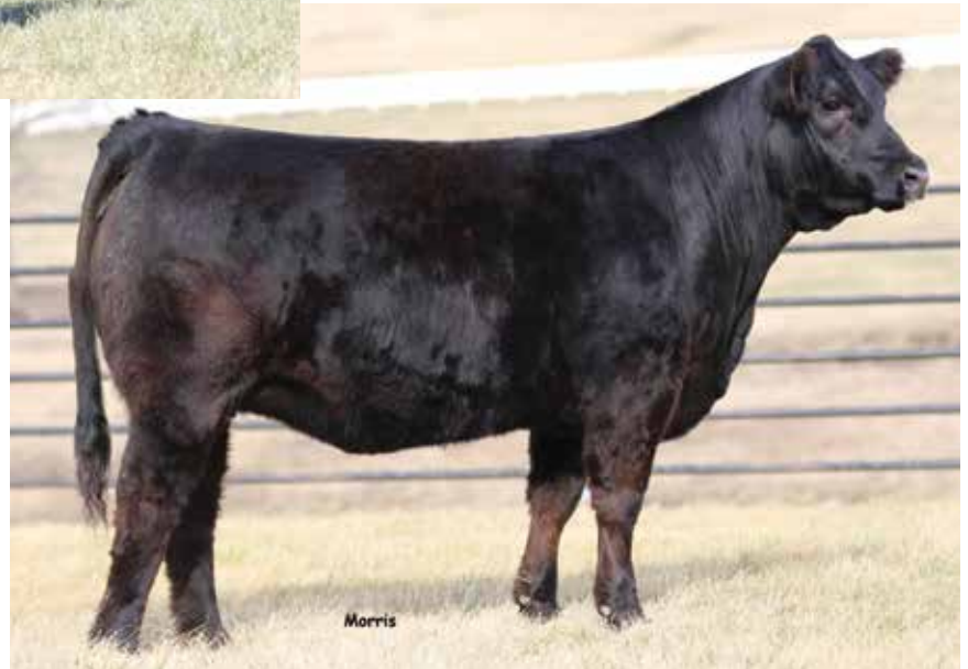
LOT 34 | AUTO CICI 633C