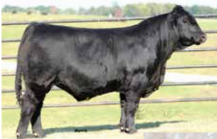
AUTO SILVERADO 5438