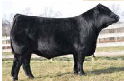
EF XCESSIVE FORCE