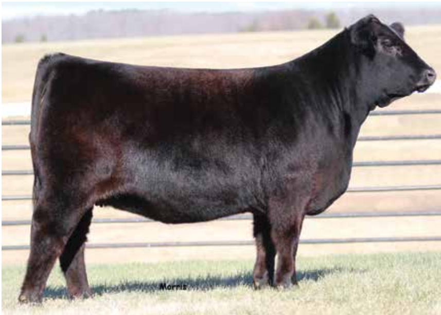
LOT 33 | AUTO CHLOE 264C