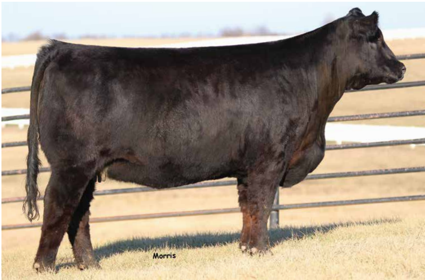
LOT 32 | AUTO CARMELA 207C