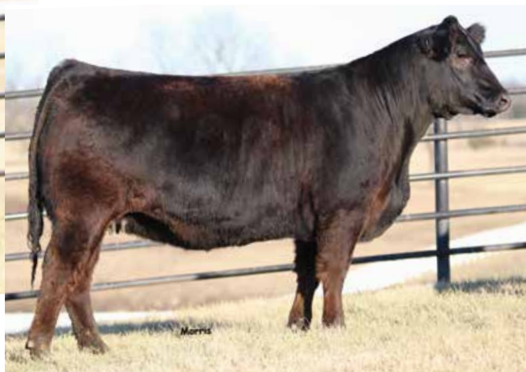
LOT 48 | AUTO CAM 608C