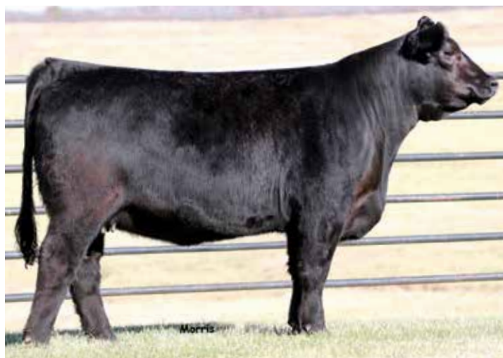
AUTO AJAY 206A | Dam of Lot 69

This 54% Lim-Flex is a proven show champion as she was named reserve division at the recent Denver National Limousin Show. She is a daughter of MAGS Aviator, the exciting son of MAGS Winston. Her dam is P Bar S Ranch owned donor and prolific producer, AUTO Ajay 206A. She is a daughter of SAV Brave and from the famed MAGS Manuela. This show heifer and future donor has a proven pedigree, but just as importantly, she is made darn near perfect in her conformation. We