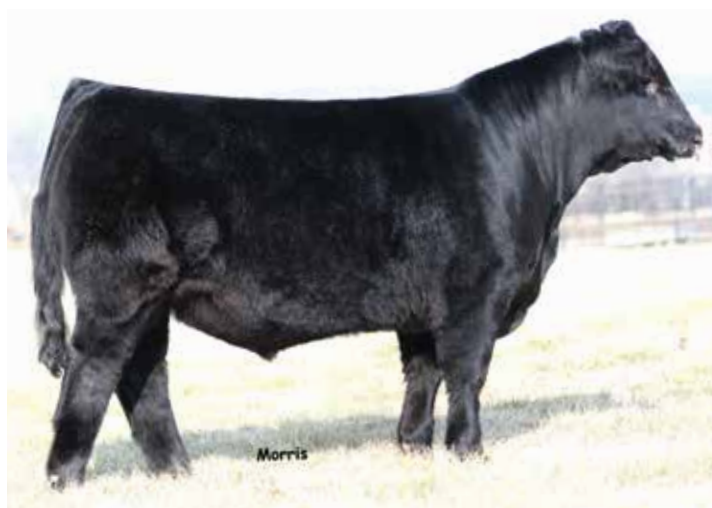
AUTO LUCKY STRIKE 118B | Sire of Lot 70

This black, polled 85% Limousin heifer is sired by the once All-American Futurity Champion Bull AUTO Lucky Strike 118B. He is the leading sire for P Bar S Ranch where they are experiencing his positive influence in their program. He is the big-numbered son of LH U Haul from the past All-American Futurity champion AUTO Luckie 246W. These two champions have been blended together to create what