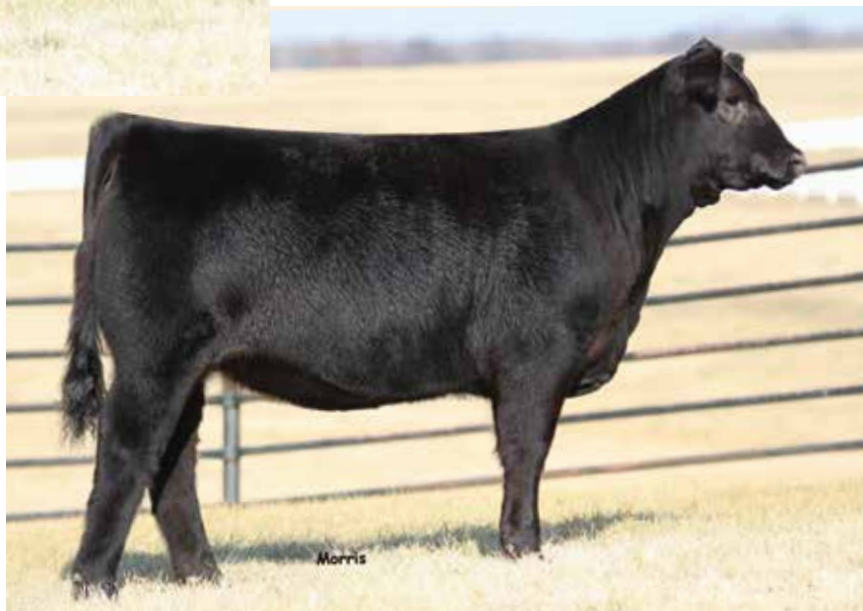
LOT 72 | AUTO DEXTER 632D