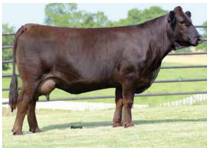
AUTO FOREVER 219X | Dam of Lot 57

AUTO Carmel 445C is a 50% polled, homozygous black bred female who is sure to impress the many that will be available sale day. She will be highlighted under the notorious yellow tent where she will have several admirers. She is a daughter of EXAR Classen 1422B and from the leading Pinegar donor AUTO Forever 219X, the proven daughter of DHVO Deuce from MAGS Manuela. Her future calf sired