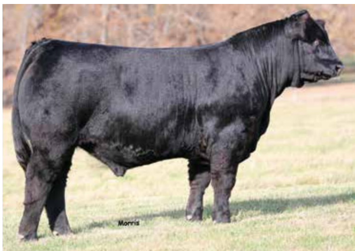
LOT 9 | AUTO HIGH LIFE 137C

Here is a full brother to Lot 5 and a full brother to the top-selling bulls in last year's Pinegar sale. They were AUTO Real Deal 150B and AUTO Sure Deal 149B purchased by Begert Limousin and TLC Ranch, respectively. Their dam, AUTO Luckie Too 423Y, has surfaced as one of the very best Pinegar donors ever in production. This Cruze son is just flat out massive and exactly what the Pinegar team imagined with they created this mating. He represents in their eyes exactly what a purebred Limousin bull should look like.