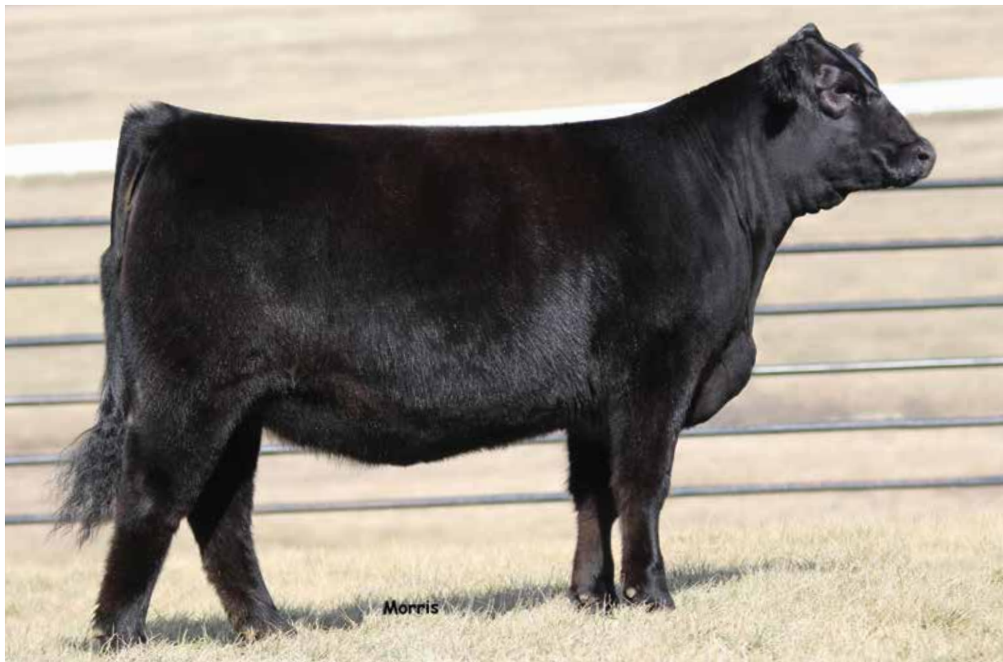
LOT 57 | AUTO CARMEL 445C