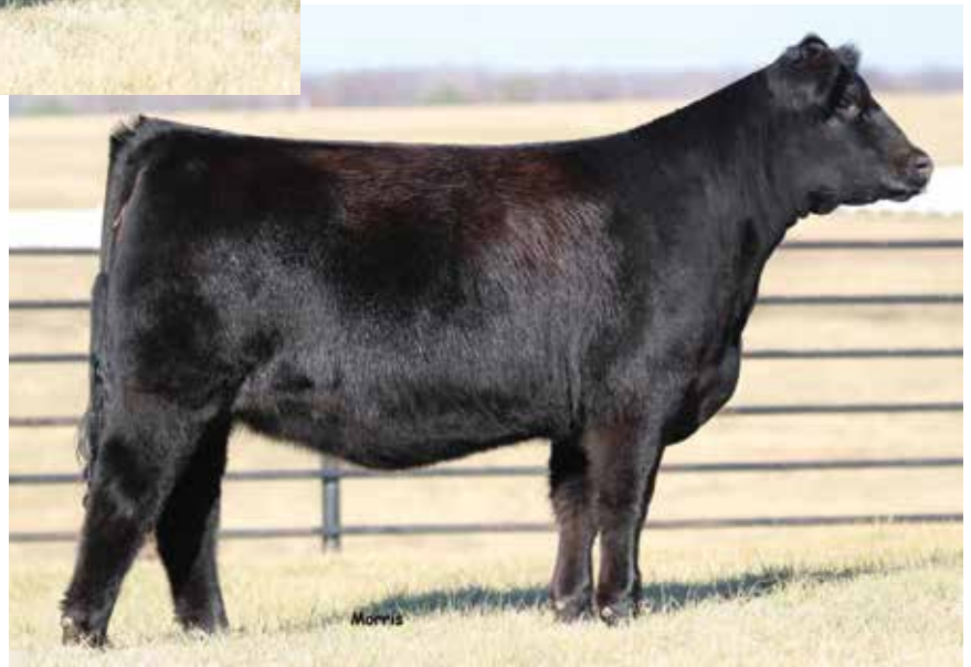
LOT 65 | AUTO CONCEAL 285C