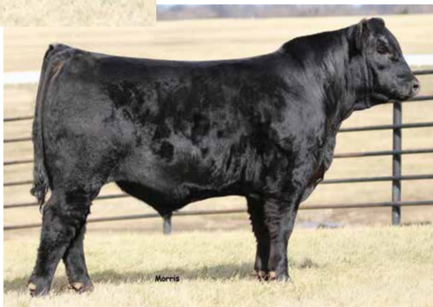
LOT 17 | ALL IN ONE 171C