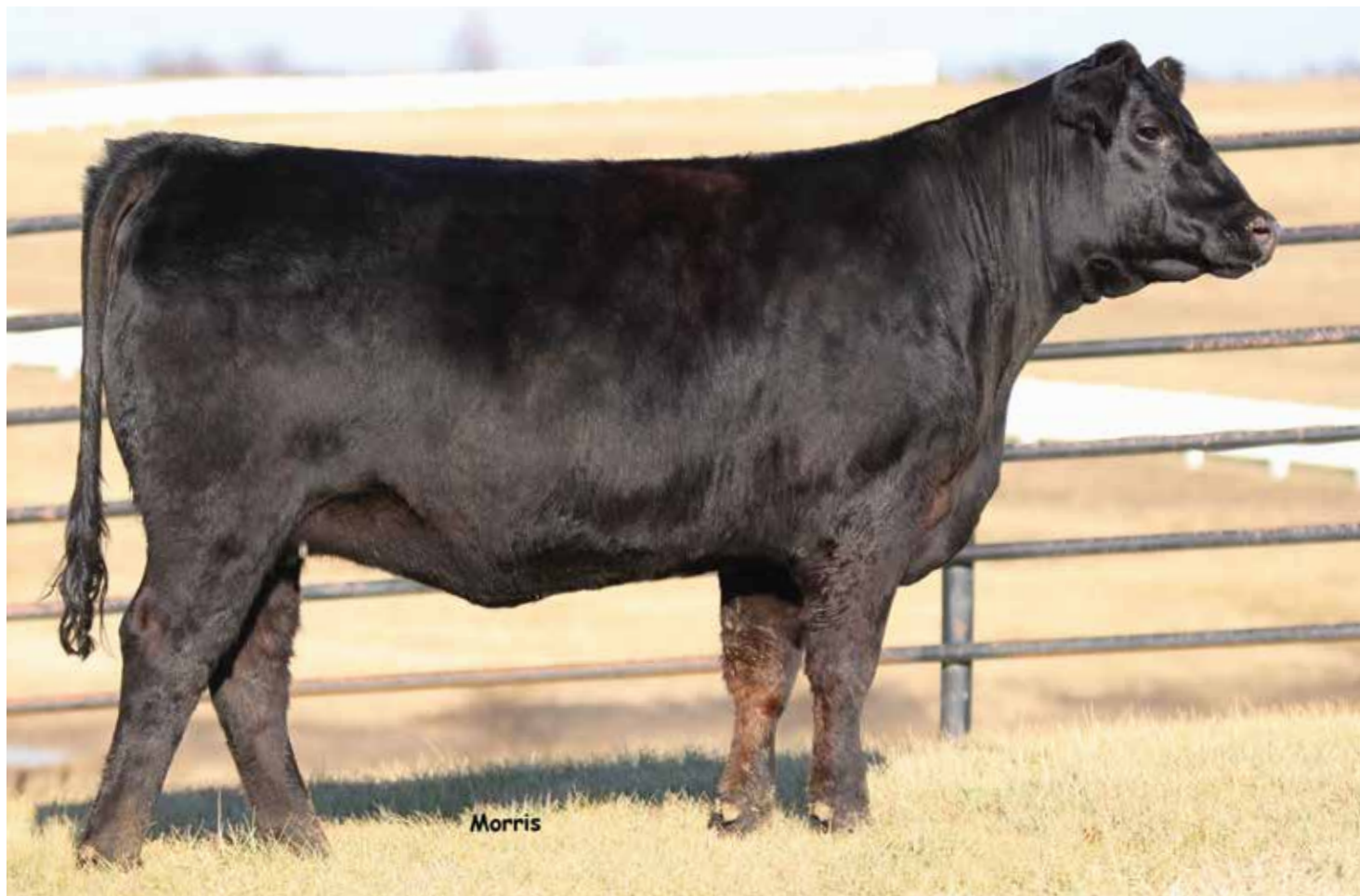
LOT 40 | AUTO CAPRICE 260C