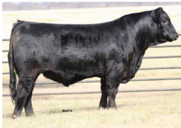
LOT 10 | AUTO POWER PLAY 561C

Here is an 81% Limousin bull who is has so much stacked in his favor! He is a son of MAGS Robin Hood 276Y and from a full sister in blood to the popular purebred bull AUTO Cruze. Take a look here; he ranks in the top 1% for MB with a 38 and TM with a 79, top 3% for WW with 83, YW with a 126 and CW with a 47, top 15% for SMTI with a 63. He also has a birth of 68 lbs., weaning weight of 850 lbs., yearling weight of 1,324 lbs. and scanned a 14.04 REA and 4.01 IMF.