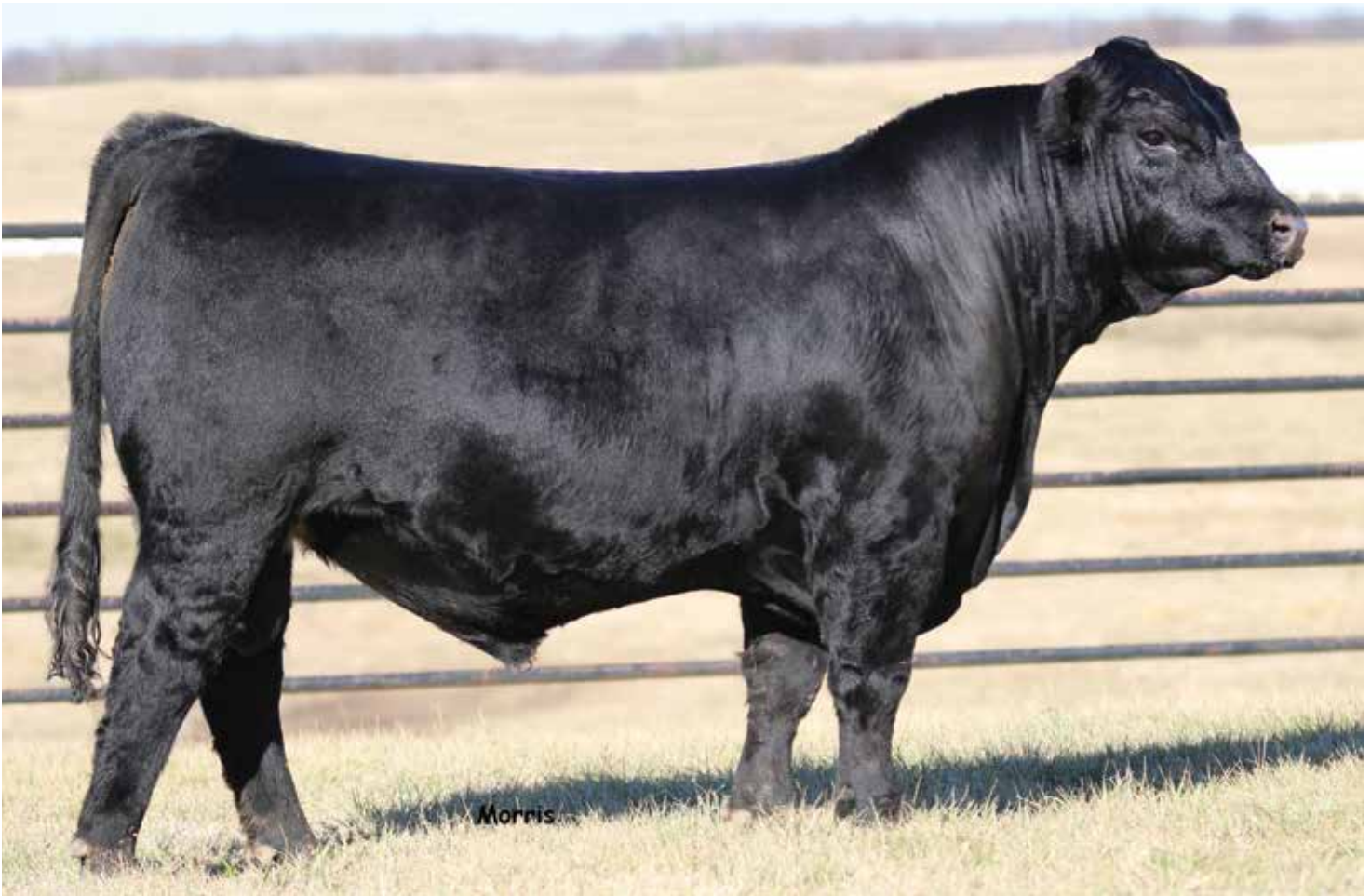
LOT 25 | AUTO TAYLORED 153C