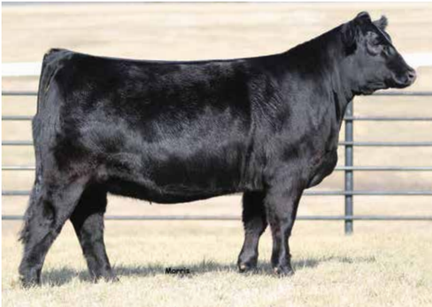
LOT 58 | AUTO CYDNEY 287C