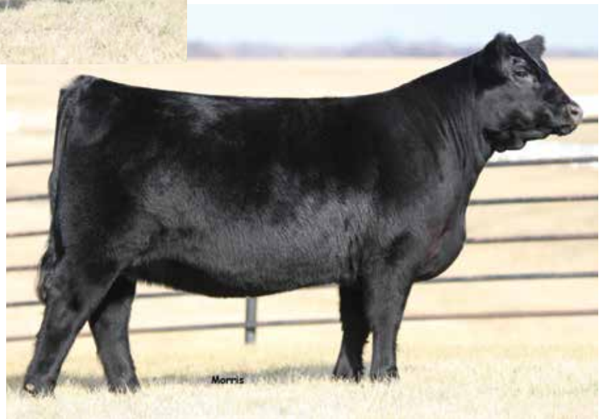
LOT 59 | AUTO CHAPERALL 406C