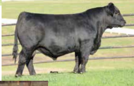
AUTO POWER PLUS 133B ET