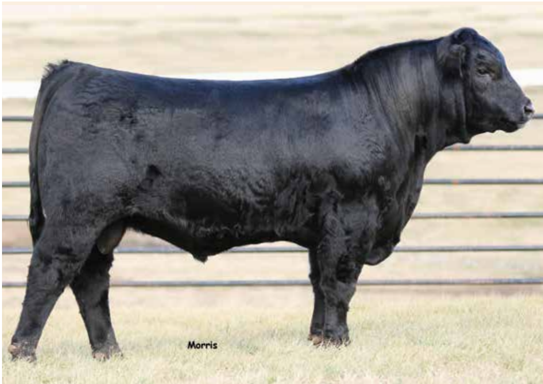
LOT 22 | AUTO RANGE ROVER 144C