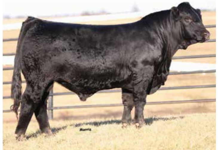
LOT 28 | AUTO SHARPER IMAGE 546C