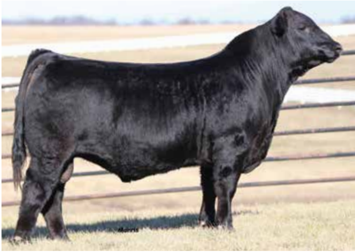
LOT 13 | AUTO TRANSMISSION 100D