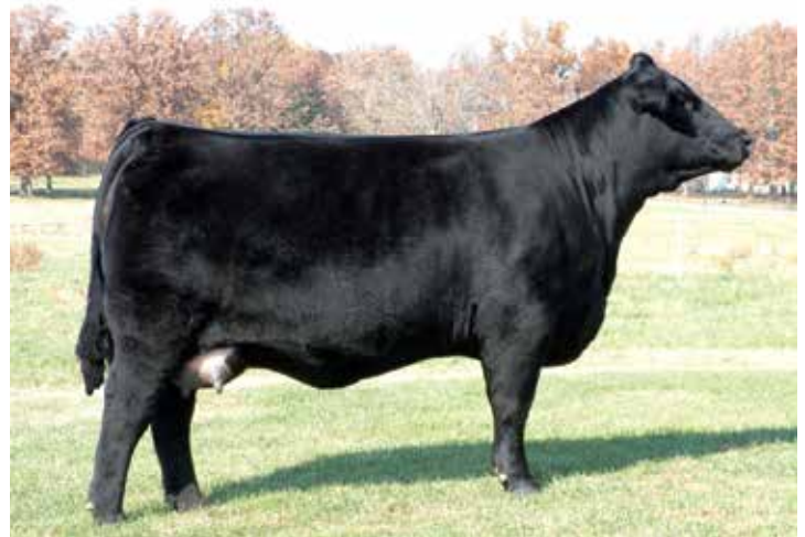
AUTO REBECA 292S | Dam of Lot 2

AUTO Direct Drive 107D could be one of the all-time great herd-sire prospects ever created in the long-standing Pinegar herd. To find a purebred bull of the caliber with this much good in him is hard to produce and hard to find. He is massive in his foot size, soft in his pasterns and moves extremely well, which we all realize this is the most important trait in any breed of cattle. We admire his moderation in frame, fleshing ability and do-ability. This beef bull combines the best in rib shape, volume and still maintains plenty of thickness. He just happens to be a son of one of the all-time great Lim-Flex donors in the entire breed, AUTO Rebeca 292S. There are so many champions