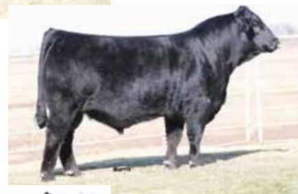
MAGS ALL-STAR 700A