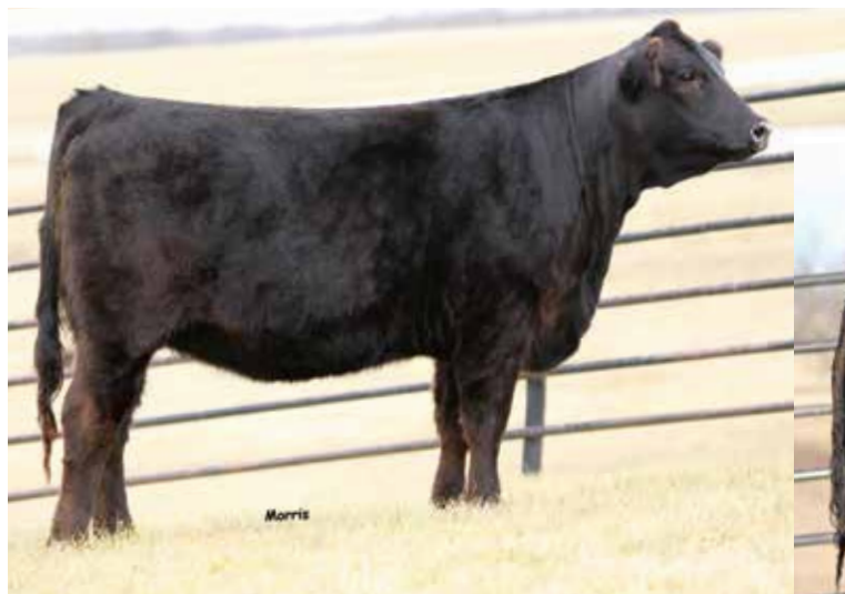
LOT 46 | AUTO CUDDLES 622C