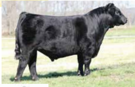
AUTO REAL DEAL 150B