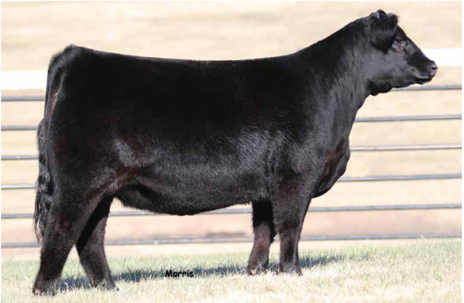
LOT 56 | AUTO LUCKIE LADY 280C