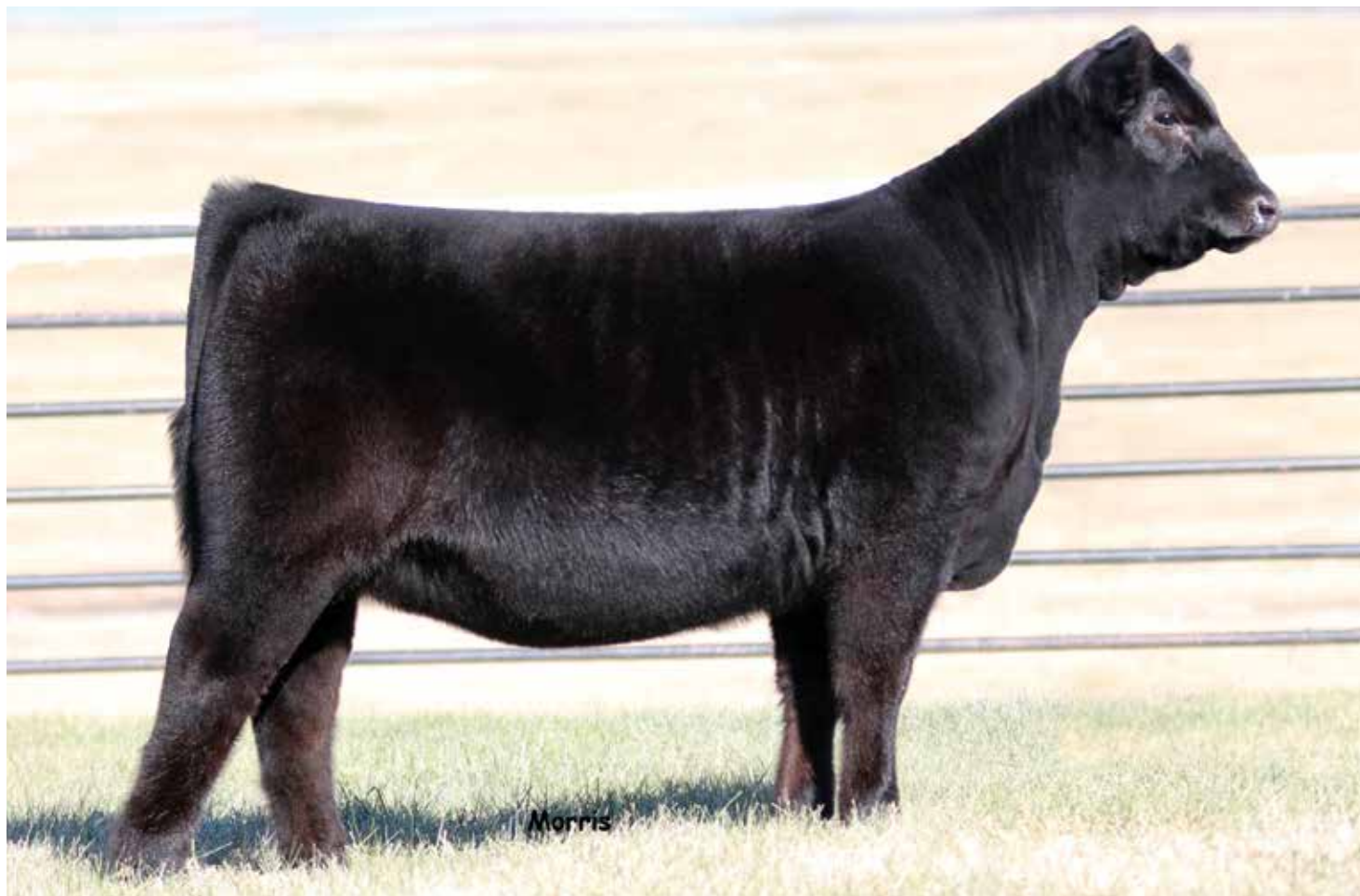
LOT 69 | AUTO DANA 265D