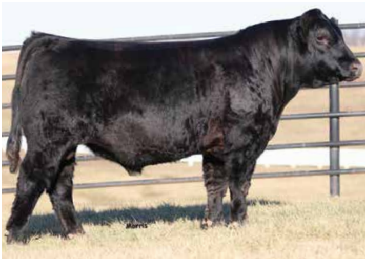
LOT 30 | AUTO CRAFTSMAN 569C