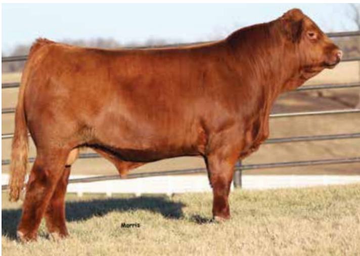
LOT 15 | AUTO WRANGLER 549C

Full brother to Lot 13 and one amazing herd sire prospect. This 42% Lim-Flex blends two of the breed's finest purebred Angus lines together in SAV Pioneer and SAV Providence and blends two of the breed's top purebred Limousin in HSF Wall of Fame and MAGS Manuela. This TMCK Hydraulic son ranks in the top 2% for YW with a 128, CW with a 50, top 3% for WW of 82, top 10% for SC with a 1.20 and SMTI with a 67. His cool look, flawless design and excellent structure make him a powerful lot in this breed-leading sale.