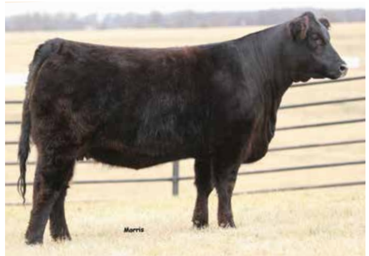
LOT 49 | AUTO CERISE 621C

Due 4.2.17 to AUTO Power Plus 133B (HB/HP) 615C has had that brood cow luck since the day we preg checked, she bellied down early and impressed us with the female she has turned into the past few months. We knew all along she had the ability to be a great one, and she looks the part. These EXAR Counsel calves haven't let us down either, they are consistently good. One of the major advantages of using Counsel is the tremendous marbling traits he brings to the equation, in AUTO Cotter's case, she ranks in the top 1% for both MB and SMTI.