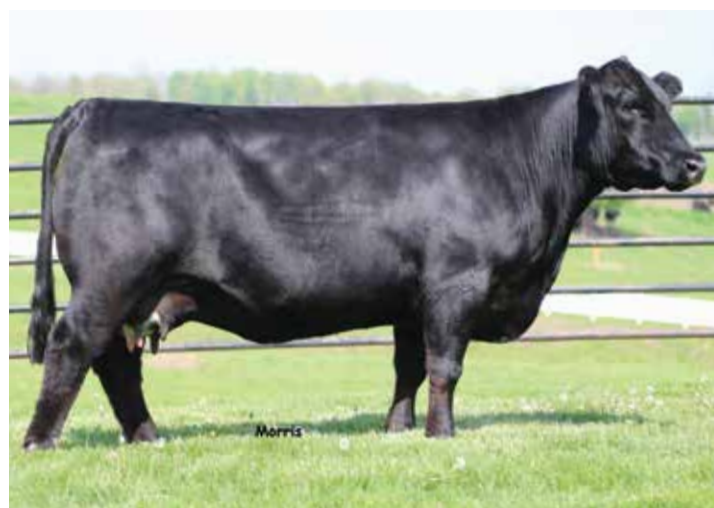
PBRs DUTCHESS 790X | Dam of Lot 3

AUTO Cash & Carry 101D is appropriately named. If you are in need of a herd-sire prospect to add extra pounds, more thickness and a uniform look to a future calf crop, then we urge you to consider this 62% Lim-Flex. This big-footed, well-traveling bull has an appealing look to him and one you know will sire a set of calves that have that unique profile and design. He is a son of AUTO King James, the leading son of the big-numbered COLE Windfall 144W from the many-time show champion female, AUTO Luckie 246W. He is owned by Burnett Brothers in Texas and was a past Ozark Empire Fair grand