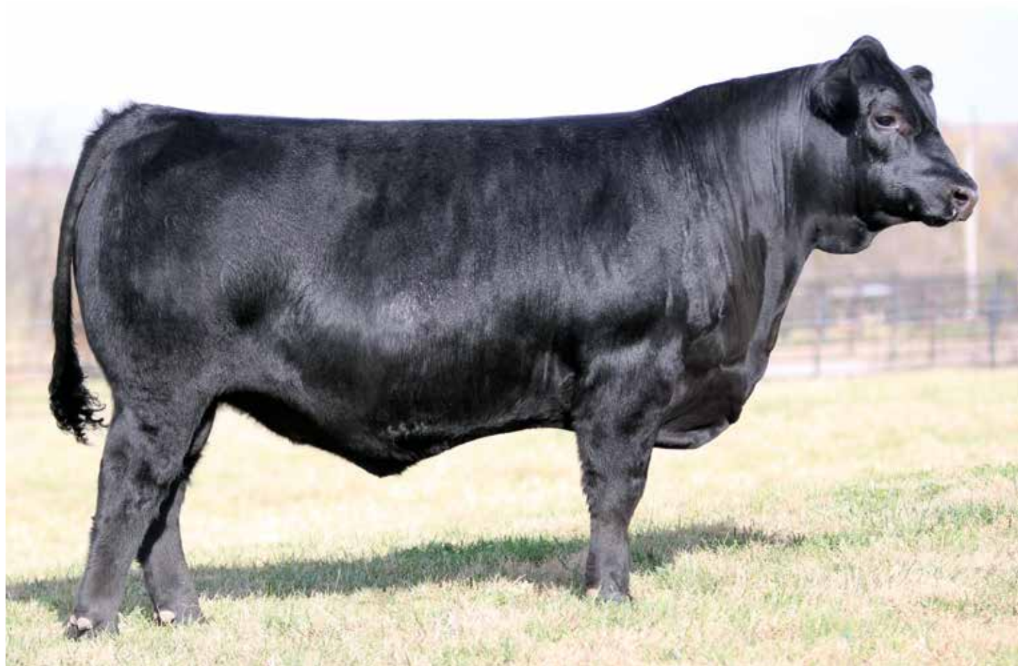
LOT 1 | AUTO ACE VENTURA 557C