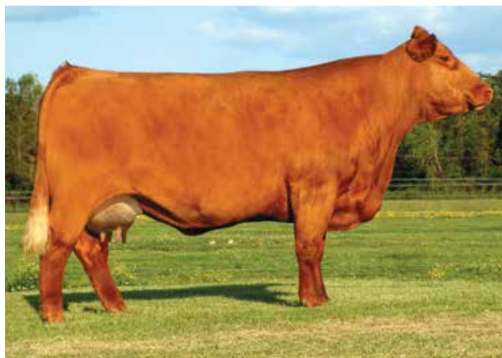
CARROUSELS PEACHES 4330P | Dam of Lot 35

What a great donor female in the making! AUTO Copy Cat 218C is an extremely well-made female from the heart of the 26-year running program at Pinegar Limousin. She is a daughter of the Angus sire PVF Insight and from the elite Pinegar donor Carrousel Peaches, the full sister to the once national champion Carrousel Piña Colada. This female ranks in the top 1% for REA with a .99. She scanned a 13.43 for REA and 3.56 for IMF. AUTO Copy Cat 218C is moderate in