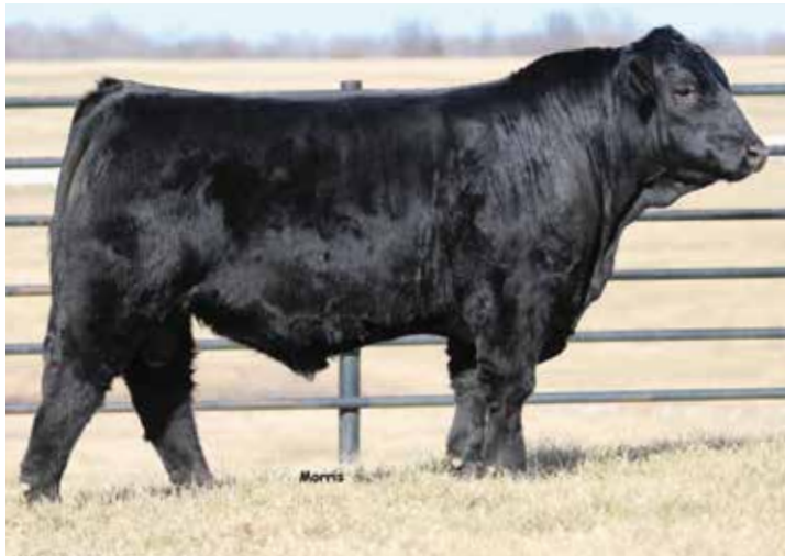
LOT 7 | AUTO FULLY LOADED 159C