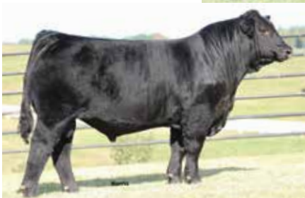
AUTO SURE DEAL 149B