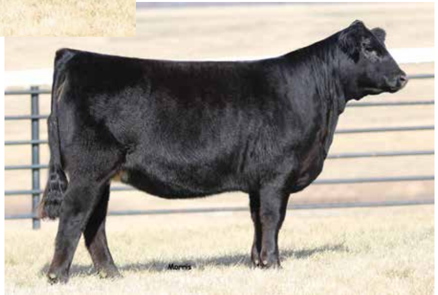
LOT 63 | AUTO CECE 482C