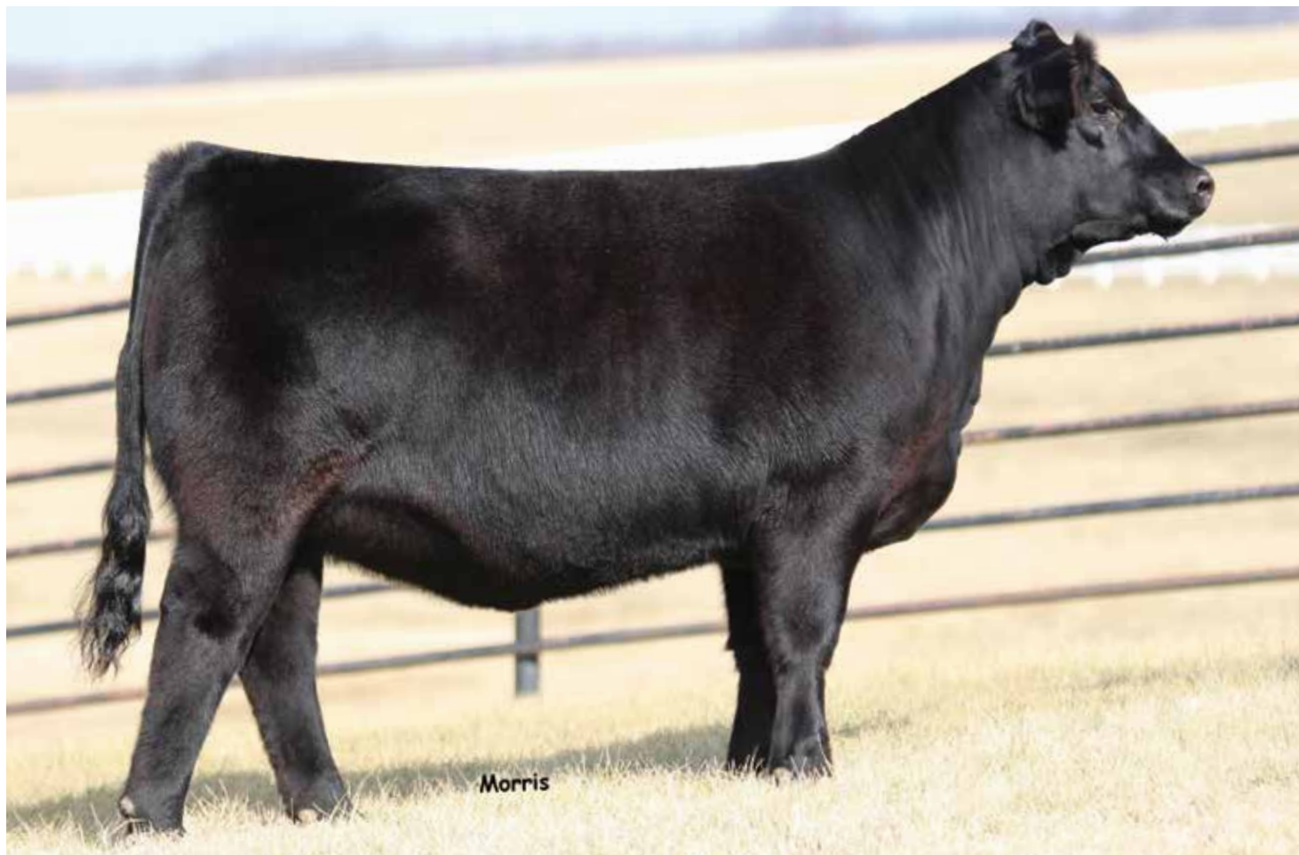
LOT 68 | AUTO DAISY 208D