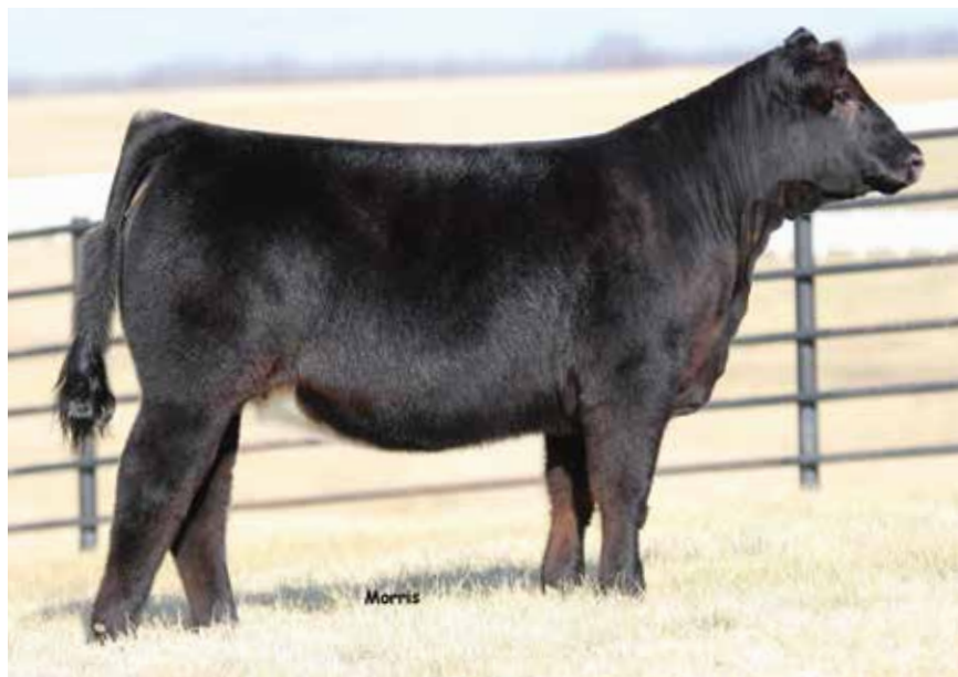
LOT 71 | AUTO DYNA 254D