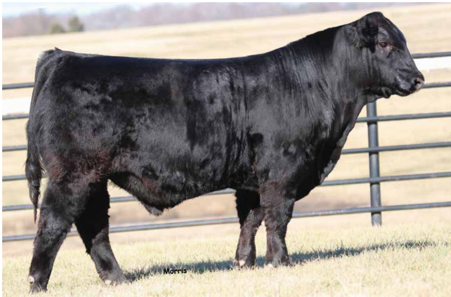
LOT 5 | AUTO SHARP SHOOTER 176C