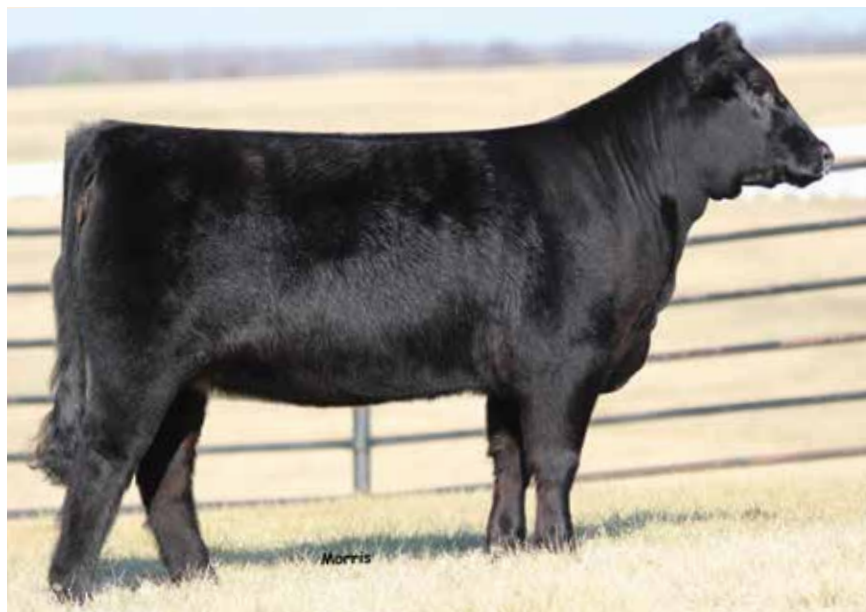
LOT 73 | AUTO DOT 227D