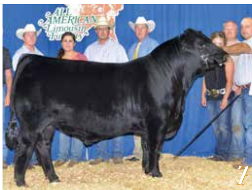
7 AUTO LUCKY STRIKE 118B Owned by: P Bar S Ranch 2015 AALF Grand Champion Bull 2015 American Royal Grand Champion Bull