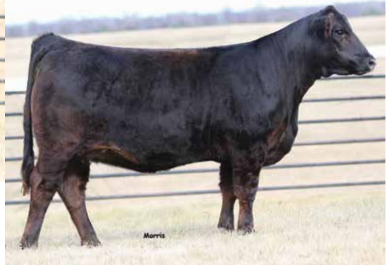
LOT 45 | AUTO CHARLA 270C