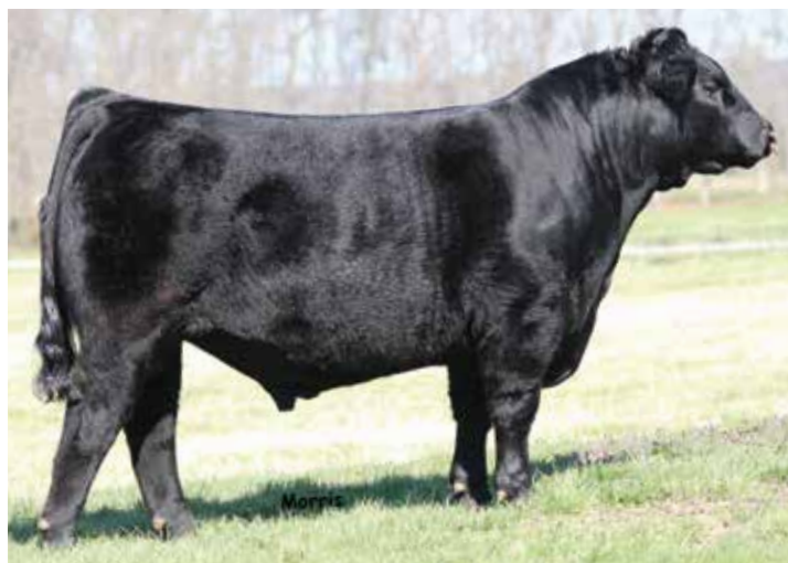
AUTO REAL DEAL | Service Sire to Lot 40

This Lim-Flex heifer is the result of the blending of two of the very best purebred Angus lines of cattle in Connealy Consensus and Rito 112 of 2536. This daughter of MAGS Acapulco is from the female MAGS Abeda. She just happens to be one of the highest marbling females in the entire breed ranking in the top 1% with a .83 and $MTI with an 80. She also scanned a 6.33 for IMF. If you want to buy into a female