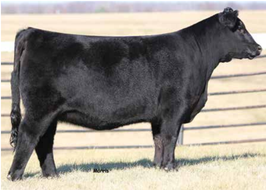
LOT 64 | AUTO CAMDYN 474C