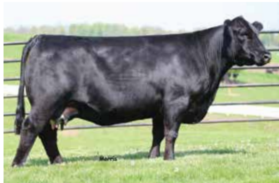
PBRs DUTCHES 790X | Dam of Lots 22 - 25

AUTO Range Rover 144C is the complete package; his balanced EPD profile, low actual birth weight and scanned REA and IMF data on top of the fact that he is homozygous polled, homozygous black make him extremely appealing on paper. Then when you study his type, he is so true to the ground, offers a great deal of reach and flexibility on the move and is as good topped and shouldered as they come. The bow on this attractively wrapped package, is the fact that his dam, PBRs Dutches 790X is one of most desirably made females in the Lim-Flex population and has proven herself for us, Stowers Limousin and Milam Cattle Co. His data reads impressive with a spread of 0.4 BW to 109 YW.