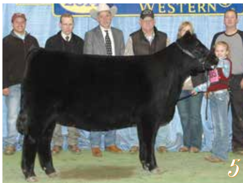
5 AUTO MABELLINE 267Z Owned by: Mikah Edwards 2015 NWSS Grand Champion Lim-Flex