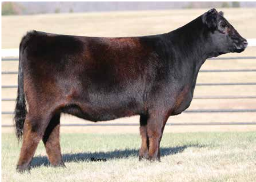
LOT 38 | AUTO RHONDA 225C