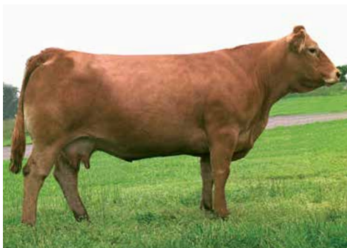
STBR DEMETRIA 669D | Dam of Lot 54

A full sister to Lot 53, AUTO Camile 261C has an impressive historical fullblood pedigree that is still popular today. Staying true to the original purpose of the Fullblood Limousin cattle, 261C ranks in the very top 1% of the breed for YG and FT.