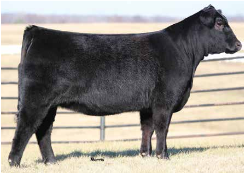
LOT 66 | AUTO CALLEN 283C