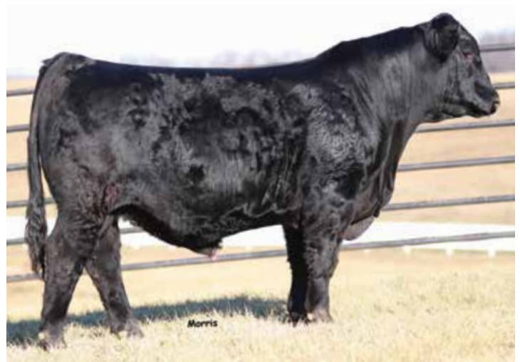
LOT 8 | AUTO HIGH CALIBAR 165C

AUTO High Caliber is a 50% Lim-Flex black, polled beef bull. We admire and appreciate his overall mass, extreme depth of body and the amount of fore rib he has. He is a true breeding bull. Look at the amount of thickness and mass he has down his top and out of his hooks to pens. This son of SAV Brilliance 8077 is from one of the very best Pinegar donors, AUTO Forever 219X. She is a daughter of the National Champion DHVO Deuce and from the now deceased MAGS Manuela. AUTO High Caliber 165C ranks in the top 15% in SC with a 1.10, MB with a .29 and SMTI with 61.