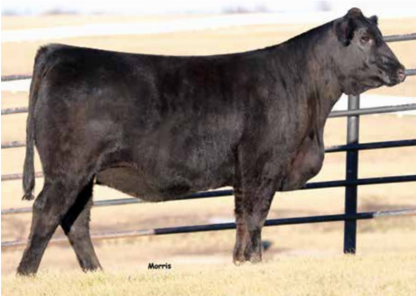
LOT 36 | AUTO CHENAI 222C