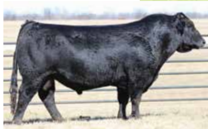
AUTO FIRST CLASS 116A