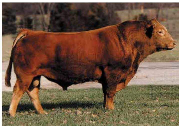
AUTO CLIFF HANGER 194D | Service Sire to Lot 55

Sired by one of the most prominent and time-tested Fullblood sires in the breed, SOGF Special K 247 and a maternal granddaughter of the great Laura's Accent donor. These genetics are ultra predictable and were a sure thing from the time we opened the semen tank to mate her parents. AUTO Coral 638C is in the top 3% for MK and top 4% for TM on the maternal side of the equation, and terminally she is in the top 4% for YG and top 2% for FT.