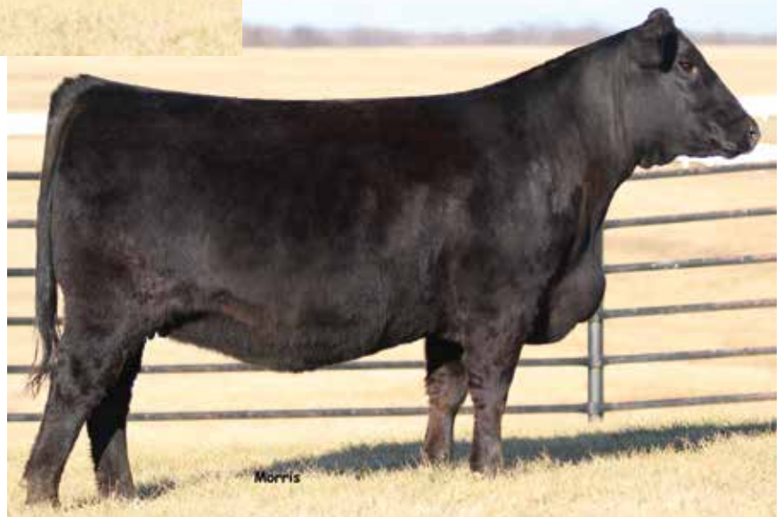
LOT 37 | AUTO FASHION 217C