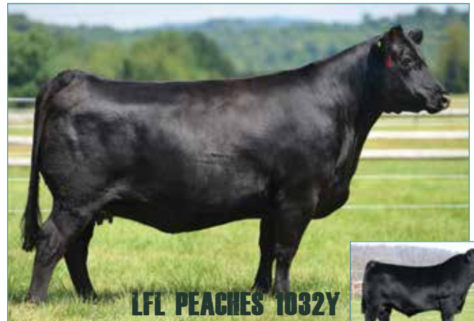
LFL PEACHES 1032Y

Dam of Lot 11C TMCK CAMDEN YARDS , Sire of Lot 11C