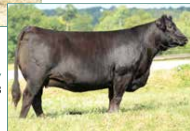
SBLX MARIA 662Y Dam of Lot 23

CONSIGNED BY: SUGAR BUSH CATTLE, ALLEN, MI