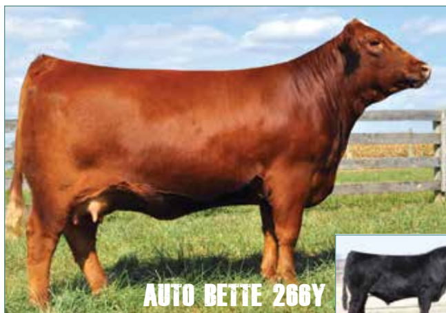
AUTO BETTE 266Y MAGS ANCHOR, Sire of Lot 20