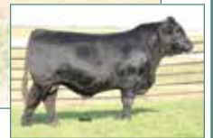
AUTO ANGELINA 225A