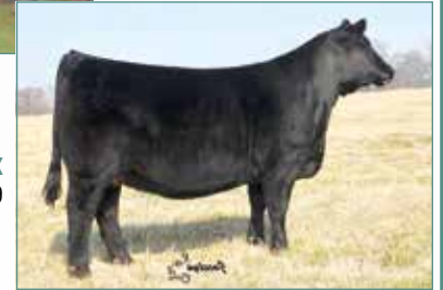
JCL UNDYING LOVE 013X Dam of Lot 9