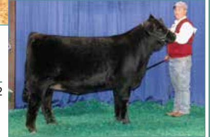
MAGS WASSAIL Dam of Lot 12