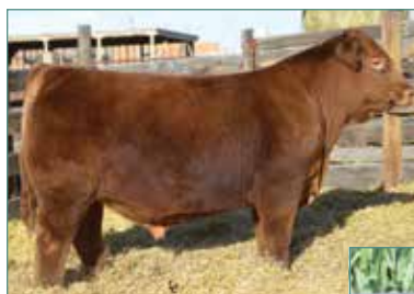
AHCC COWBOY KIND Sire of Lot 17

Here is one of the first opportunities to invest in the service of the highly popular, $42,250-syndicated, AHCC Cowboy Kind C595, the lead bull in the 2016 National Western People's Choice Champion Lim-Flex pen. The elite donor, STO Starla 6803S, is one of the proven foundation Lim-Flex donors in the industry. The blending of this female and popular sire present an excellent genetic buying opportunity the help further the buyer's pursuit of outcross pedigree, high-performance, homozygous polled cattle.