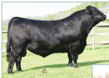
TMCK CASH FLOW Sire of Lot 18