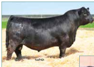
HA COWBOY UP 5405 Sire of Lot 19