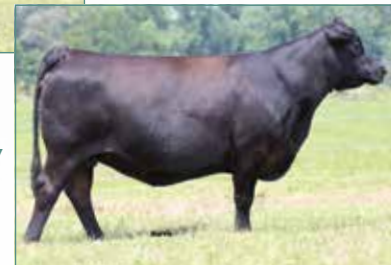
NHCA XCELLENT 327Y Dam of Lot 21

CONSIGNED BY: EDWARDS LAND & CATTLE CO., BEULAVILLE, NC & FREEBIRD FARMS, MCMINNVILLE, TN