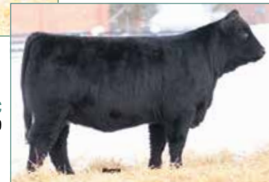
CELL 5065C Dam of Lot 19

CONSIGNEE BY: SUGAR BUSH CATTLE, ALLEN, MI