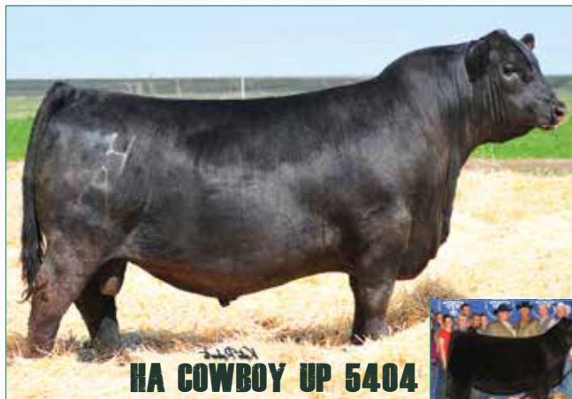
HA COWBOY UP 5404

Sired by the $350,000 recent addition to the Express bull pen. Cowboy Up ranks in the top 1% of the Angus breed for WW, YW, CW, $W, $F and $B EPDs. Cowboy Up is wide-based, big-bodied, sound-made with excellent feet and legs. He will work with Touch Me Gently, the dam of Colt Cunningham's winning heifer LH Belle 015B.