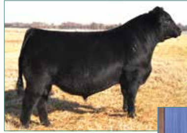
EXAR DENVER 2002B Sire of Lot 12

This represents one of the very few opportunities to invest in genetics out of the famed MAGS Wassail donor, who carries the moniker of a many-time national champion female and who happens to be dam to one of the great show females of our generation, LLJB Absolute Style 3056A! The sire, EXAR Denver was a member of the National Western champion carload for Express Ranches and his progeny are known their stoutness, growth, foot size and look. The bottom line is, this elite mating promises to produce homozygous polled, phenotypically exceptional calves that project the ability to compete at the highest level.