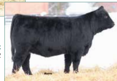
CELL 5065C Dam of Lot 22

CONSIGNED BY: SUGAR BUSH CATTLE, ALLEN, MI