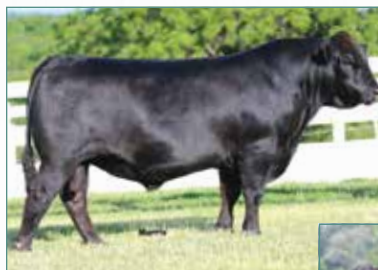
HBRL GENESIS 404B Sire of Lot 21