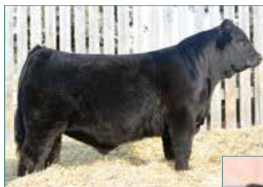
RIVERSTONE CROWN ROYAL Sire of Lot 22