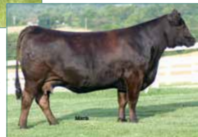
AUTO EXCEPTIONAL 282S Dam of Lot 7

Additionally, they offer calving-ease (CED 15), growth (YW 128), and breed-leading maternal ability (MA 34). AUTO 282S offers a proven track record and these embryos are sure to be EXCEPTIONAL cattle that will add to her legacy.