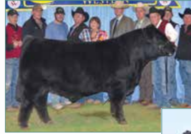
HUBB BULLET PROOF Sire of Lot 9