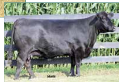
SSTO STARLA 6803S Dam of Lot 17