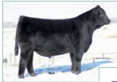
MAGS AVIATOR Sire of Lot 13

Folks, here is a true sale highlight to invest in proven championship genetics! The donor-dam, MAGS Wellrounded, is sound-structured, bold-ribbed, muscular and attractive patterned who produces at the highest level. The sire in this designer mating, MAGS Aviator, was a member of the 2014 National Western Champion Carload and his progeny are known for their supreme style and structural correctness. This elite mating promises to produce double homozygous, huge-numbered, phenotypically exceptional calves that project to compete at the highest level in show rings across the country. Invest today.