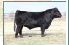
AUTO ANGELINA 225A