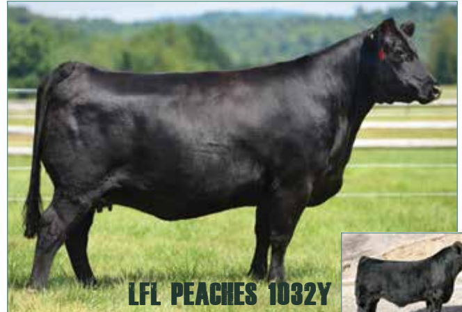
LFL PEACHES 1032Y

Dam of Lot 11A TMCK HYDRAULIC , Sire of Lot 11A