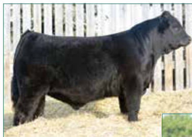
RIVERSTONE CROWN ROYAL Sire of Lot 23