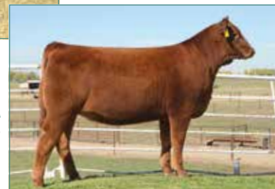
MAGS ZOSETTA Dam of Lot 16