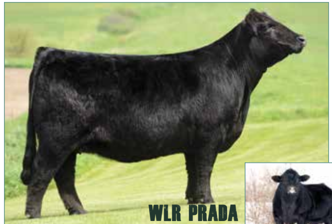
Dam of Lot 14 WLR PRADA , Sire of Lot 14

Attention folks, here is a huge opportunity to invest in PUREBRED genetics out of the wildly popular and many-time national champion female, WLR Prada! The sire, TMCK Durham Wheat, is catching fire in a big way and beginning to make an impressive mark on the breed. He consistently sires big-footed, heavy-structured, stout-featured cattle that carry an impressive look. As evidence, one of the most talked-about PUREBRED Limousin females in the country is a Durham Wheat daughter, Riverstone Charmed 50C, who has claimed many all-breed championship banners for the Ratliff's Cherry Creek Family of Westphalia, Kansas. Invest with confidence and be a part of the one of the breed's next great PUREBRED movements.