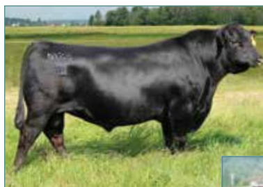
G A R PROFIT Sire of Lot 7

This progressive mating represents some of the top genetics from Buck Ridge. These HOMO black, HOMO polled 50% Lim-Flex progeny will combine the best of both breeds. AUTO Exceptional 282S is the top donor at Buck Ridge who currently has 61 registered progeny operating in some of the best herds in the industry. Recently, she produced the top-selling bull in the Buck Ridge 2016 online sale, HBRL Denver 485B; and featured a highlight son in the 2016 Pinegar Limousin Herdbuilder Sale, AUTO Lode Up 137B. G A R Prophet is a standout Angus sire known for producing real-world cattle that add profit to a cowherd. These embryos top the charts on paper with top 1% $MI at 88 and top 1% MB at 0.98.