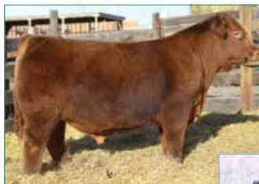
AHCC COWBOY KIND Sire of Lot 15

Matings of this caliber and quality are rarely offered to the buying public, but the 2016 Sale Of Sales is your opportunity to buy into some of our breed's elite. Study the unique combination of the recently syndicated $42,250, AHCC Cowboy Kind C595, and the tremendous purebred donor, AUTO Poppy 421Z, who goes back to the legendary MAGS Manuela cow family and ranks in the top 15% for MB. This combination of numbers, predictability and unique pedigree twist make this genetic lot one to invest in sale day.