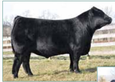
EF XCESSIVE FORCE Sire of Lot 24

Sired by a past national champion Lim-Flex sire and one of the leading show sires of the Limousin breed. His calves are topping sales, winning shows and are now in full production and showing the breed what they can do. AUTO Poem 273Y is the $20,000-valued donor and daughter of S A V Bismarck from the famed MAGS Phantoms Prize. She is the dam of the Triple Crown bull MAGSWL Usual Suspect and the many-time show female WLR Tainted Love. This female continues to produce progeny beyond belief with them being sought after by only the most noted cattleman.