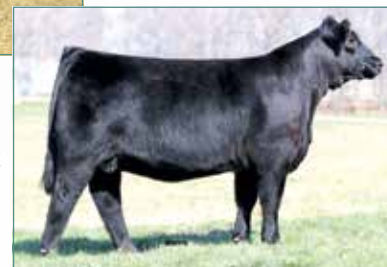
AUTO POPPY 421Z Dam of Lot 15