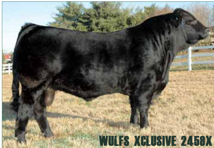
WULFS XCLUSIVE 2458X

A purebred mating extraordinaire. These embryos are full-sibs to grandson Tucker's January show heifer. The dam is one of the most moderate, deepest-ribbed, easy-fleshing full-sibs to Deuce and Trey. Sired by the highly proven purebred bull, Wulfs Xclusive.