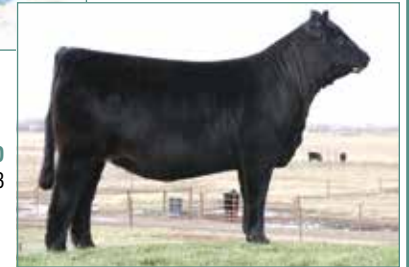
MAGS WELLROUNDED Dam of Lot 13