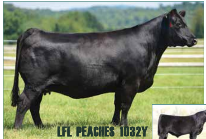
LFL PEACHES 1032Y

Dam of Lot 11B MAGS Y-AXIS , Sire of Lot 11B