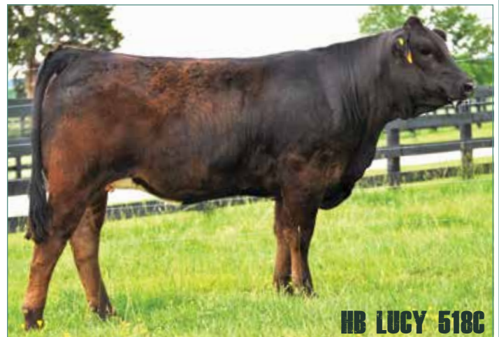
HB LUCY 518C

AI'd 4/28/16 to MAGS Y-Axis PE'd to Heritage 7008 TenX 345 (Angus)