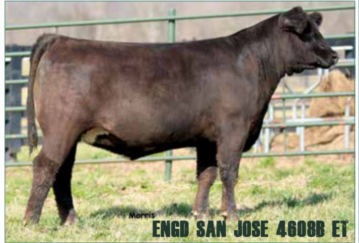
ENGD SAN JOSE 4608B ET