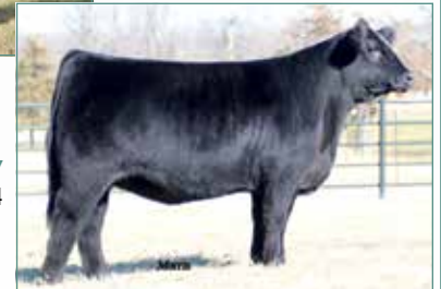
AUTO POEM 273Y Dam of Lot 24