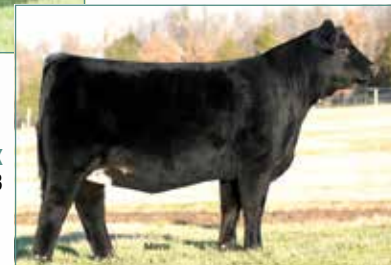
AUTO PIA 245X Dam of Lot 18