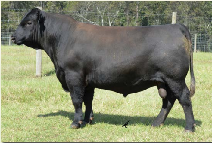
TJ 318C Sells as Lot 31.