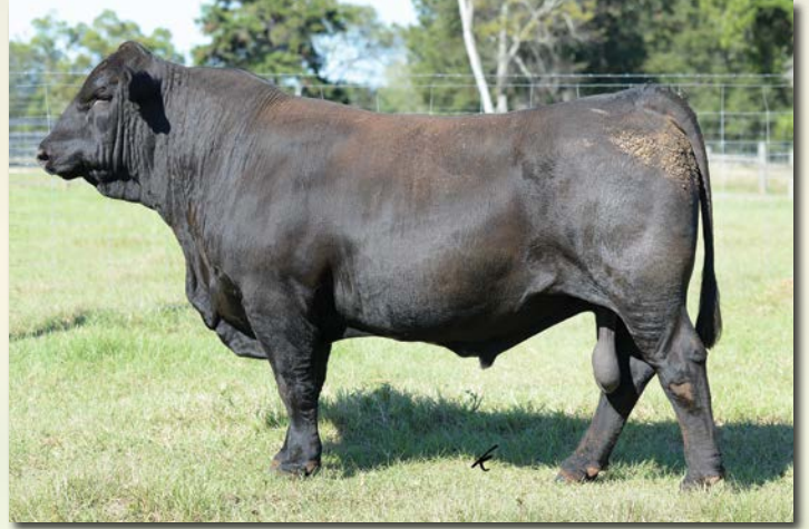
227C Sells as Lot 18.