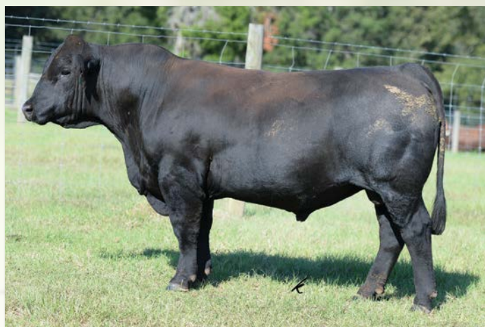
TJ 405C Sells as Lot 94.