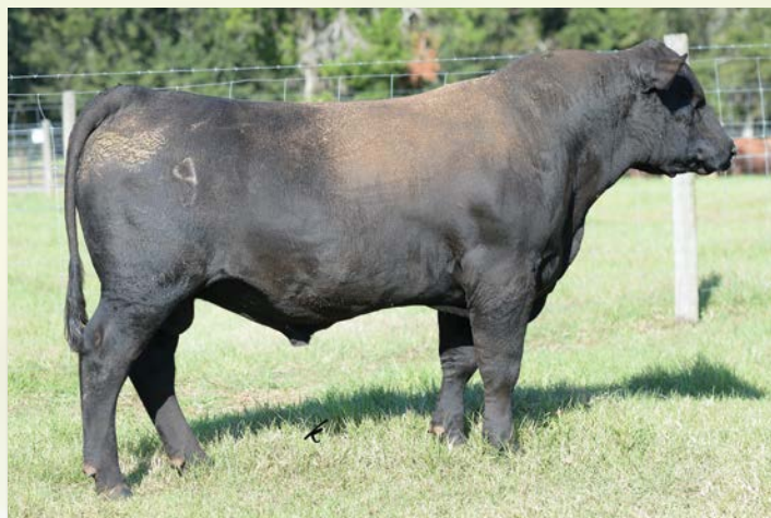
TJ 300C Sells as Lot 93.