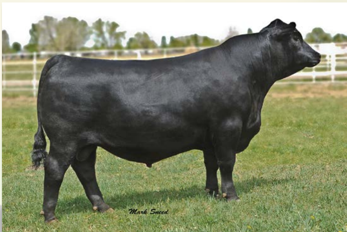
SITZ INVESTMENT 660Z Sire of Lot 186.