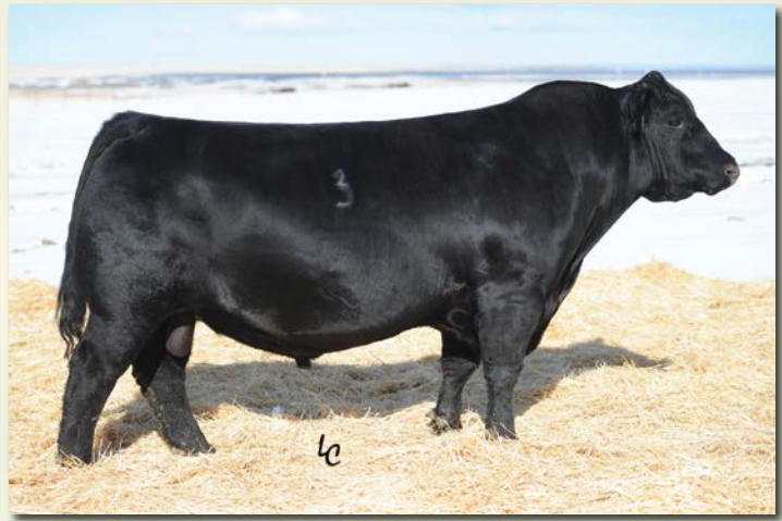
HOOVER DAM Sire of Lot 34.