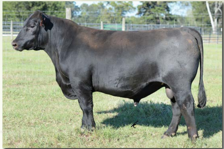
THOMAS PROPHET 55053 Sells as Lot 139.