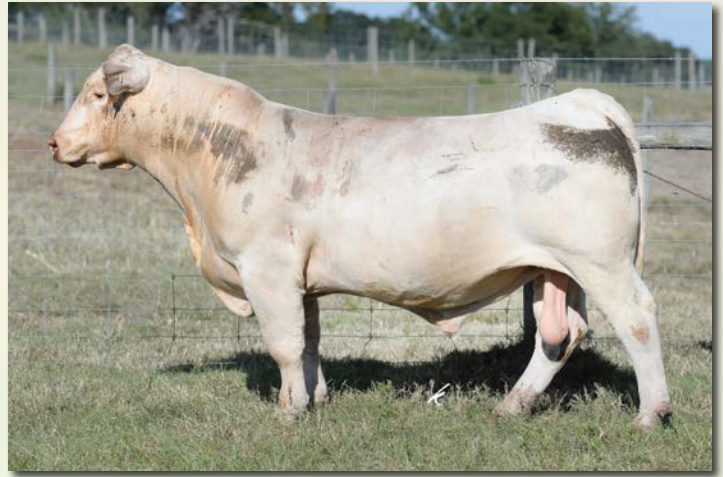
SOUTHERN BENELLI 51322 Sells as Lot 205.