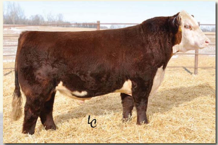
TH 71U 719T MR HEREFORD 11X Sire of Lot 239.