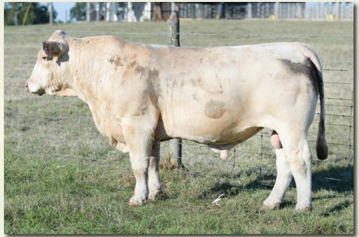
SOUTHERN WHISTLER 45573 Sells as Lot 197.