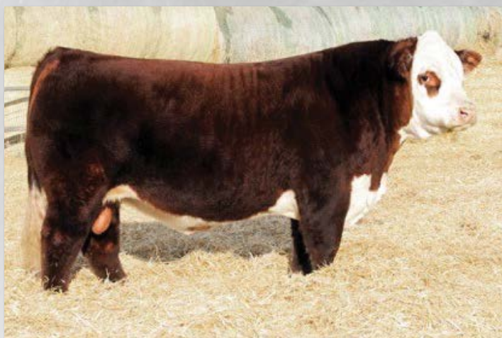
NJW 78P TWENTYTWELVE 190Z ET Sire of Lot 247.