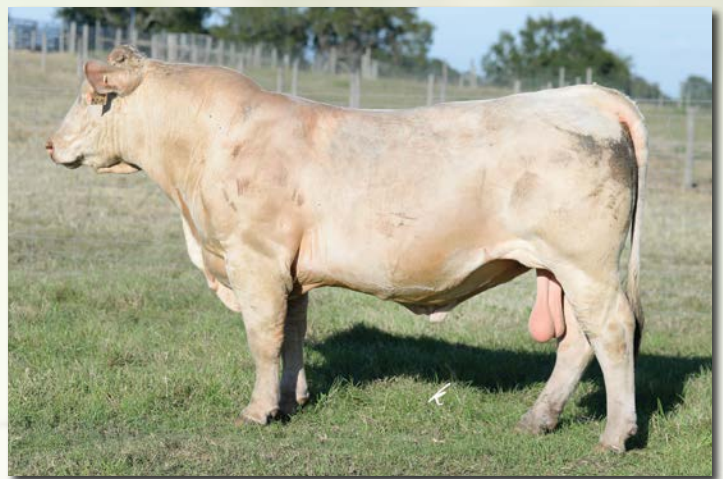
SOUTHERN ROYCE 45567 Sells as Lot 200.