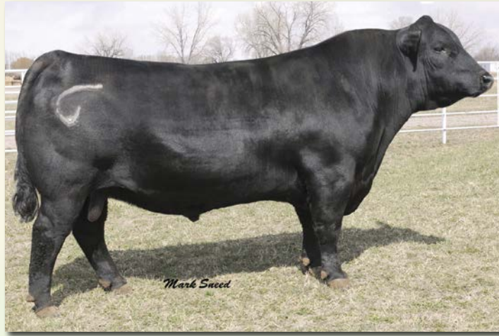
CONNELY THUNDER Sire of Lots 179, 180.

AAA 18218306 55301 PB ANGUS BD: 04/29/15