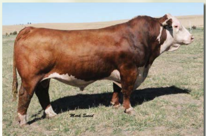
TH 223 71I VICTOR 755T Sire of Lot 229.