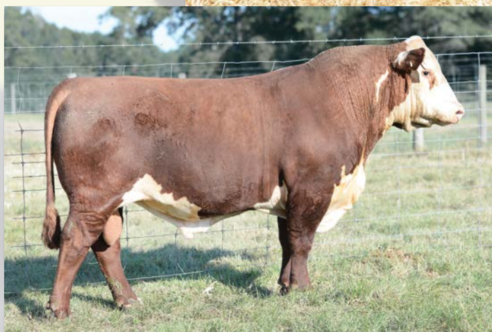
SOUTHERN LAMBEAU 45551 ET Sells as Lot 227.