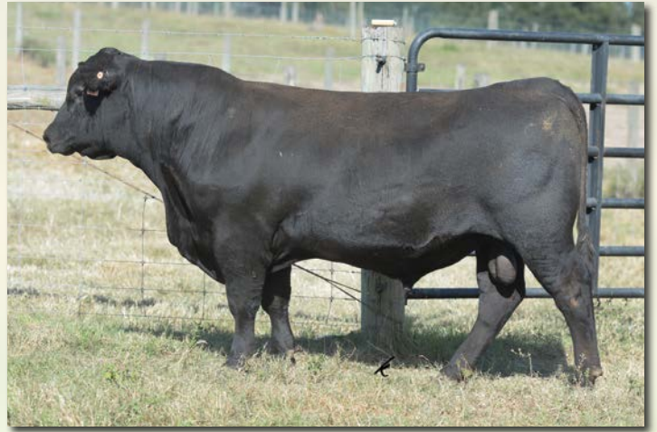
THOMAS BLACK GRANITE 55020 Sells as Lot 157.