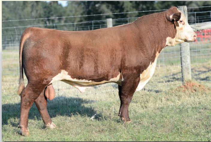
SOUTHERN MR HEREFORD 45534 ET Sells as Lot 239.