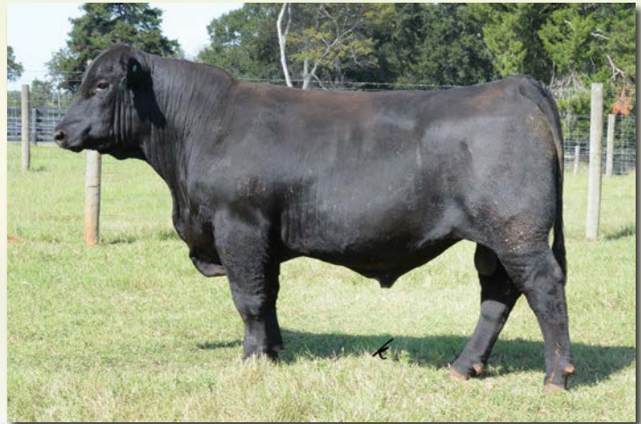
483C Sells as Lot 10.