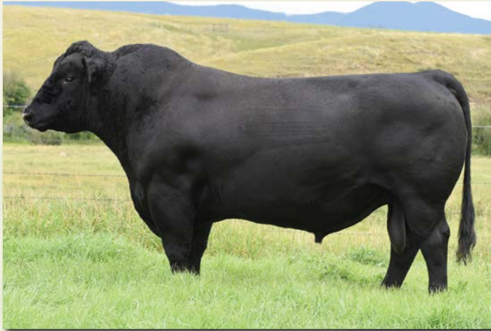
GW BAR CK BREAKOUT 667Z Sire of Lot 88.