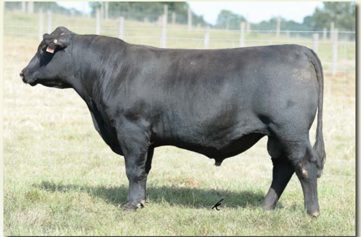
THOMAS WAYLON 55180 Sells as Lot 121.