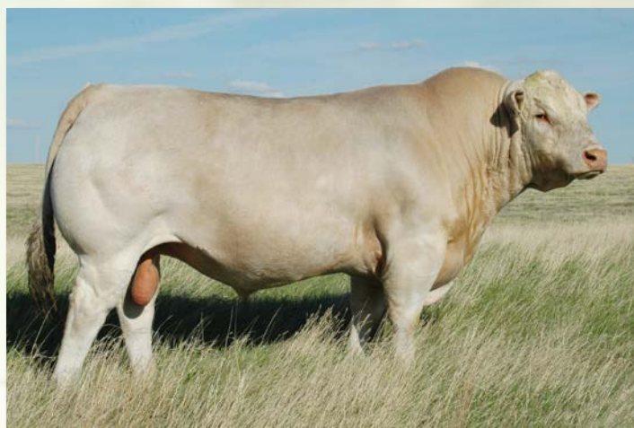
LT LEDGER 0332 P Sire of Lot 223.