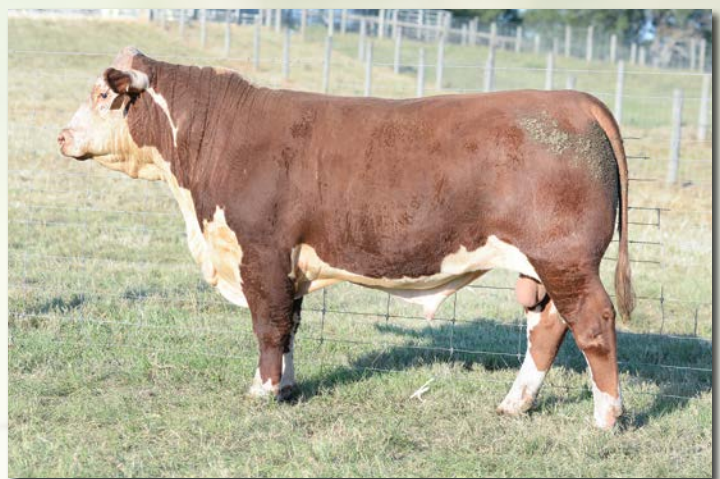
SOUTHERN MR MATERNAL 45538 ET Sells as Lot 237.