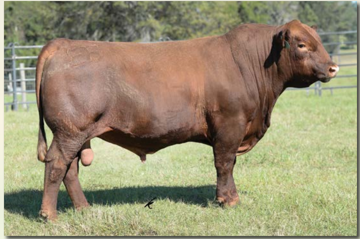
367C Sells as Lot 27.

27 367C ASA 2960609 367C 1/2 SM 1/4 AN 1/4 AR Red Homozygous Polled BD: 4/1/2015