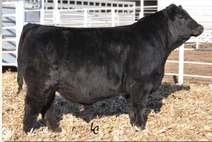
TJ MAKERS MARK 215Y Sire of Lot 54.