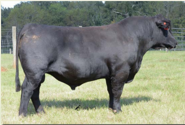
TJ 539C Sells as Lot 48.