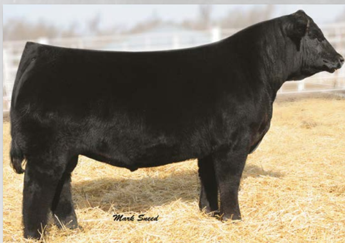
MR NLC UPGRADE U8676 Sire of Lot 60.