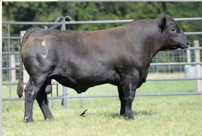
TJ 1021C Sells as Lot 32.