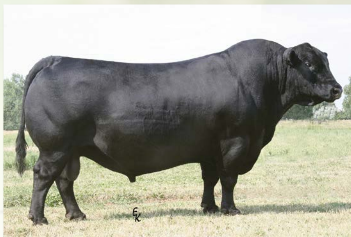
S A V FINAL ANSWER 0035 Sire of Lot 188.