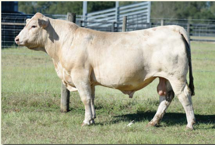
SOUTHERN PARADIGN SHIFT 51343 Sells as Lot 209.