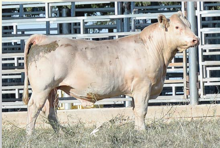
SOUTHERN PARADIGN SHIFT 51338 Sells as Lot 210.