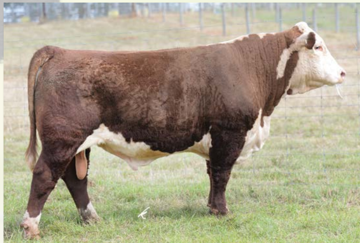
SOUTHERN VICTOR 52111 ET Sells as Lot 229.