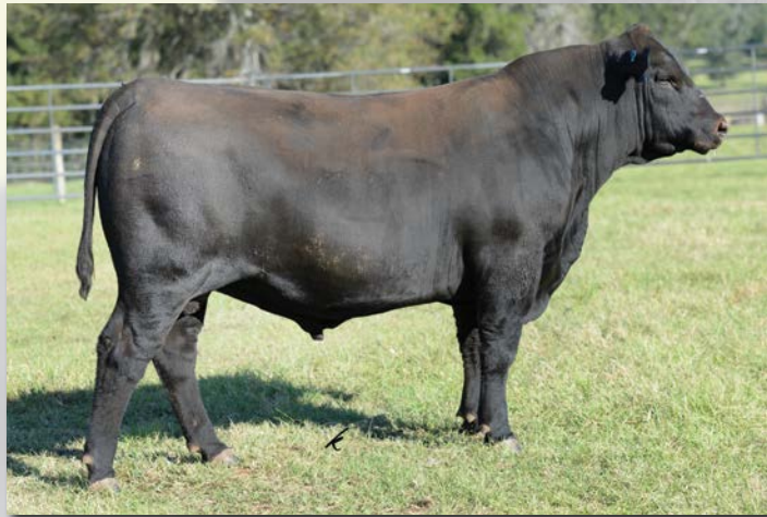
THOMAS DAYBREAK 55262 Sells as Lot 175.