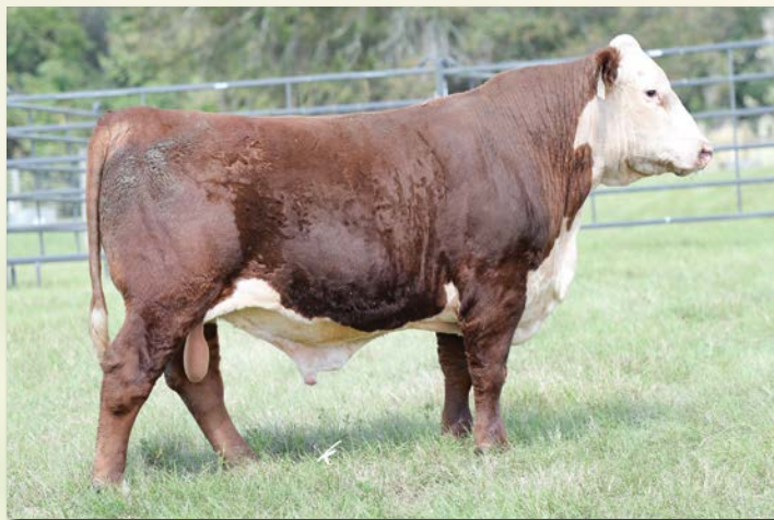
SOUTHERN STOCKMAN 51395 ET Sells as Lot 245.