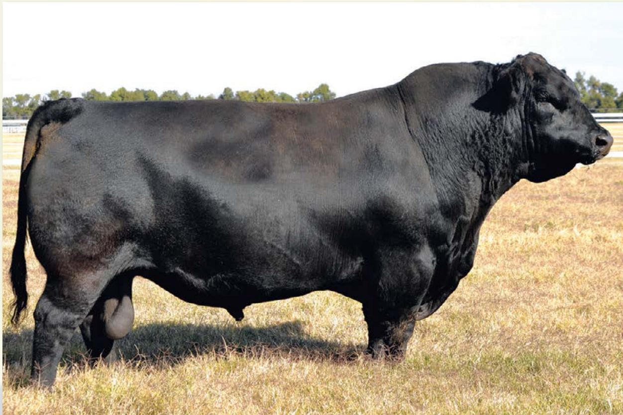
BALDRIDGE WAYLON W34 Sire of Lots 118-137.

I feel I am not alone when I say: it's hard to deny that most of the good cattle, by any standard, have at least some Angus in them. With that being said, why wouldn't you source your Angus genetics for however you're intended use from the very best breeder available? Some would say that they must sacrifice because of geographic region, or because of the risk involved with moving young bulls across the country, but those are issues Southern Cattle Company has tackled. On November 26th, we are proud to offer for sale, Angus bulls out of a cow herd that is known for its maternal strengths and adaptability, worldwide. The cows behind these bulls are the "who's-who" in the Angus industry. You can go to any of the other top programs in the nation and see the influence that the Thomas Angus Ranch has made. Most of these bulls are straight out of an extensive embryo transfer program; therefore, they offer the most current genetics and sought after pedigrees available. Not to mention the fact that, you can put together full brothers or bulls that are at the very least, bred extremely similar to use on large groups of cattle in a multi-sire group or individually to create an extremely uniform set of calves for sale or replacement heifers. These bulls have either been raised in the Southeast or been with us for the last year. They are acclimated, and are ready to infuse some of the best Angus genetics into our Southeastern region or wherever you should choose to haul them.