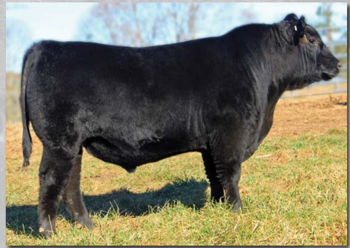
UPCHURCH VOLUME 422 MR SCC Full brother of Lot 192.