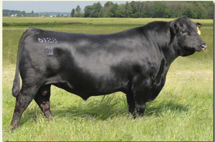
G A R PROPHET Sire of Lots 138-154.