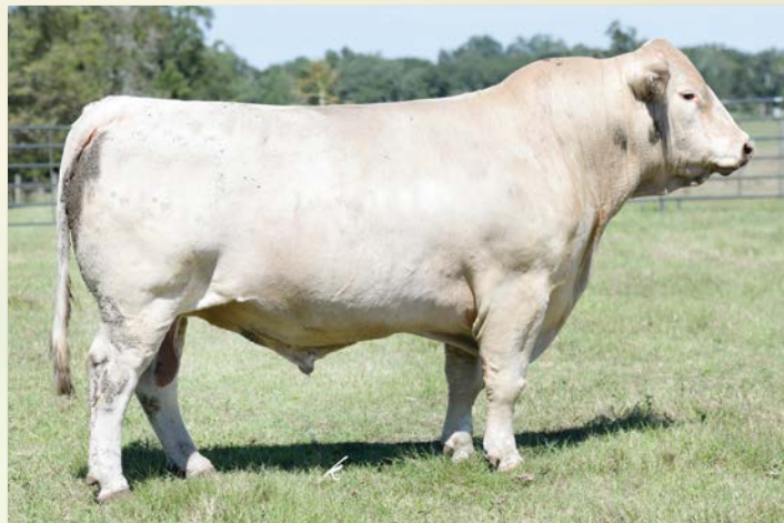
SOUTHERN RIO BRAVO 35085 Sells as Lot 220.