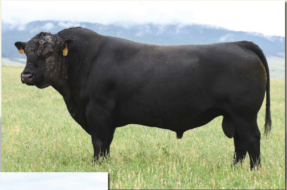
TFS DUE NORTH 2659Z Sire of Lots 1-6.