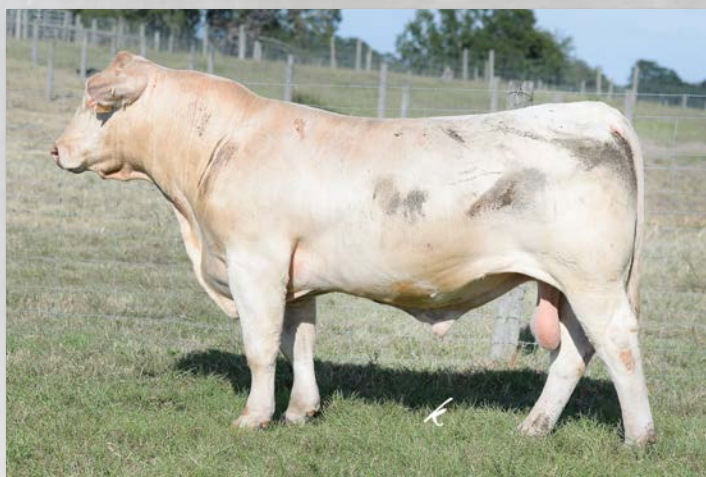
SOUTHERN PARADIGN SHIFT 51328 Sells as Lot 211.