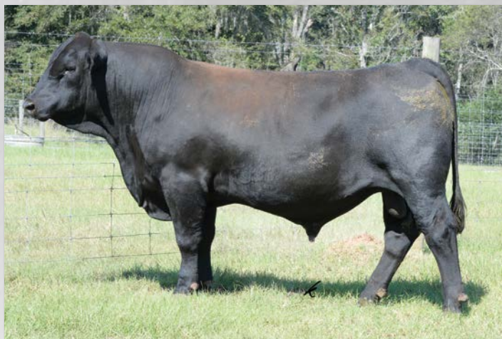
TJ 428C Sells as Lot 81.