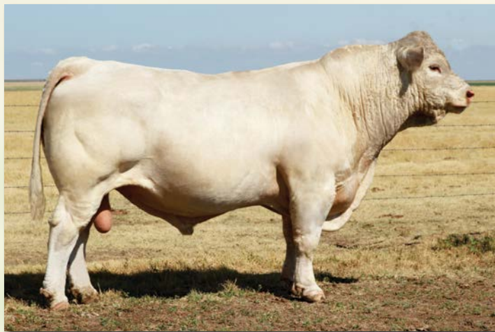
M6 FRESH AIR 8165 P ET Sire of Lot 216.