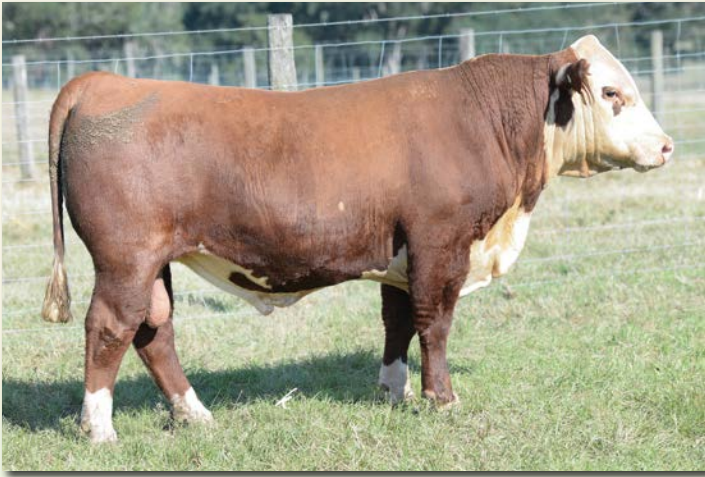
SOUTHERN VALOR 51398 ET Sells as Lot 242.