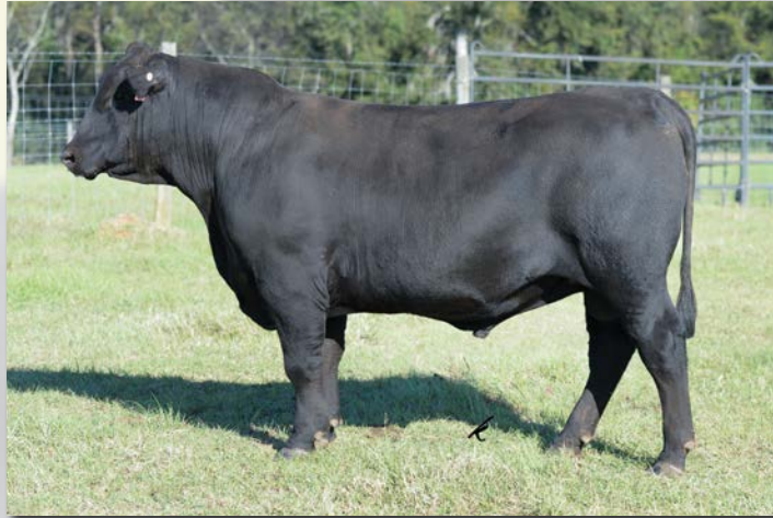
THOMAS WAYLON 55193 Sells as Lot 135.