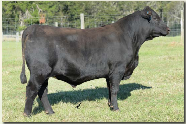
THOMAS WAYLON 55261 Sells as Lot 137.