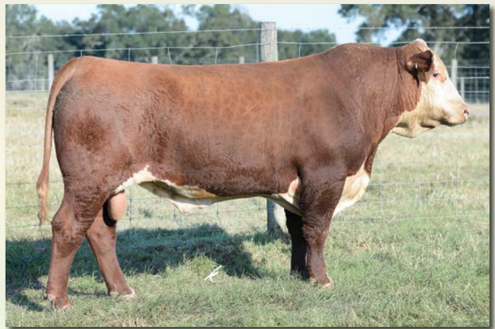
SOUTHERN PLAYMAKER 45525 ET Sells as Lot 228.