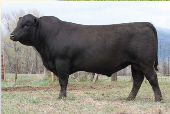
GW COUNTRY BOY 142B Maternal brother to Lot 1.