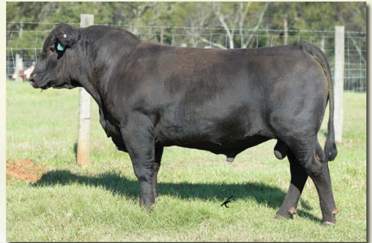
TJ 317C Sells as Lot 74.