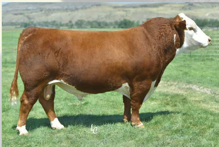
CHURCHILL RED BULL 200Z Sire of Lot 246.