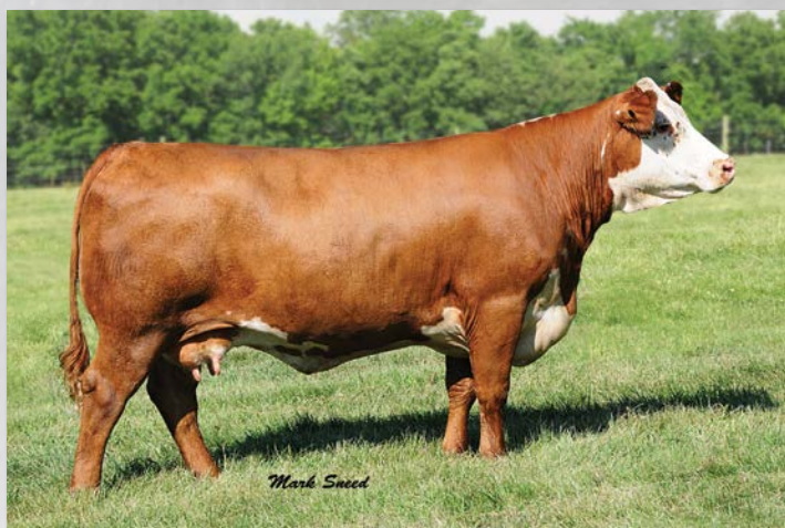
BOYD HOLLY 901 Dam of Lot 233.