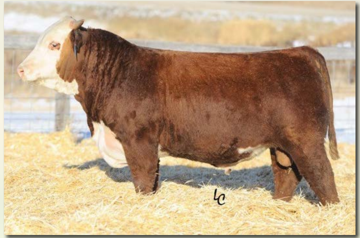
THT9011X AMERICAN HEREFORD 16A Sire of Lot 242.