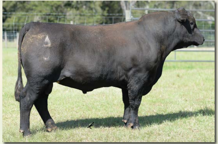
TJ 460C Sells as Lot 52.