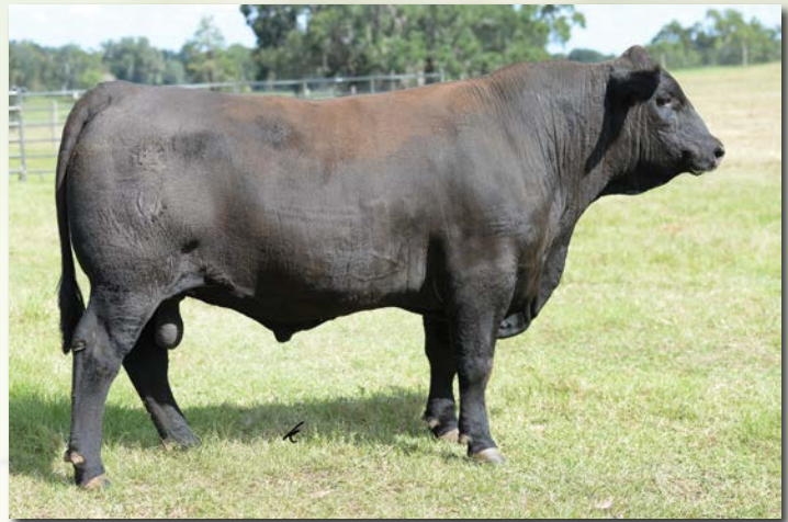
TJ 387C Sells as Lot 37.