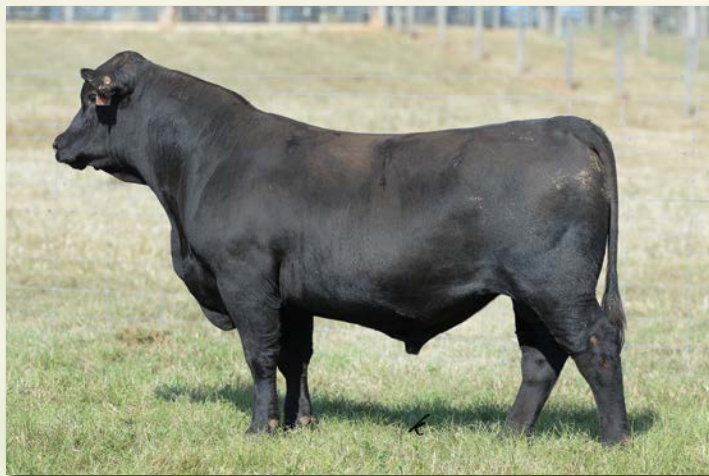
THOMAS WAYLON 55028 Sells as Lot 123.