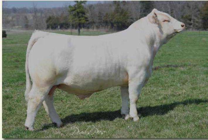
WC BENELLI 2134 P ET Sire of Lot 213.

AICA EM874474 51329 PB CHAROLAIS BD: 1/15/2015