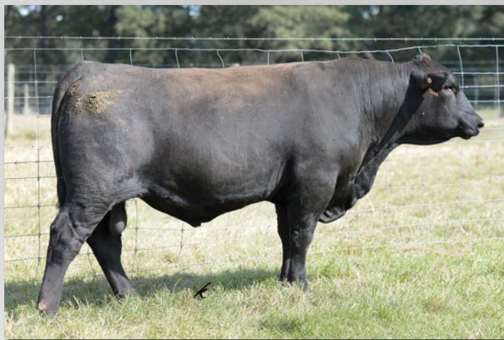
THOMAS WAYLON 55215 Sells as Lot 136.