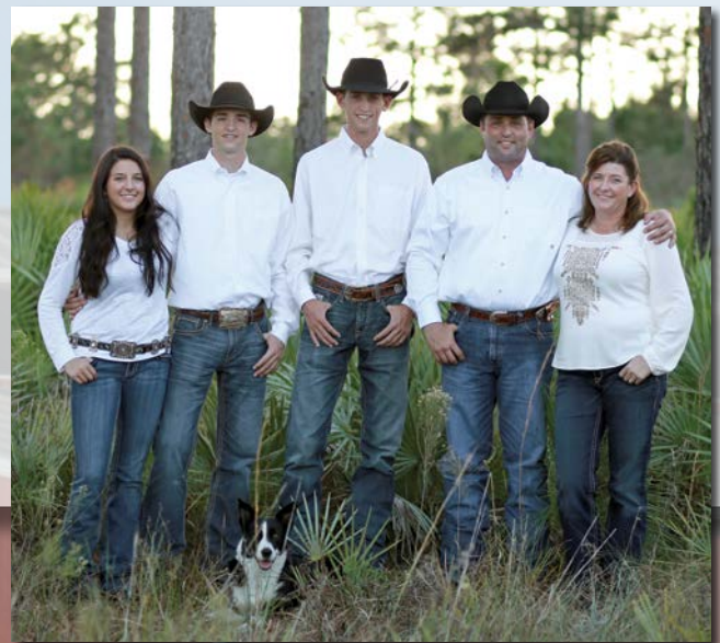
THE STEWART FAMILY