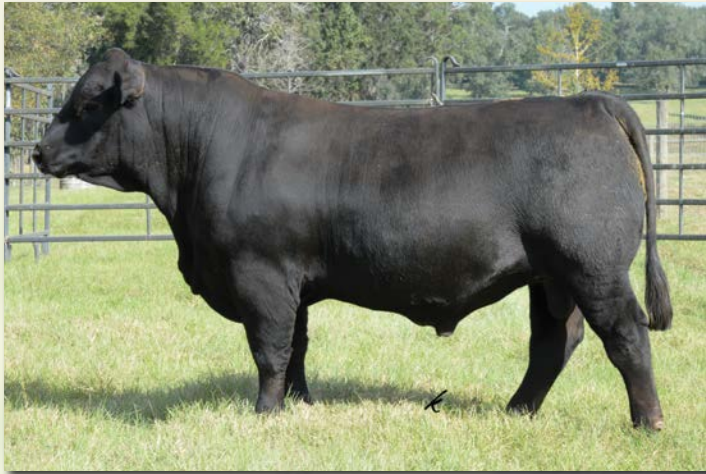
340C Sells as Lot 13.