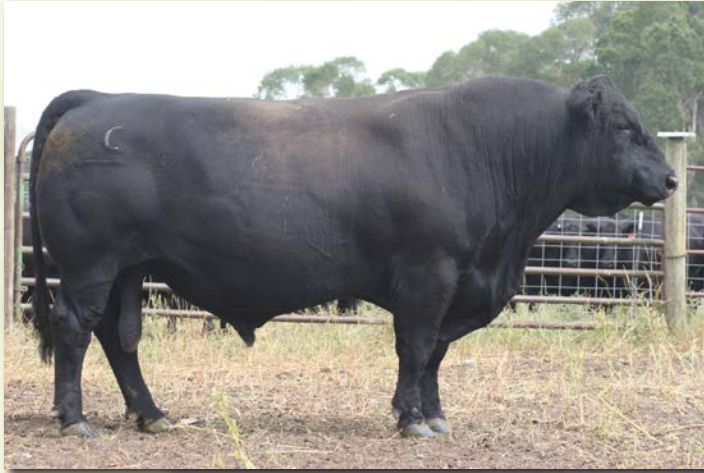
KOCH LC MONTE 803U Sire of Lot 113.