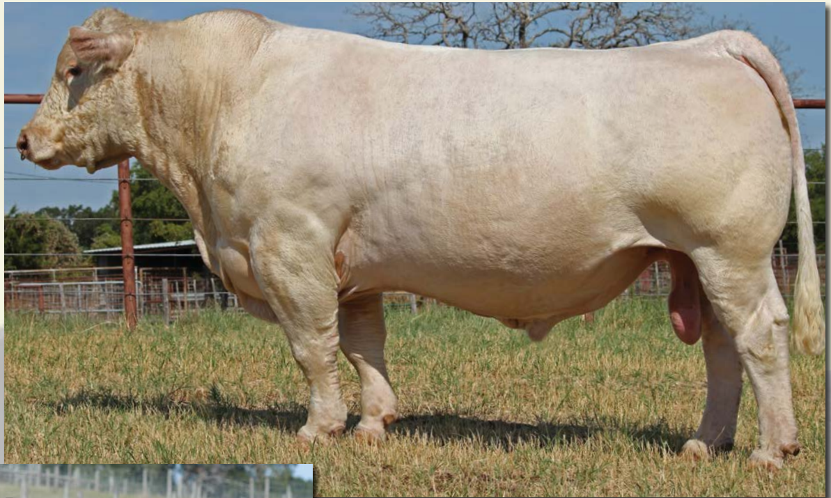
M6 COOL REP 8108 ET Sire of Lot 196.