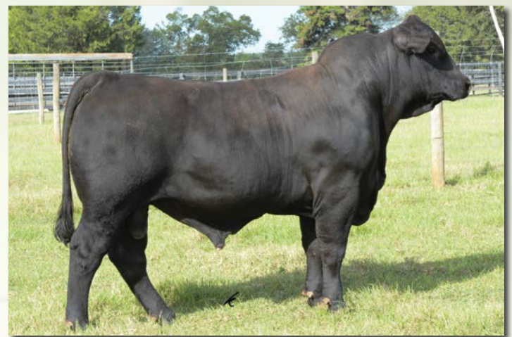
SASSERS 7L FORWARD 58C2 Sells as Lot 11.