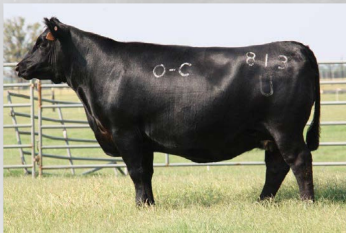
OCC REVOLUTION ROSE 813U Dam of Lot 192.