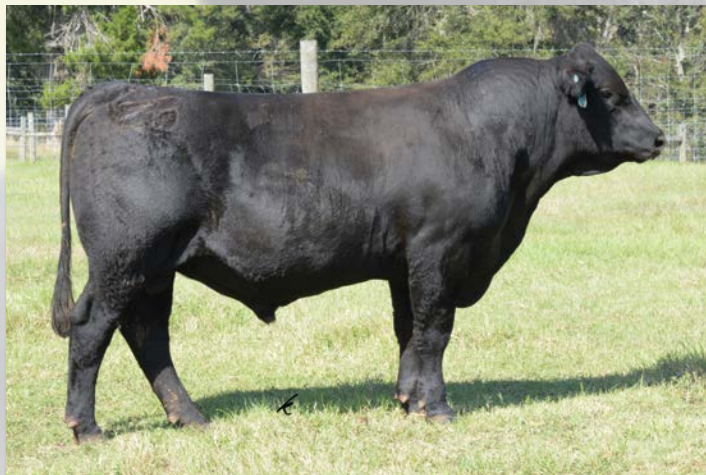
019C Sells as Lot 40.