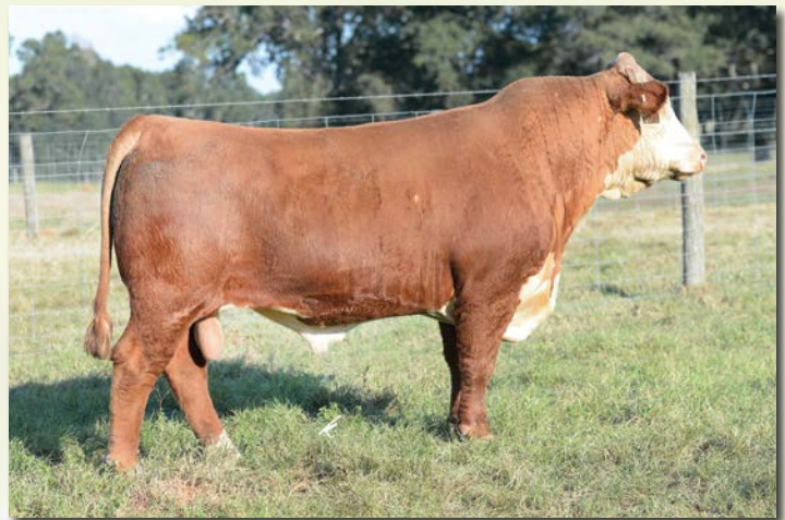
SOUTHERN BIG RED 45513 ET Sells as Lot 236.