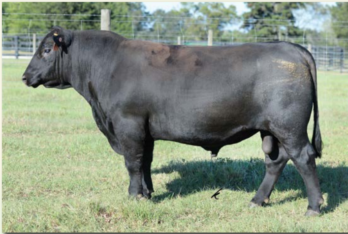
THOMAS AUTHENTIC 55005 Sells as Lot 169.