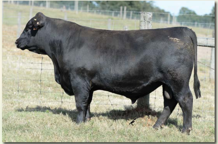
THOMAS WAYLON 55166 Sells as Lot 120.