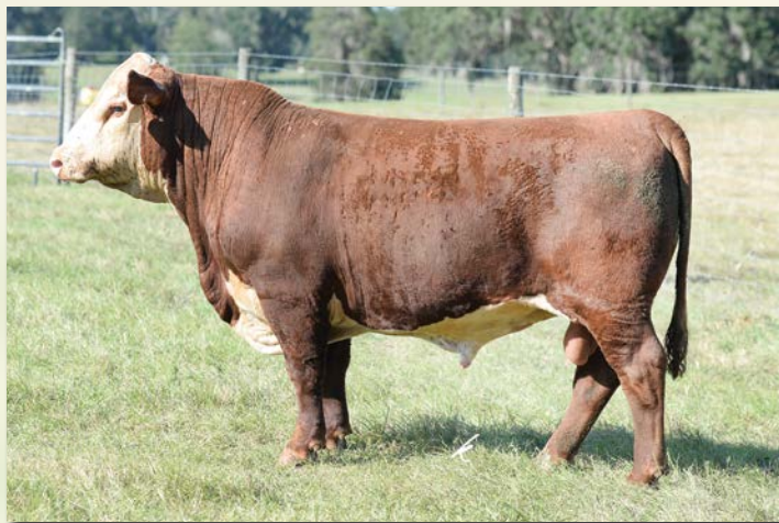
SOUTHERN STOCKMAN 501 ET Sells as Lot 230.