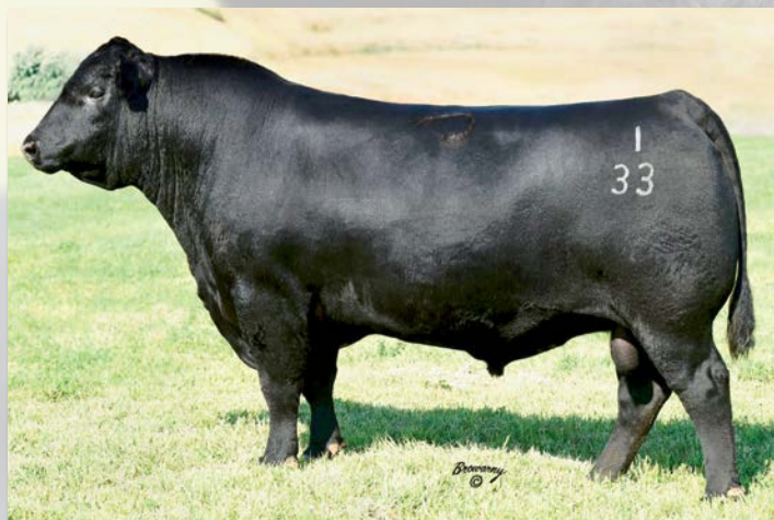
CONNEALY BLACK GRANITE Sire of Lots 155-168.