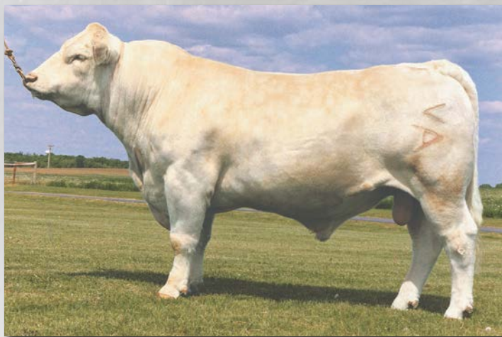
VCR SIR DUKE 914 PLD Sire of Lot 219.