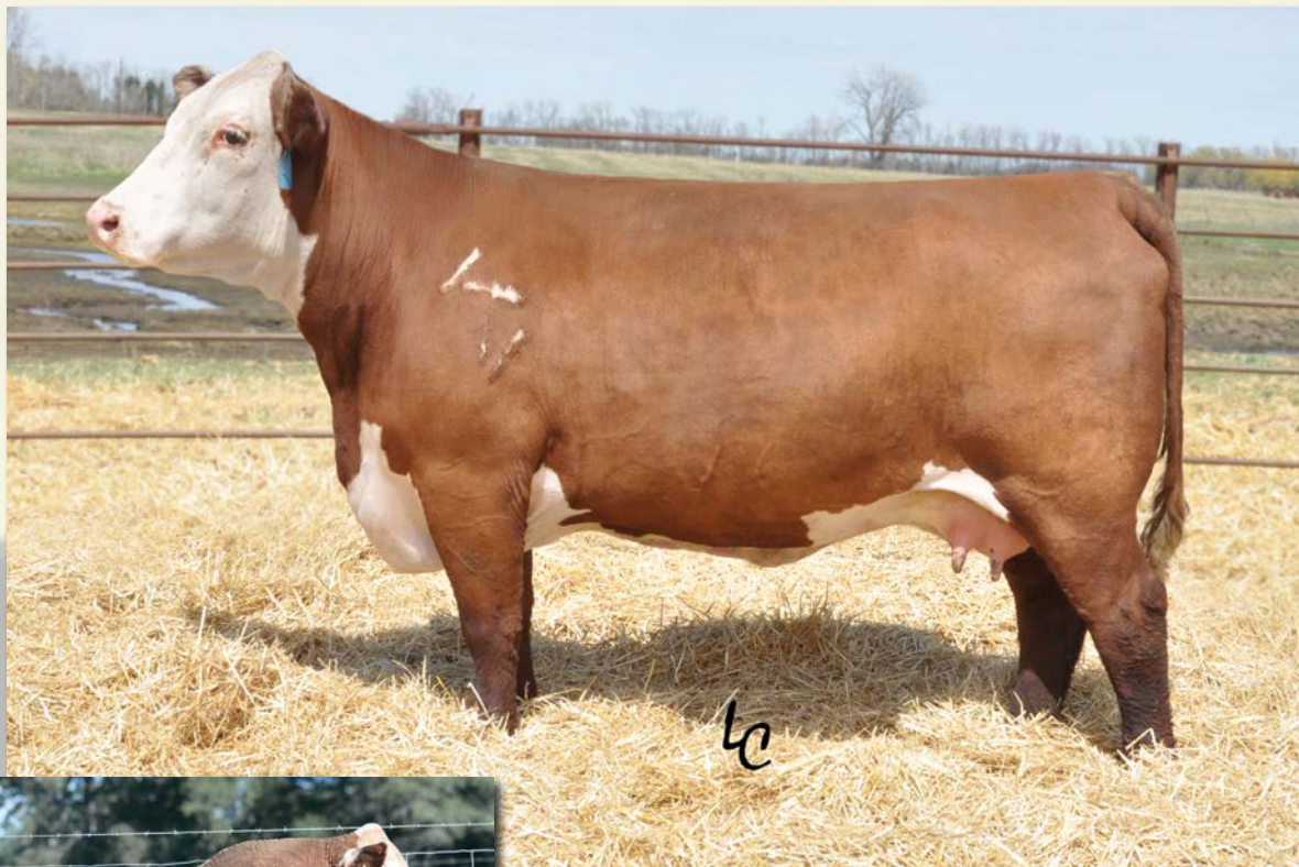
TH 7N 45P RITA 71U Dam of Lots 227-229, Grandam of Lots 230-232.