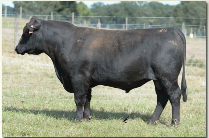
THOMAS WAYLON 55080 Sells as Lot 122.