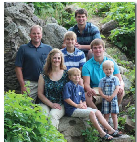
THE DARBY LINE FAMILY

Darby Line 308-627-5085 www.trianglejranch.com