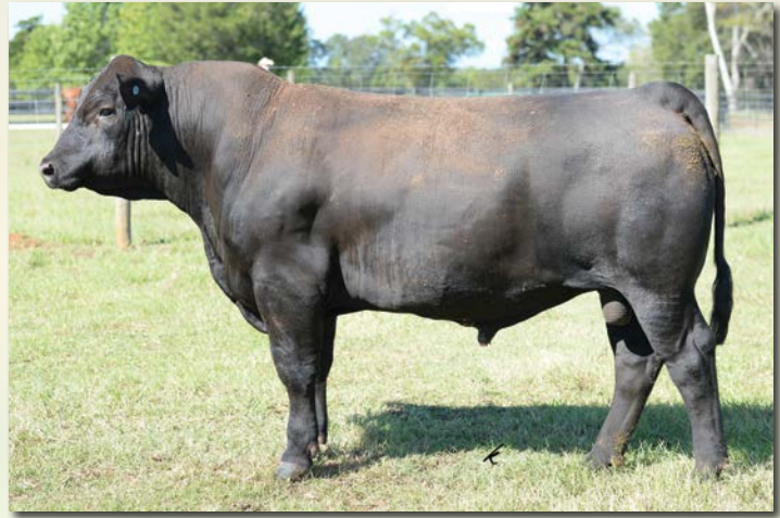
TJ 328C Sells as Lot 82.