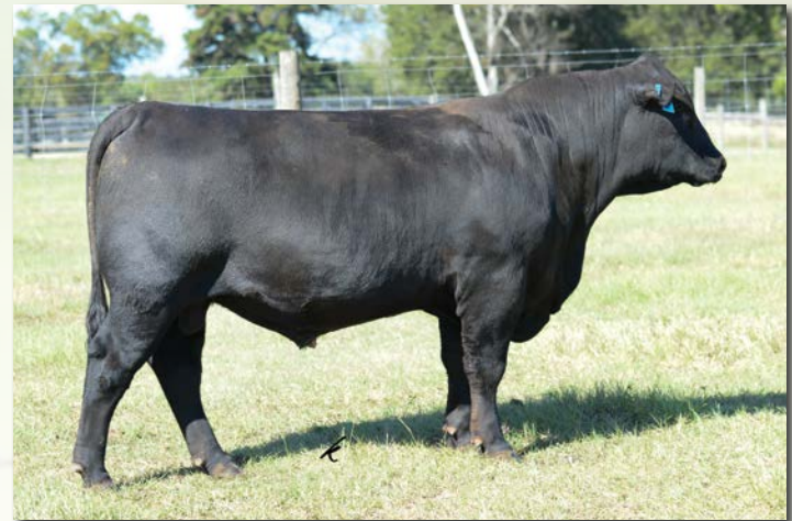
THOMAS WAYLON 55165 Sells as Lot 132.