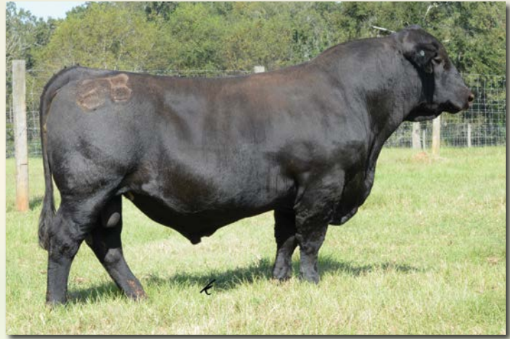
070C Sells as Lot 9.