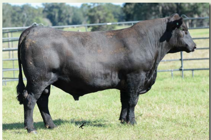
392C Sells as Lot 30.