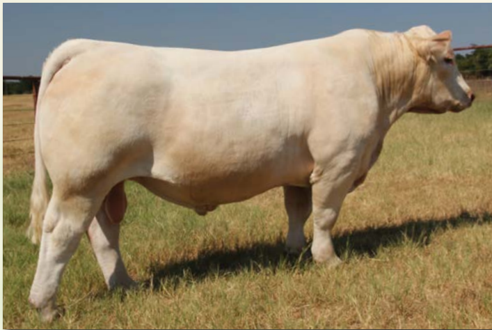
M6 BELLS & WHISTLE 258P Full brother to Lot 225.