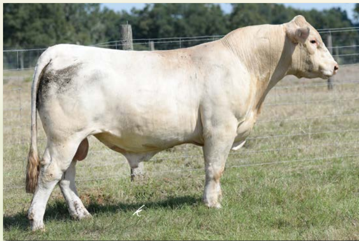
SOUTHERN ROYCE 46105 Sells as Lot 202.